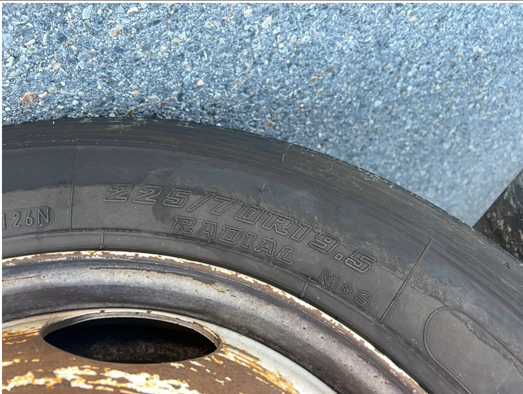
Right Steer Tire Size / 08-11-2023