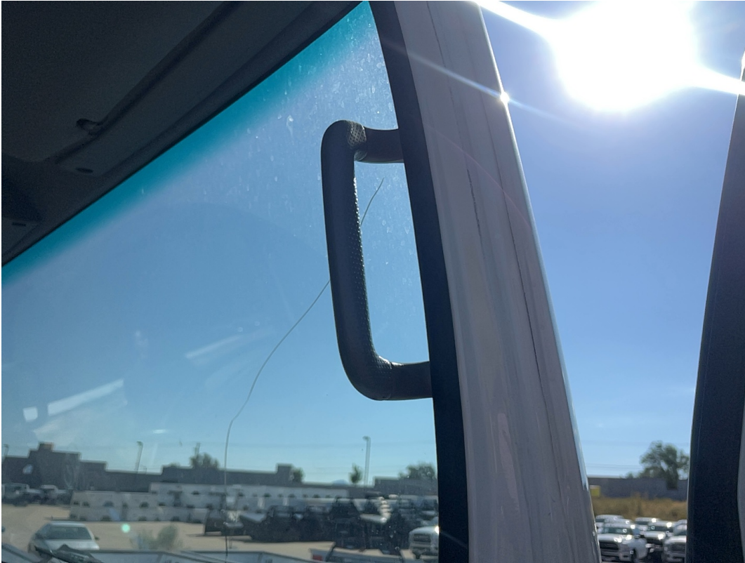
Handrails / 08-10-2023