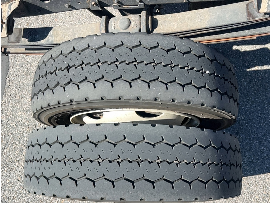
Left Inner Drive Tire Condition / Left Outer Drive Tire Condition / 08-11-2023