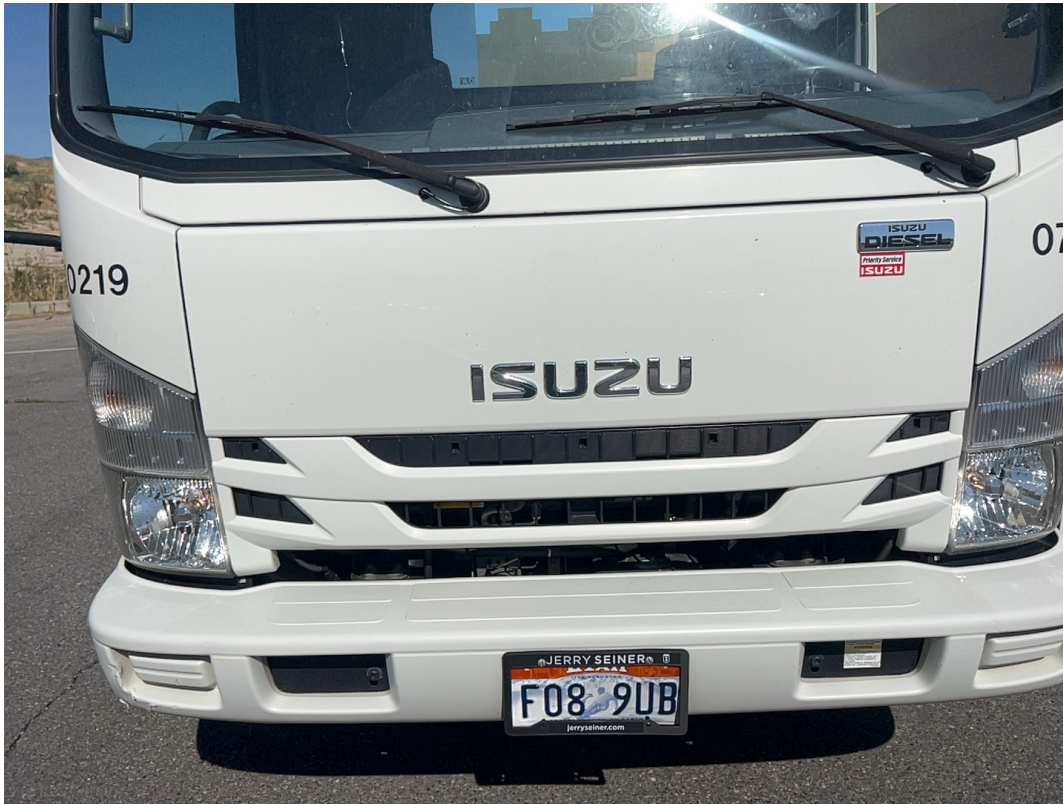
Front Lights / 08-10-2023