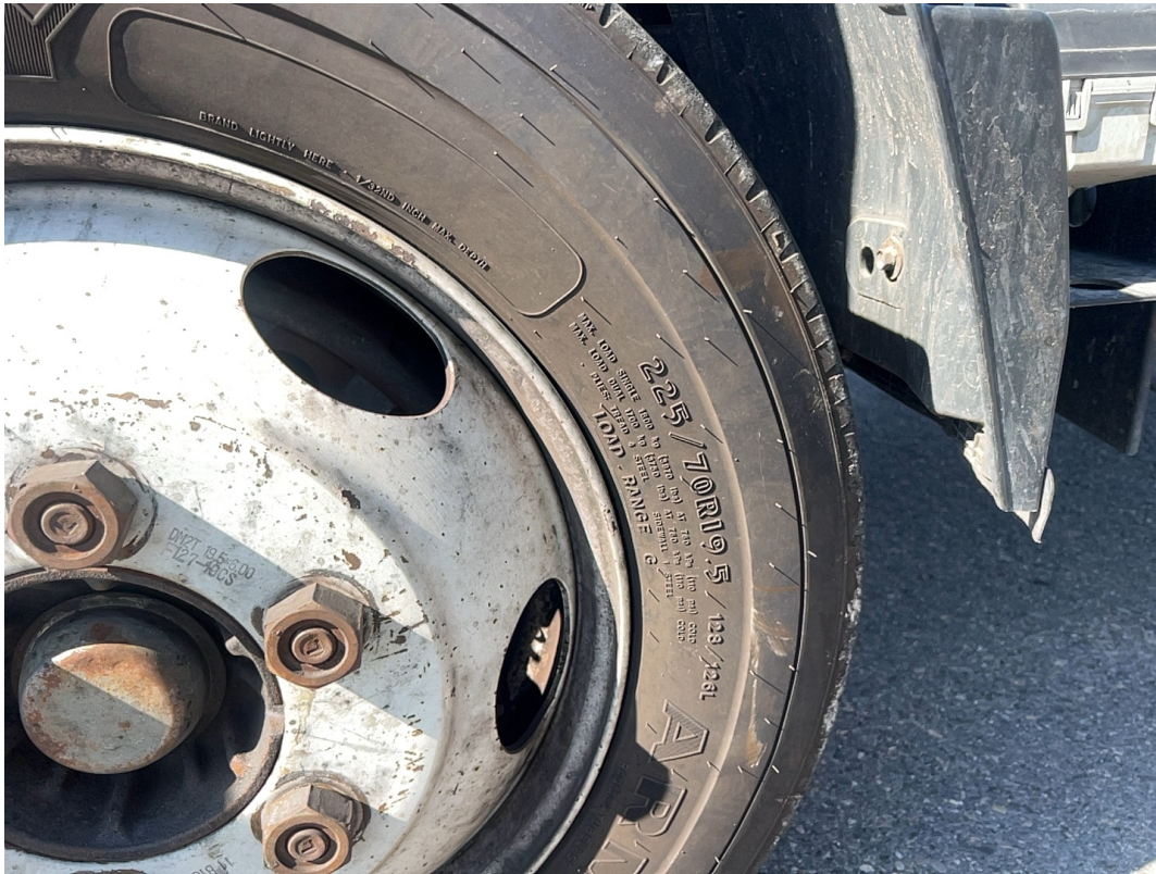
Left Steer Tire Size / 08-10-2023