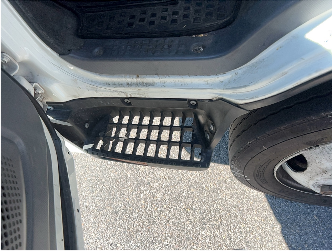
Steps / 08-10-2023