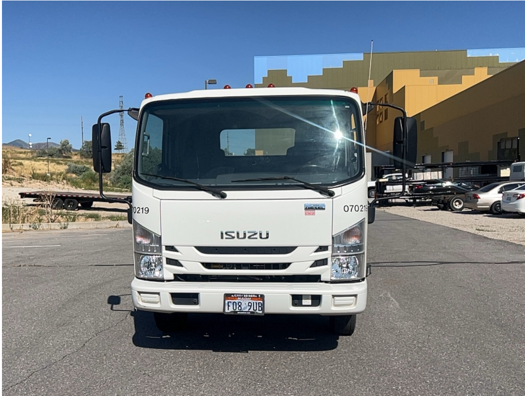
Front / 08-11-2023