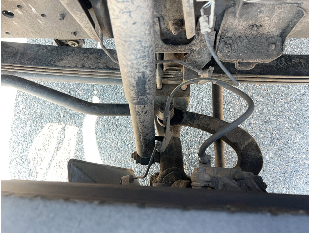
Suspension / Axles / 08-10-2023