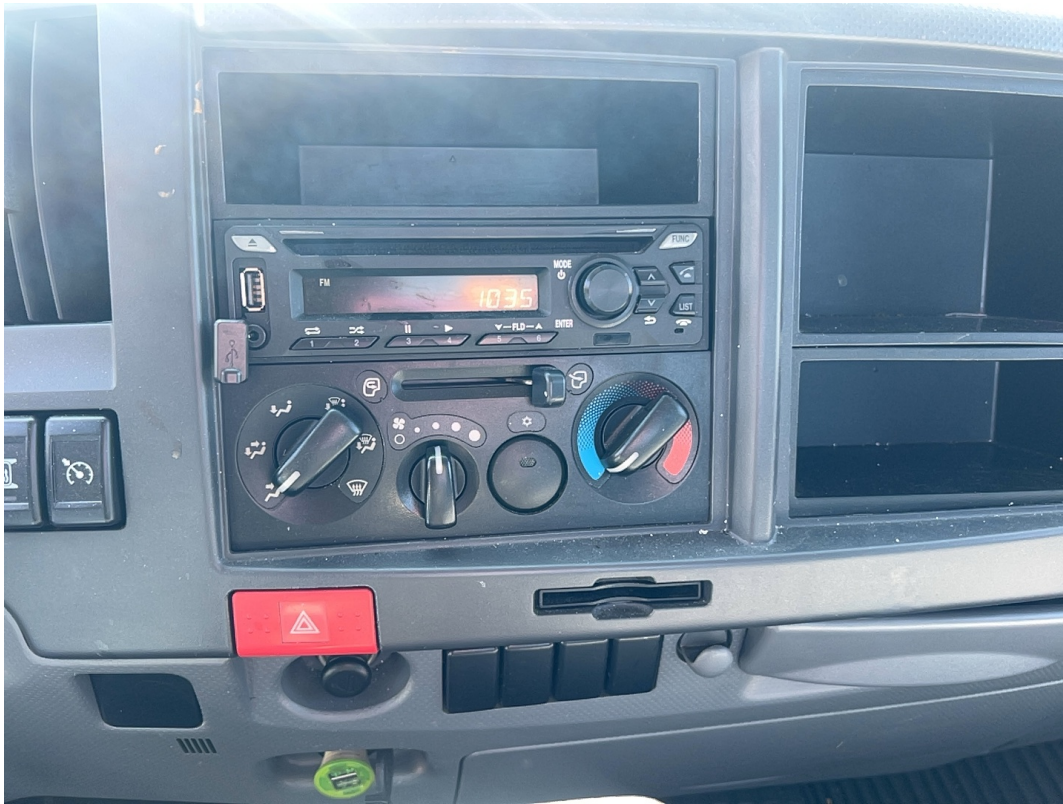
Radio / A/C / Switches and Controls / 08-10-2023