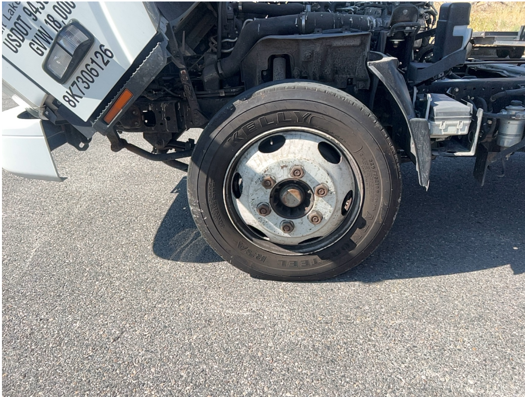
Left Steer Tire Condition / 08-10-2023