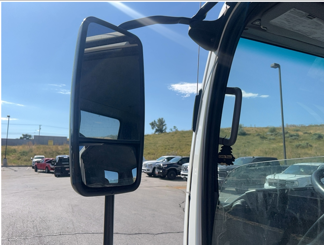
Mirrors / 08-10-2023