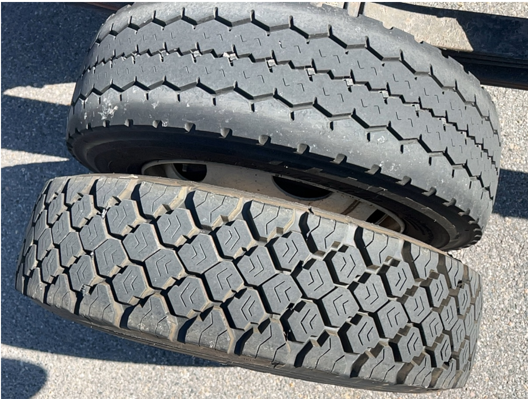
Right Inner Drive Tire Condition / Right Outer Drive Tire Condition / 08-11-2023