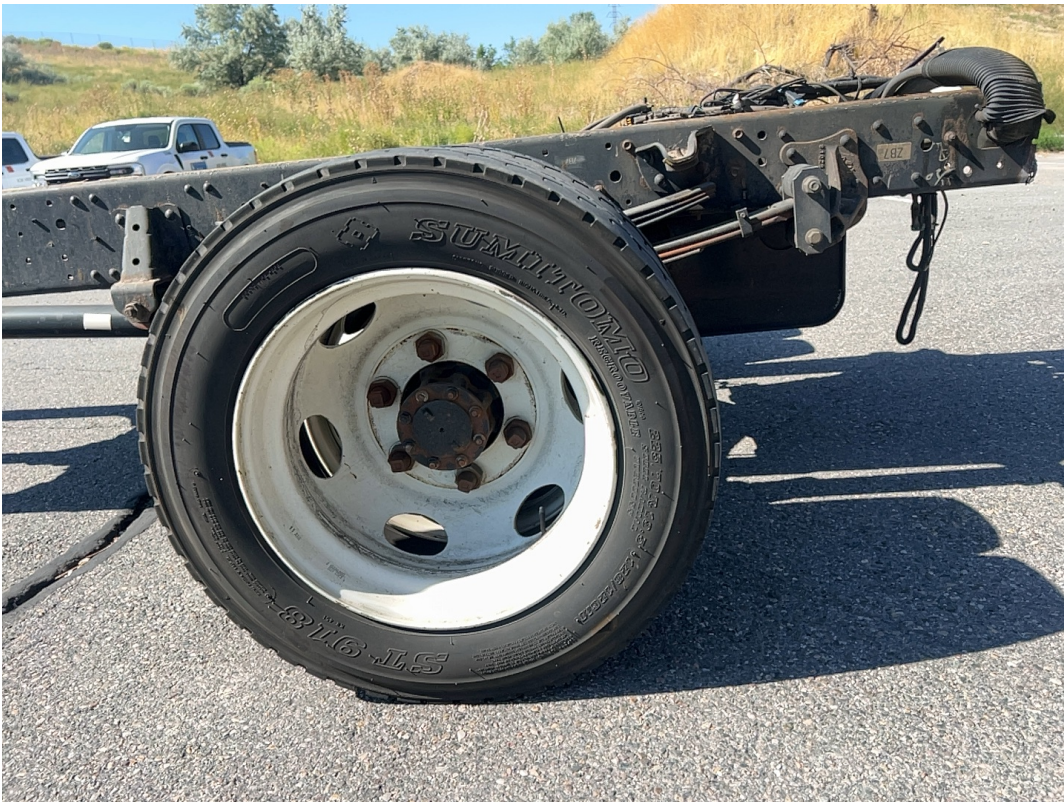
Left Outer Drive Tire Condition / 08-10-2023