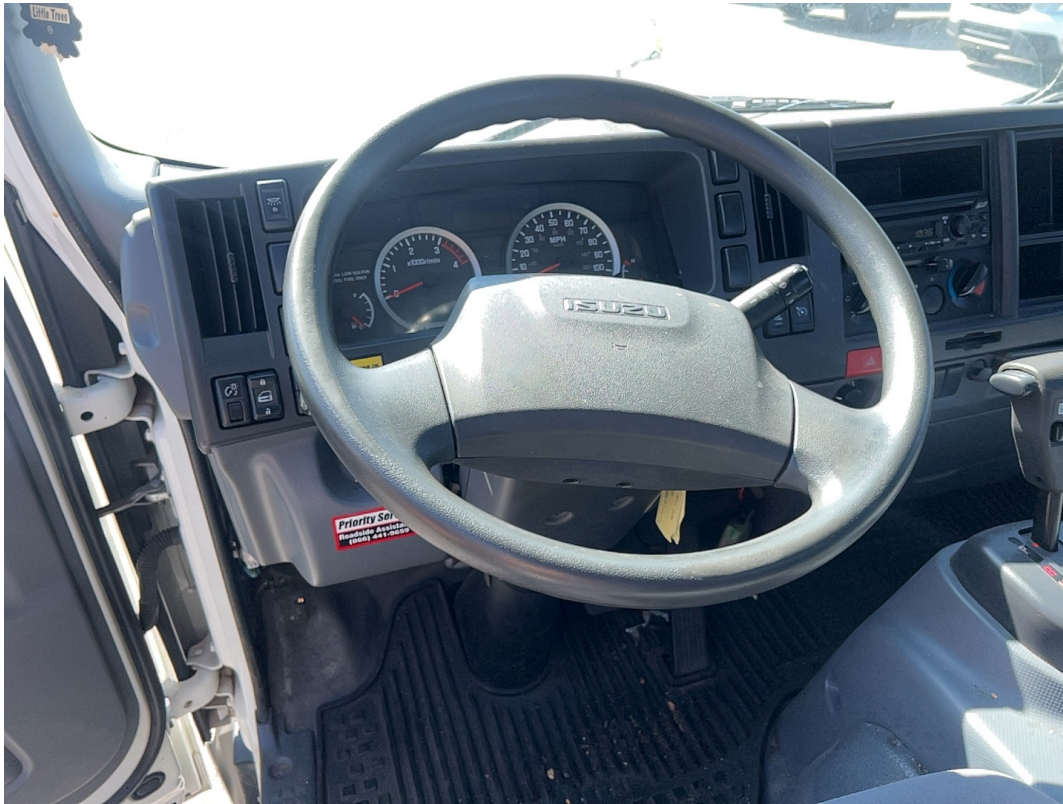
Steering Wheel / 08-10-2023