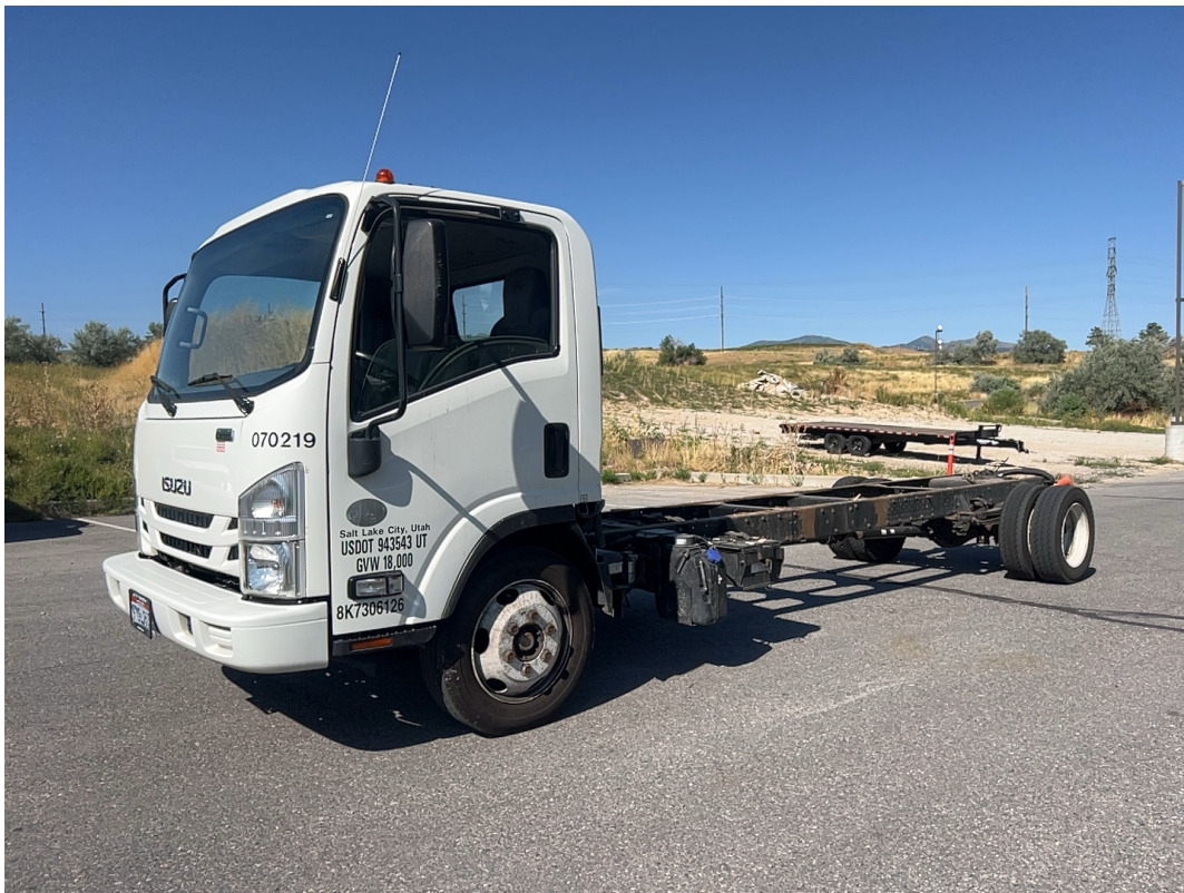
Front Left / 08-10-2023