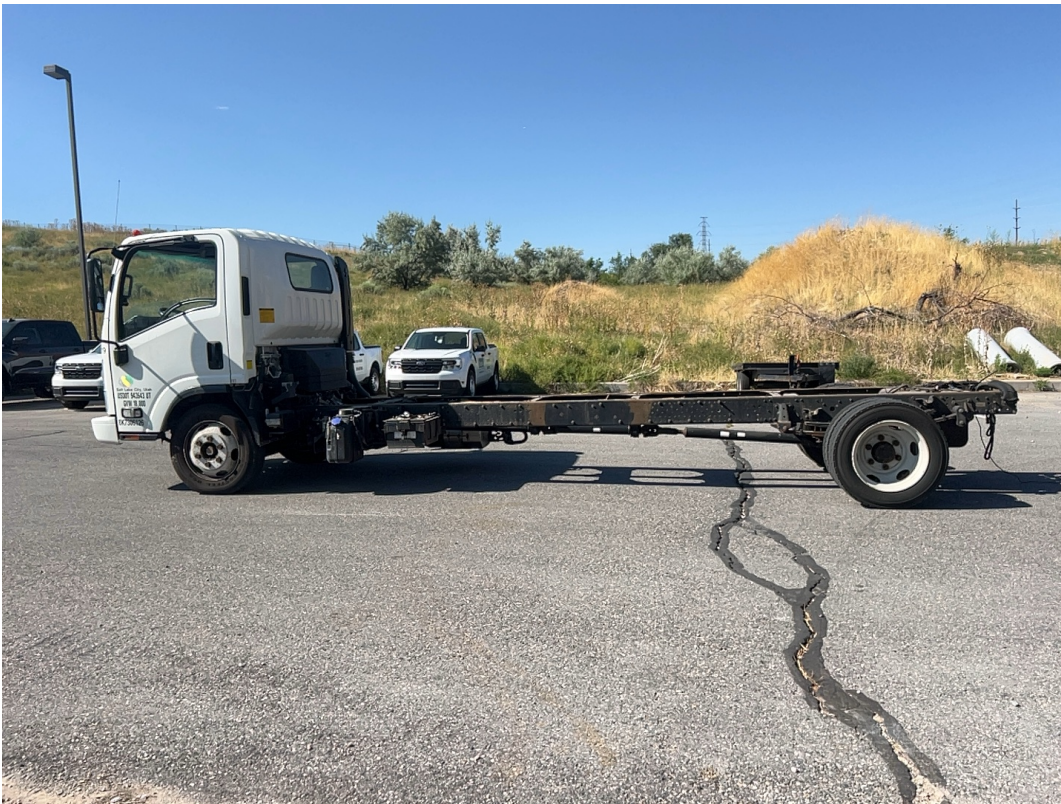
Left / 08-10-2023