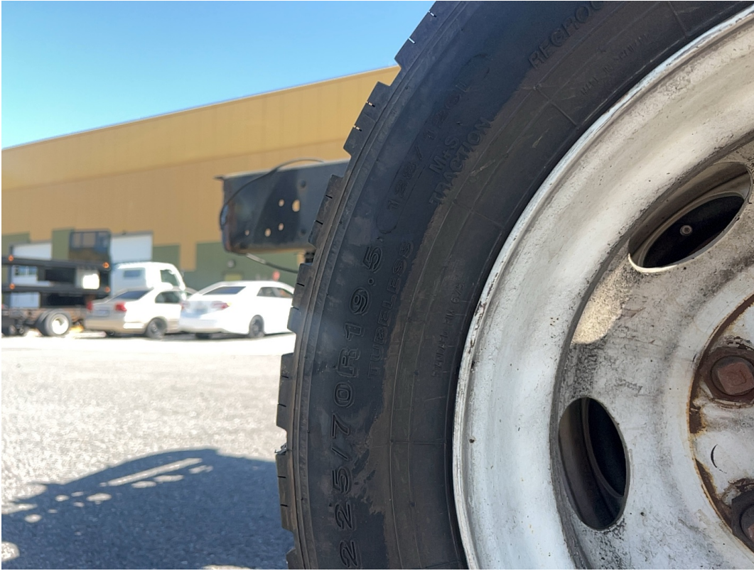
Right Outer Drive Tire Size / 08-10-2023