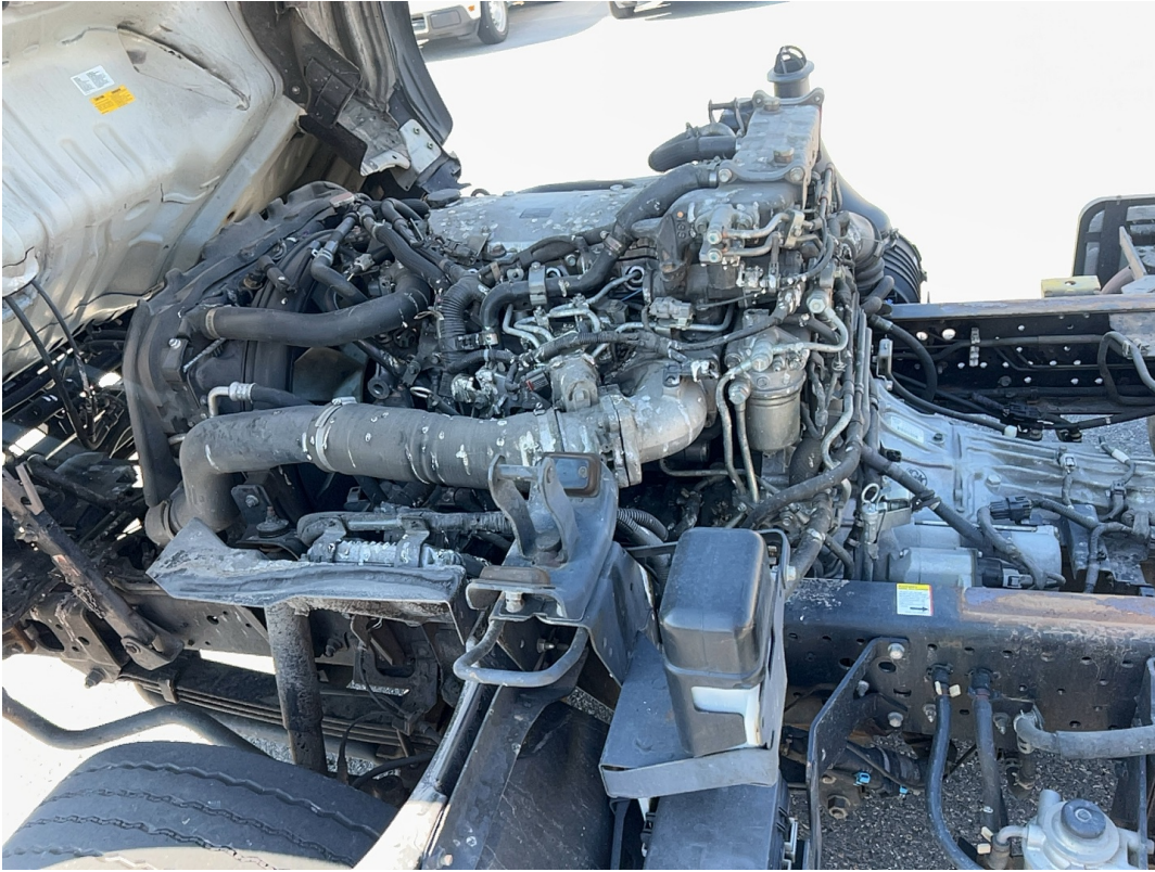
Engine Compartment / 08-10-2023