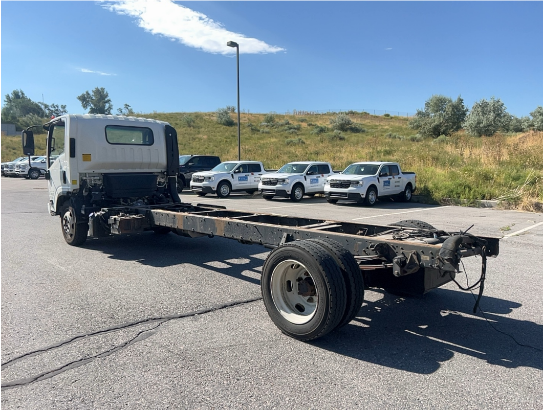
Rear Left / 08-10-2023