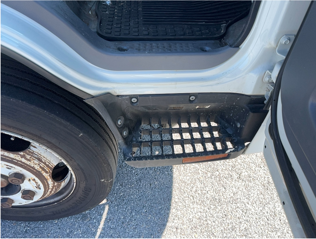
Steps / 08-10-2023