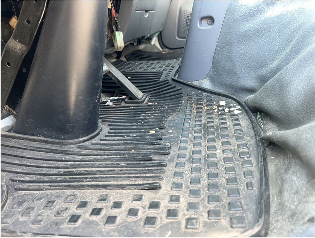
Floorboard / 08-10-2023