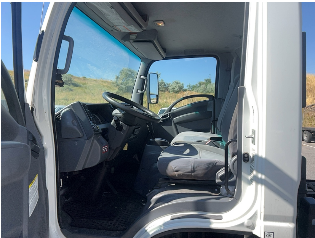
Cab Interior / 08-10-2023