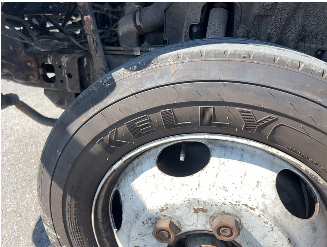
Left Steer Tire Brand / 08-10-2023