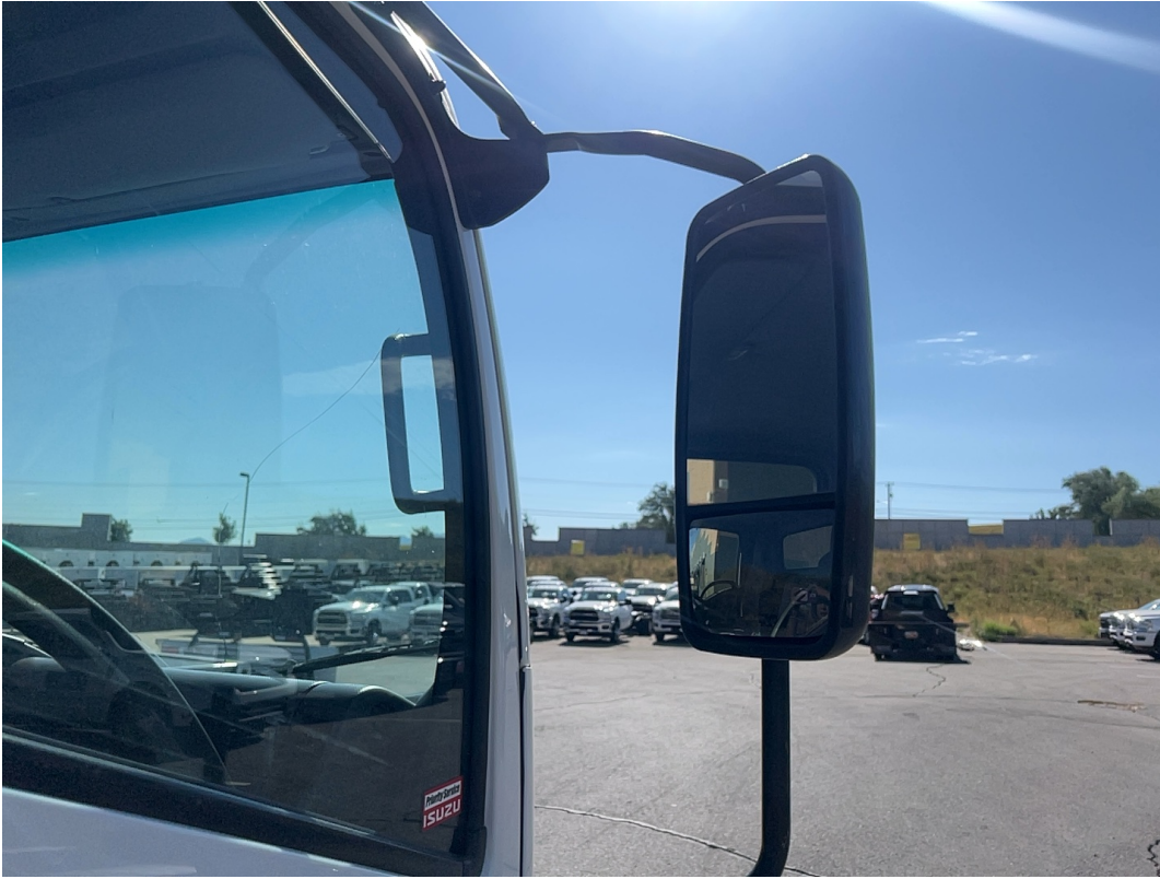
Mirrors / 08-10-2023