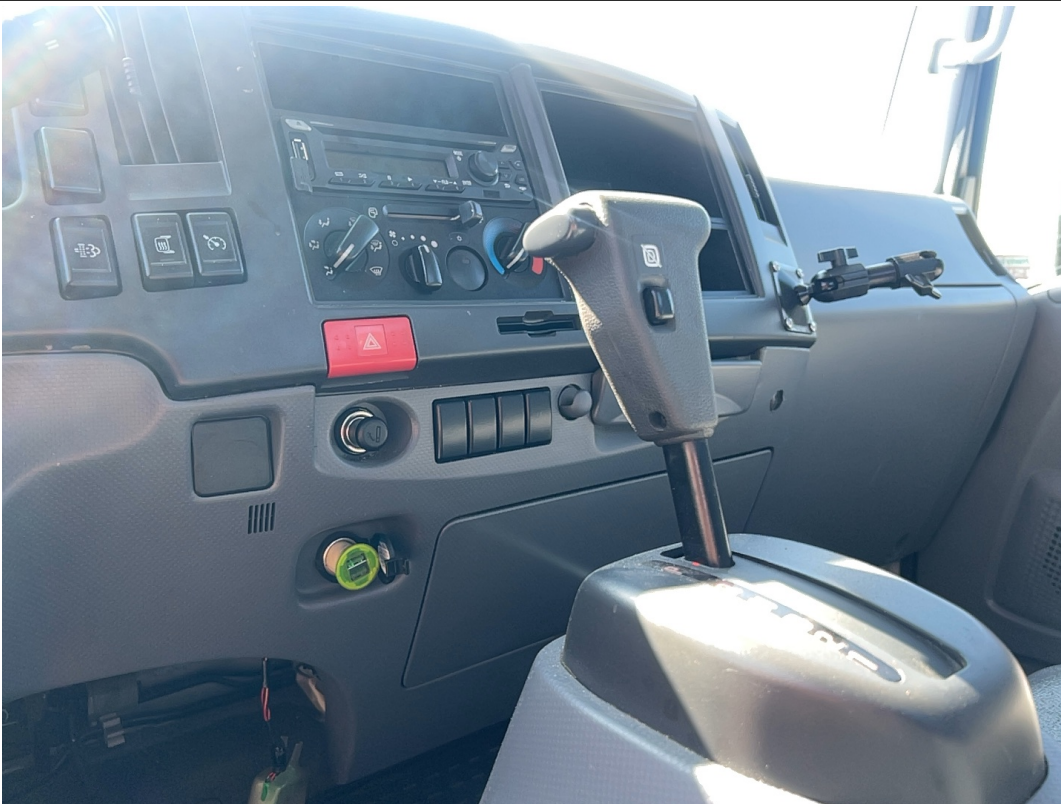
Transmission / 08-10-2023