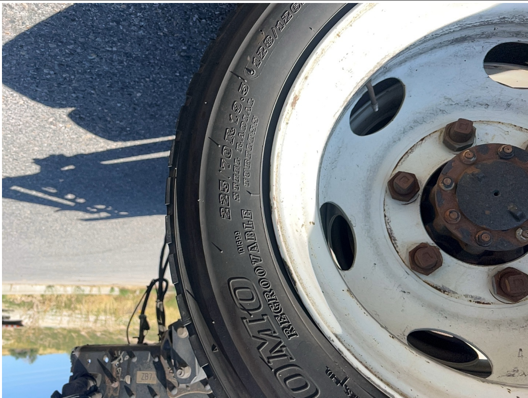
Left Outer Drive Tire Size / 08-11-2023