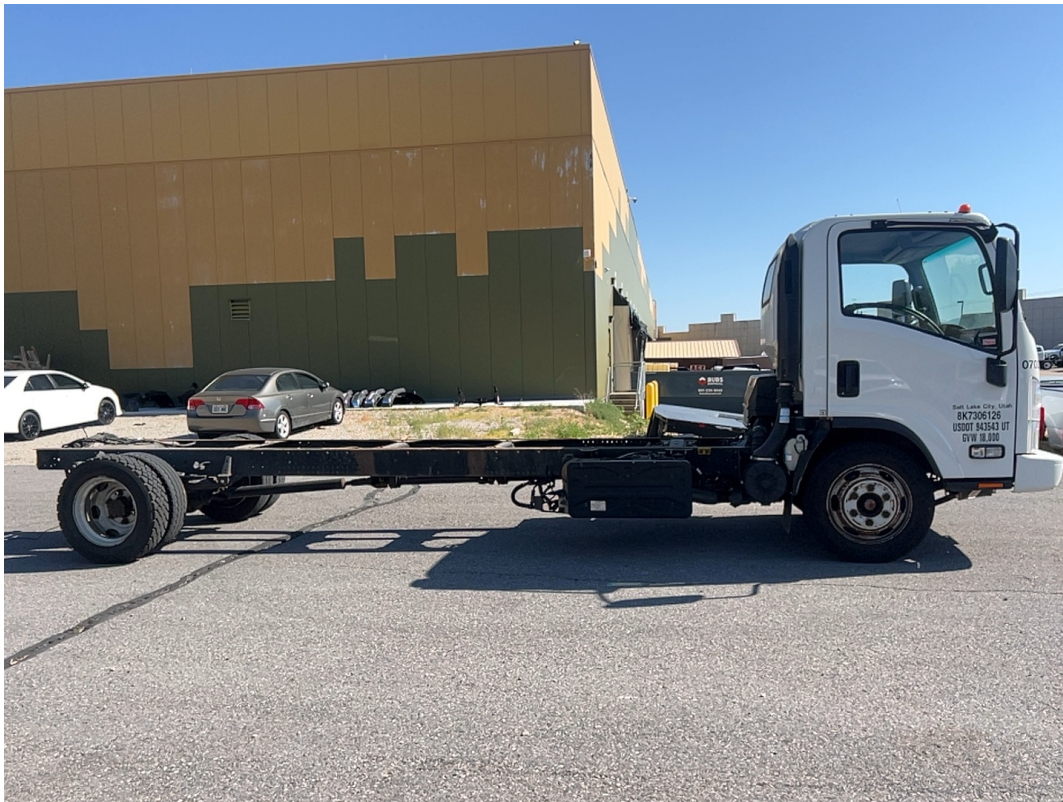
Right / 08-11-2023