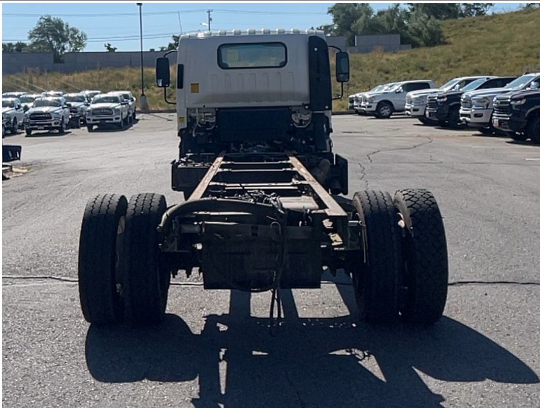
Rear / 08-11-2023