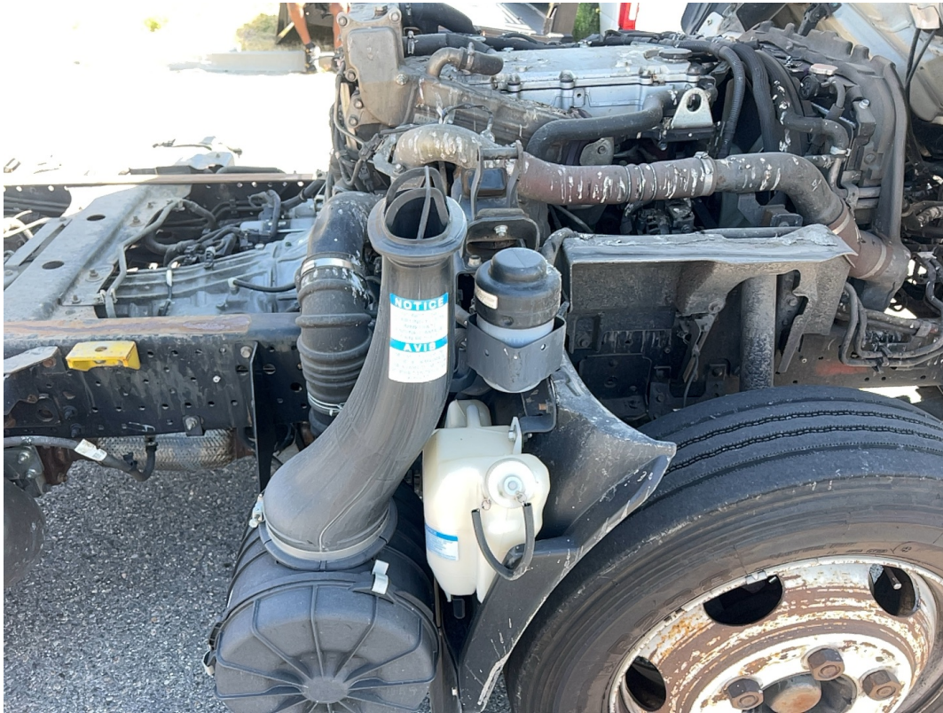
Engine Compartment / 08-10-2023