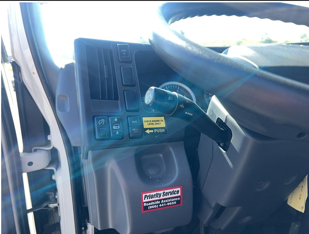
Switches and Controls / 08-10-2023