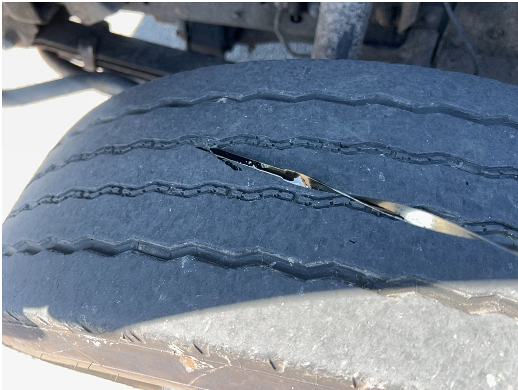
Oil Dipstick / 08-10-2023