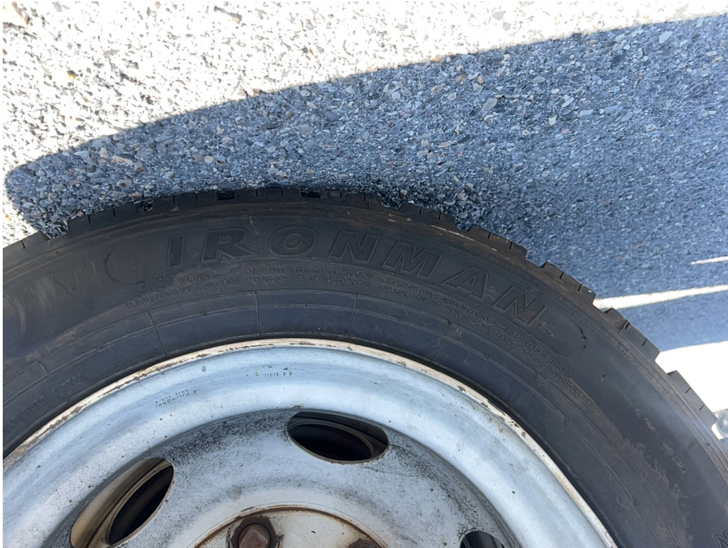
Right Outer Drive Tire Condition / 08-11-2023