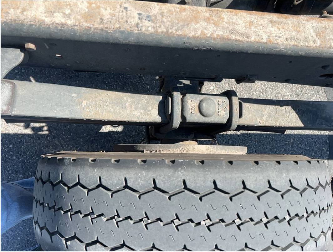
Suspension / Axles / 08-10-2023