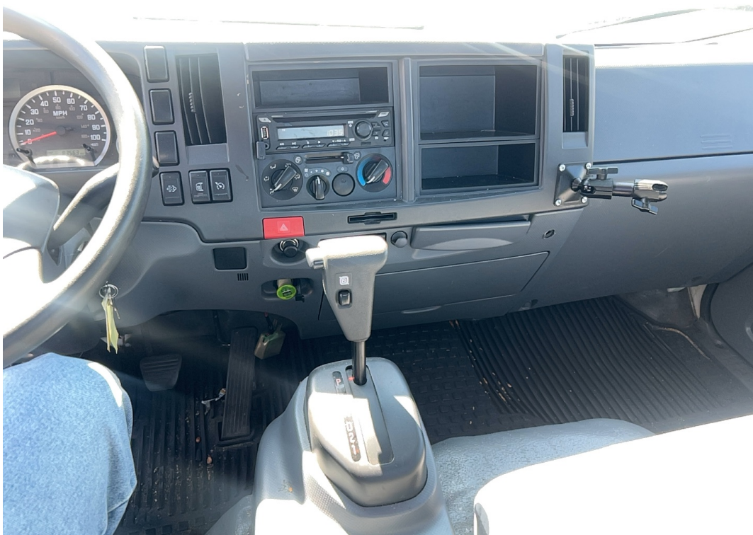
Switches and Controls / 08-10-2023