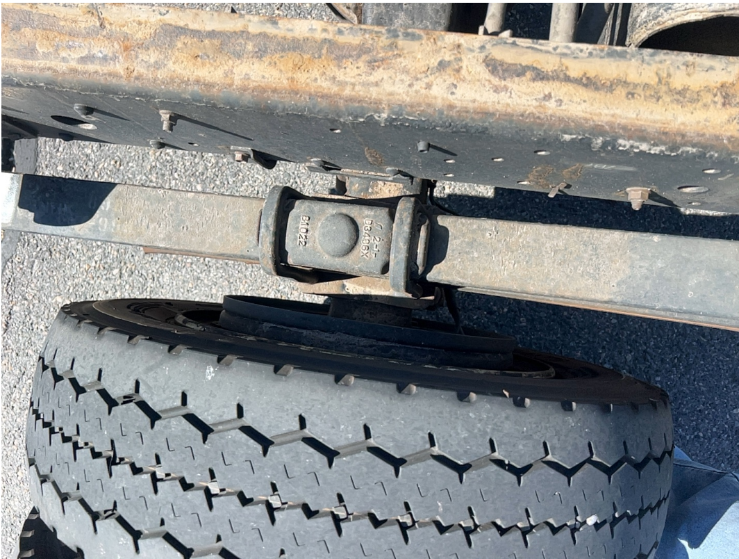
Suspension / Axles / 08-10-2023