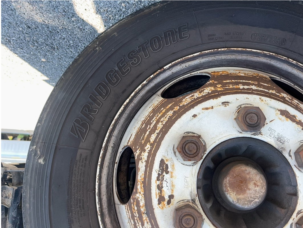
Right Steer Tire Brand / 08-11-2023