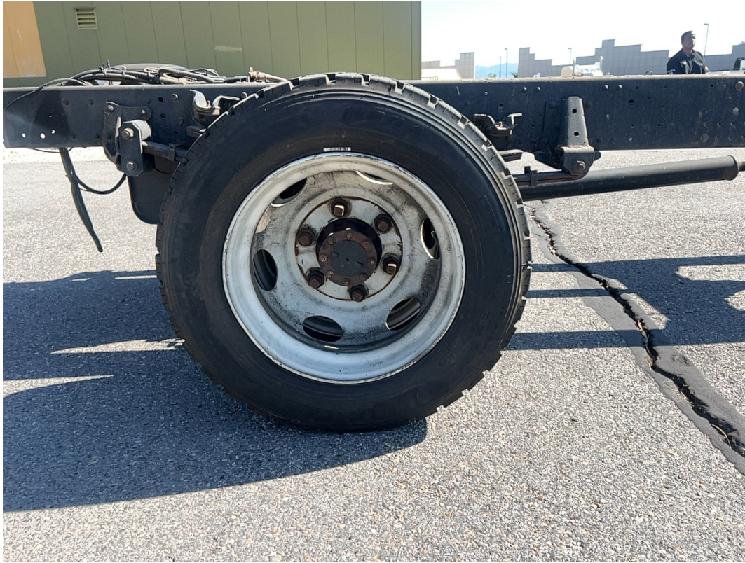
Right Outer Drive Tire Condition / 08-10-2023