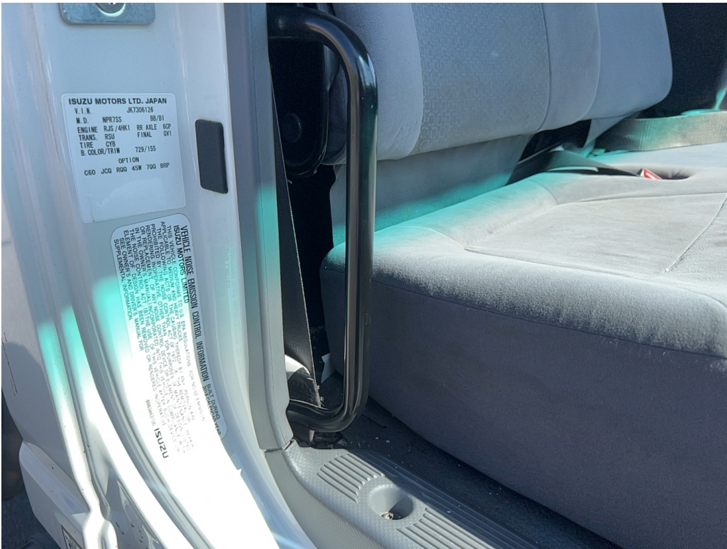
Handrails / 08-10-2023