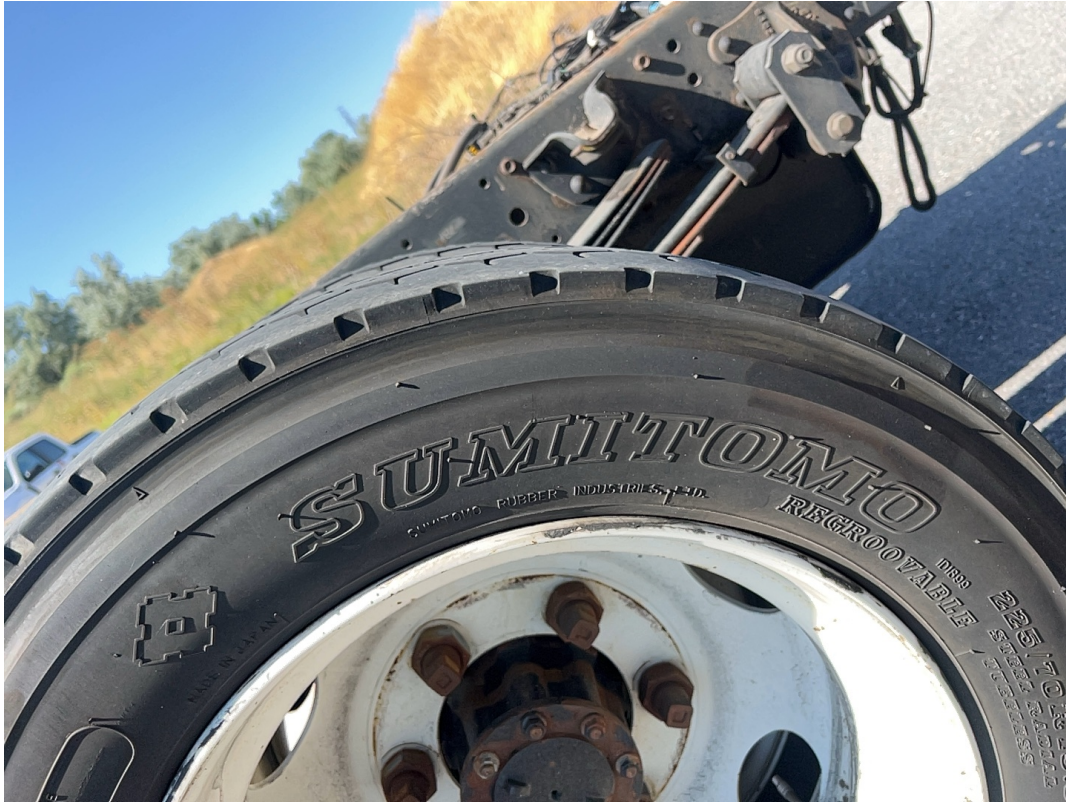
Left Outer Drive Tire Brand / 08-10-2023