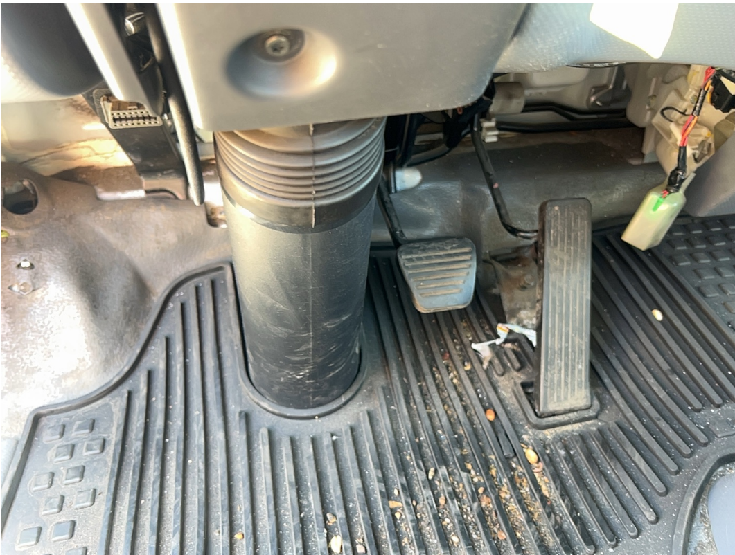
Pedals / 08-10-2023