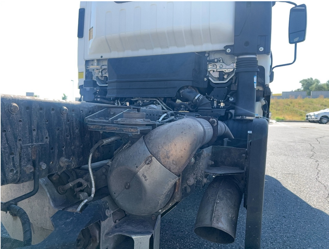
Exhaust Pipe / 08-10-2023