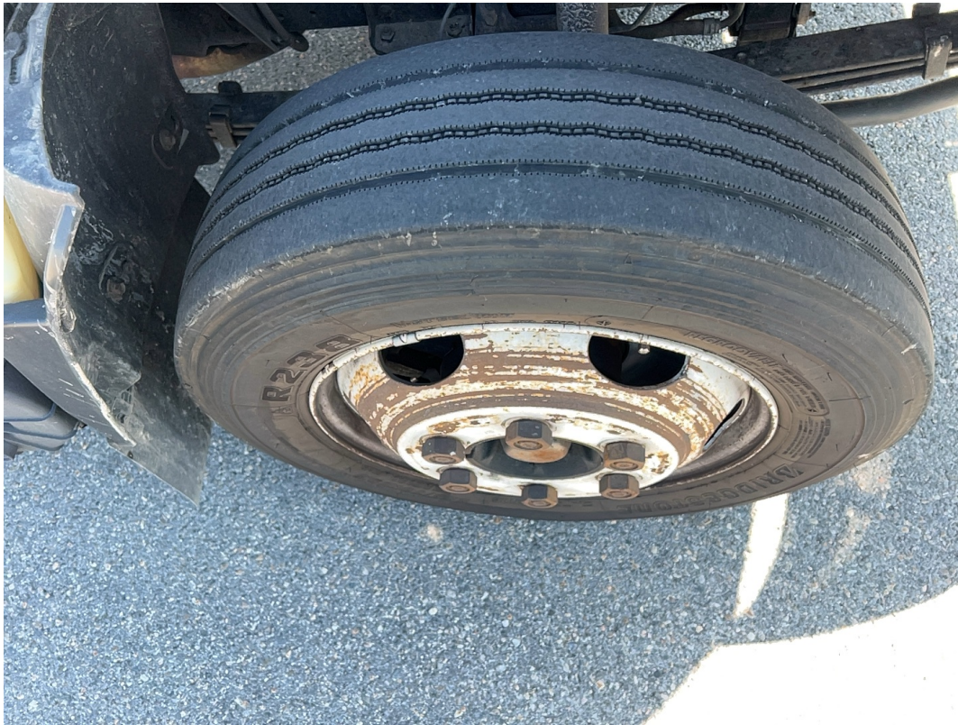
Right Steer Tire Condition / 08-10-2023