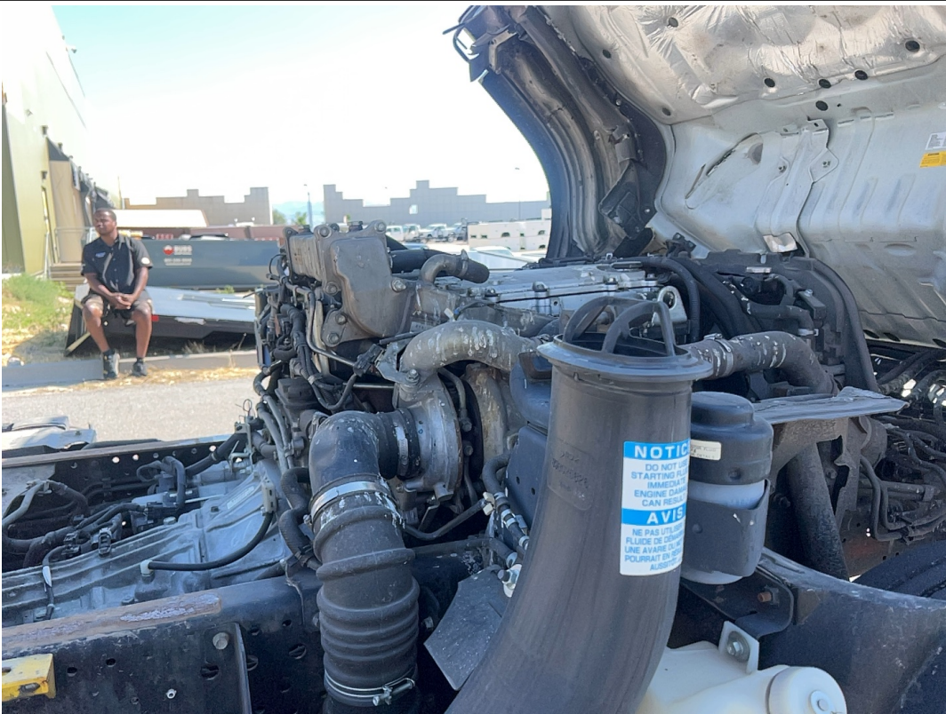
Engine Compartment / 08-10-2023