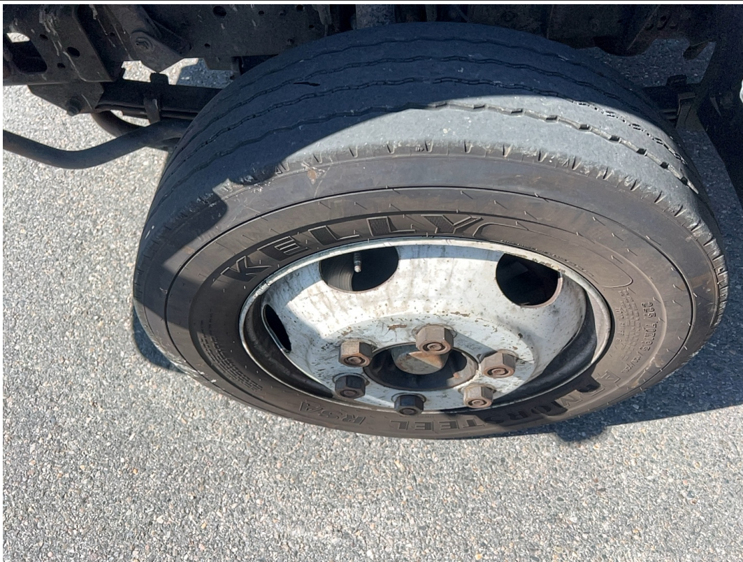
Left Steer Tire Condition / 08-10-2023