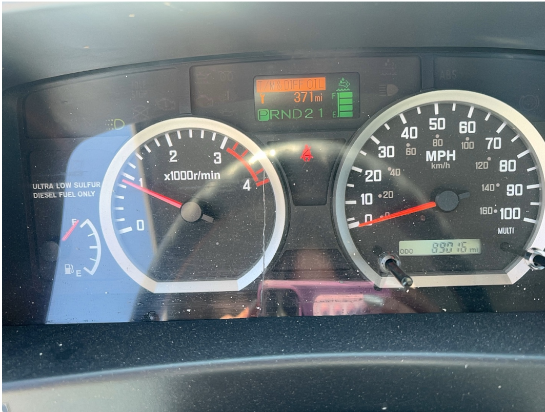
EMS Warning Lights / 08-10-2023