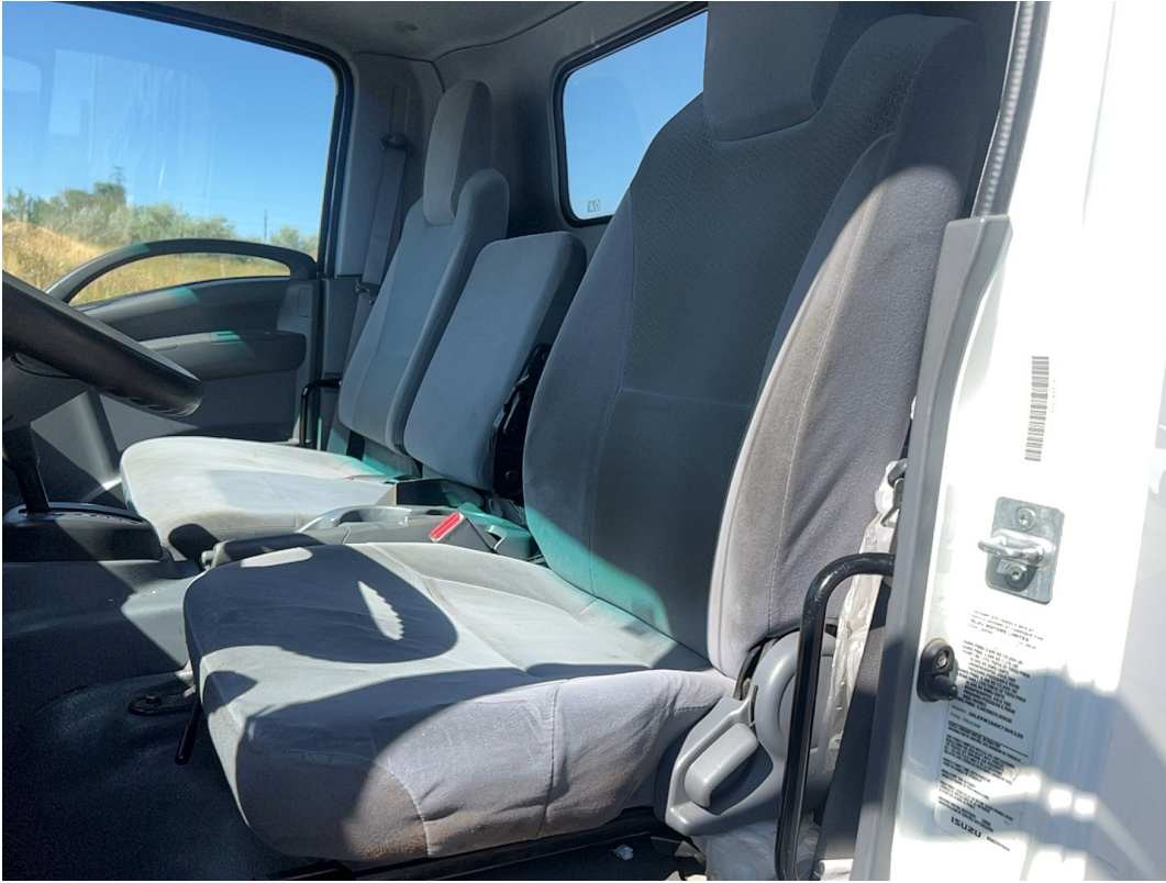
Driver's Seat / 08-10-2023