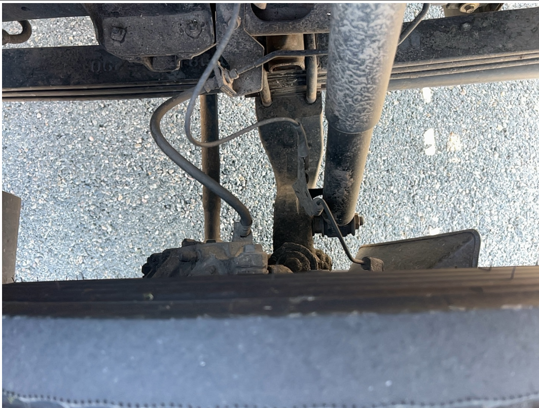
Suspension / Axles / 08-10-2023