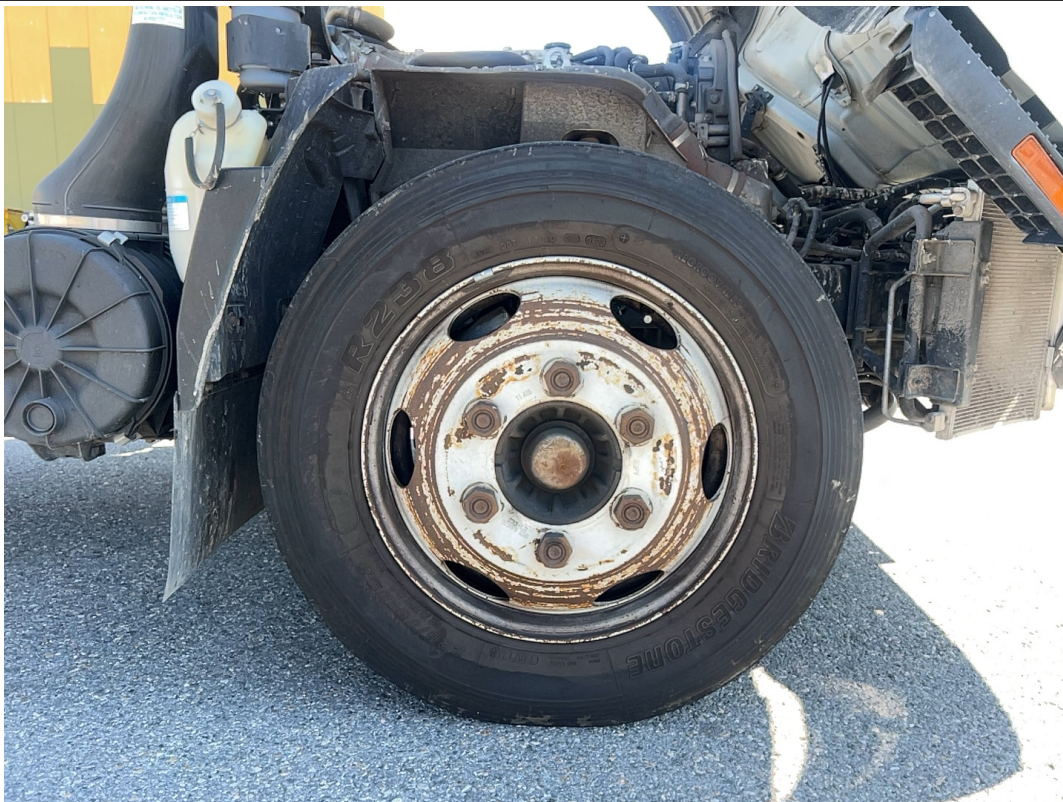
Right Steer Tire Condition / 08-10-2023