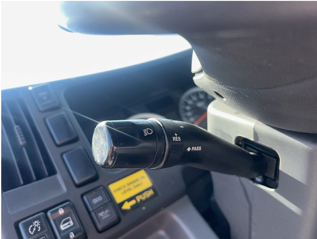
Switches and Controls / 08-10-2023