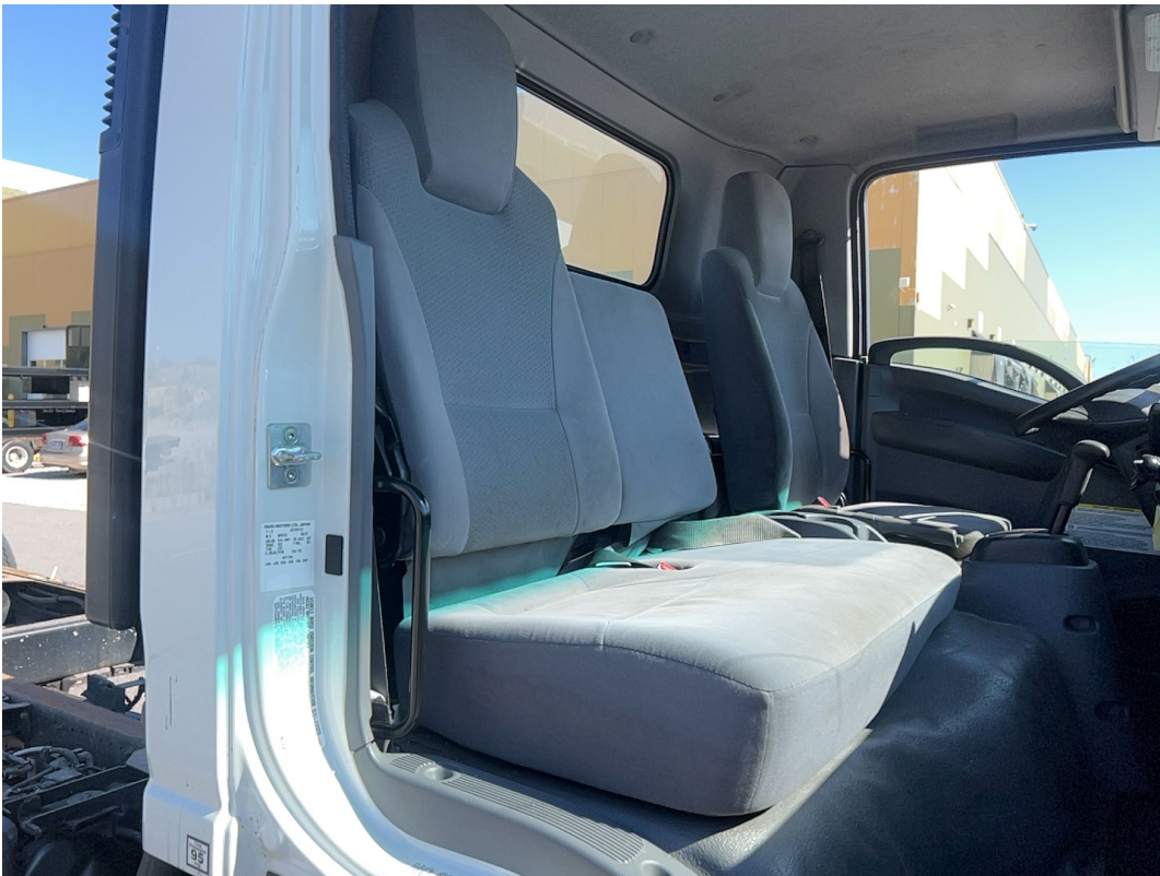
Passenger's Seat / 08-10-2023