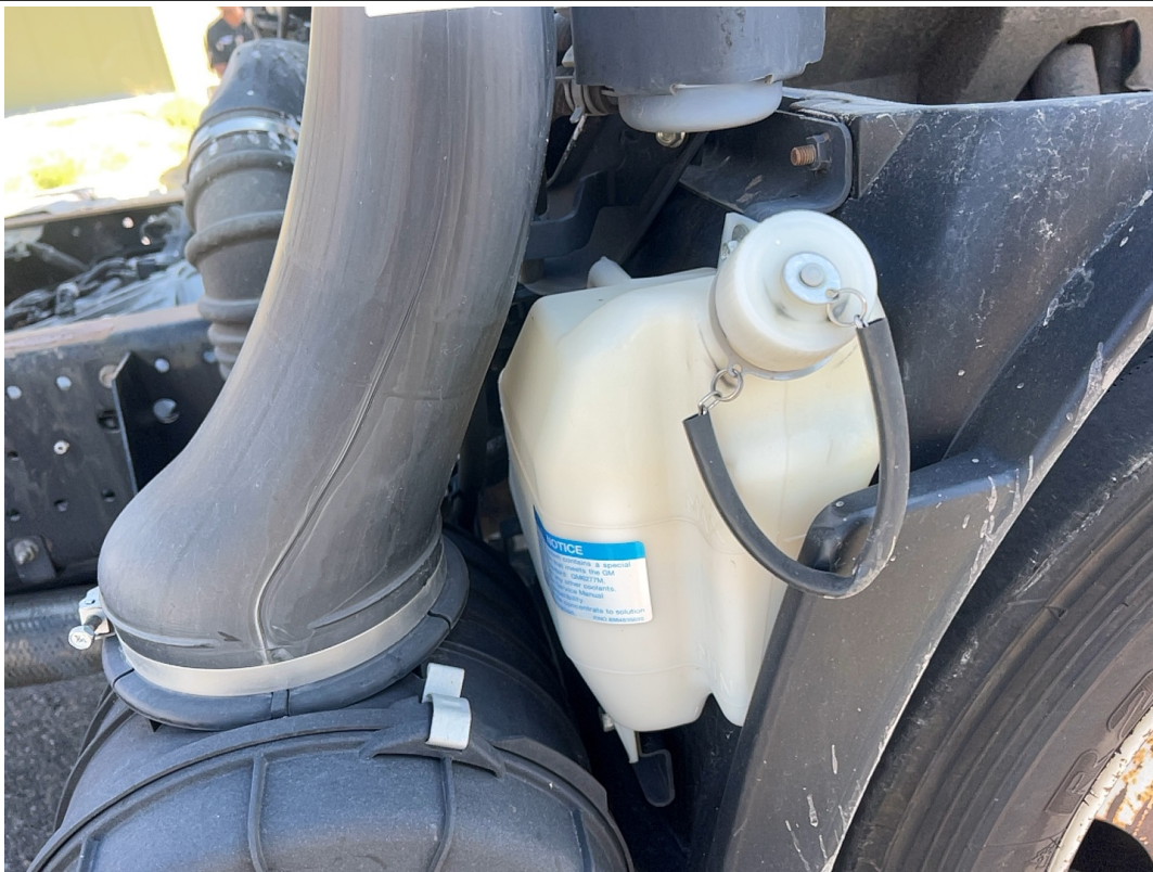
Coolant Level / 08-10-2023