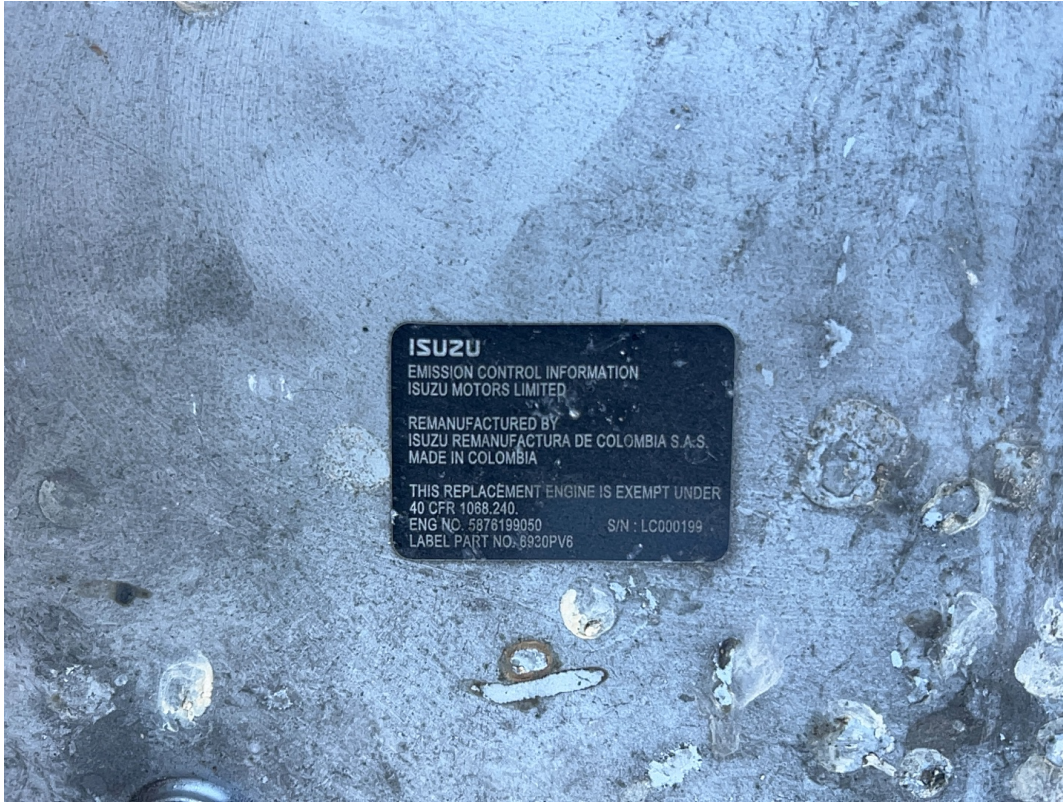
Engine Serial Plate: LC000199 / 08-10-2023