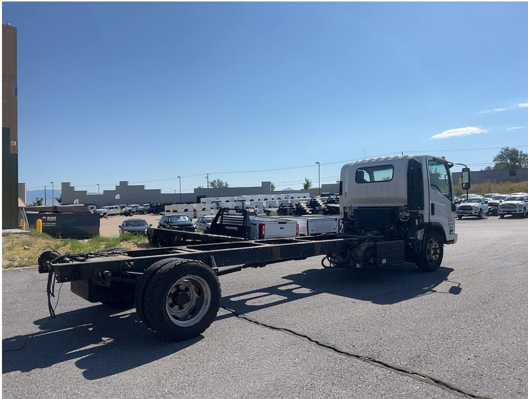
Rear Right / 08-10-2023