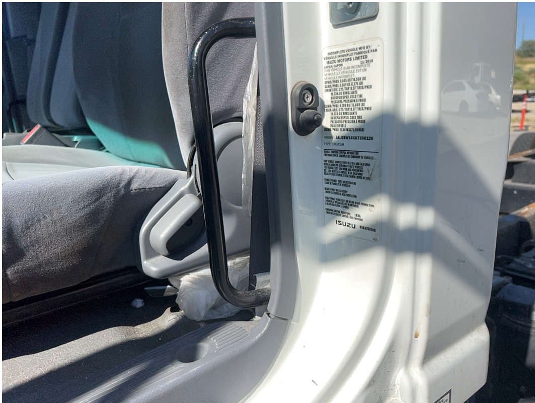
Handrails / 08-10-2023