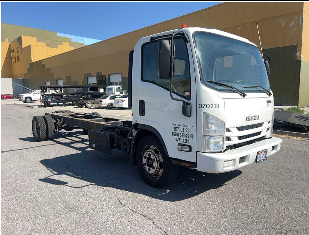
Front Right / 08-10-2023