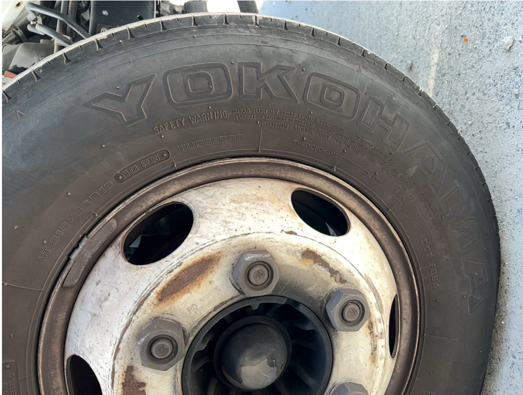
Right Steer Tire Brand / 08-30-2023