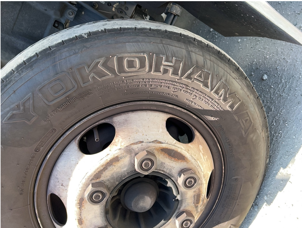
Left Steer Tire Brand / 08-30-2023