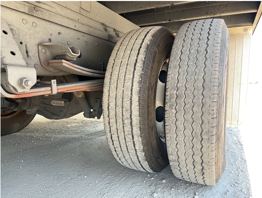
Rear Left Outer Drive Tire Condition / Rear Left Inner Drive Tire Condition / 08-30-2023