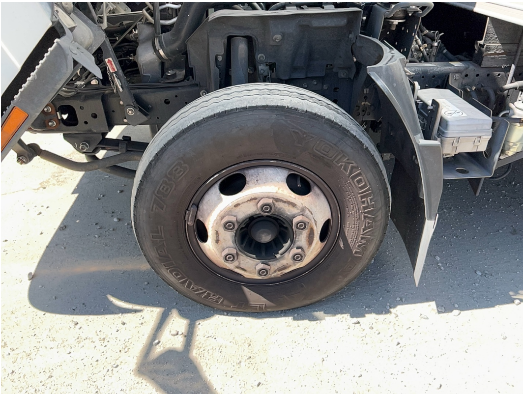
Left Steer Tire Condition / 08-30-2023