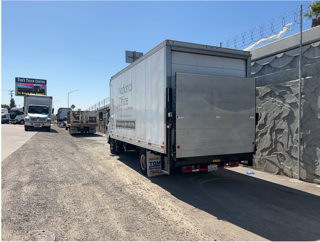
Rear Left / 08-30-2023