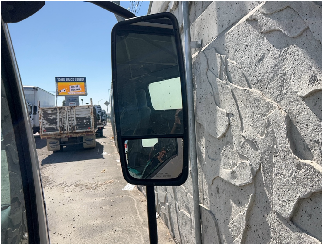
Mirrors / 08-30-2023