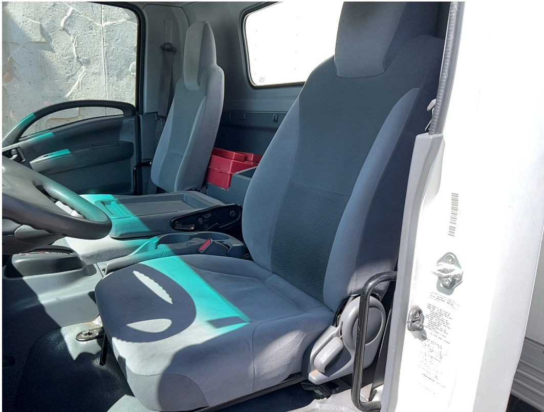
Driver's Seat / 08-30-2023