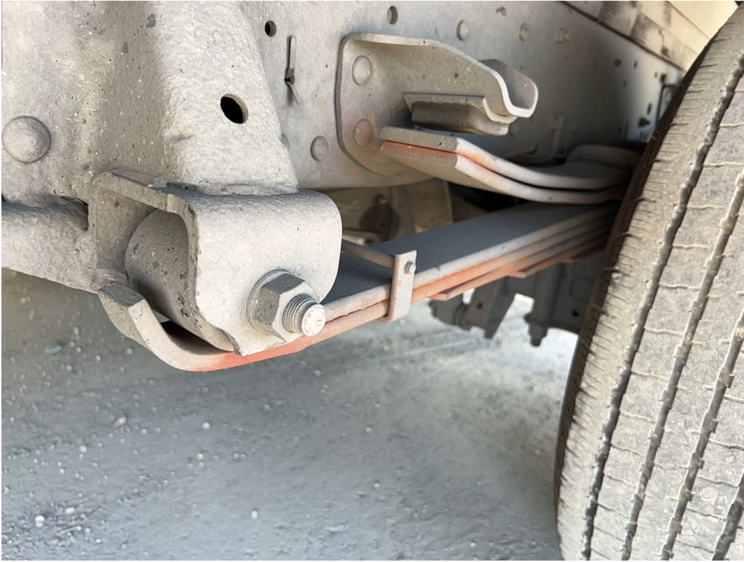
Axles / Suspension / 08-30-2023