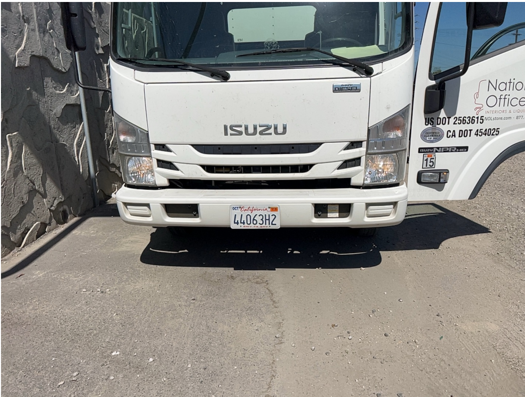
Front Lights / 08-30-2023