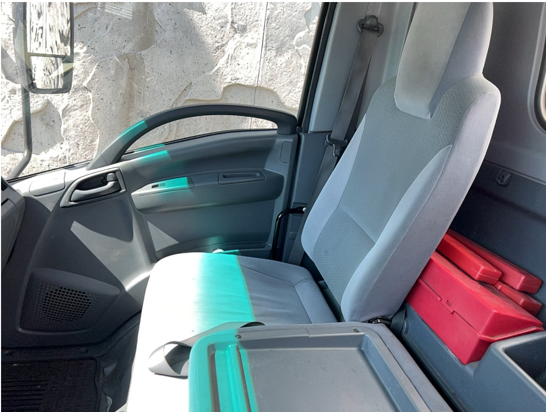
Passenger's Seat / 08-30-2023