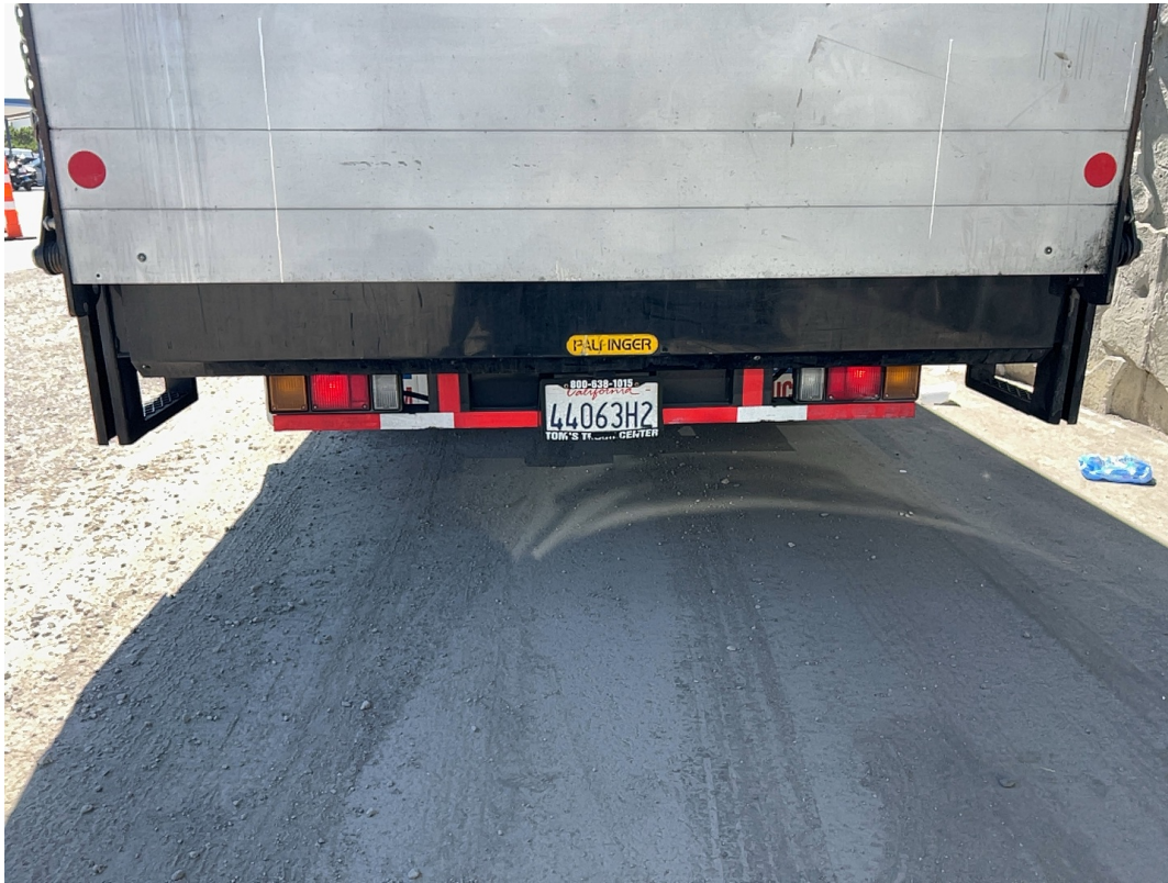
Rear Lights / 08-30-2023