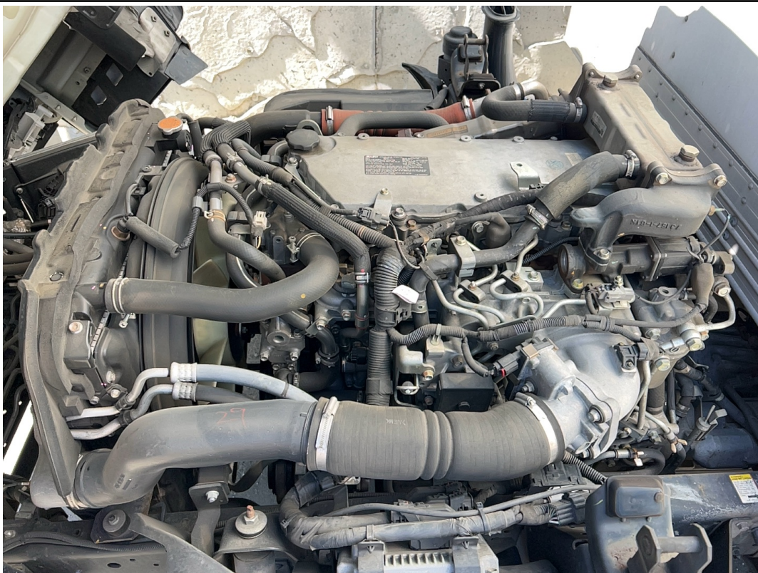
Engine Compartment / 08-30-2023