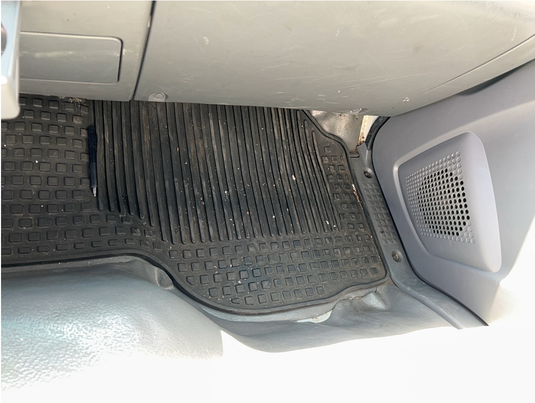
Floorboard / 08-30-2023