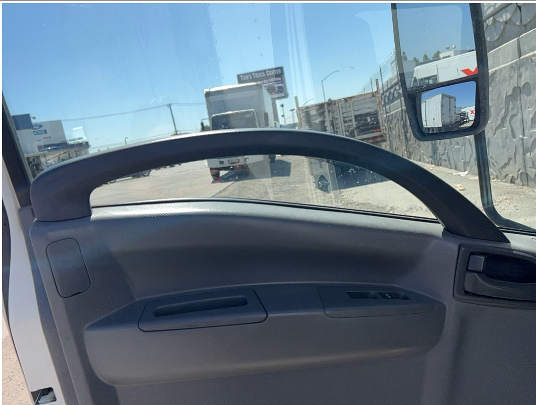
Handrails / 08-30-2023