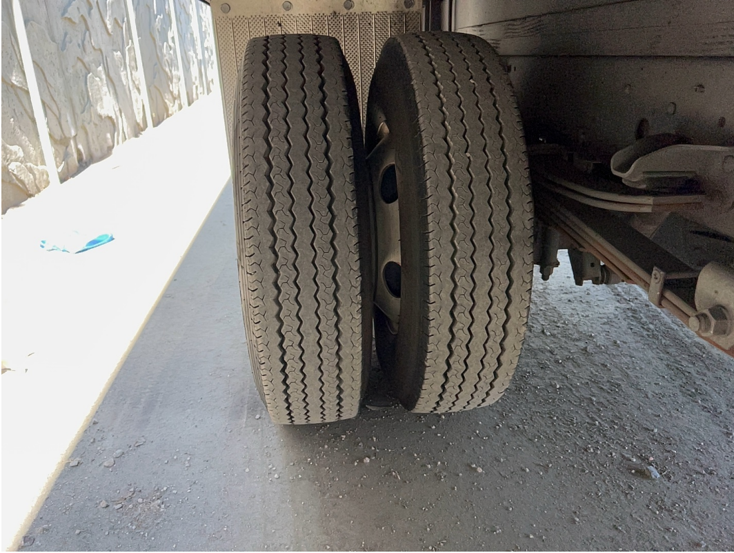
Rear Right Outer Drive Tire Condition / Rear Right Inner Drive Tire Condition / 08-30-2023