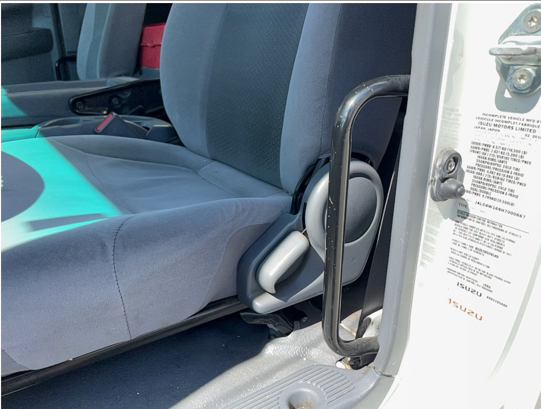
Handrails / 08-30-2023