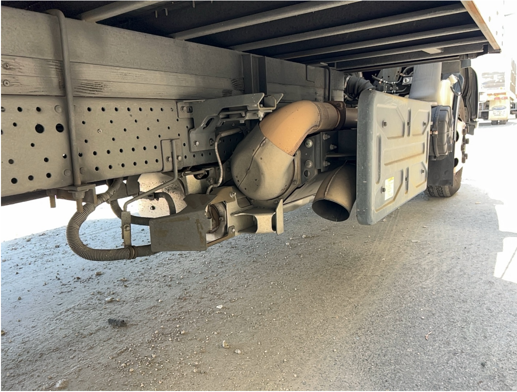
Exhaust / 08-30-2023