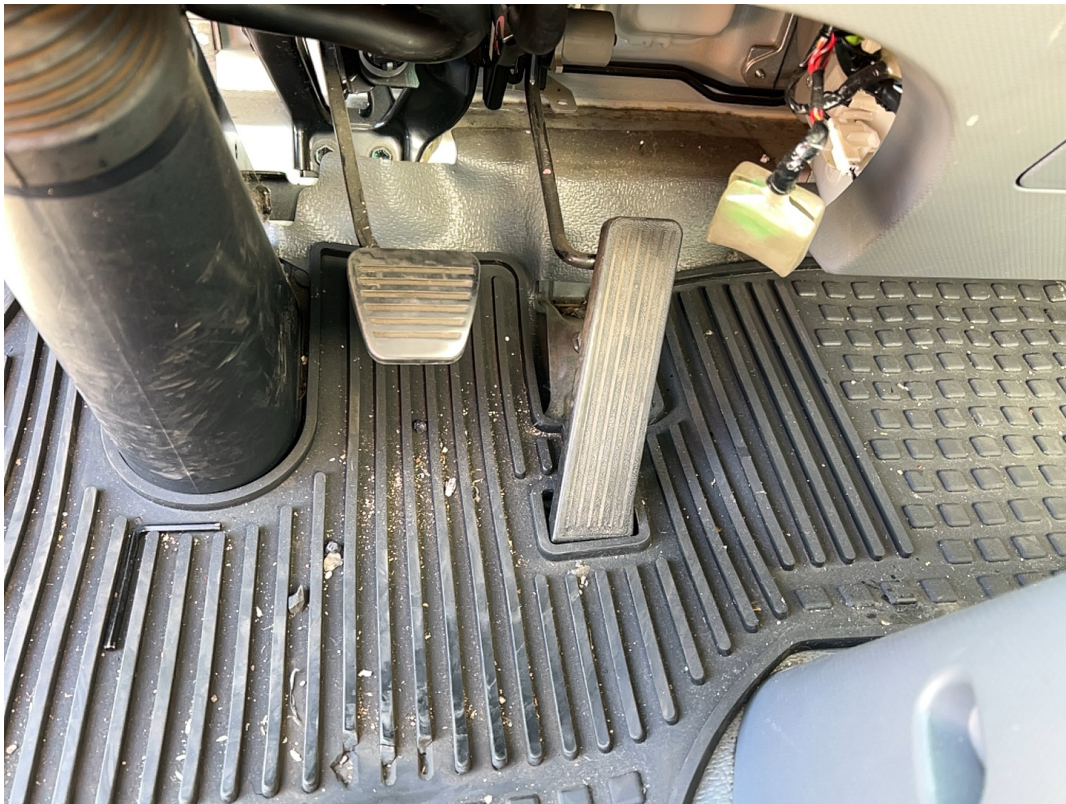
Pedals / 08-30-2023