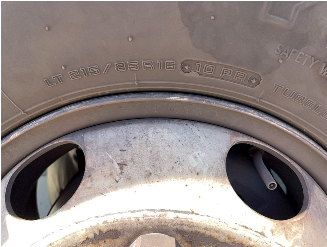
Left Steer Tire Size / 08-30-2023