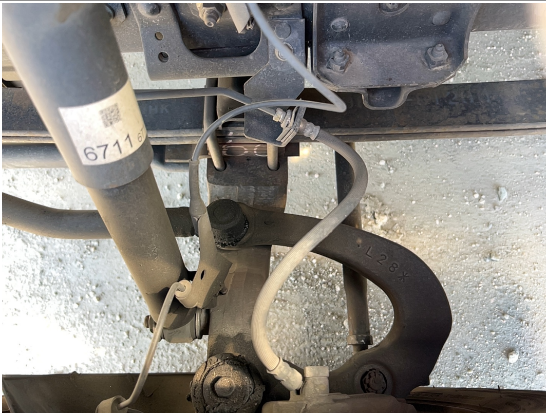
Axles / Suspension / 08-30-2023