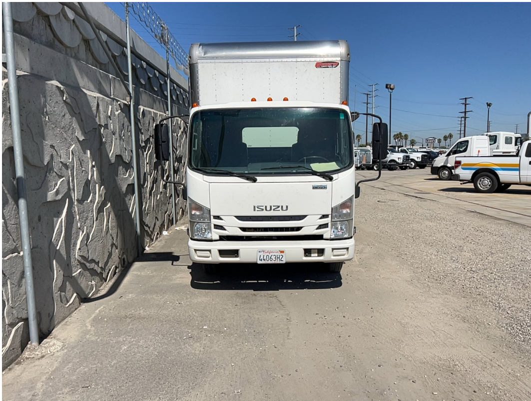
Front / 08-30-2023