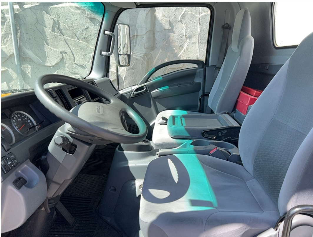
Cab Interior / 08-30-2023