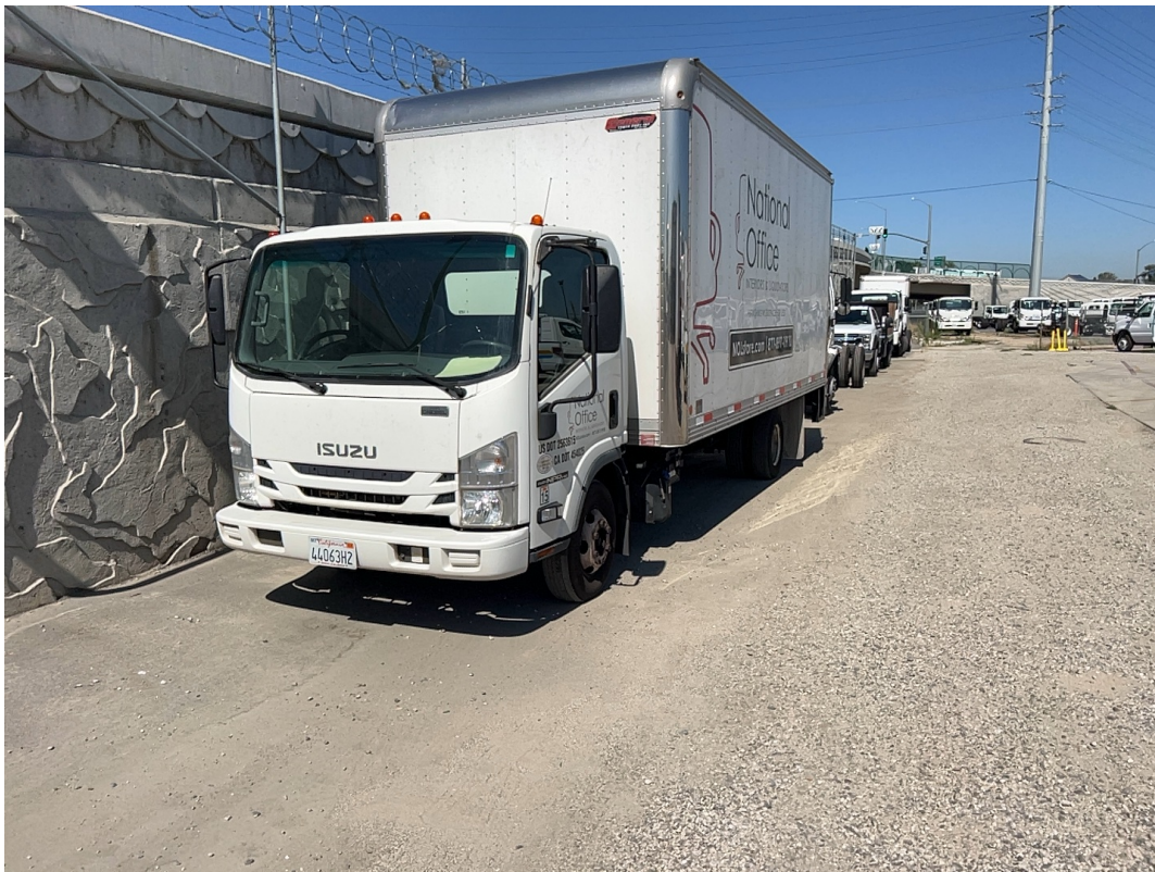
Front Left / 08-30-2023