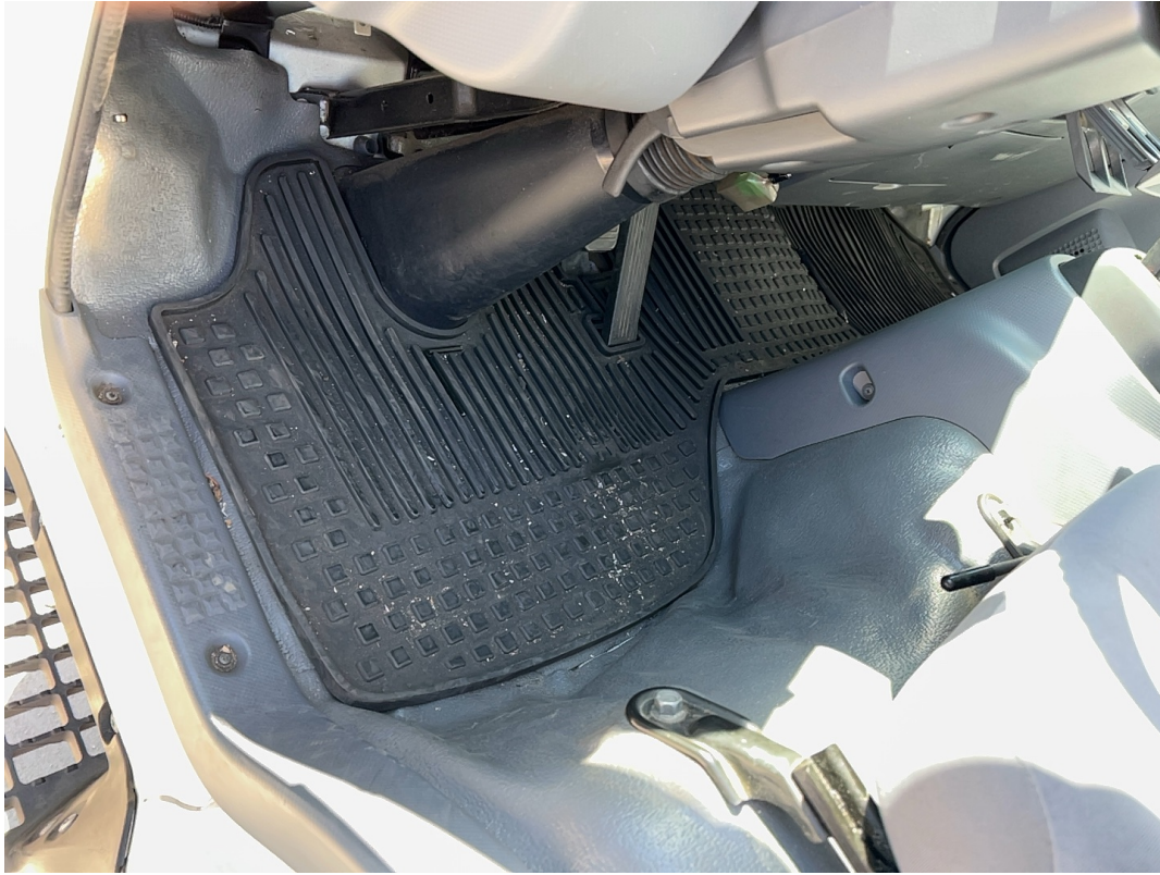
Floorboard / 08-30-2023