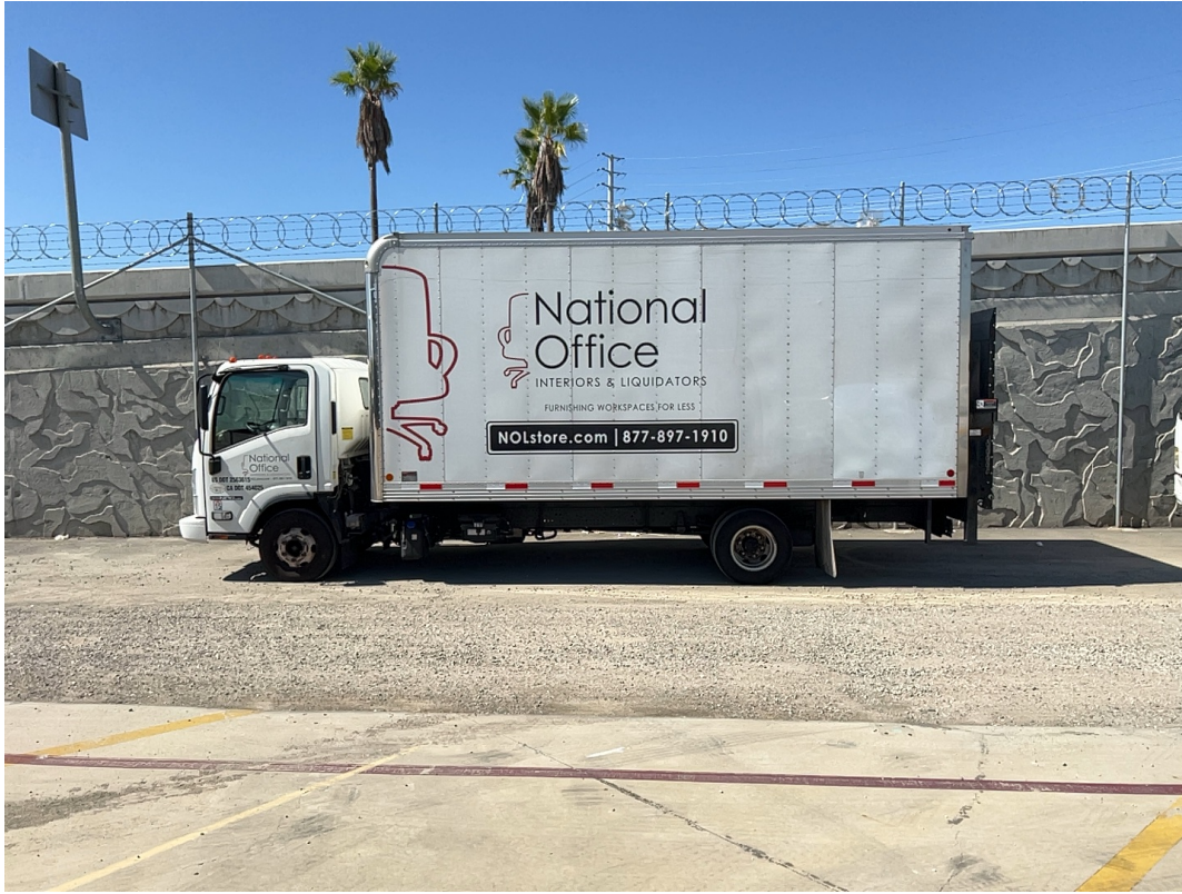
Left / 08-30-2023