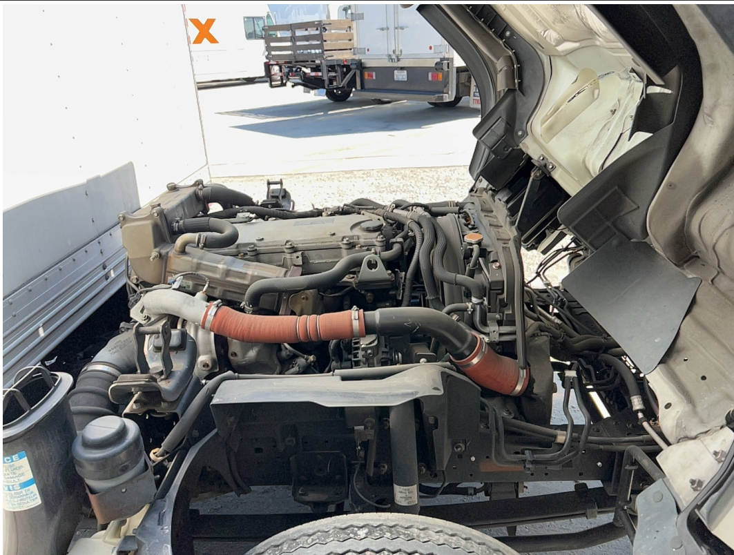
Engine Compartment / 08-30-2023