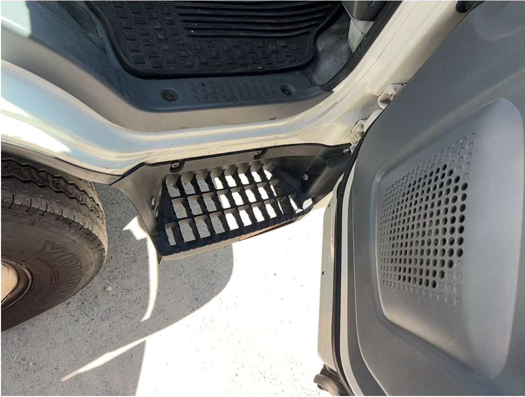
Steps / 08-30-2023