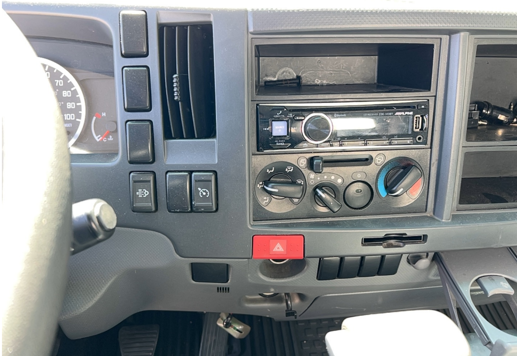
Switches and Controls / Heated Mirrors / Radio / A/C / 08-30-2023