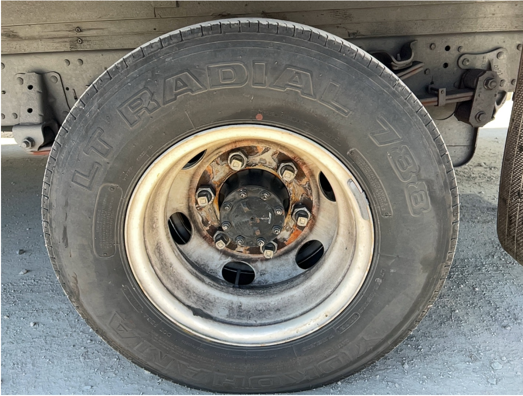
Rear Left Outer Drive Tire Condition / 08-30-2023