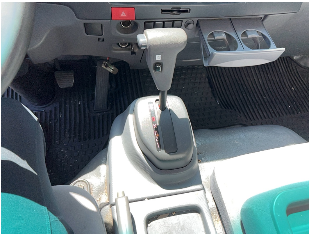
Transmission / 08-30-2023