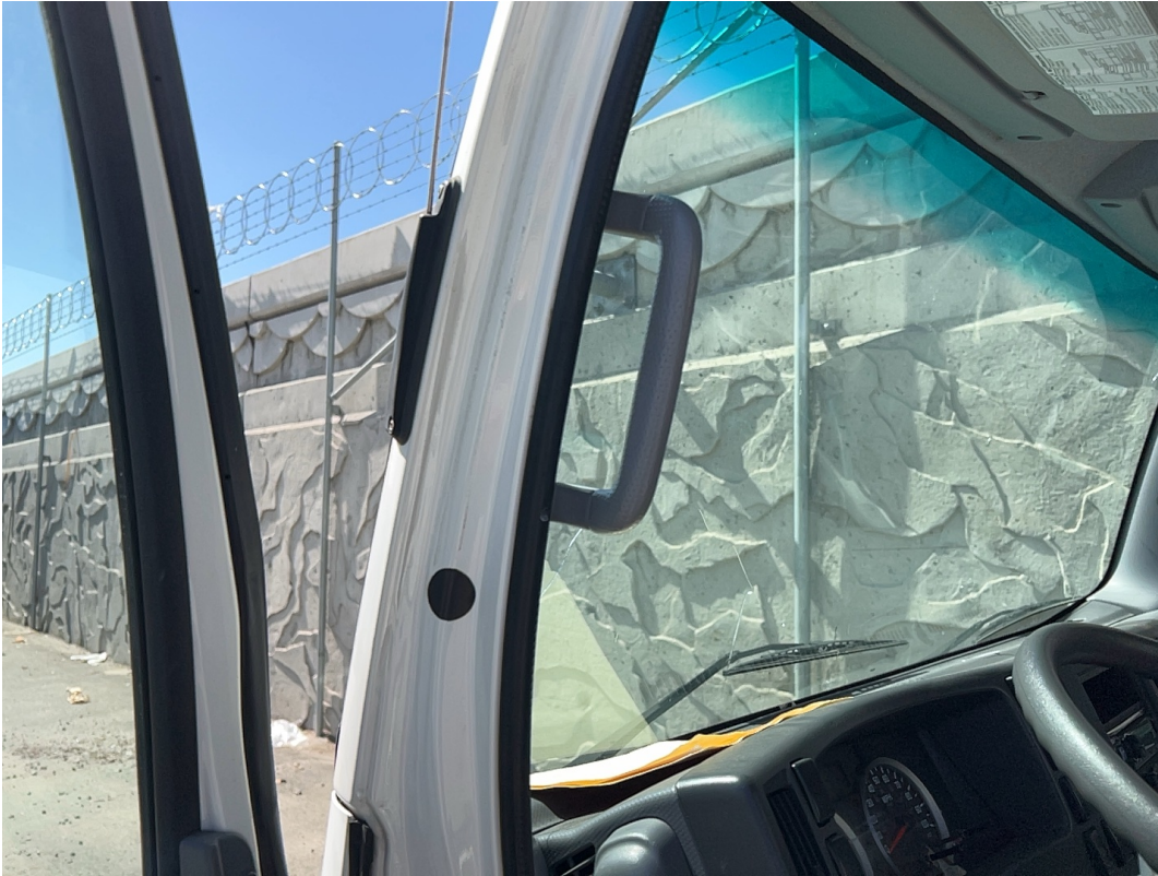
Handrails / 08-30-2023