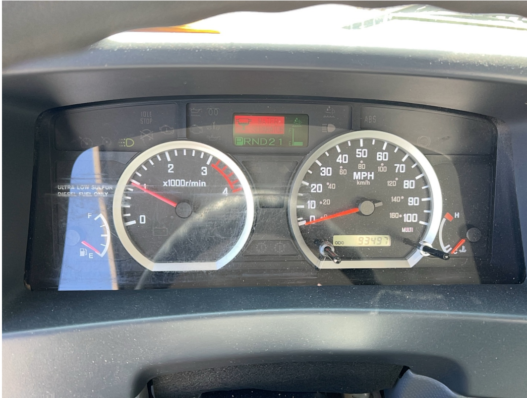
EMS Warning Lights / 08-30-2023