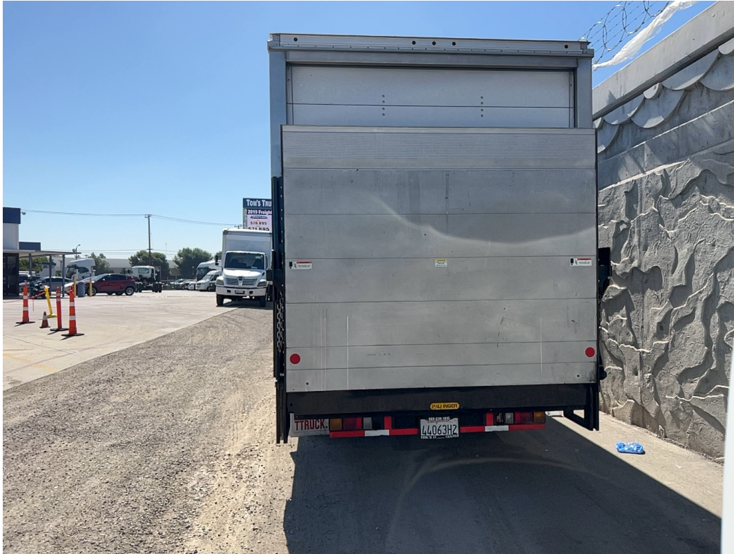
Rear / 08-30-2023