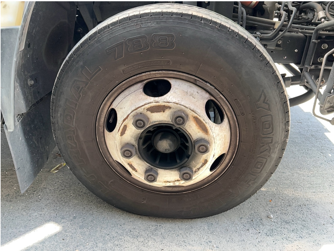
Right Steer Tire Condition / 08-30-2023