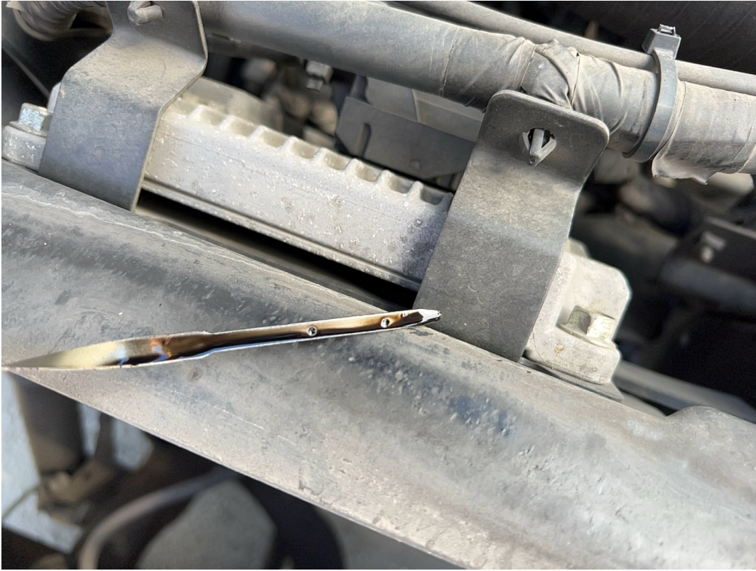
Oil Dipstick / 08-30-2023