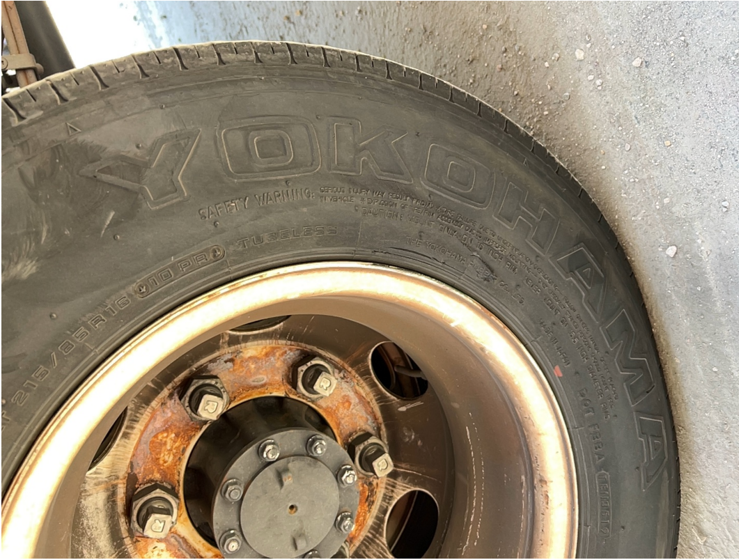
Rear Right Outer Drive Tire Brand / 08-30-2023