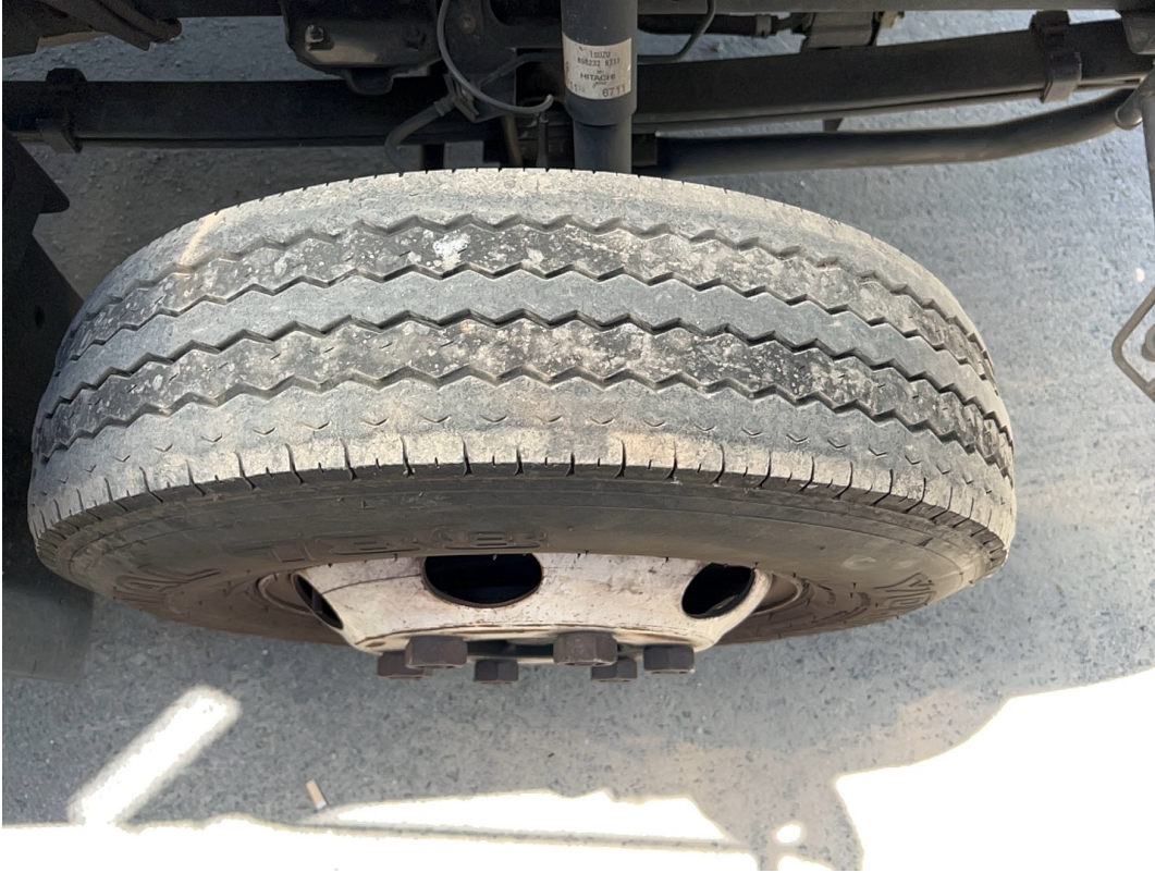
Right Steer Tire Condition / 08-30-2023