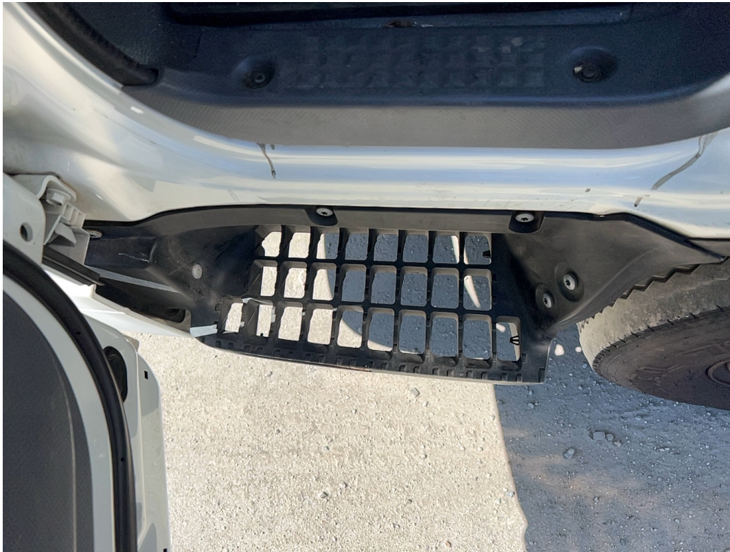
Steps / 08-30-2023