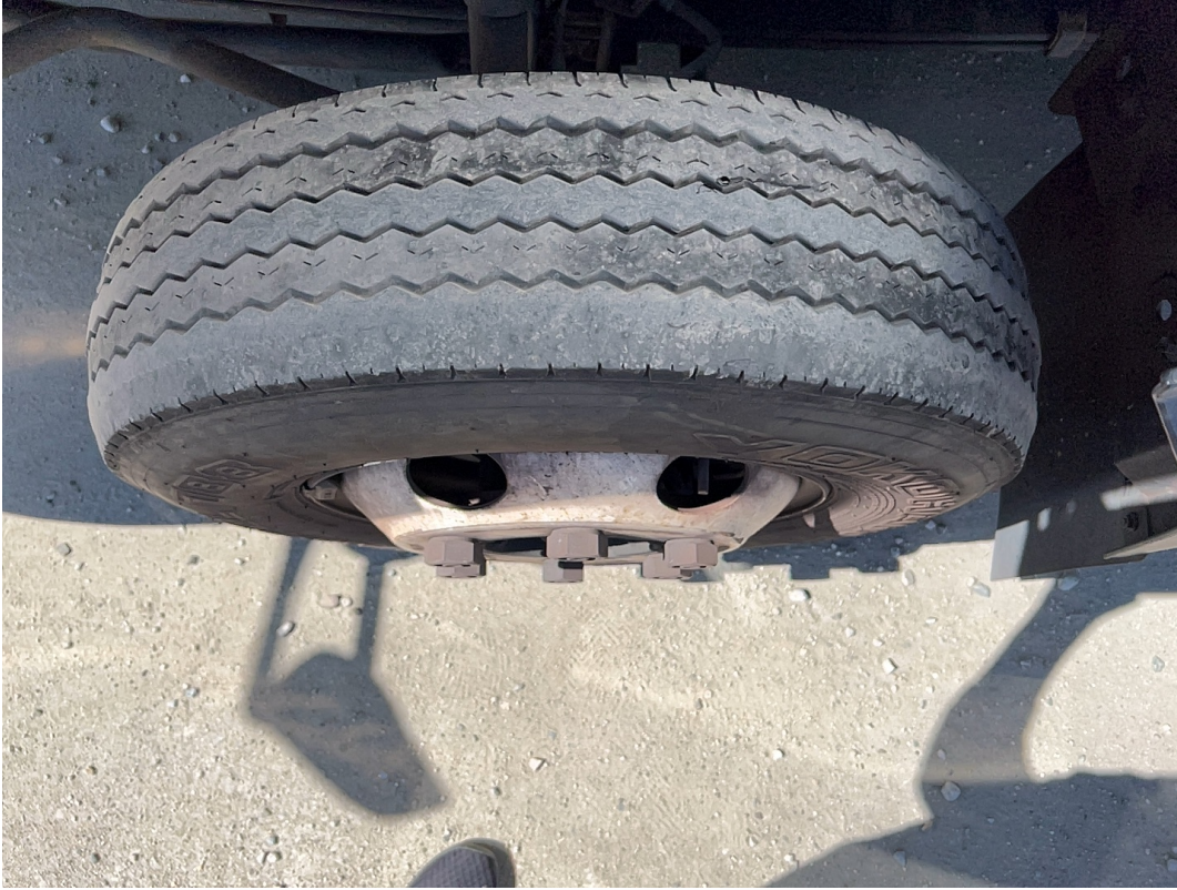
Left Steer Tire Condition / 08-30-2023