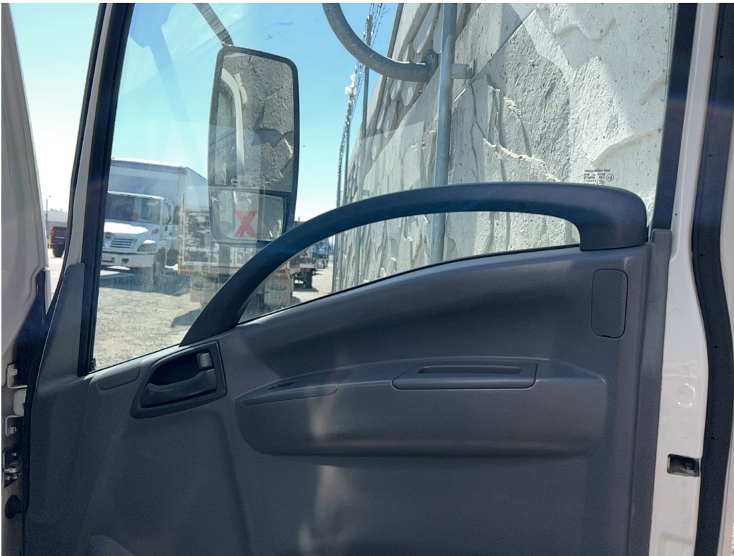
Handrails / 08-30-2023