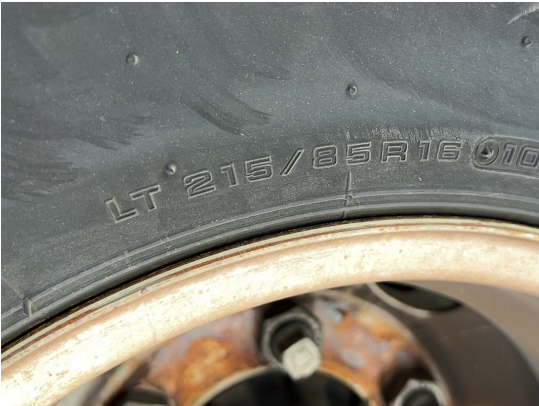
Rear Right Outer Drive Tire Size / 08-30-2023