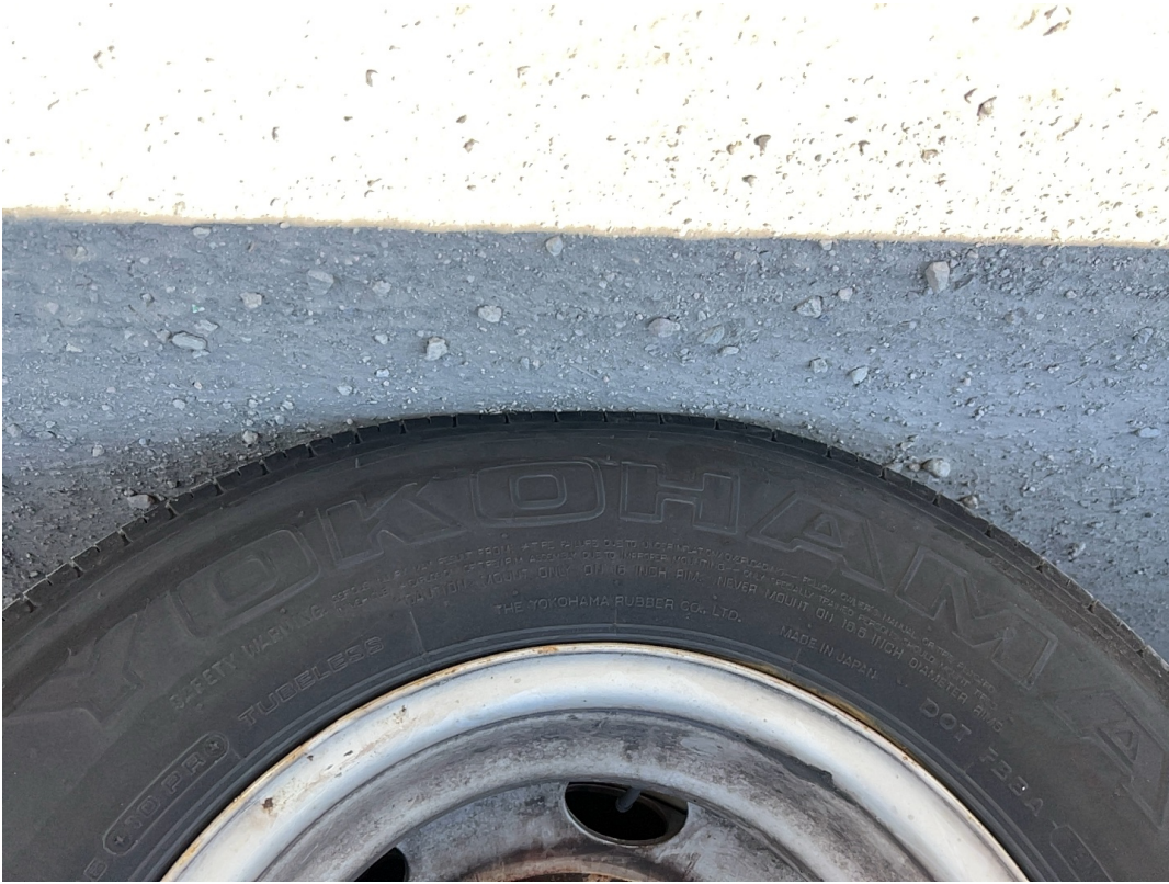
Rear Left Outer Drive Tire Brand / 08-30-2023