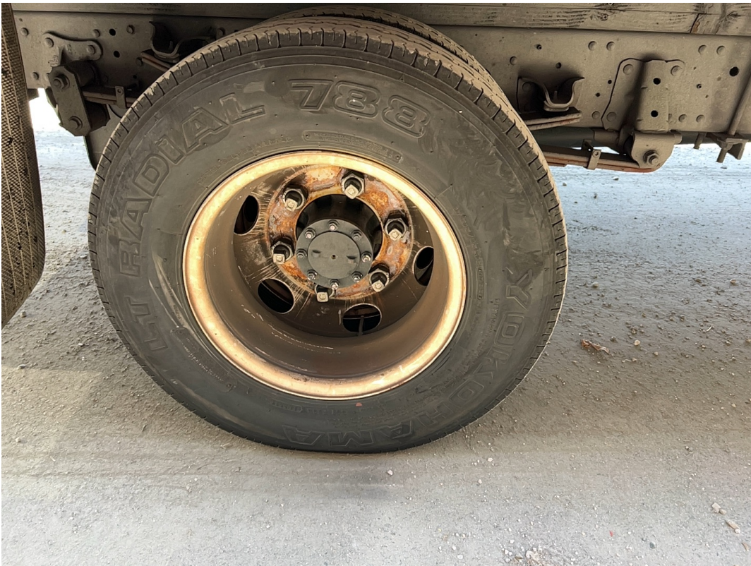
Rear Right Outer Drive Tire Condition / 08-30-2023