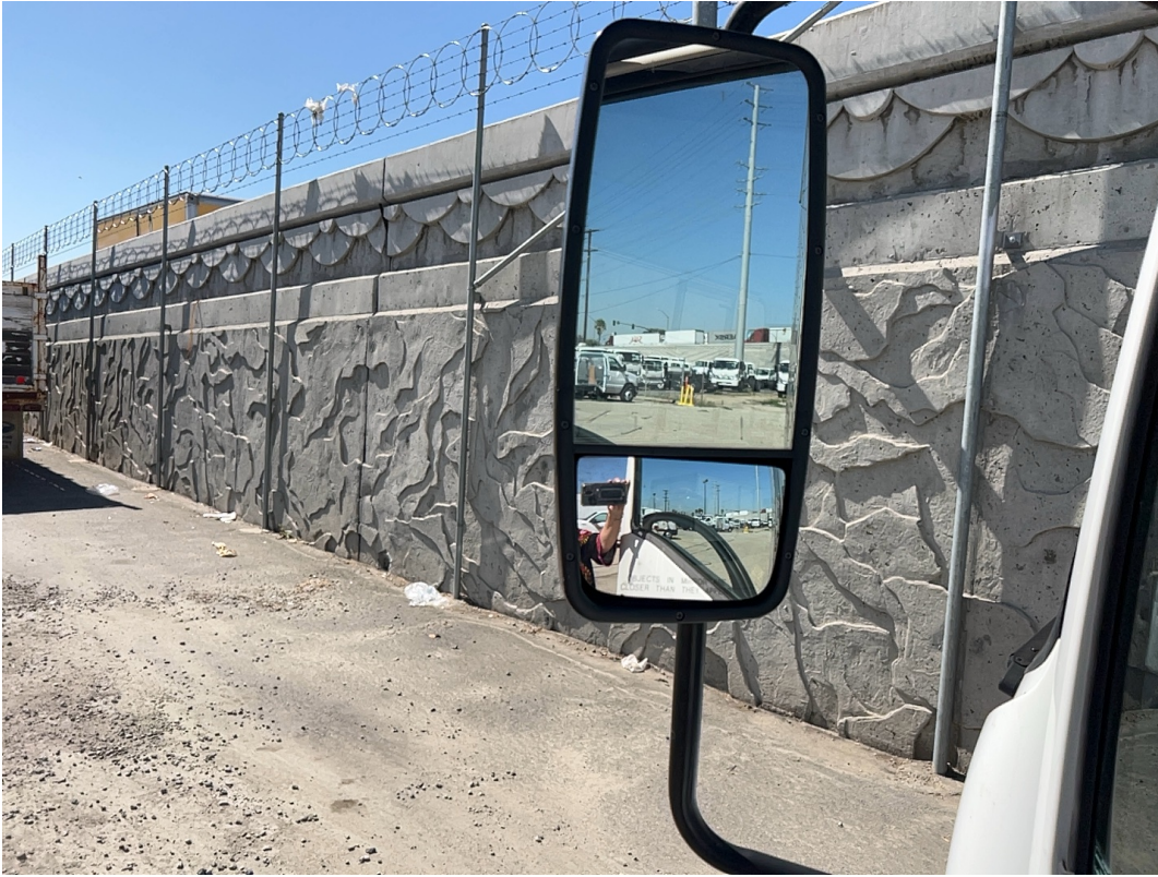
Mirrors / 08-30-2023