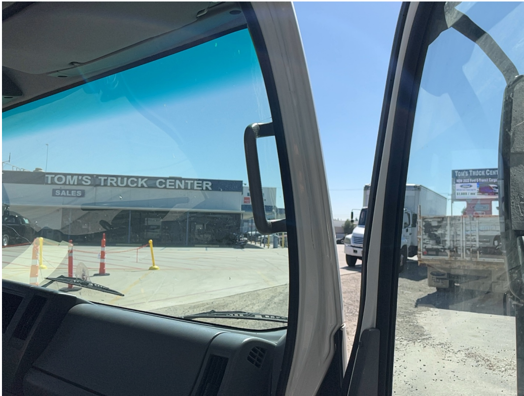
Handrails / 08-30-2023