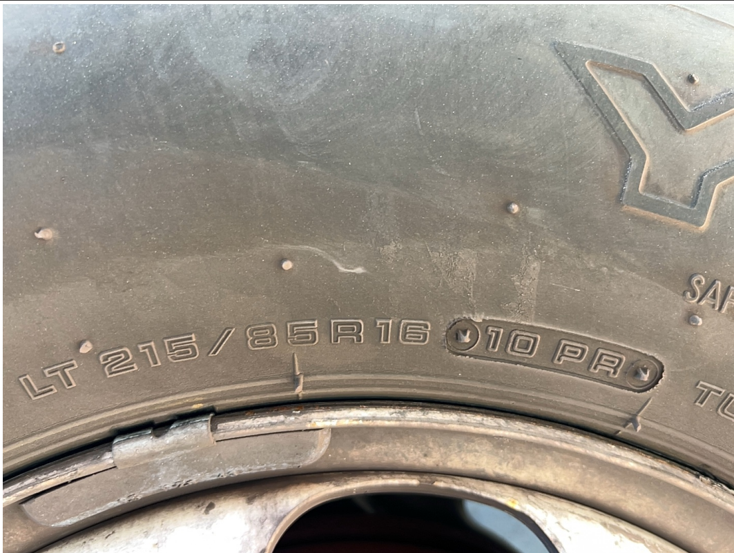
Right Steer Tire Size / 08-30-2023