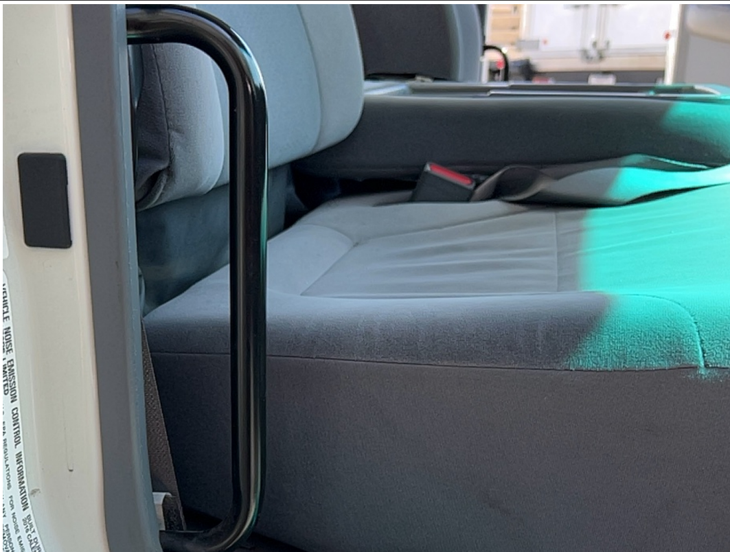
Handrails / 08-30-2023