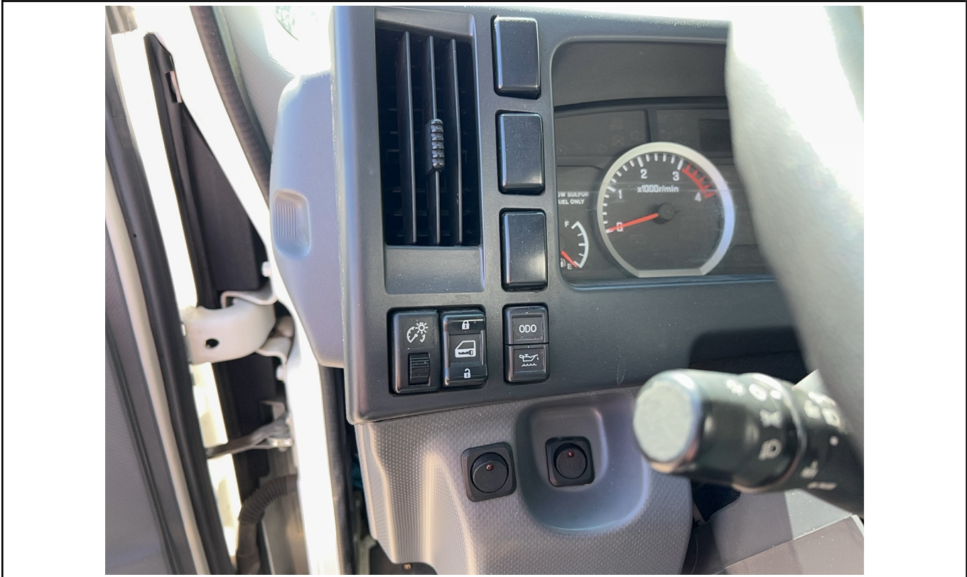
Switches and Controls / 08-30-2023