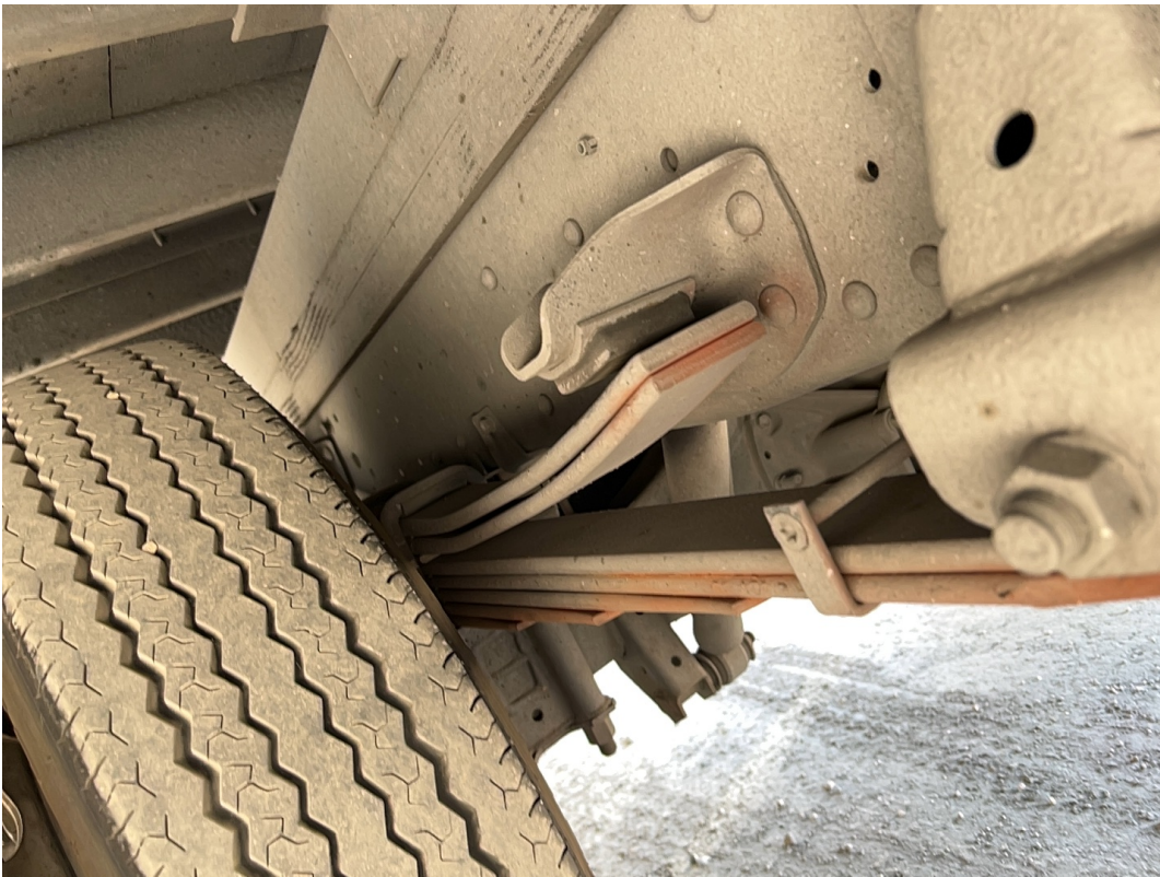
Axles / Suspension / 08-30-2023