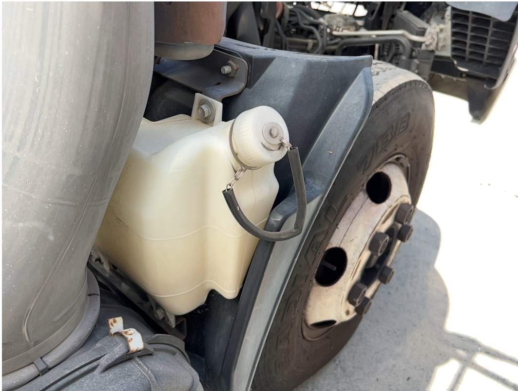
Coolant Level / 08-30-2023