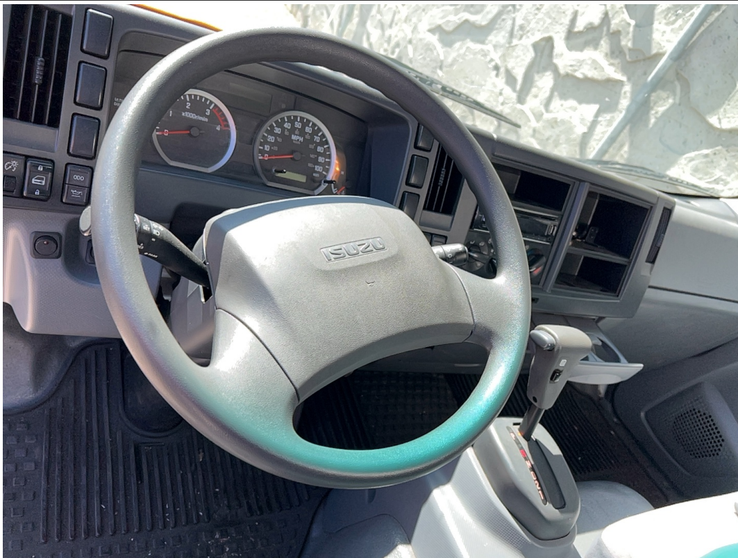
Steering Wheel / 08-30-2023