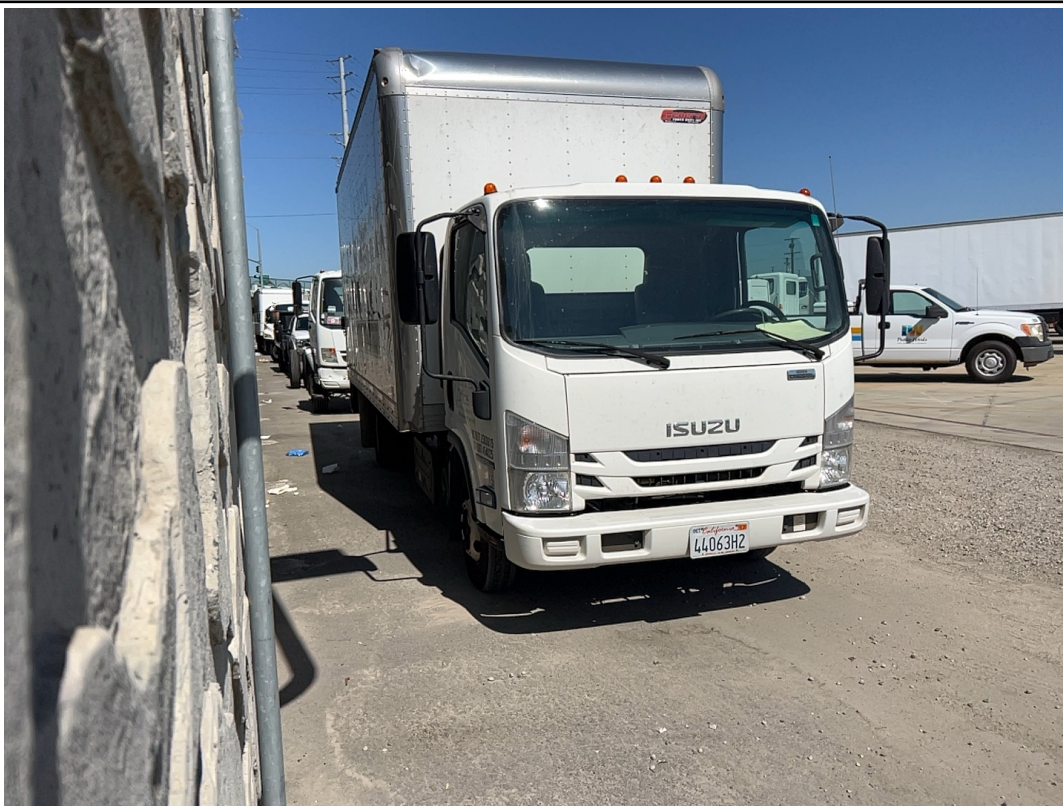
Front Right / 08-30-2023