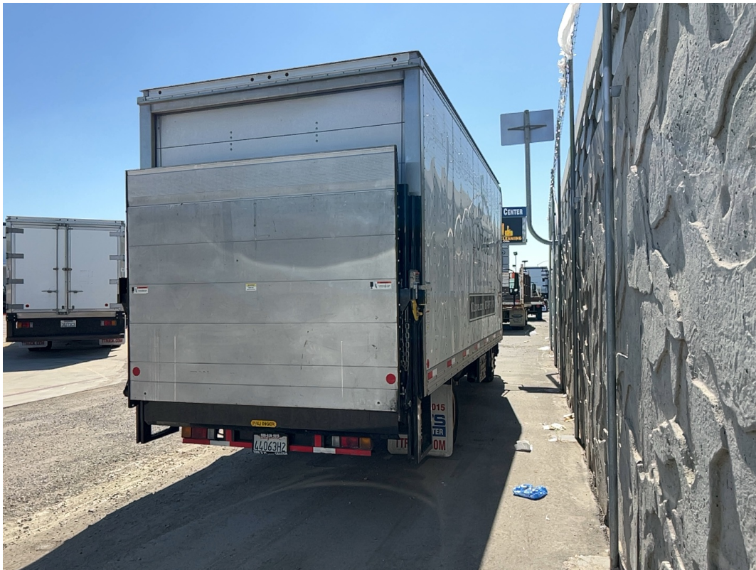
Rear Right / 08-30-2023