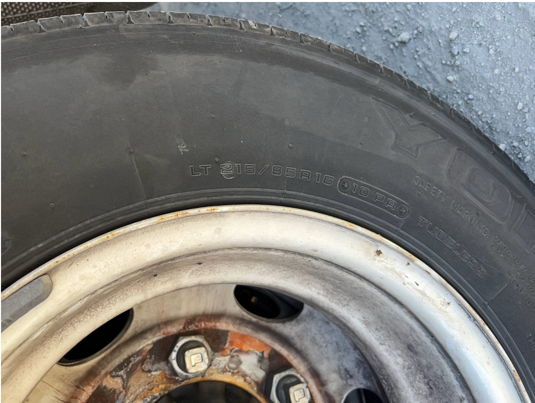
Rear Left Outer Drive Tire Size / 08-30-2023