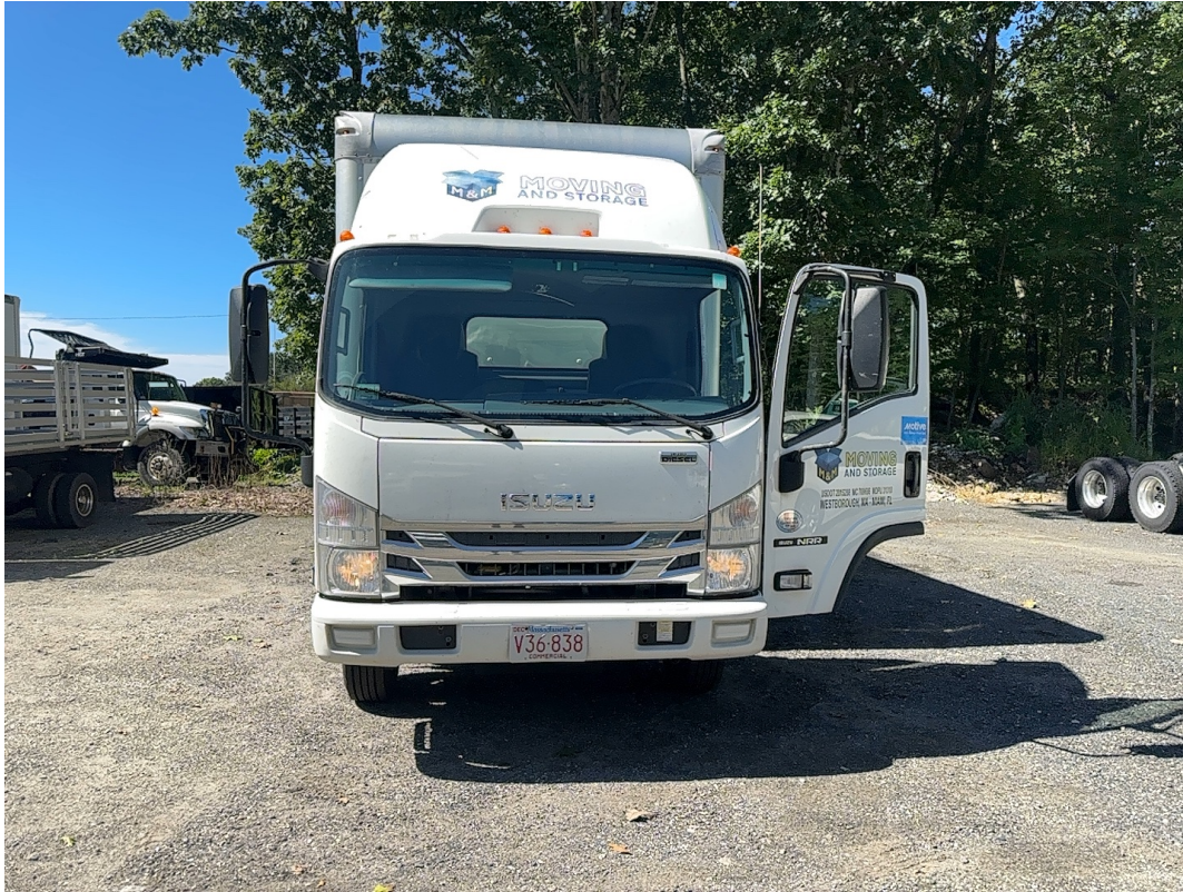
Front Lights / 08-31-2023