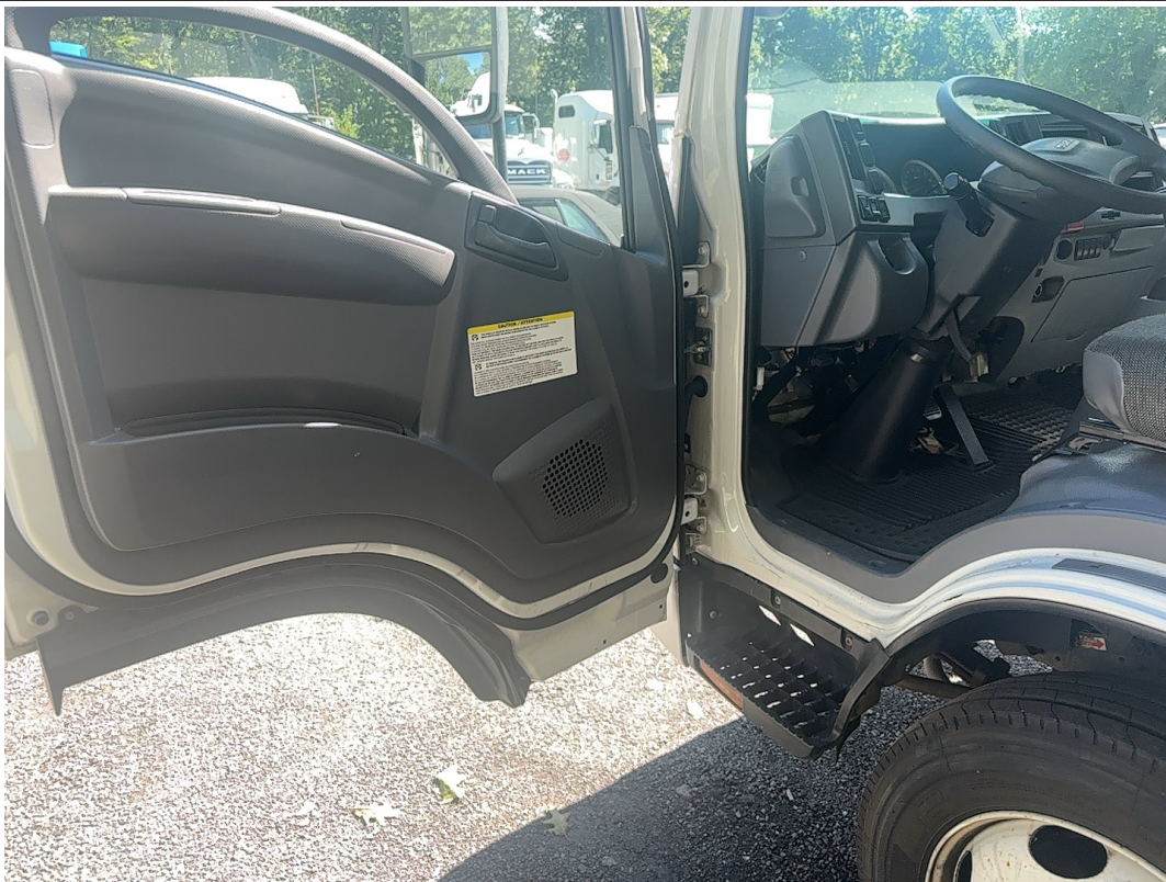
Steps / Handrails / 08-31-2023