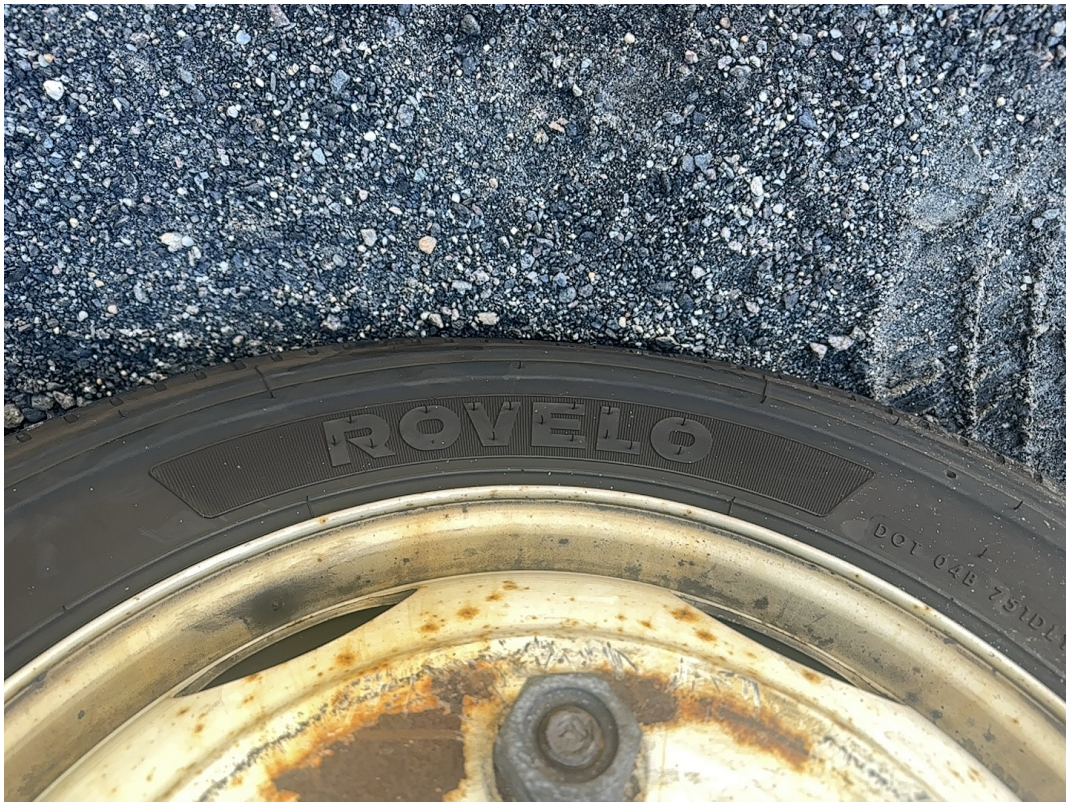
Left Steer Tire Brand / 08-31-2023