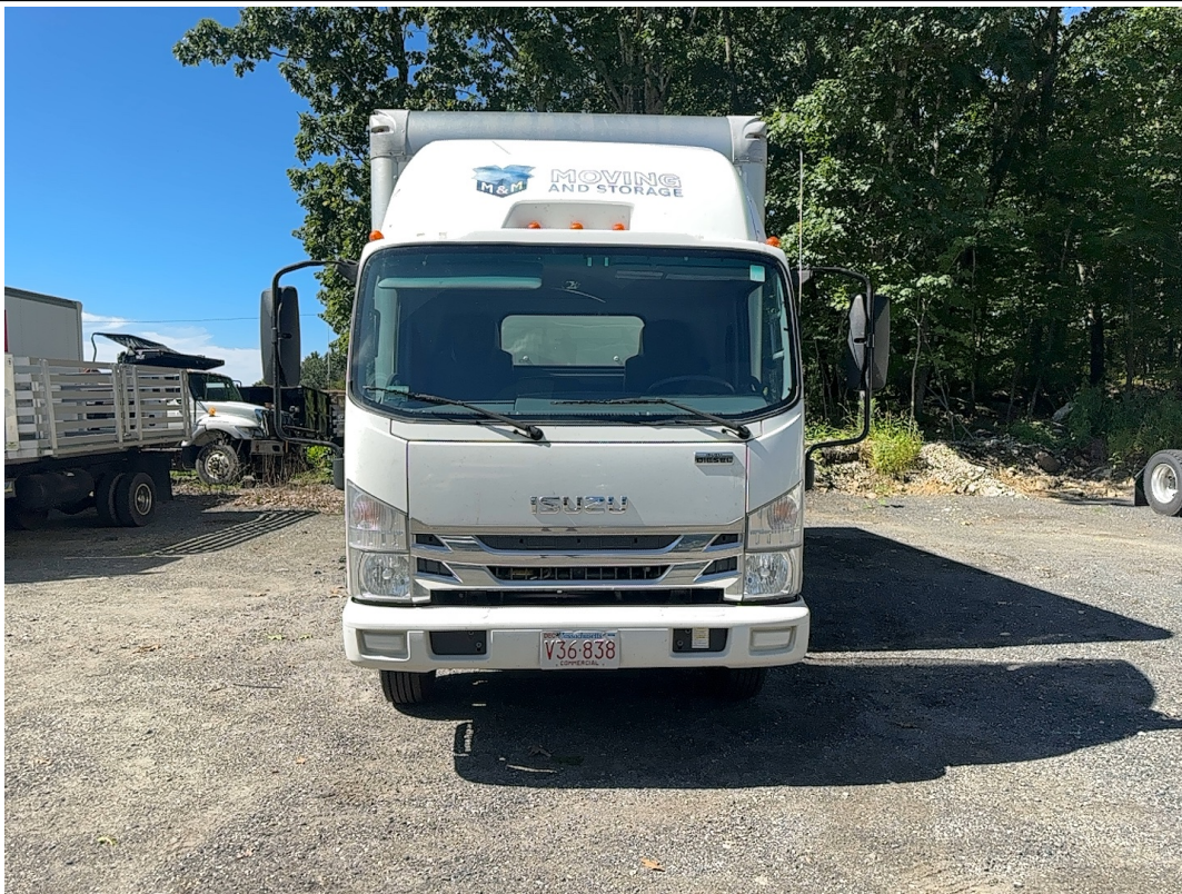
Front / 08-31-2023