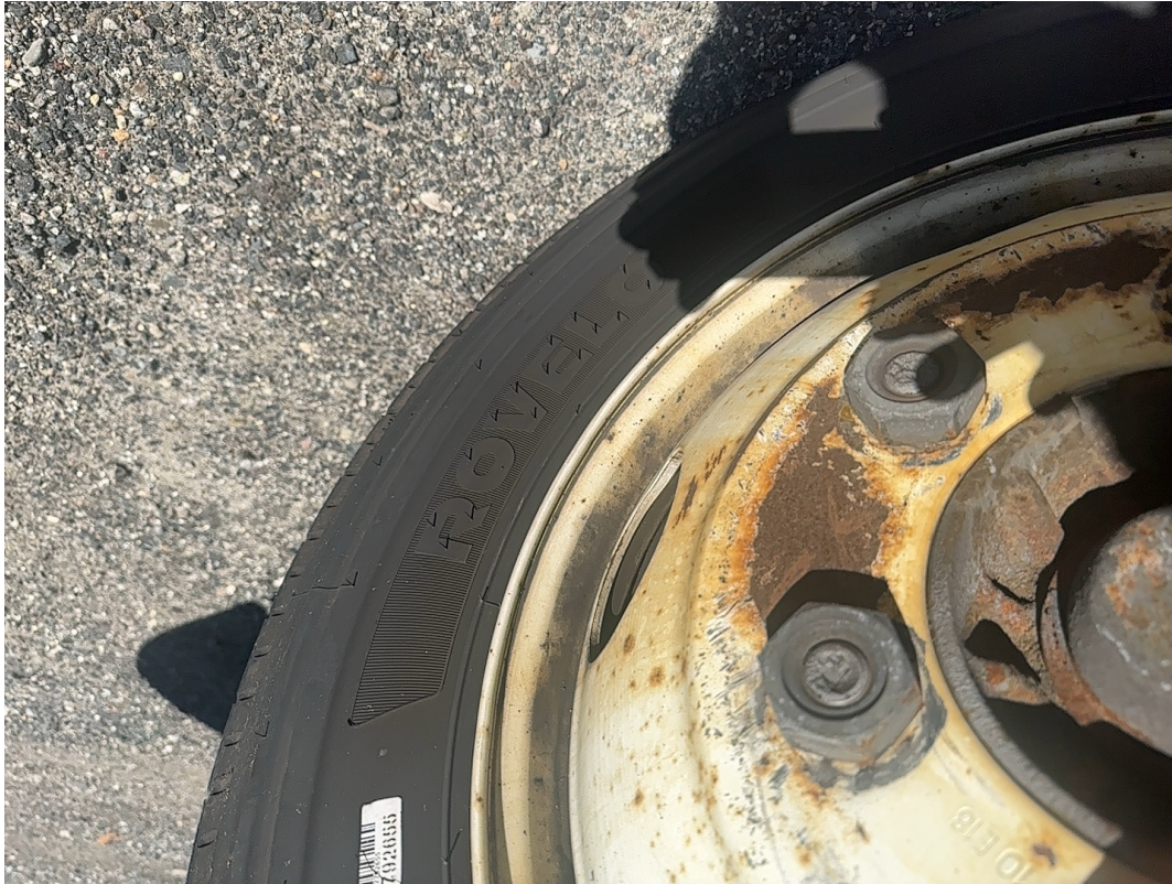
Right Steer Tire Brand / 08-31-2023