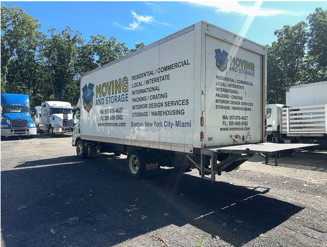
Rear Left / 08-31-2023