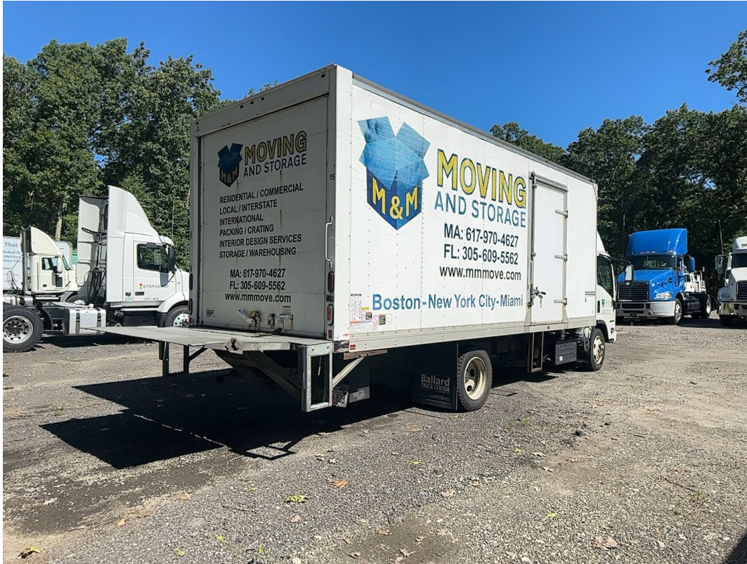
Rear Right / 08-31-2023