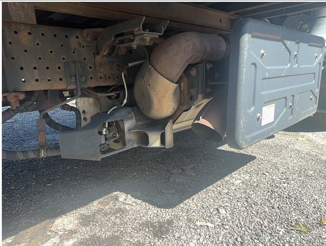
Exhaust Pipe / 08-31-2023