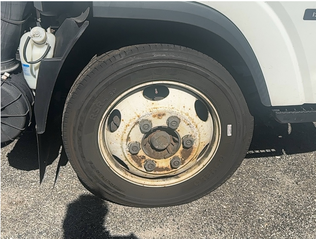
Right Steer Tire Condition / 08-31-2023