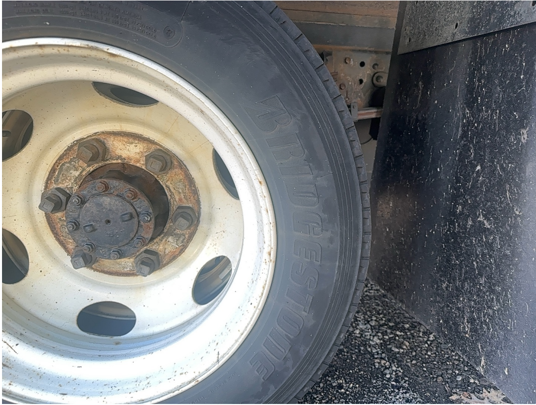
Left Outer Drive Tire Brand / 08-31-2023