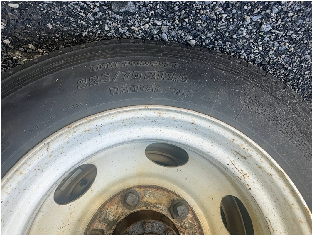
Left Outer Drive Tire Size / 08-31-2023