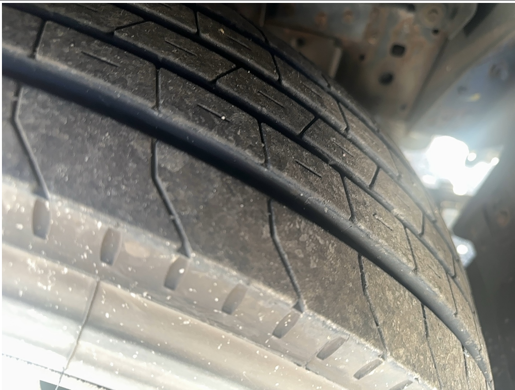
Left Steer Tire Condition / 08-31-2023