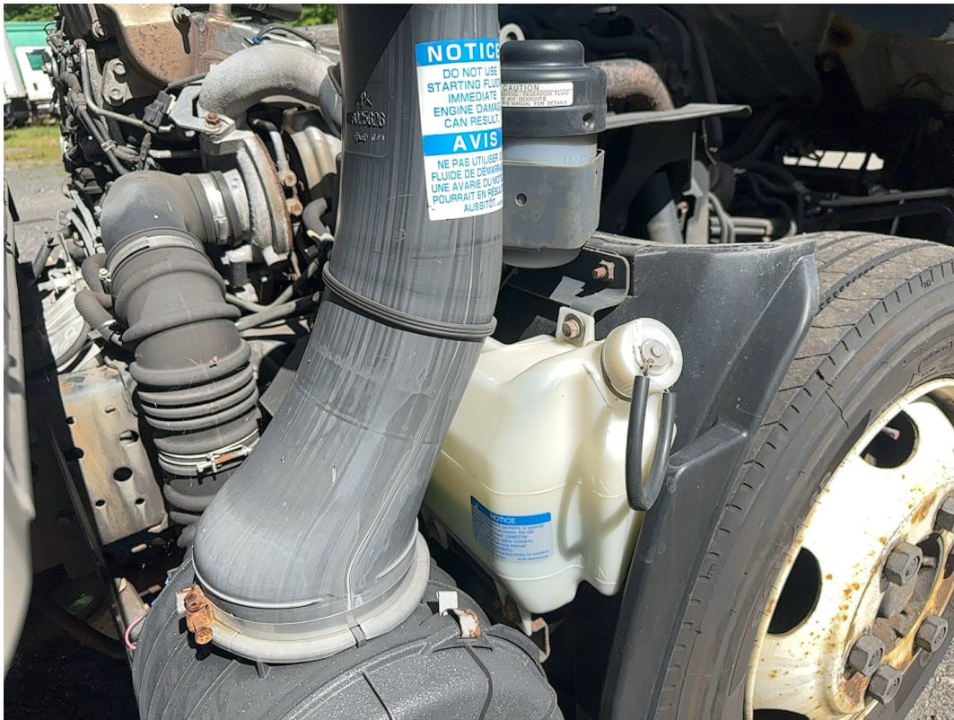
Coolant Level / 08-31-2023