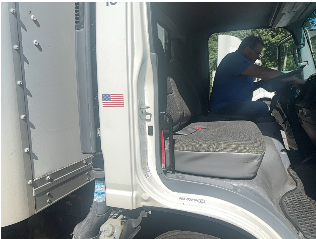
Handrails / 08-31-2023