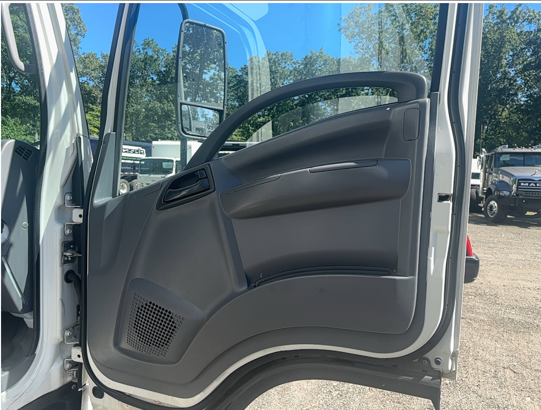
Handrails / 08-31-2023