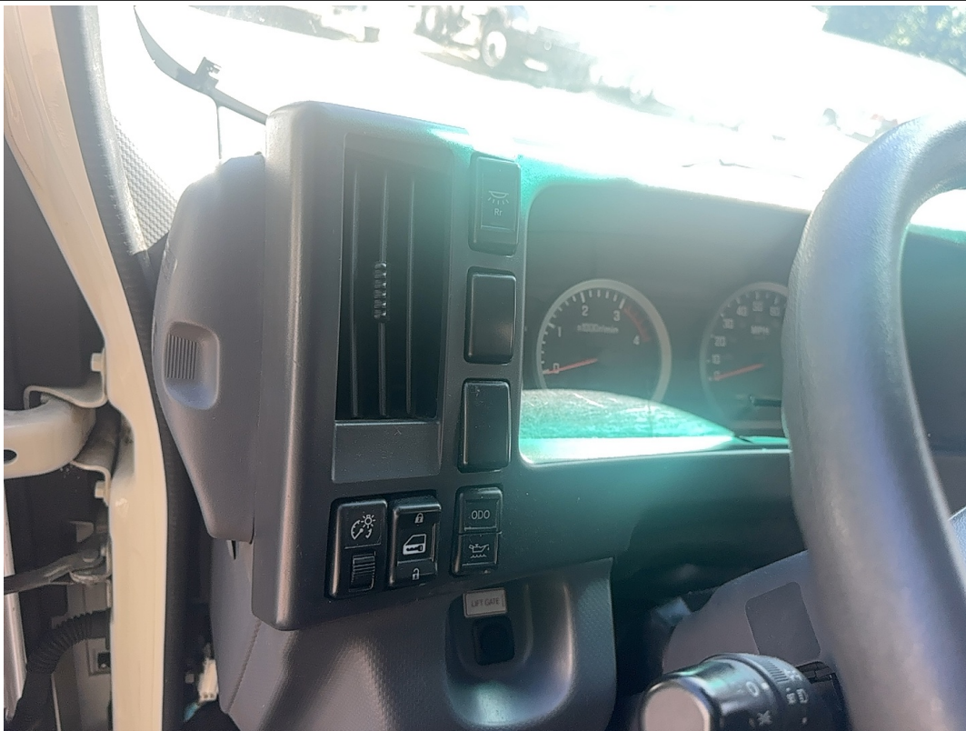
Switches and Controls / 08-31-2023