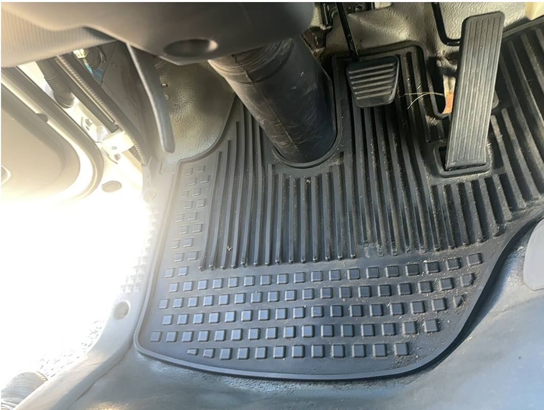
Floorboard / 08-31-2023