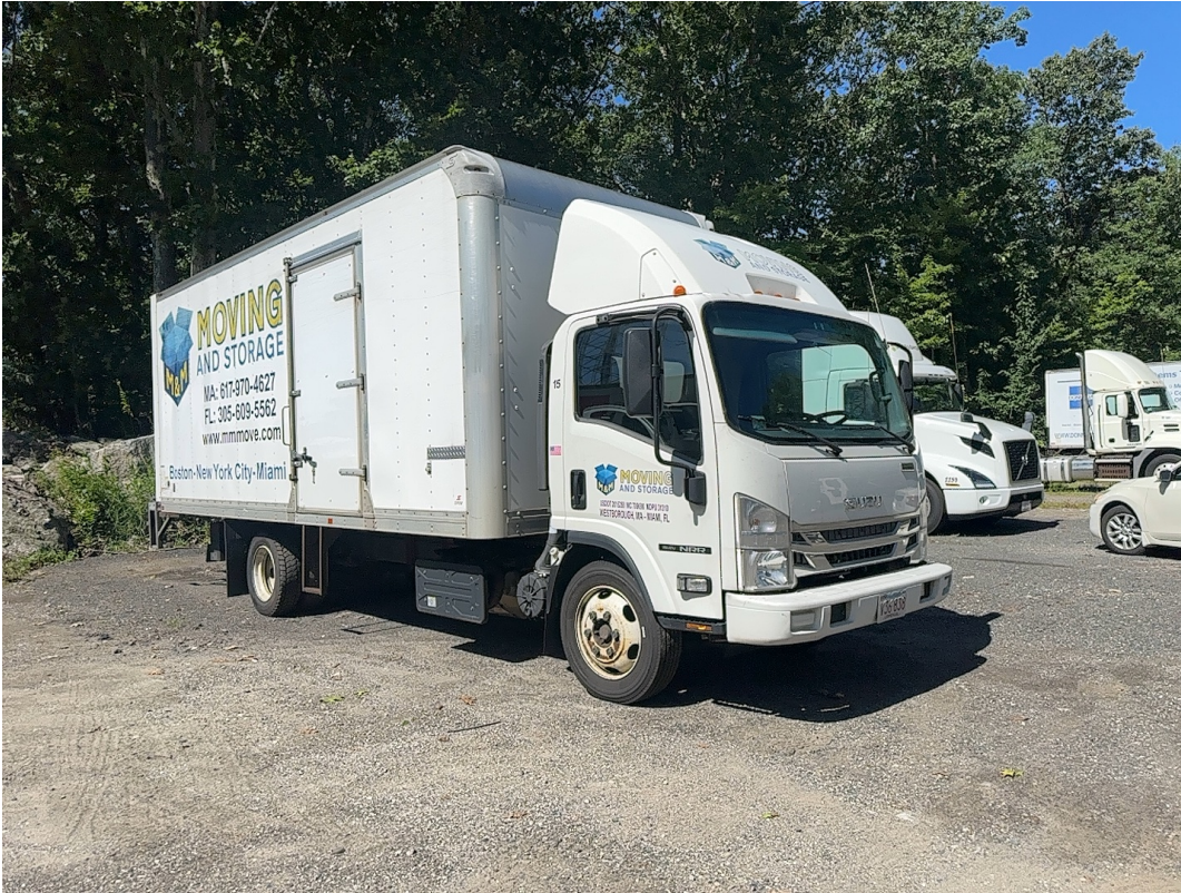
Front Right / 08-31-2023