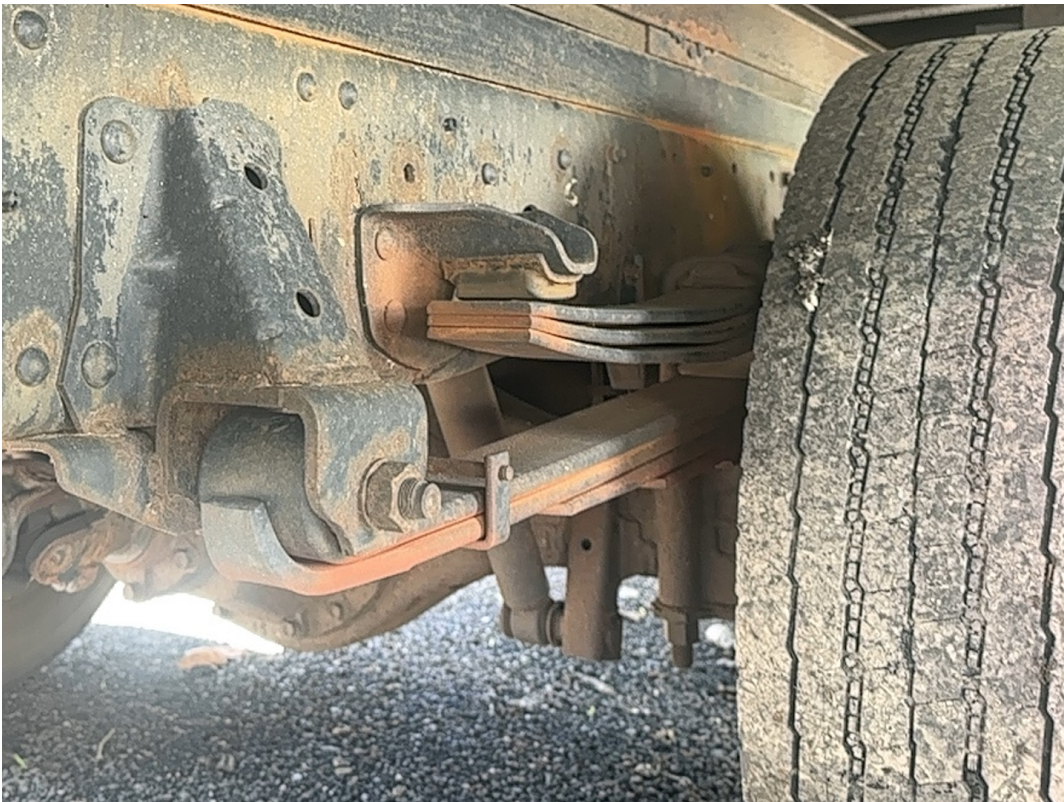
Suspension / Axles / 08-31-2023