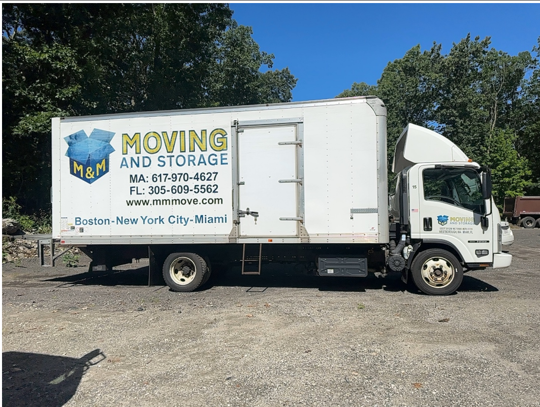
Right / 08-31-2023