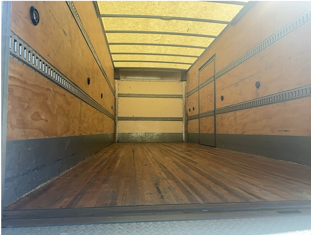
Interior / 08-31-2023