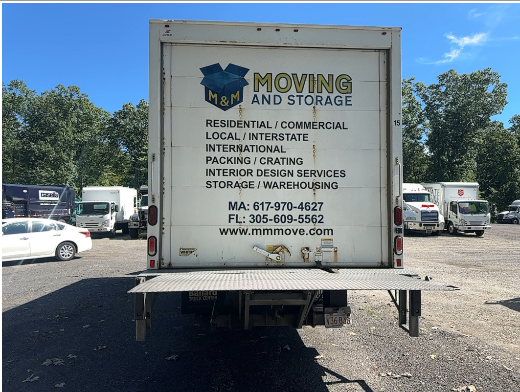
Rear / 08-31-2023