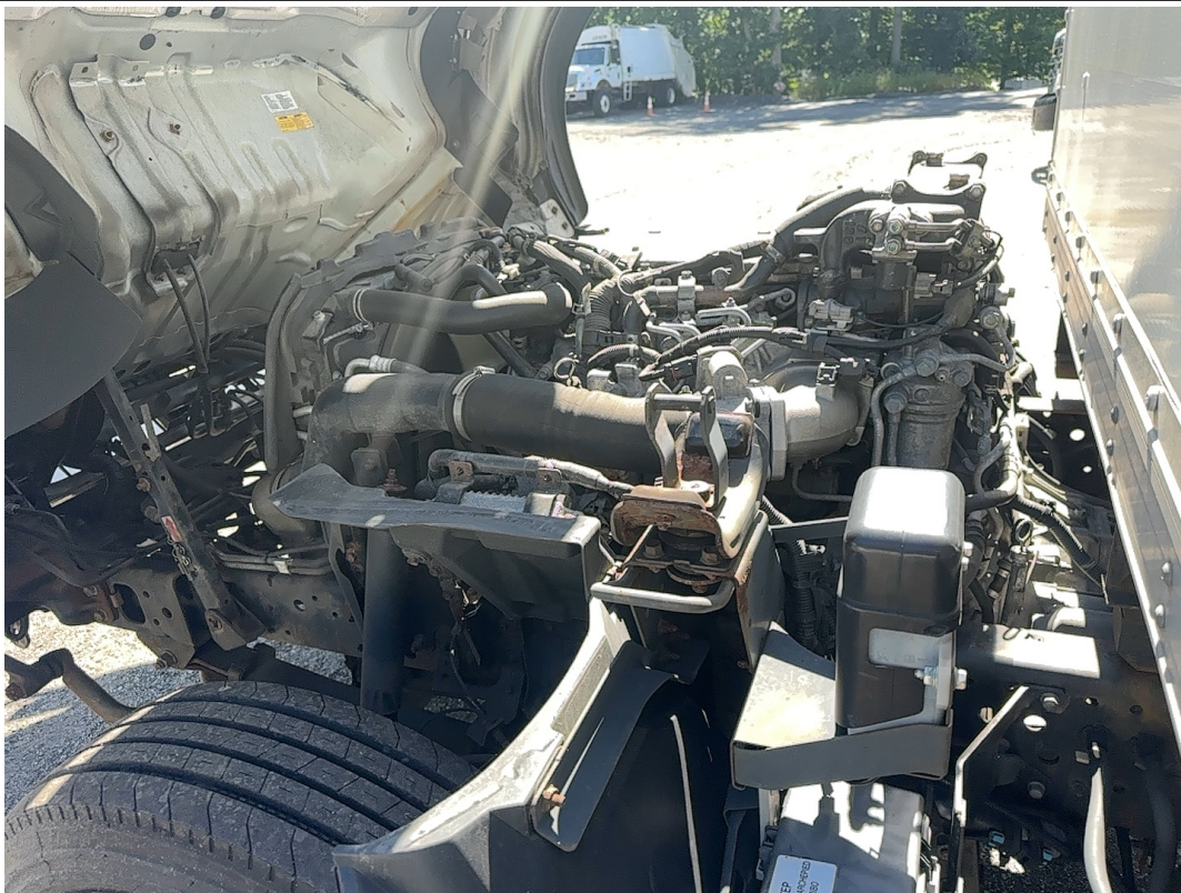
Engine Compartment / 08-31-2023