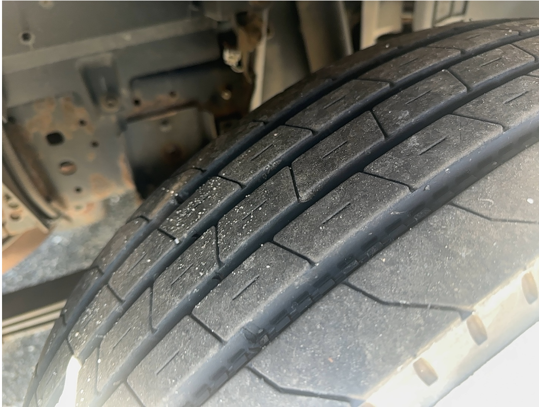
First Right Outer Drive Tire Condition / 08-31-2023