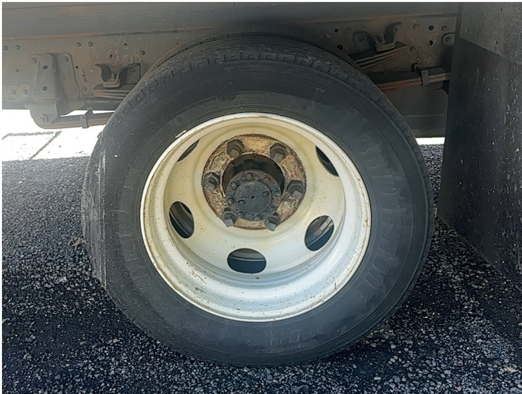
Left Outer Drive Tire Condition / 08-31-2023