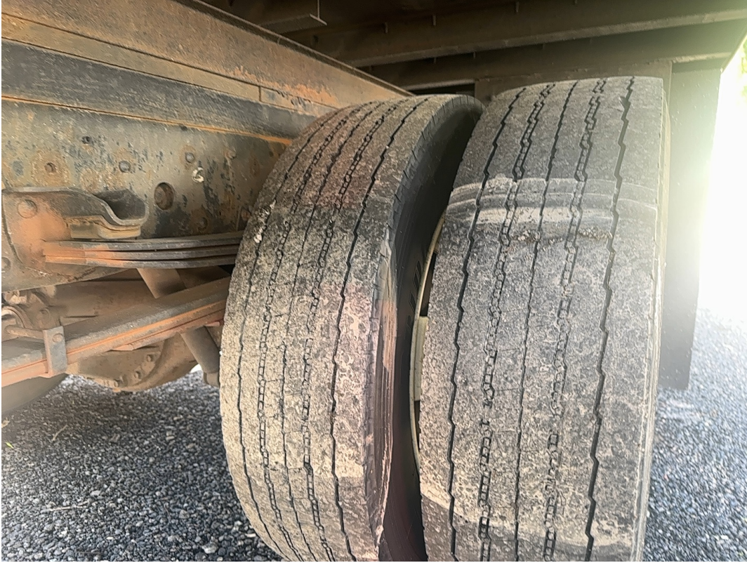
Left Inner Drive Tire Condition / Left Outer Drive Tire Condition / 08-31-2023