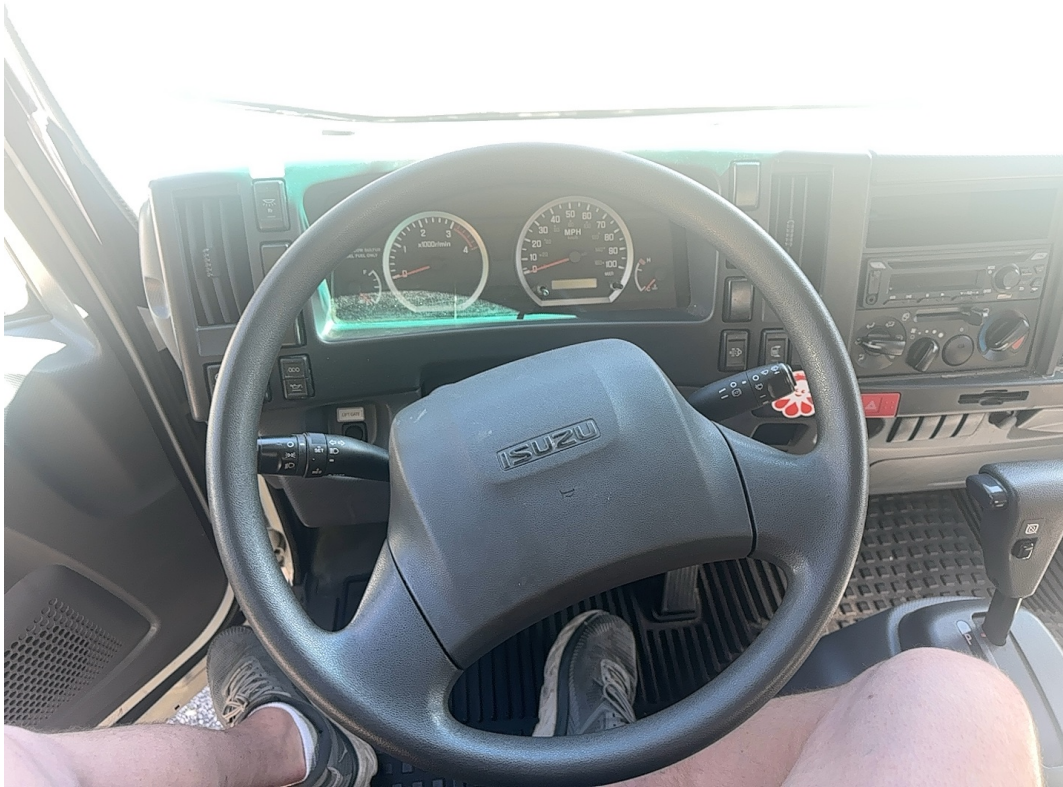
Steering Wheel / 08-31-2023