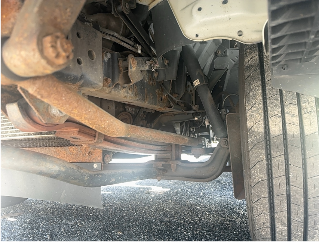
Suspension / Axles / 08-31-2023