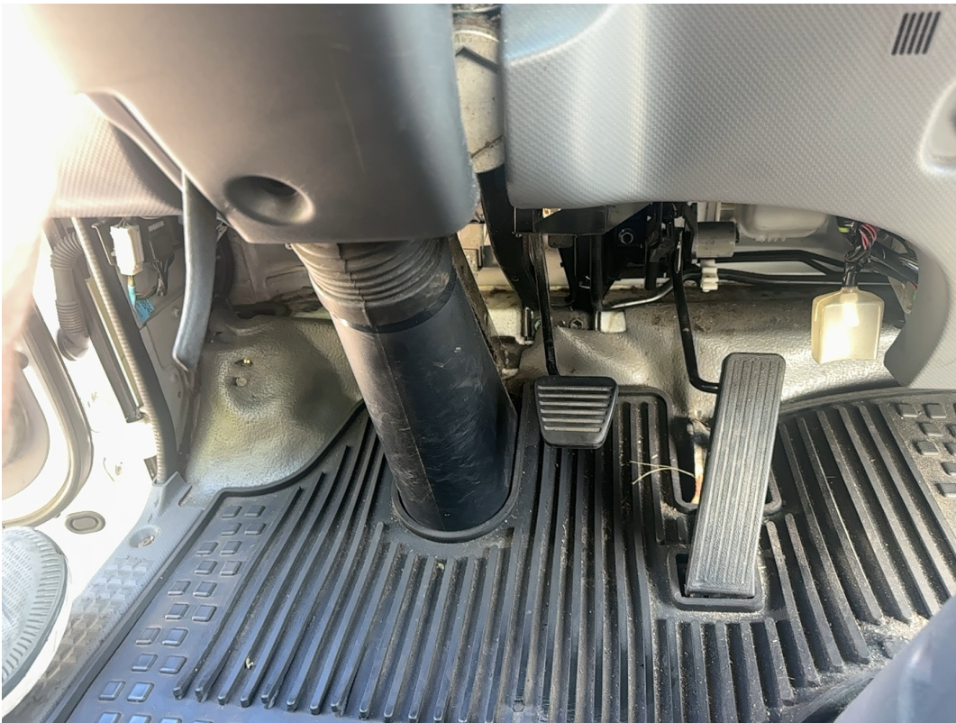
Pedals / Floorboard / 08-31-2023