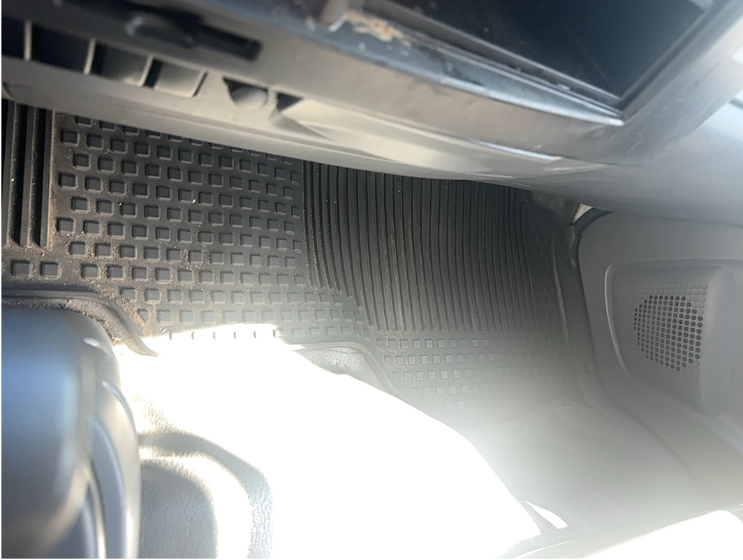
Floorboard / 08-31-2023