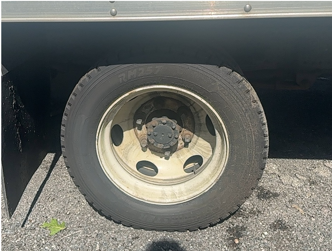
Right Outer Drive Tire Condition / 08-31-2023