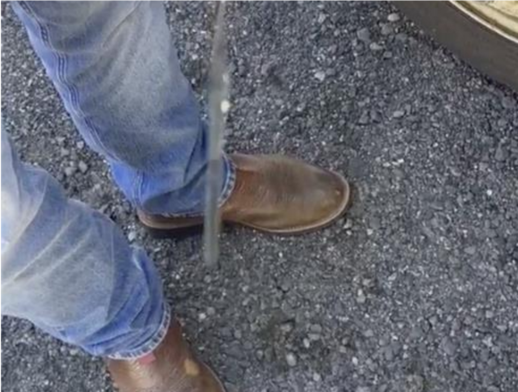
Oil Dipstick / 09-01-2023