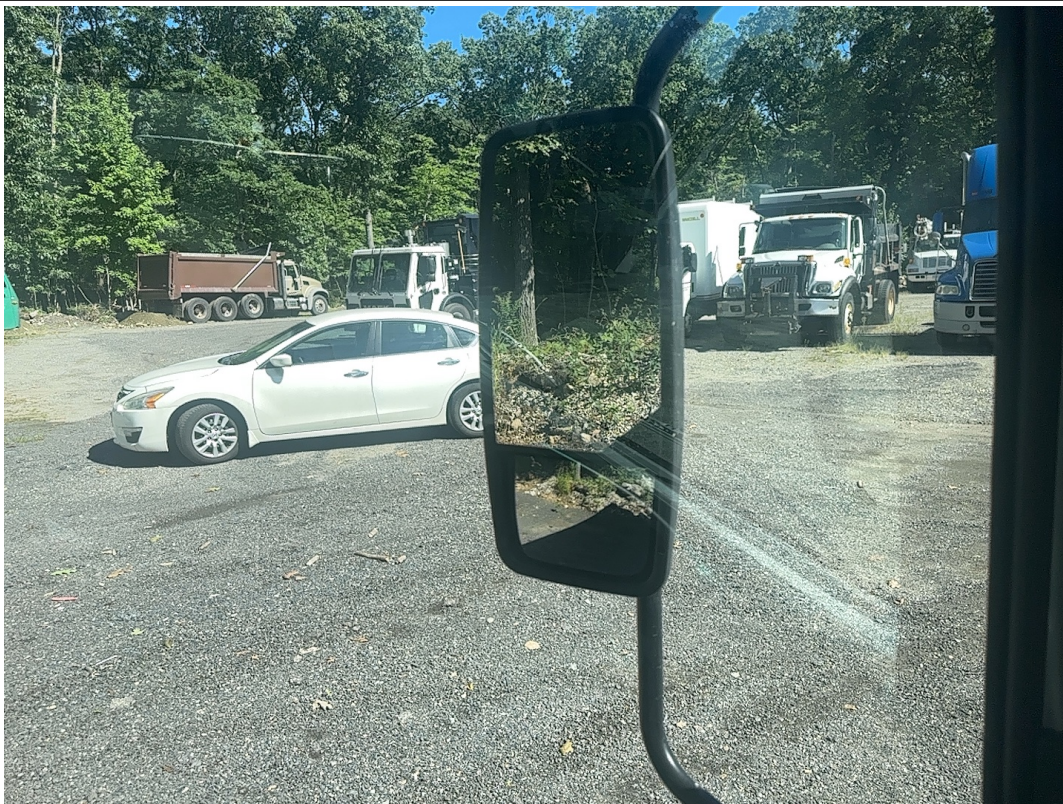
Mirrors / 08-31-2023