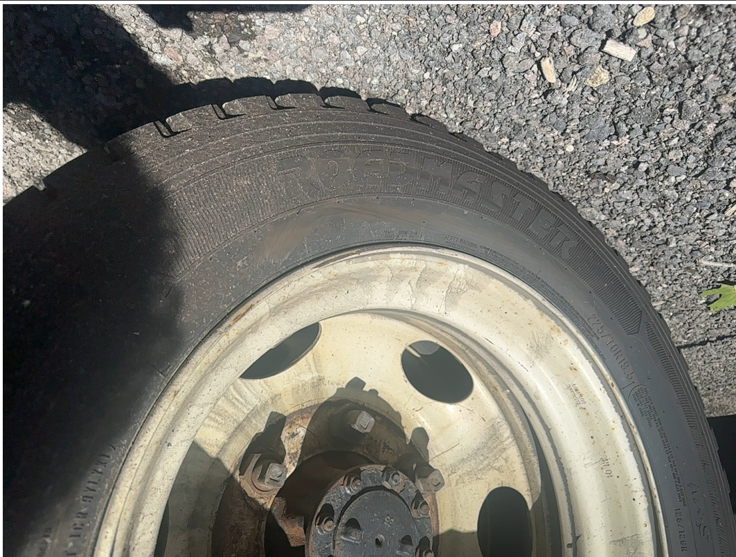
Right Outer Drive Tire Brand / 08-31-2023