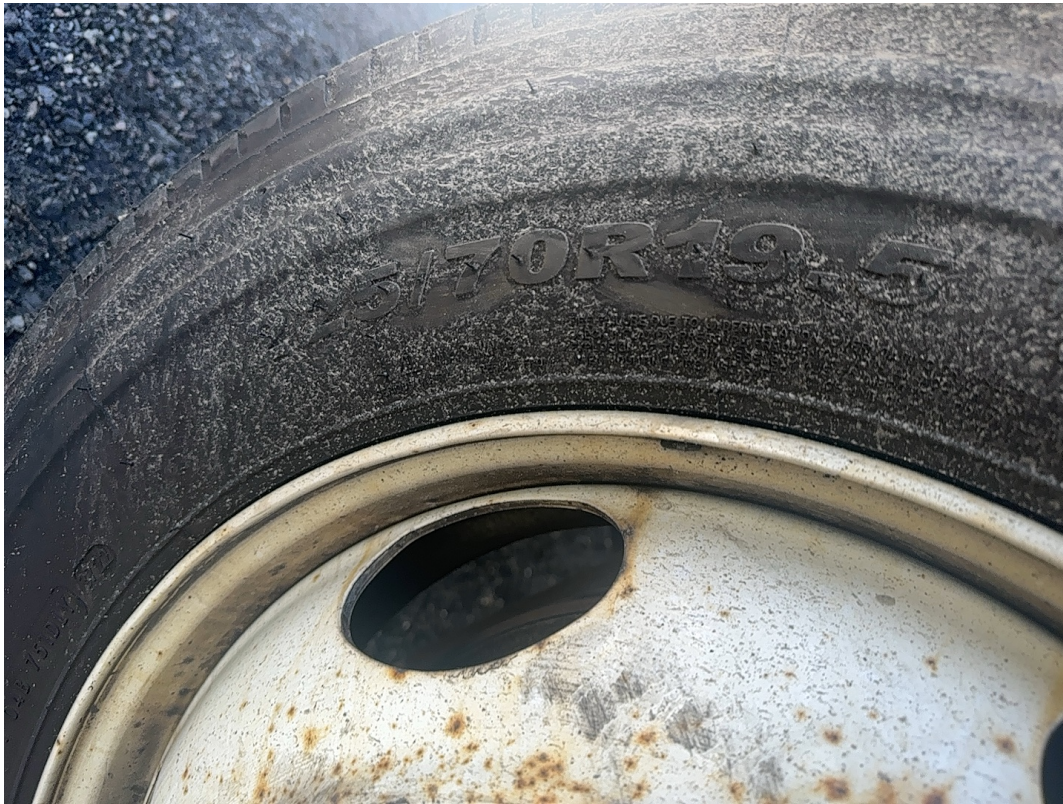
Left Steer Tire Size / 08-31-2023