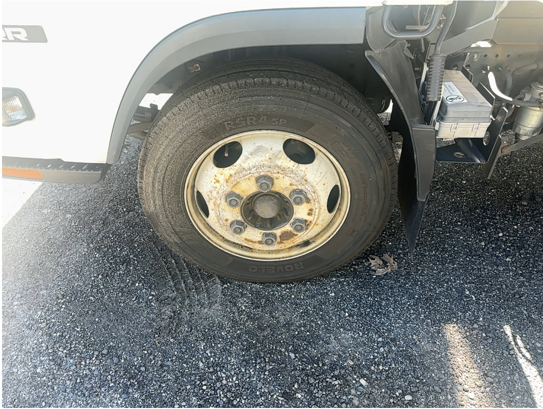
Left Steer Tire Condition / 08-31-2023