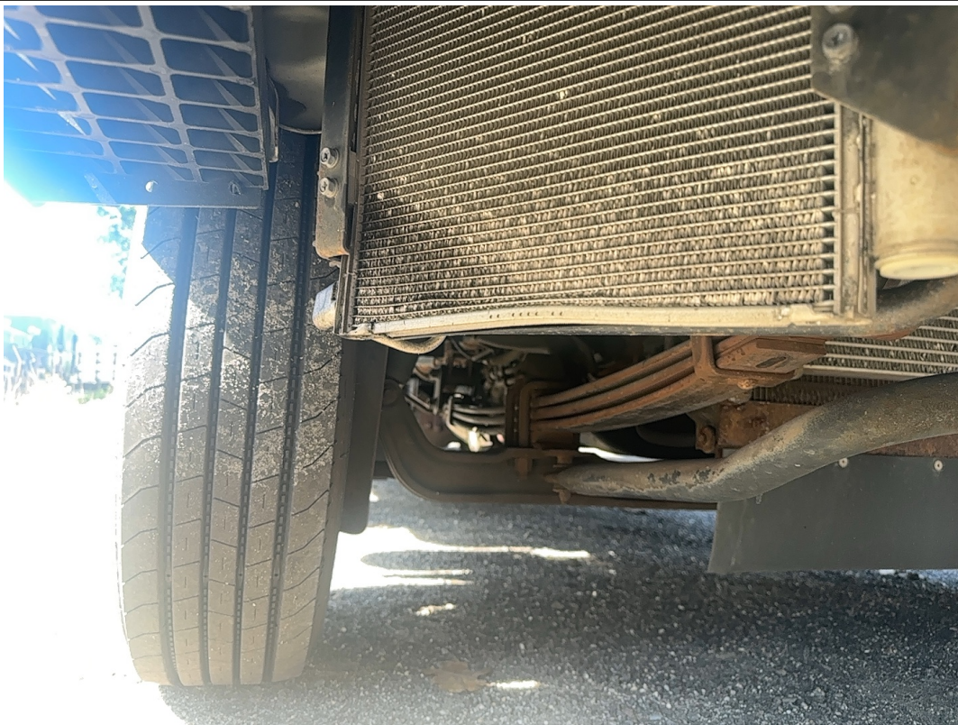
Suspension / Axles / 08-31-2023