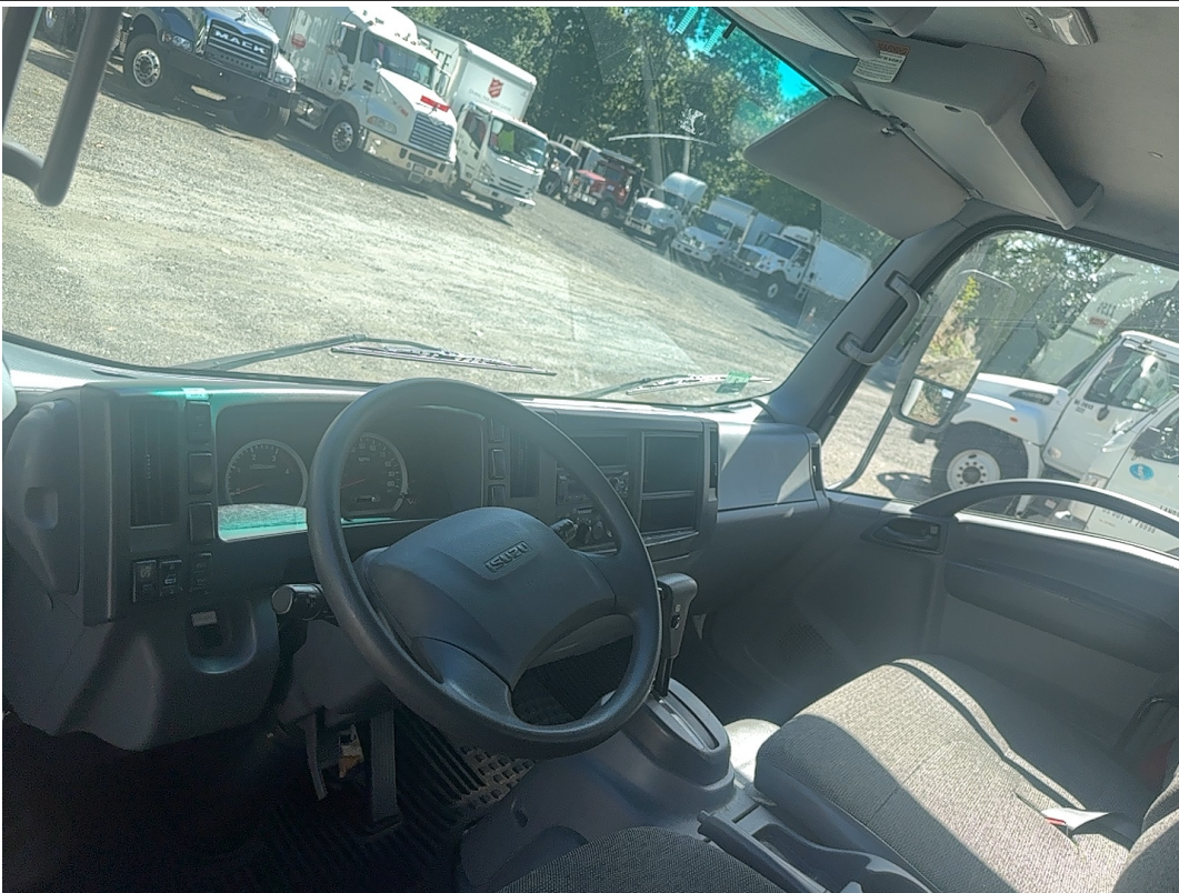
Cab Interior / 08-31-2023