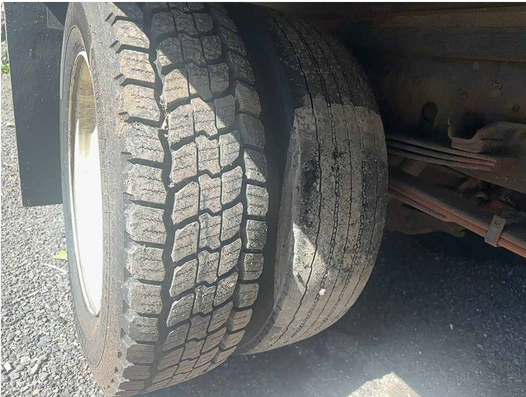
Right Inner Drive Tire Condition / Right Outer Drive Tire Condition / 08-31-2023