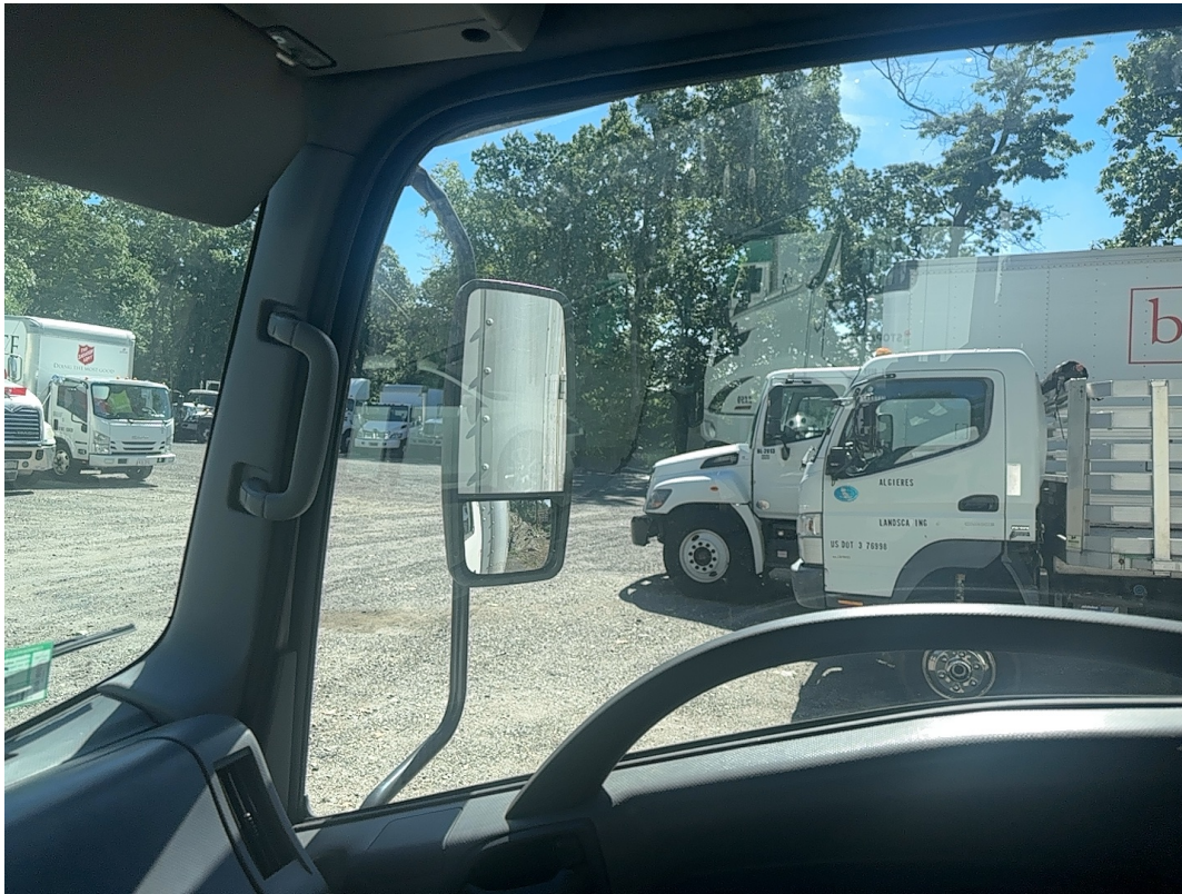
Mirrors / 08-31-2023