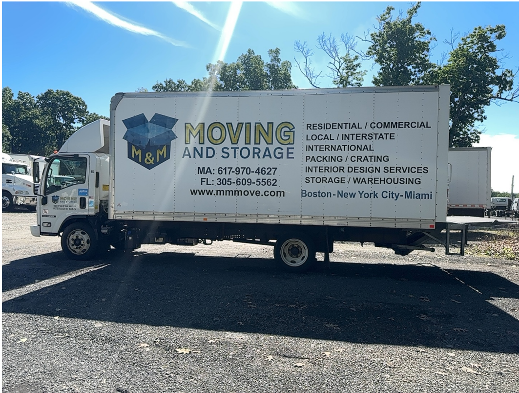
Left / 08-31-2023