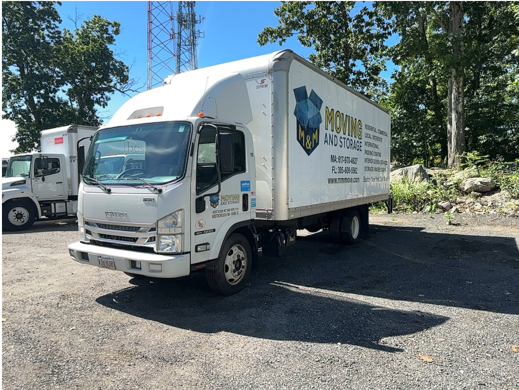
Front Left / 08-31-2023