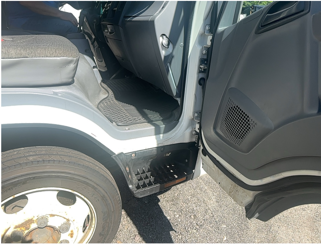
Steps / 08-31-2023