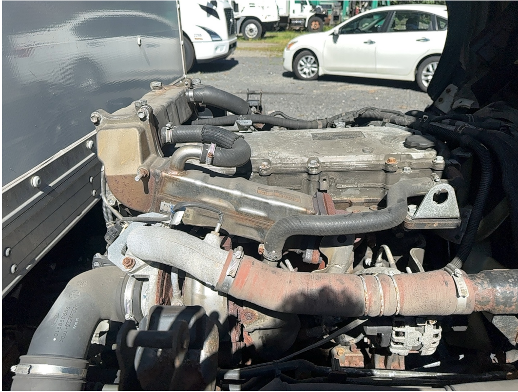
Engine Compartment / 08-31-2023