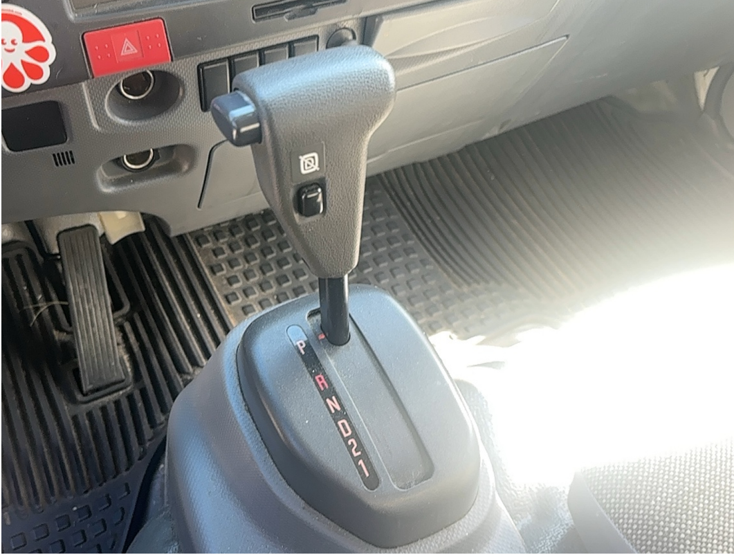
Transmission / 08-31-2023