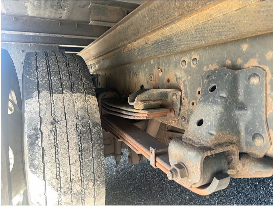
Suspension / Axles / 08-31-2023