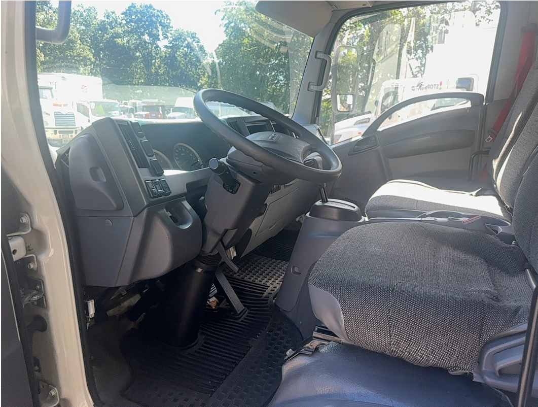
Cab Interior / 08-31-2023