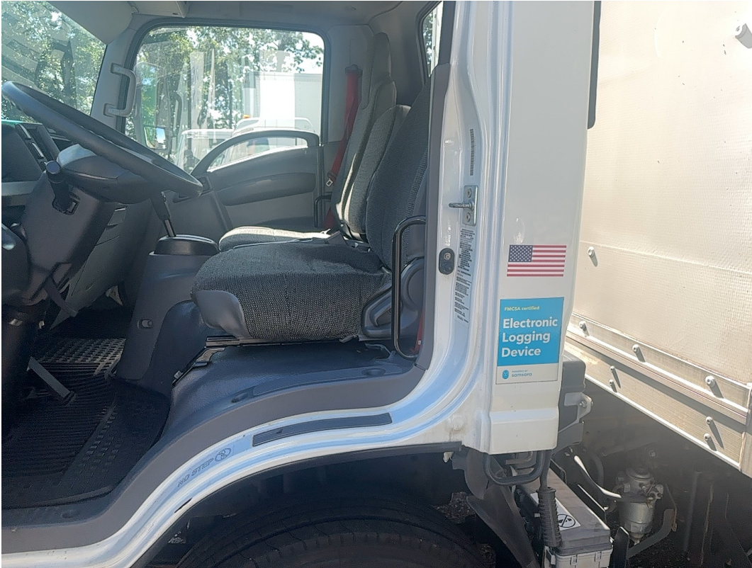
Handrails / 08-31-2023