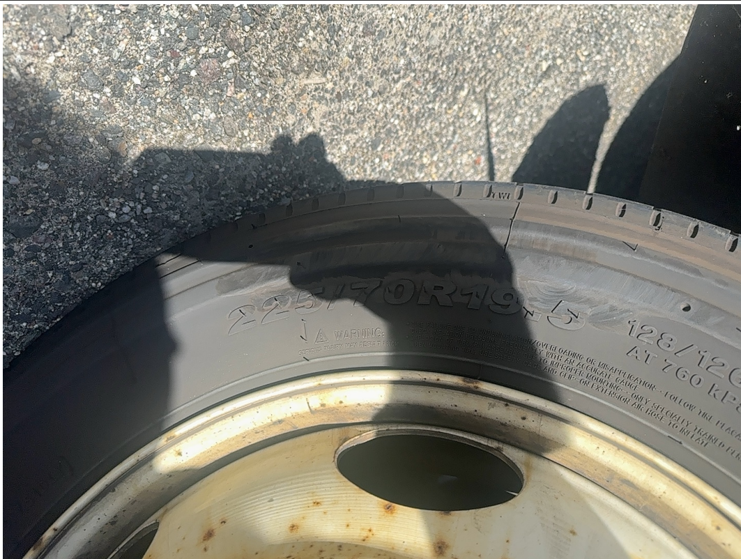
Right Steer Tire Size / 08-31-2023