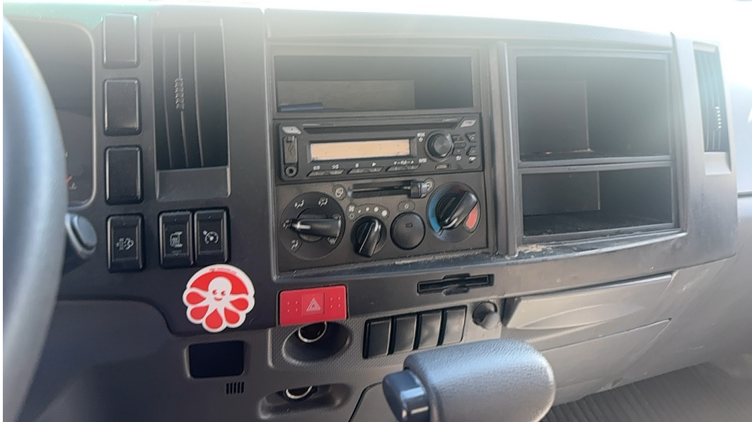
Radio / A/C / Switches and Controls / 08-31-2023