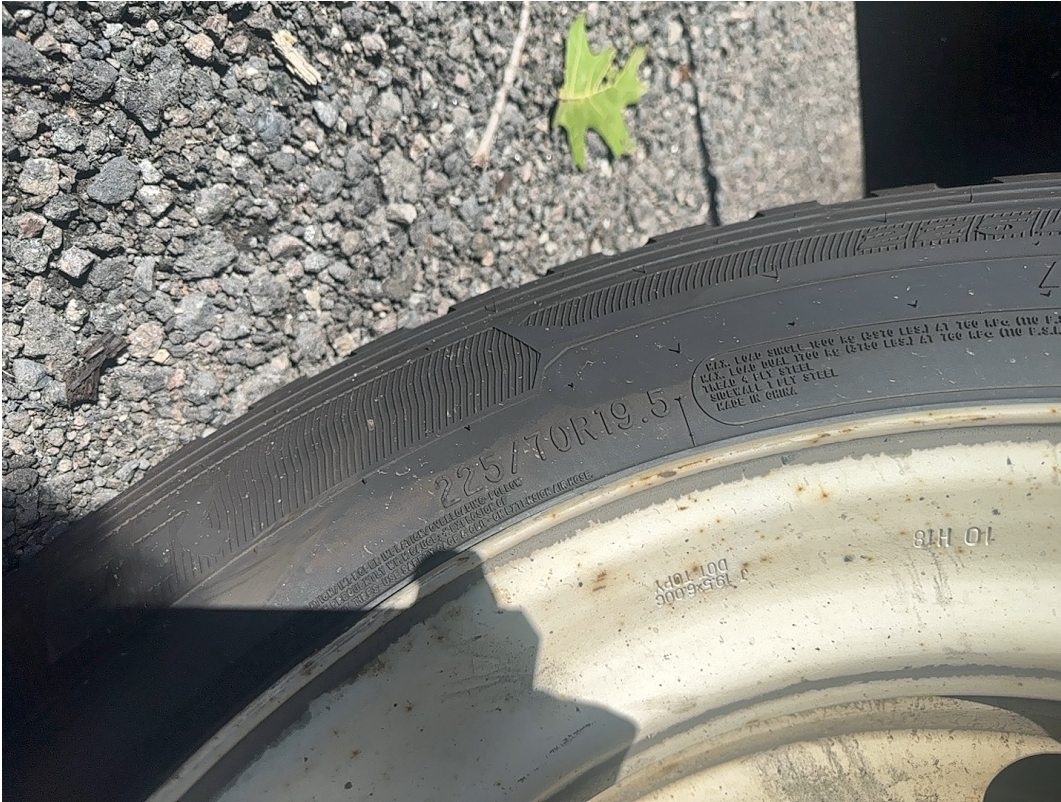
Right Outer Drive Tire Size / 08-31-2023