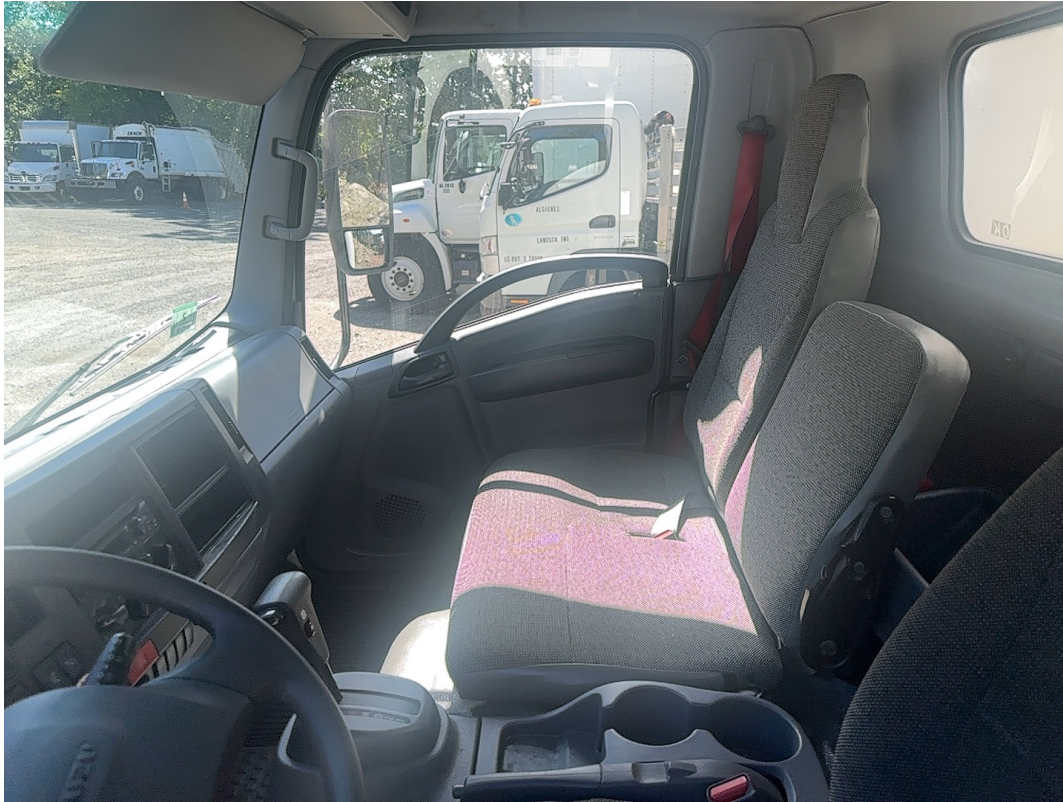
Passenger's Seat / 08-31-2023