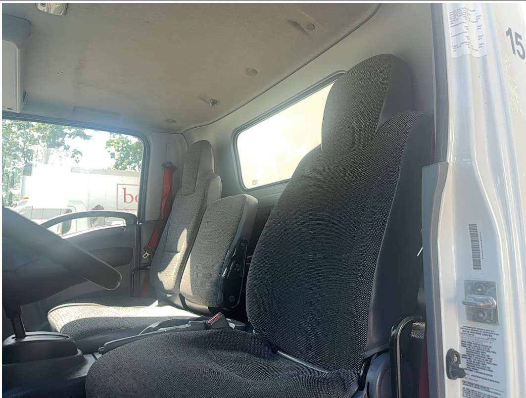
Driver's Seat / 08-31-2023