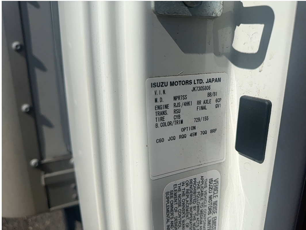
Transmission Information / 08-31-2023