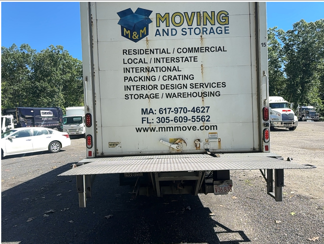
Rear Lights / 08-31-2023