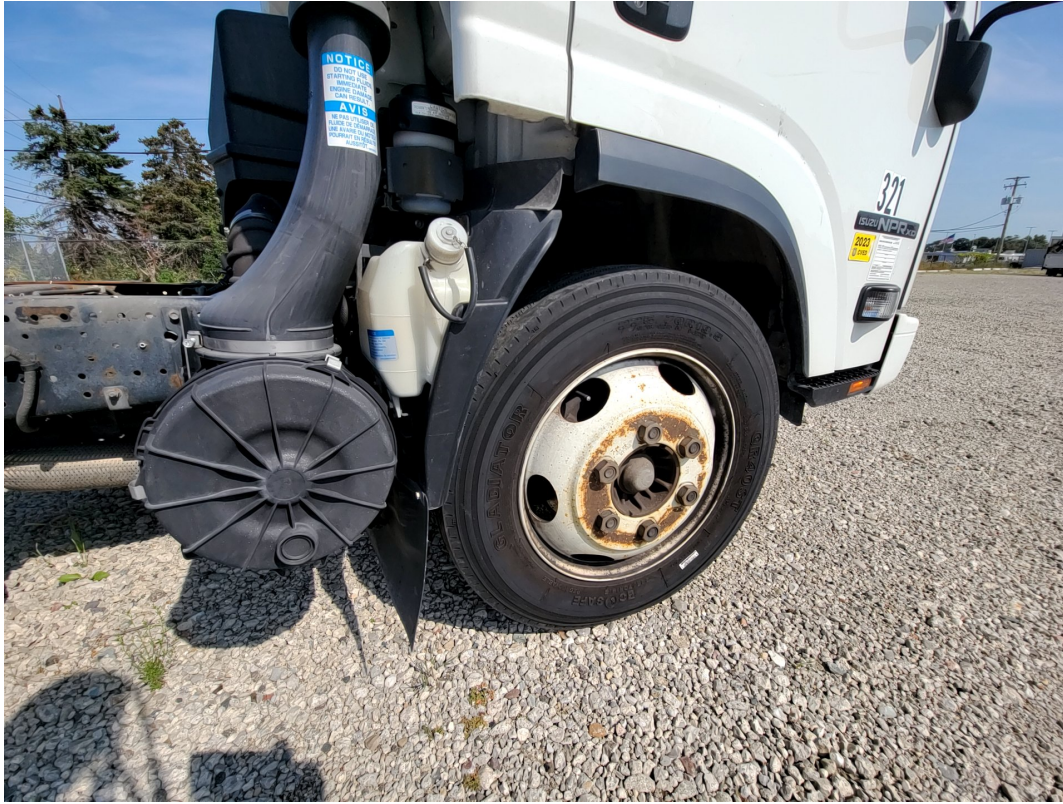
Right Steer Tire Condition / 09-21-2023