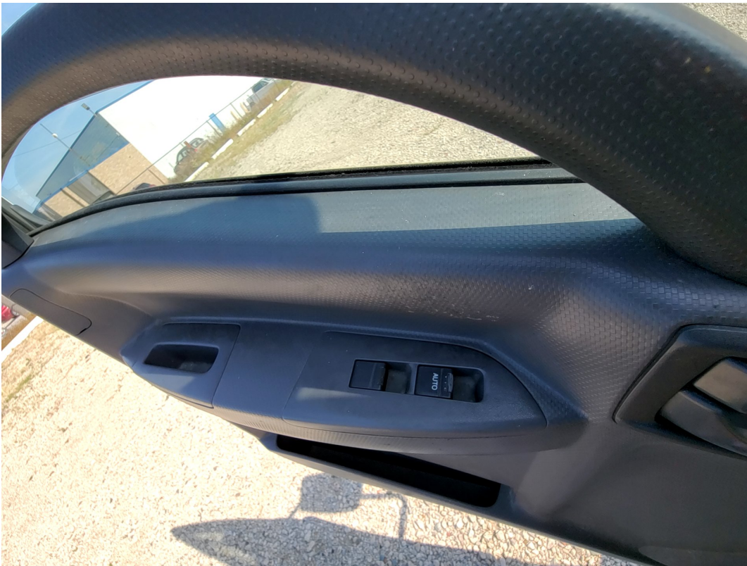
Switches and Controls / 09-21-2023