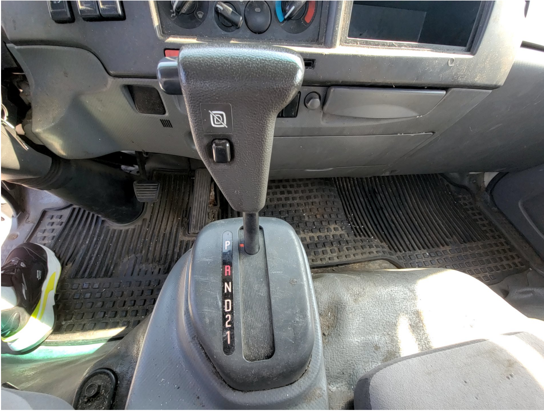
Transmission Type / 09-21-2023