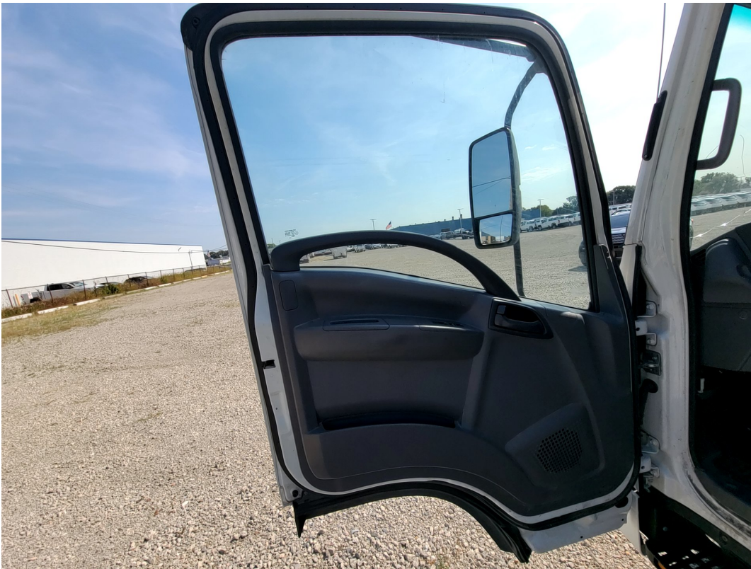
Handrails / 09-21-2023