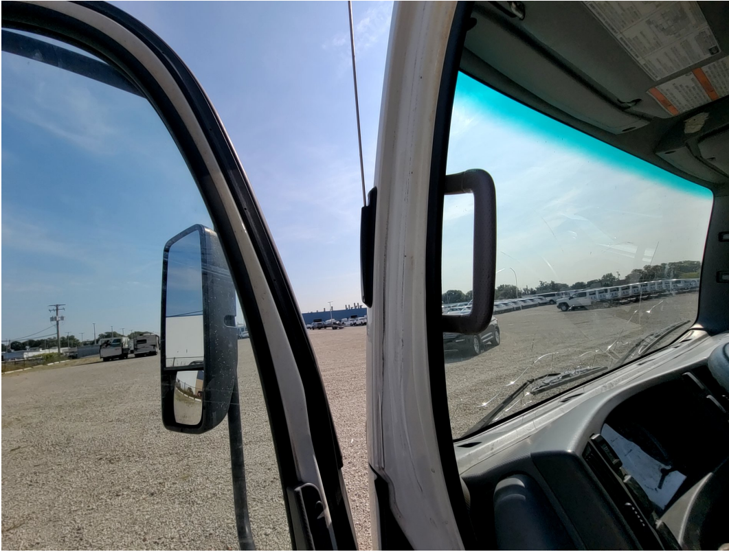
Handrails / 09-21-2023