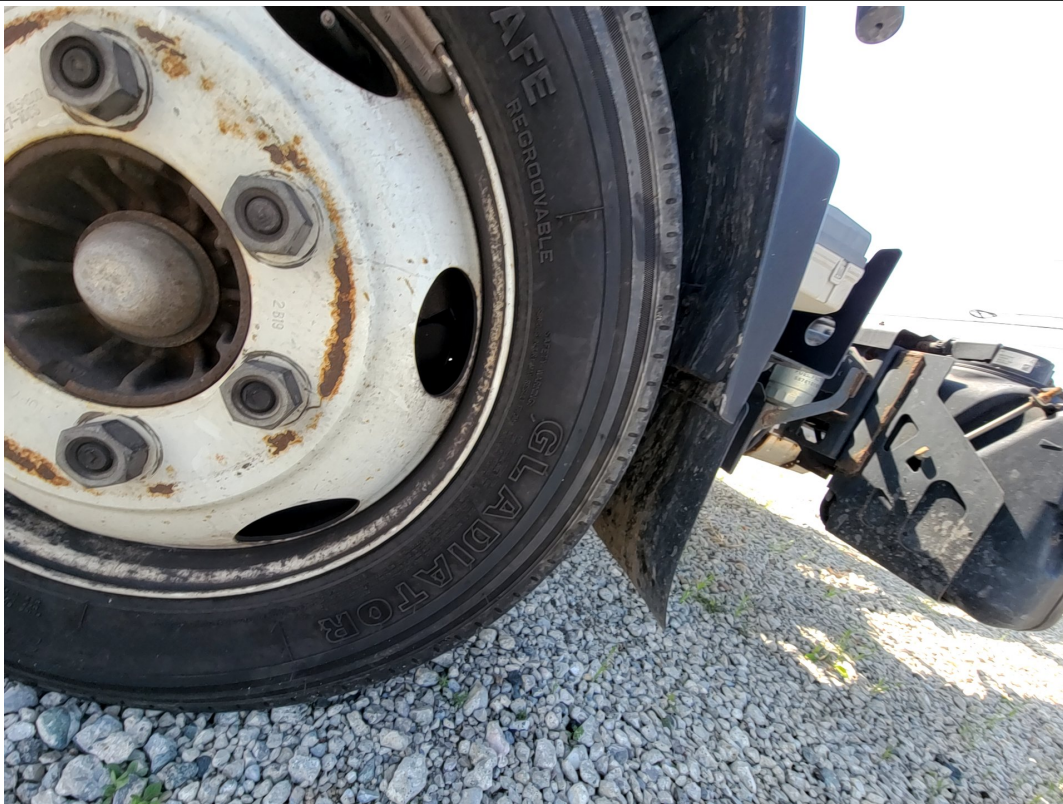
Left Steer Tire Brand / 09-21-2023