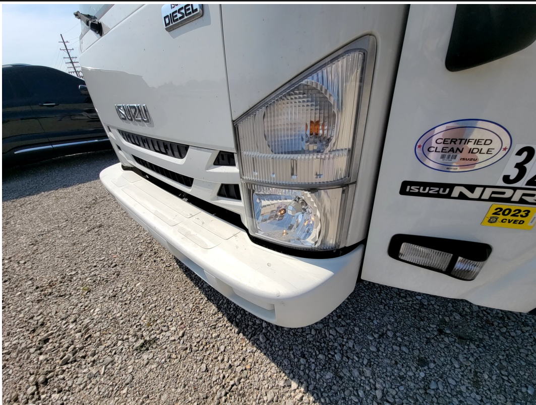
Front Lights / 09-21-2023