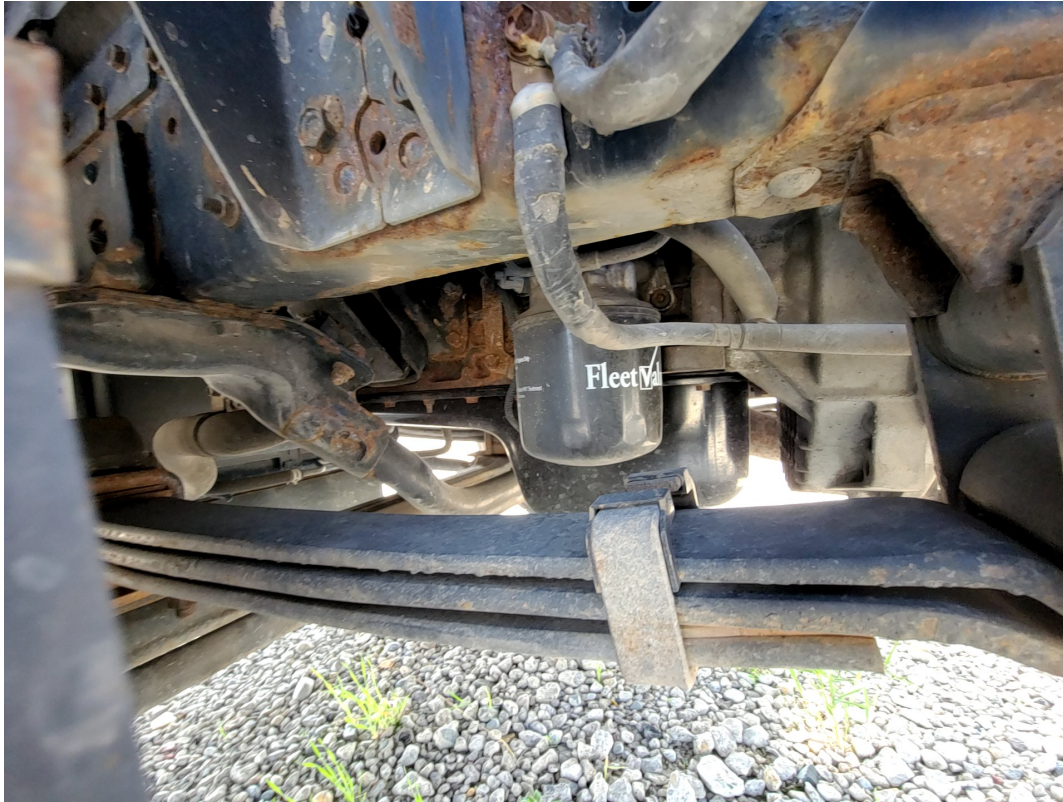
Suspension / Axles / 09-21-2023