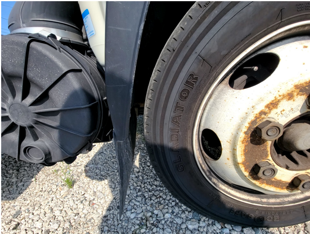
Right Steer Tire Brand / 09-21-2023