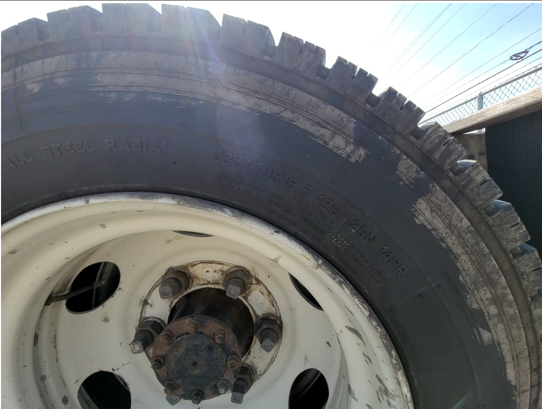
Left Outer Drive tire Size / 09-21-2023