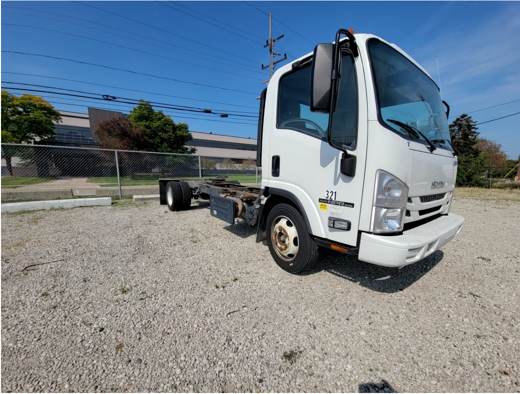
Front Right / 09-21-2023