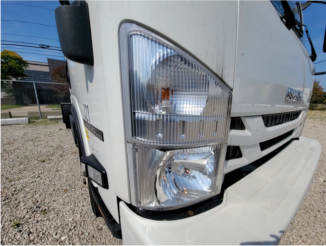
Front Lights / 09-21-2023