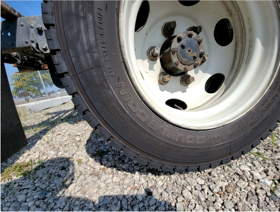
Right Outer Drive Tire Brand / 09-21-2023