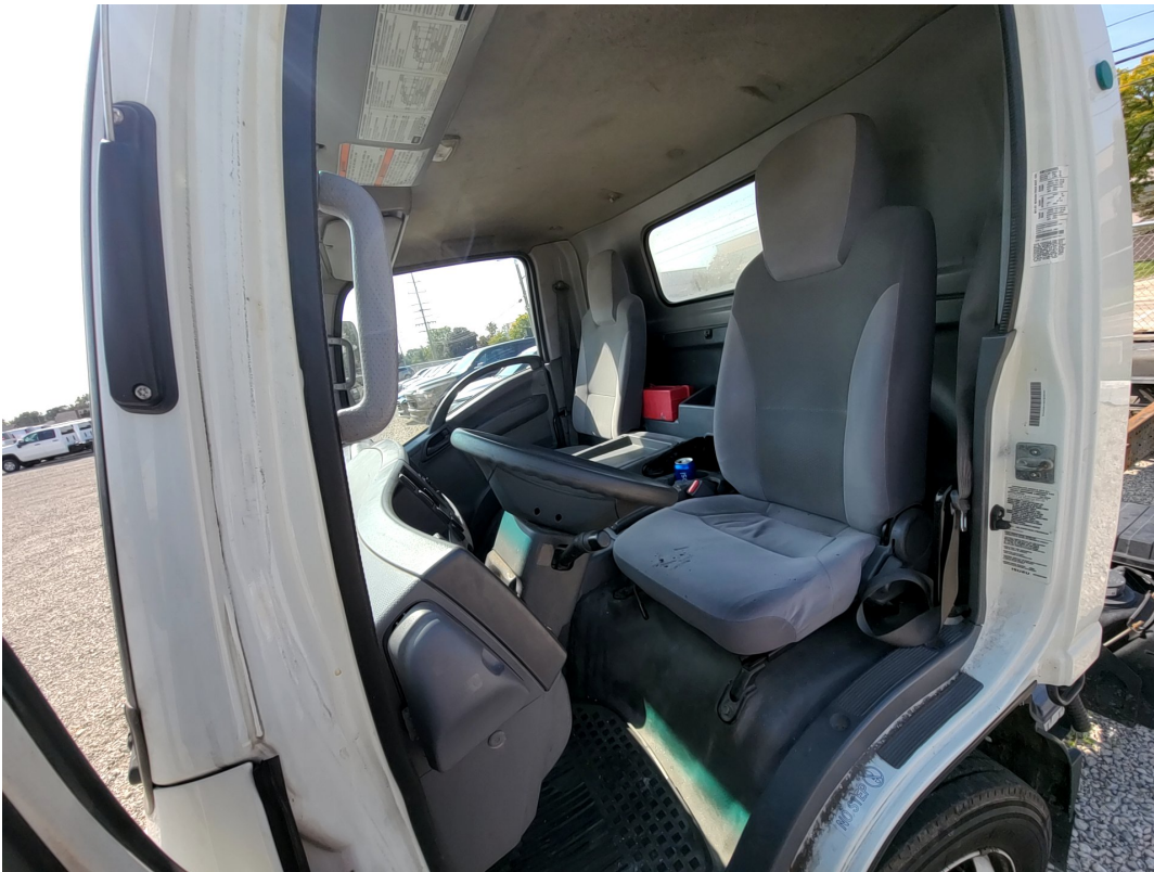
Driver's Seat / 09-21-2023