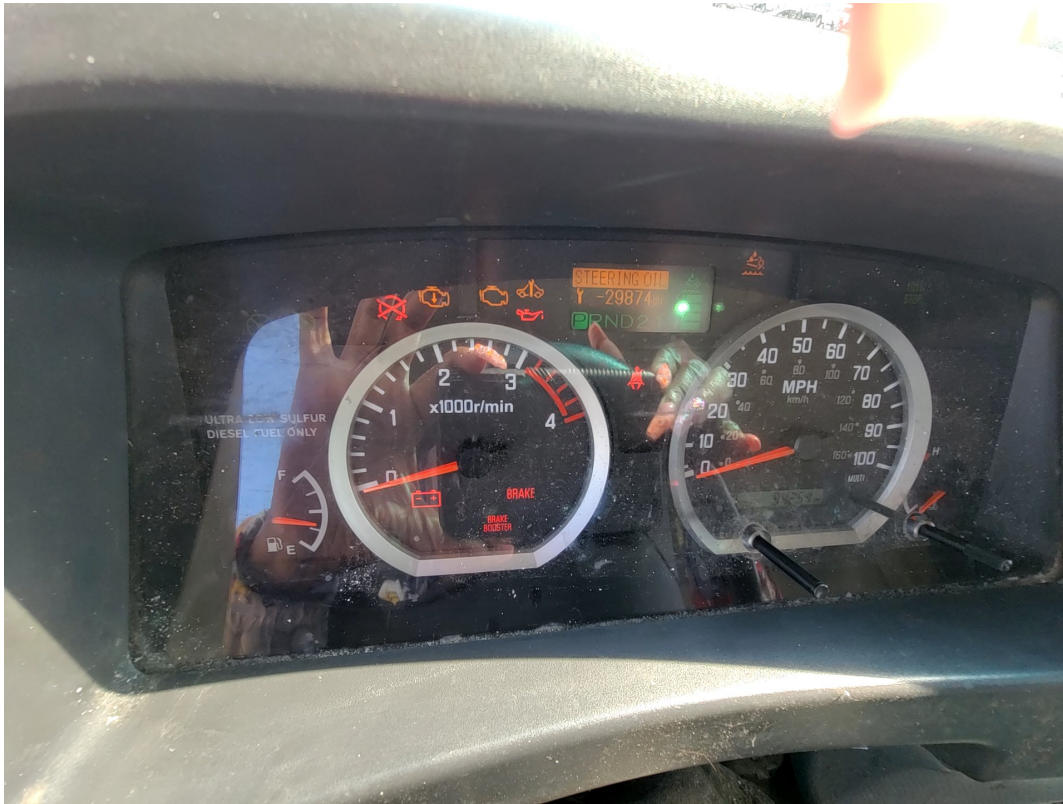
EMS Warning Lights / 09-21-2023