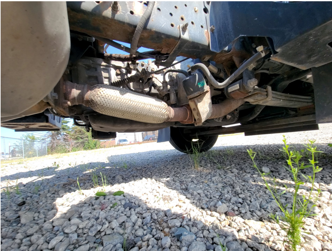
Exhaust / 09-21-2023