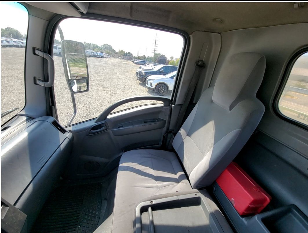
Passenger's Seat / 09-21-2023