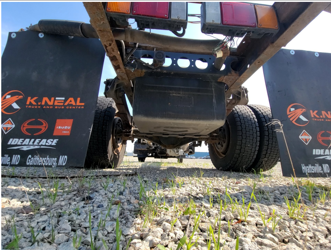
Suspension / Axles / 09-21-2023