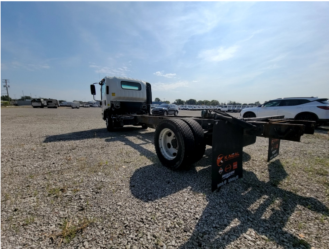
Rear Left / 09-21-2023