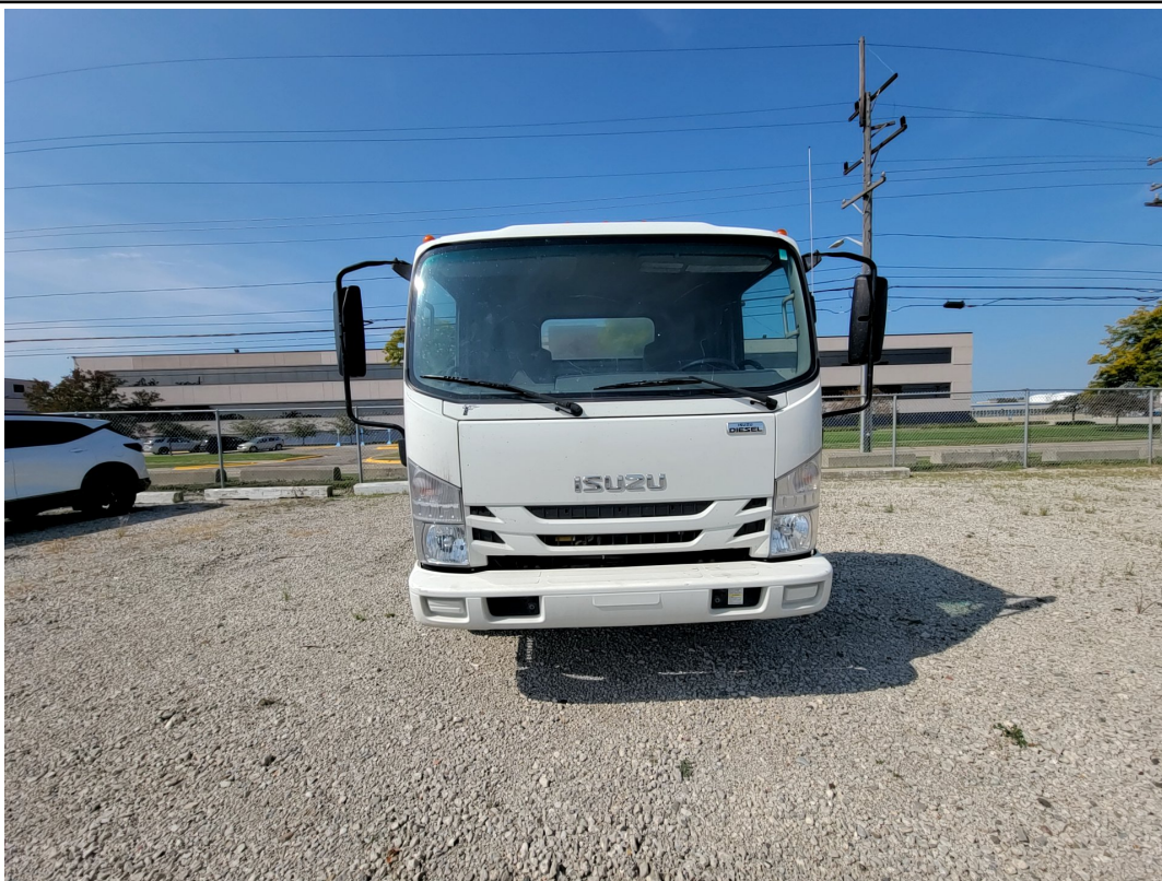
Front / 09-21-2023