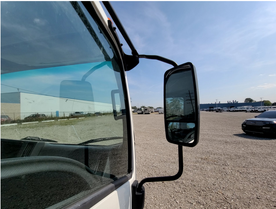
Mirrors / 09-21-2023