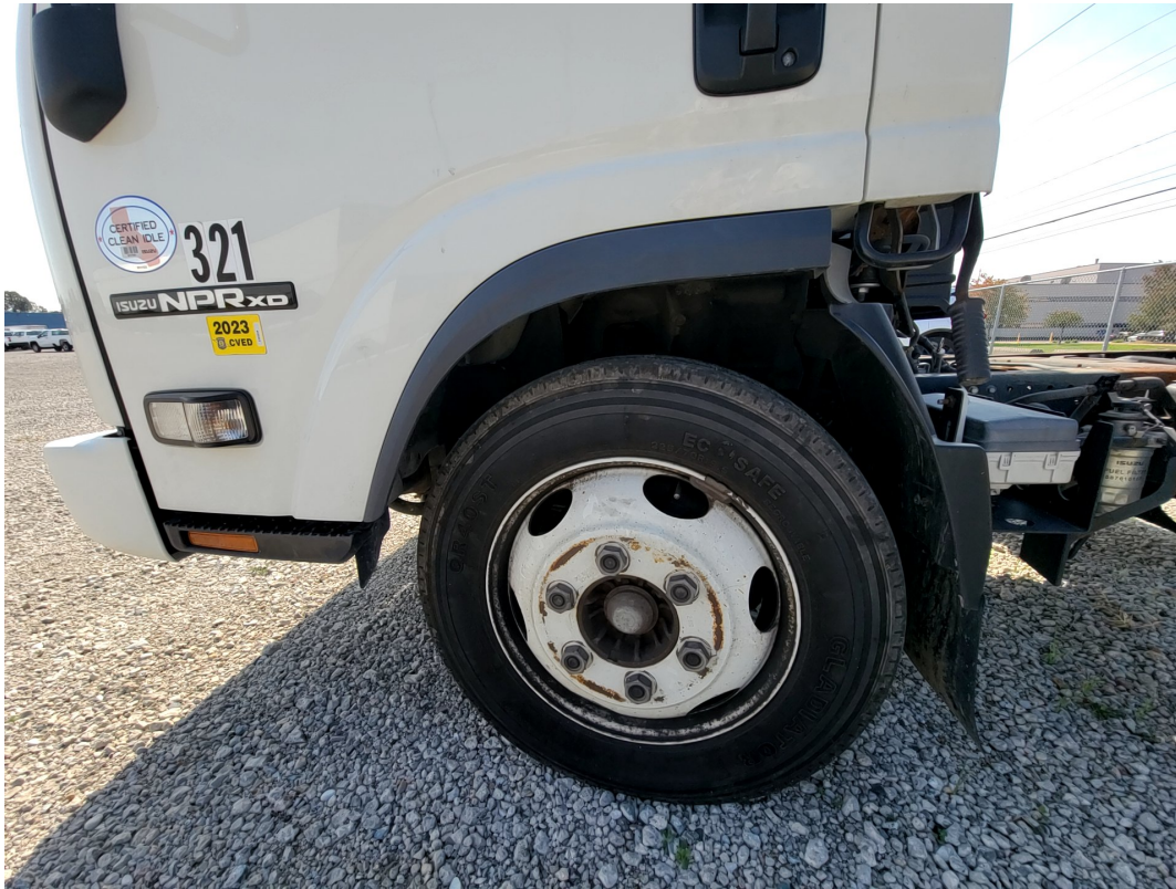
Left Steer Tire Condition / 09-21-2023