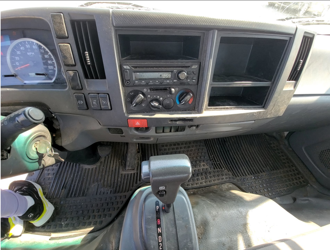
Switches and Controls / A/C / Radio / 09-21-2023