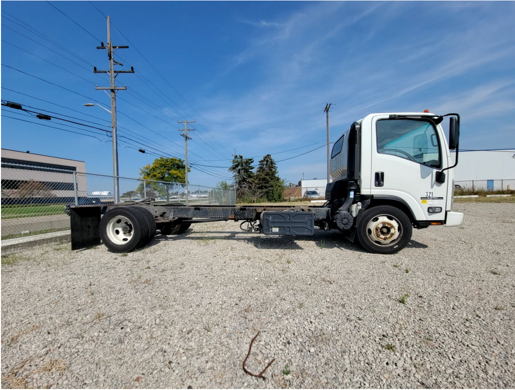
Right / 09-21-2023