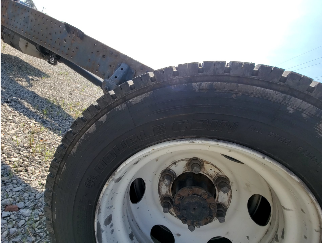
Left Outer Drive tire Brand / 09-21-2023