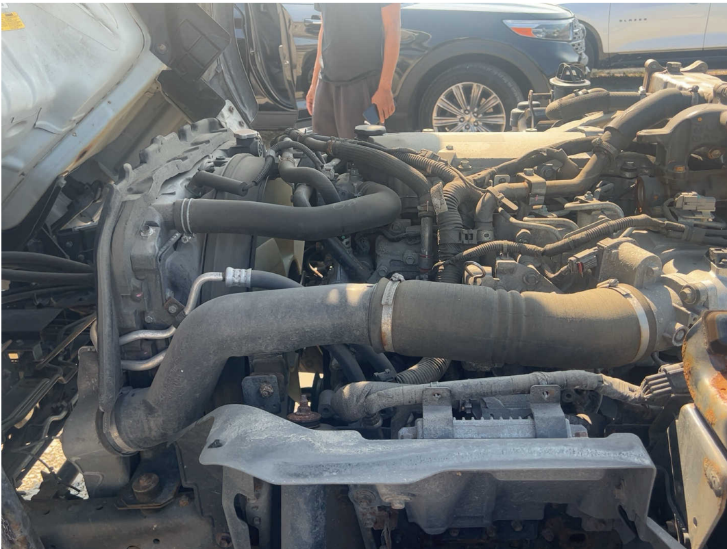
Engine Compartment / 09-21-2023