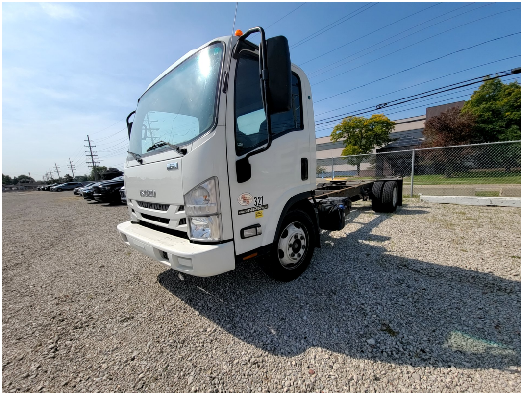
Front Left / 09-21-2023