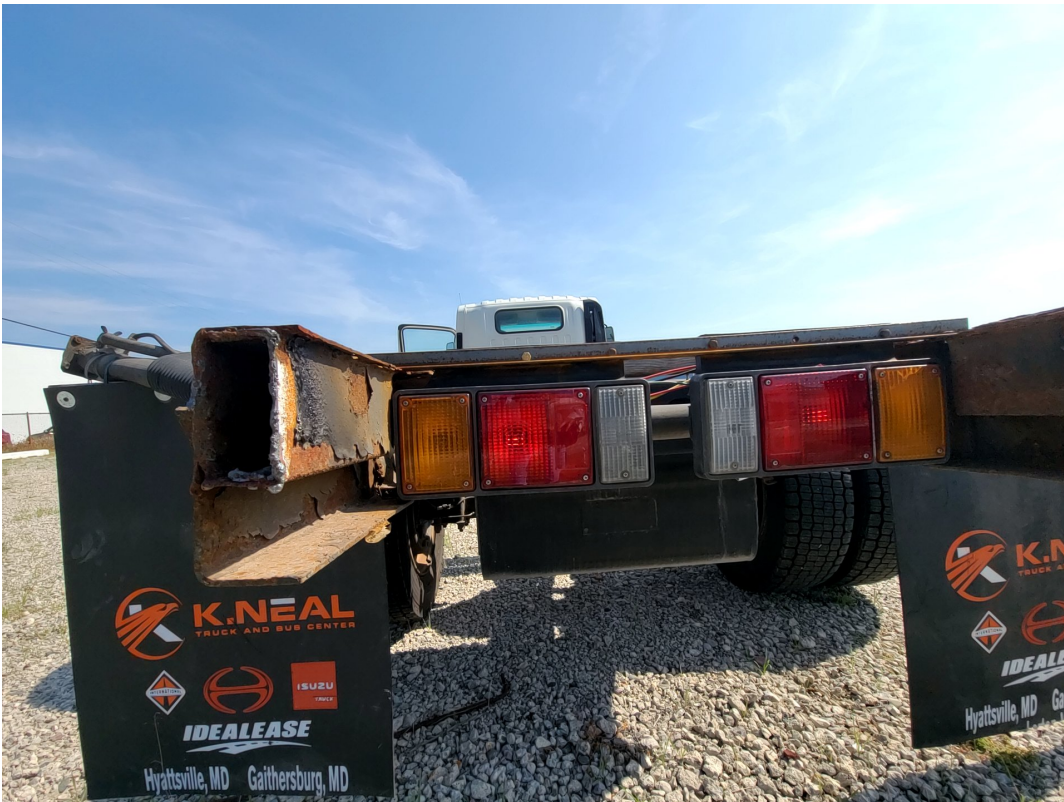
Rear Lights / 09-21-2023