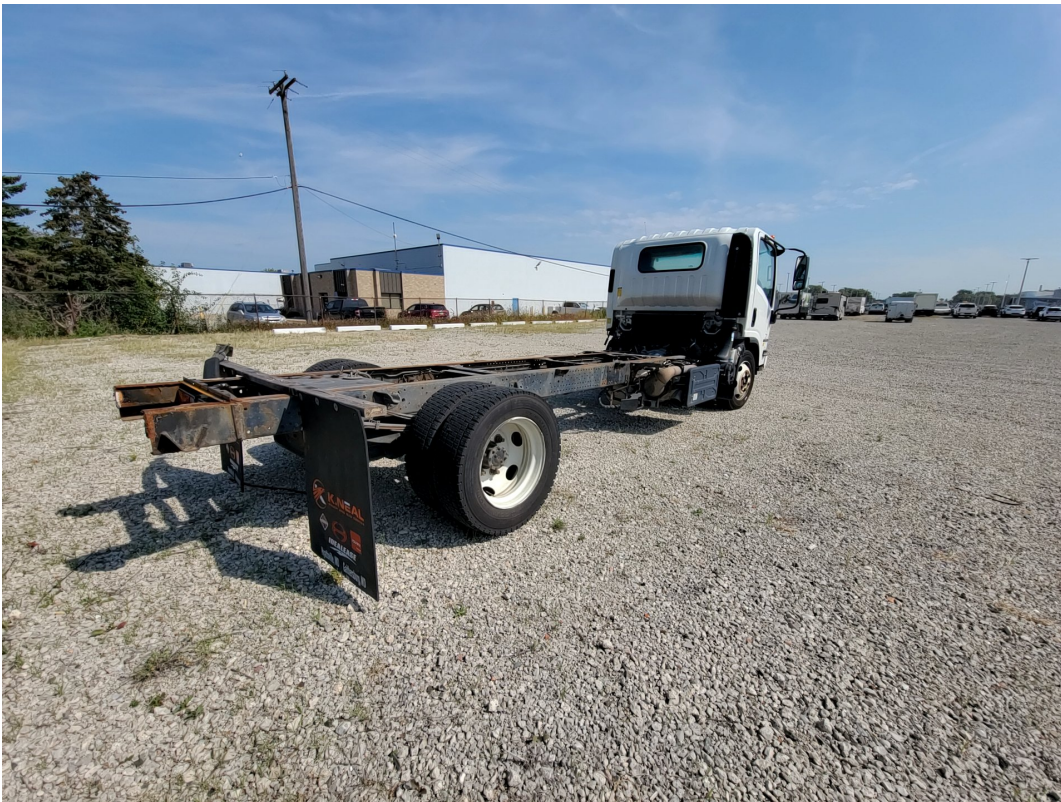
Rear Right / 09-21-2023