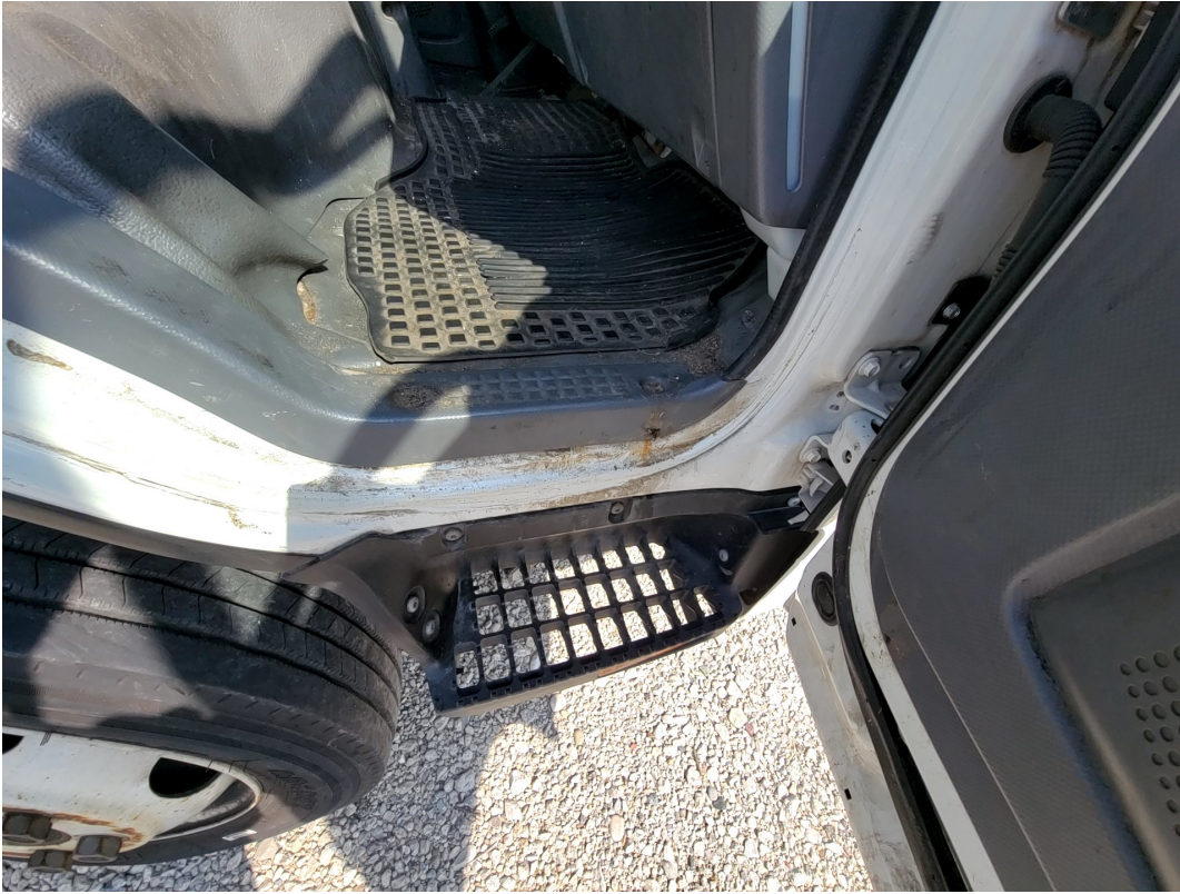
Steps / 09-21-2023