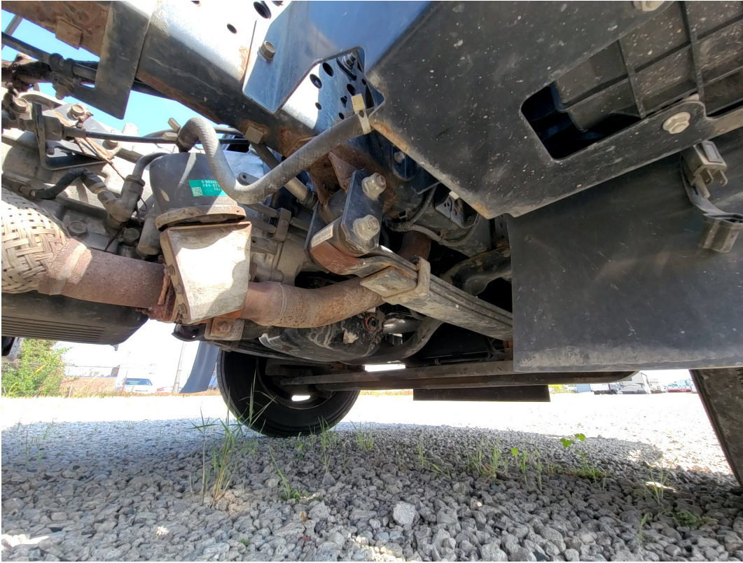
Suspension / Axles / 09-21-2023