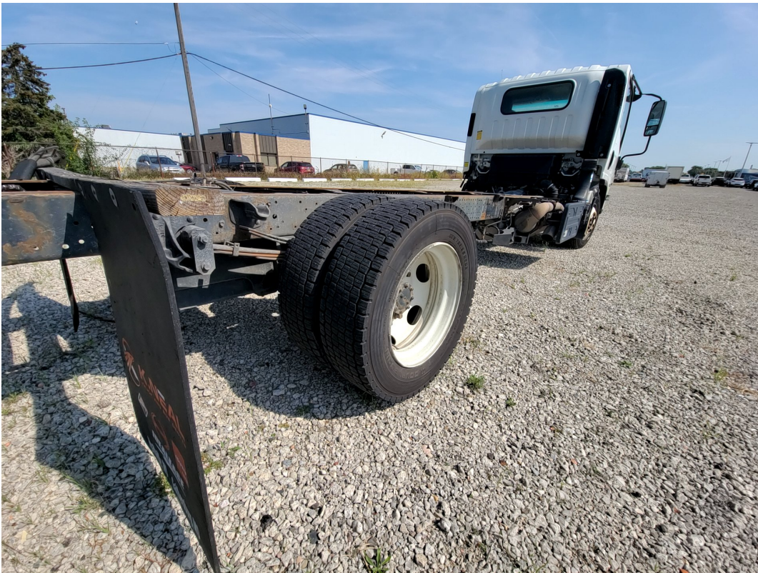
Right Outer Drive Tire Condition / Right Inner Drive Tire Condition / 09-21-2023