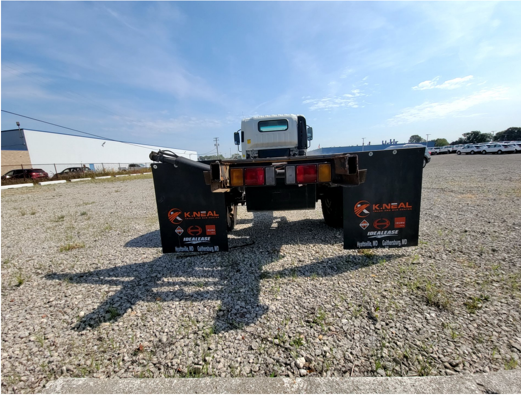
Rear / 09-21-2023