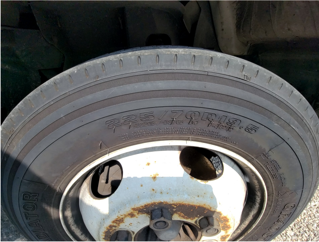
Right Steer Tire Size / 09-21-2023