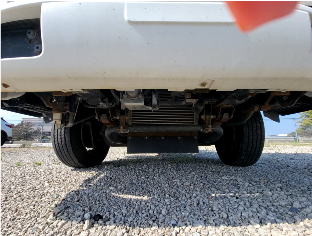
Axles / 09-21-2023