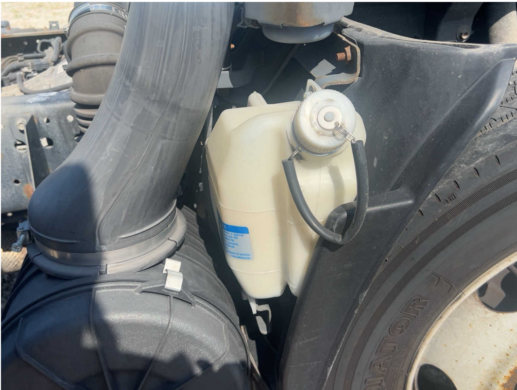
Coolant Level / 09-21-2023