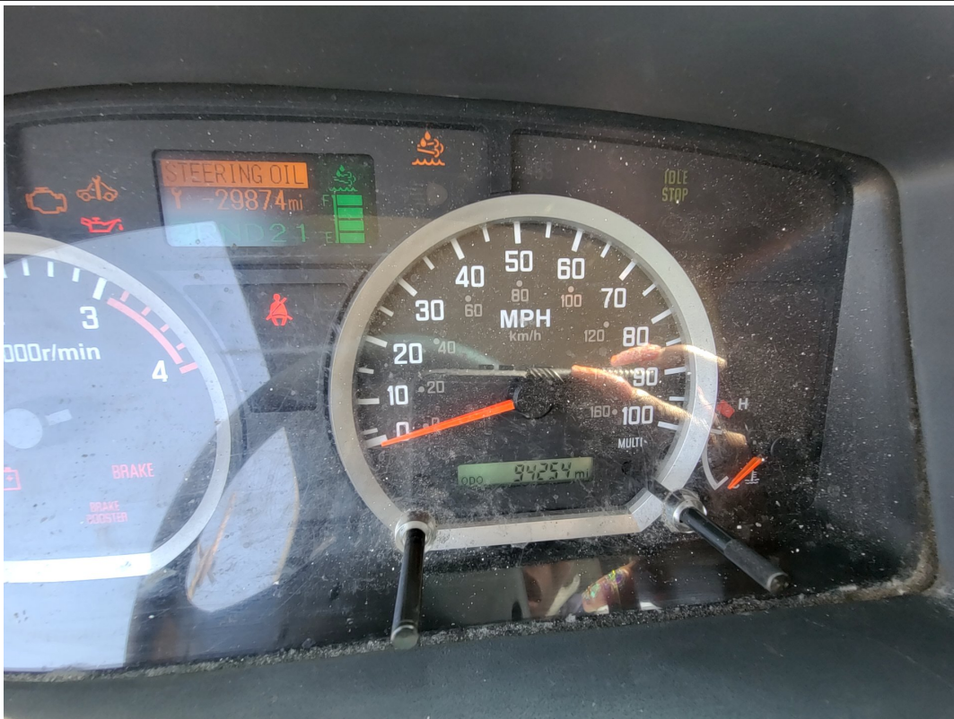
Odometer: 94,254 / 09-21-2023