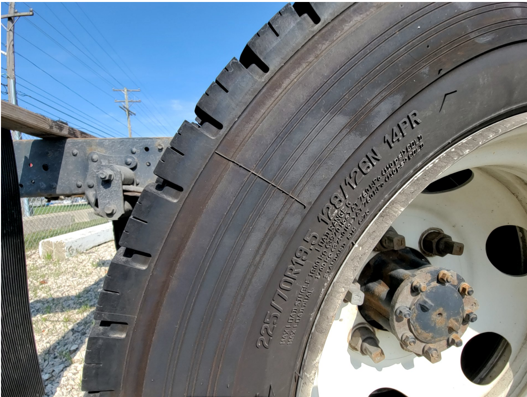
Right Outer Drive Tire Size / 09-21-2023