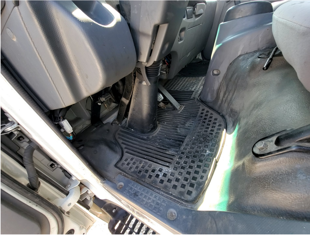
Floorboard / 09-21-2023