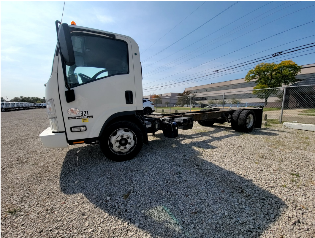
Left / 09-21-2023