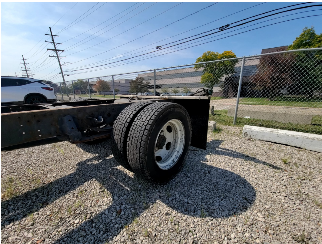
Left Outer Drive tire Condition / Left Inner Drive tire Condition / 09-21-2023