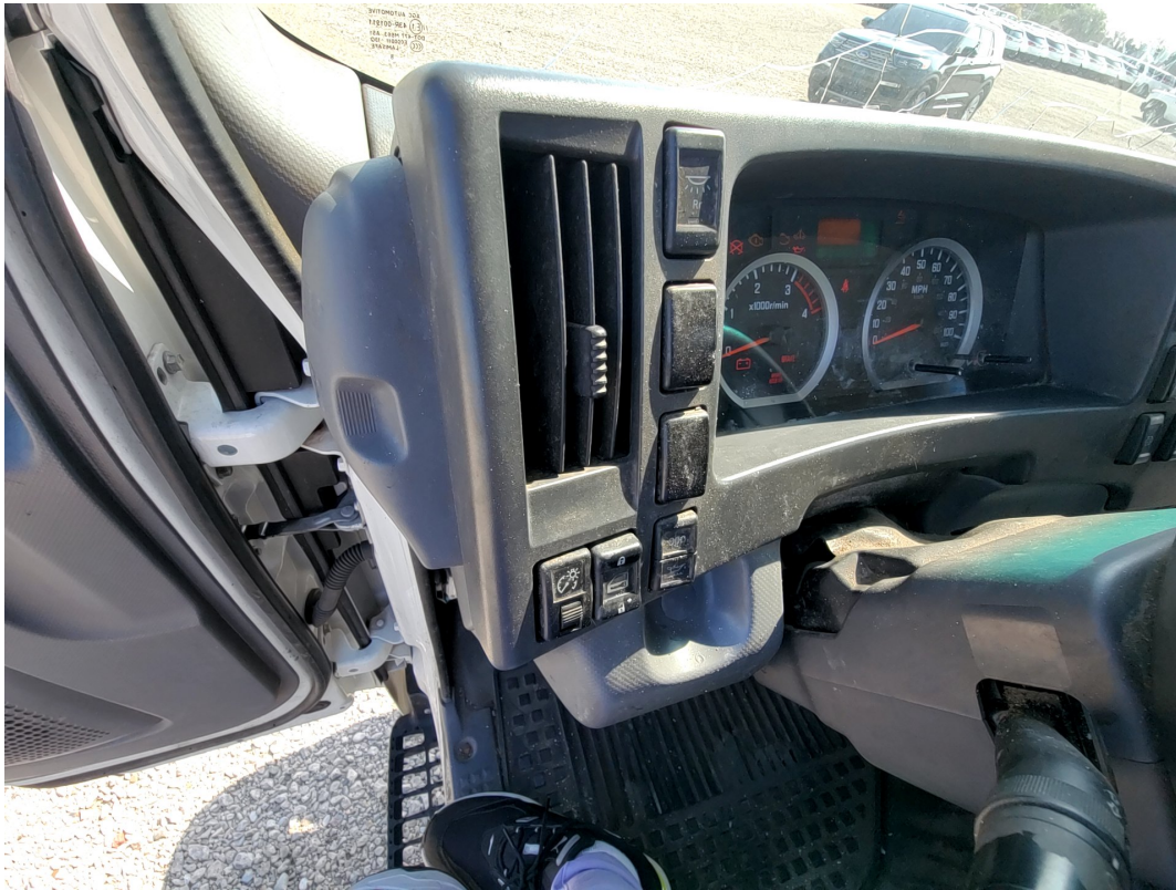
Switches and Controls / 09-21-2023