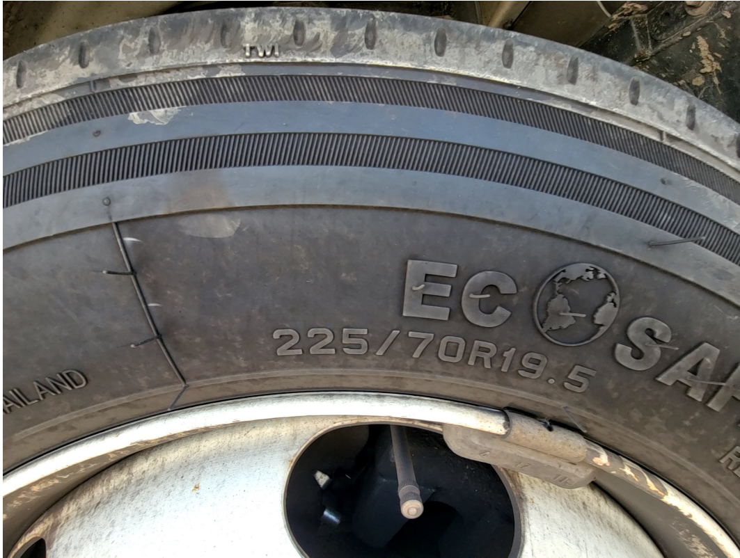
Left Steer Tire Size / 09-21-2023