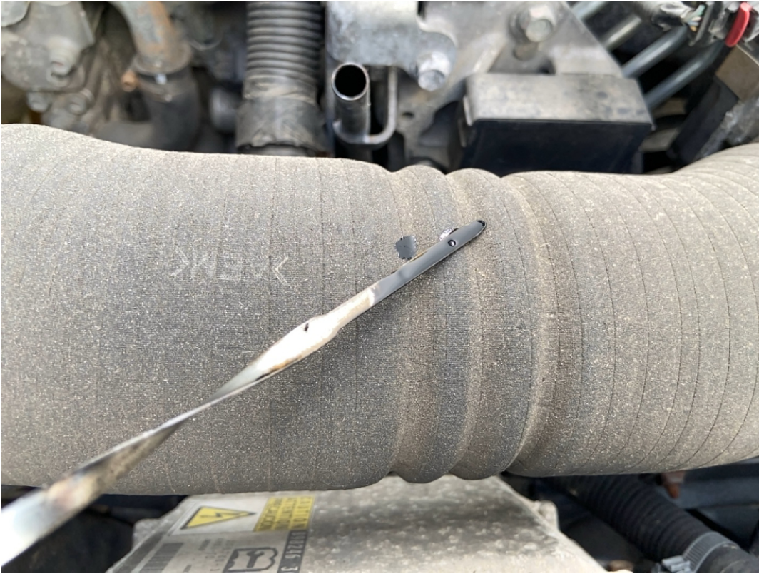
Oil Dipstick / 09-21-2023