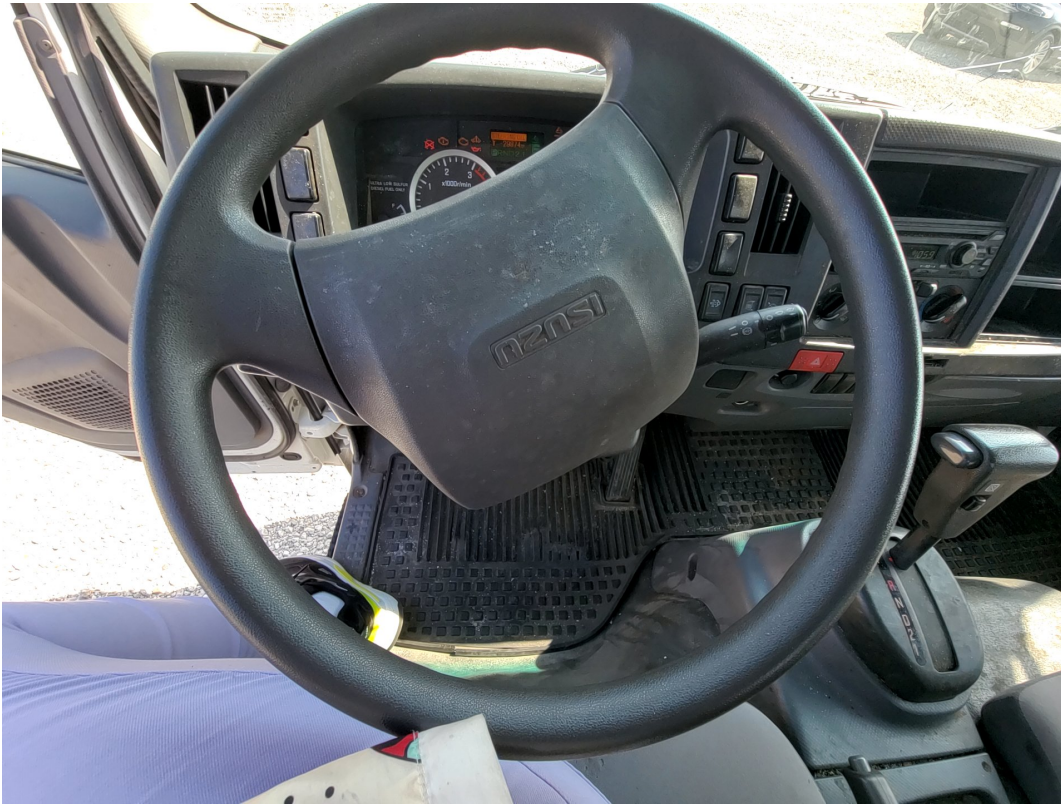
Steering Wheel / 09-21-2023