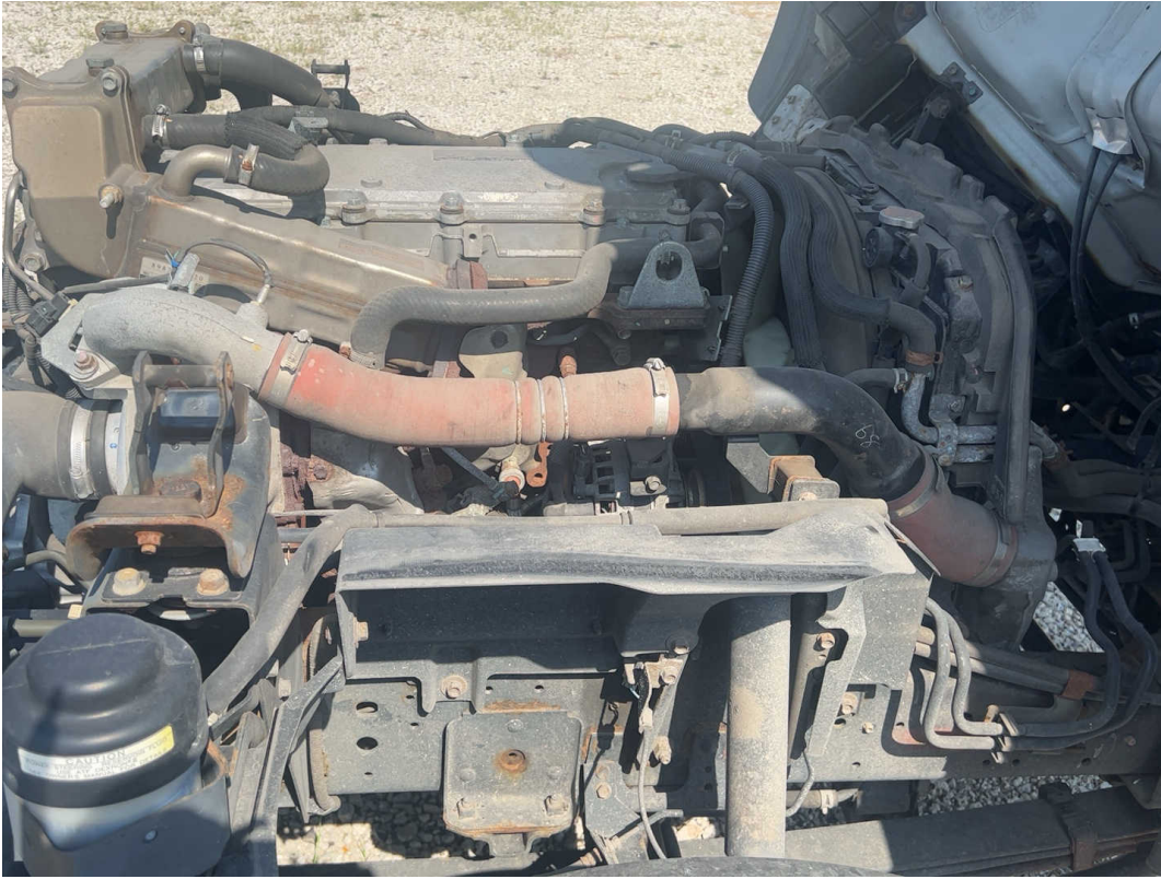
Engine Compartment / 09-21-2023