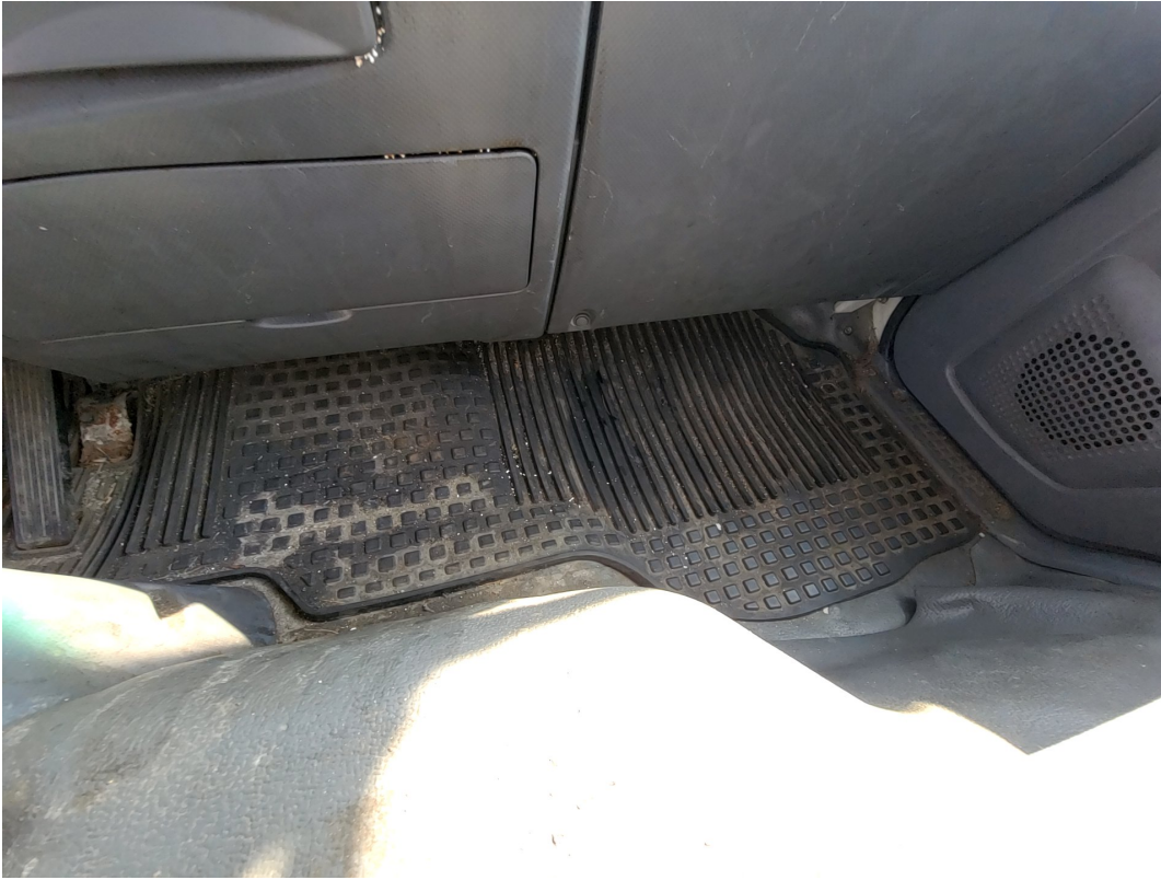
Floorboard / 09-21-2023