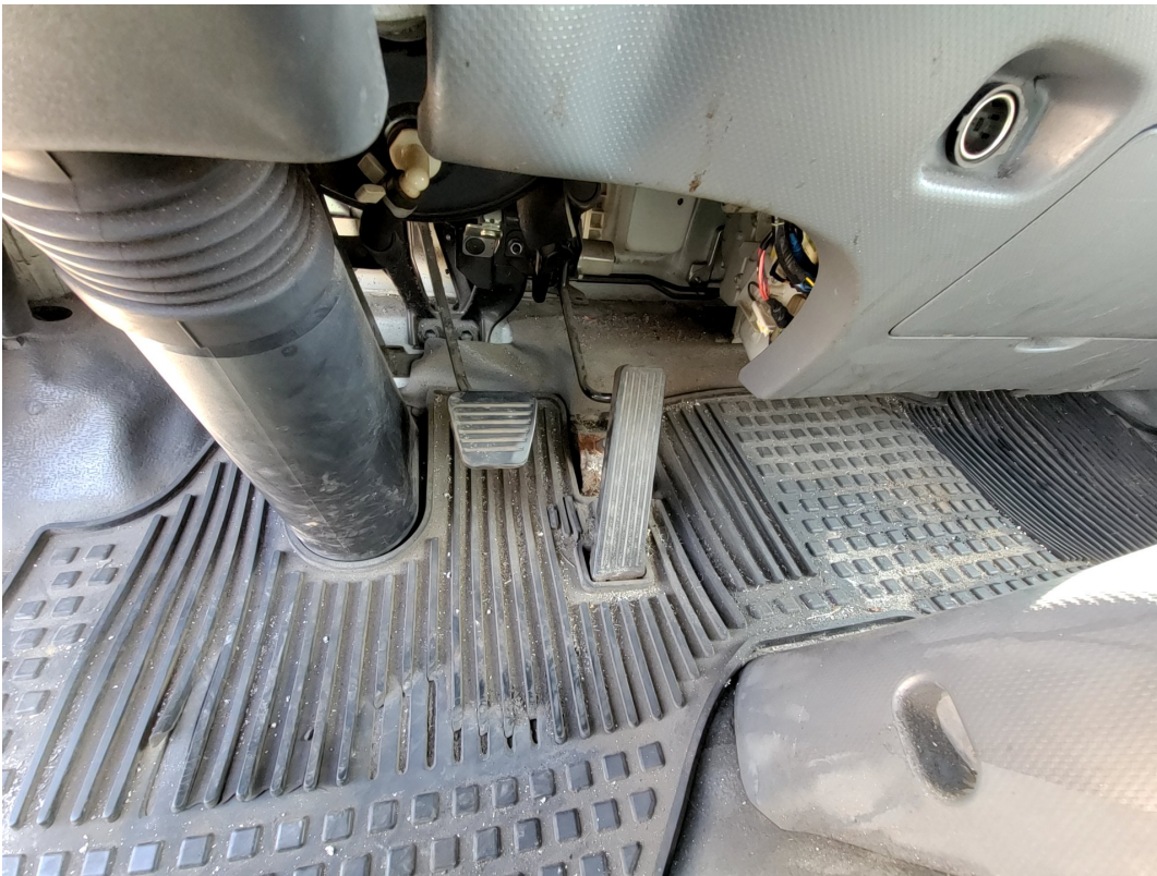
Pedals / 09-21-2023