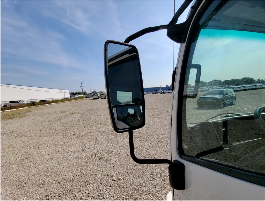
Mirrors / 09-21-2023