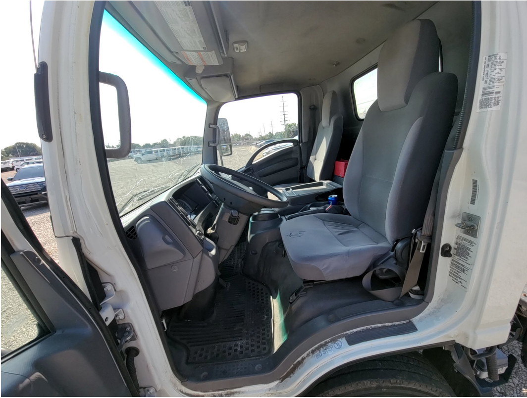
Cab Interior / 09-21-2023