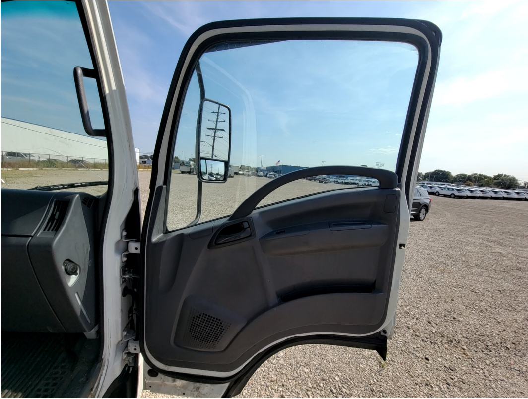
Handrails / 09-21-2023