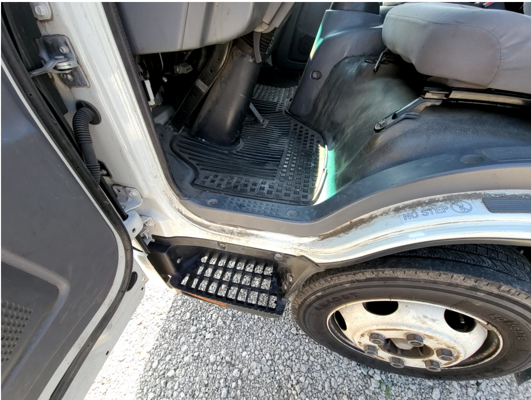
Steps / 09-21-2023