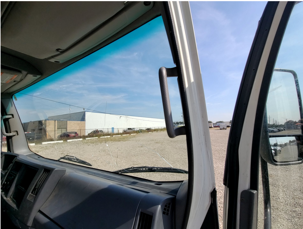
Handrails / 09-21-2023