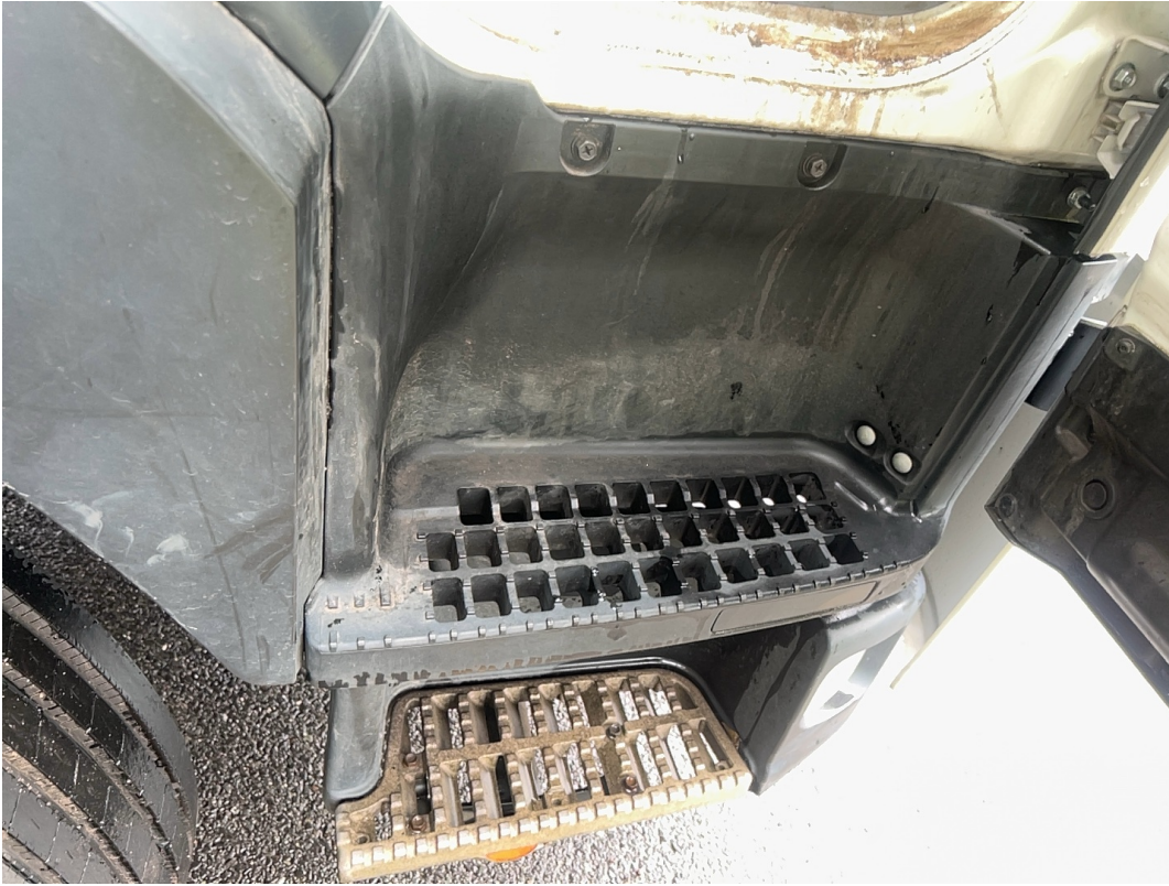
Steps / 09-18-2023