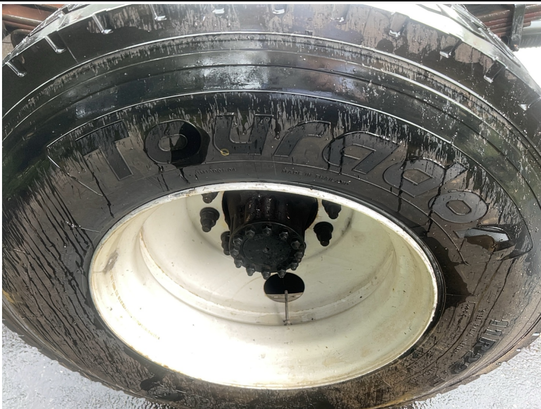
Rear Right Outer Drive Tire Brand / 09-18-2023