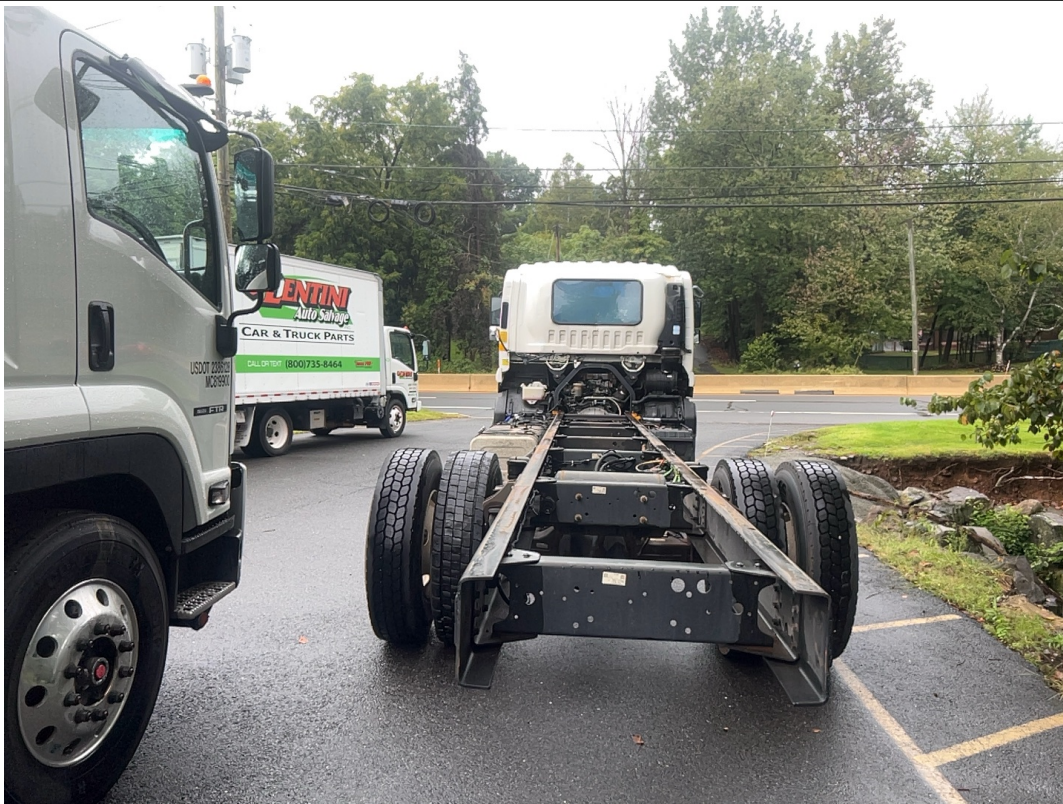
Rear / 09-18-2023