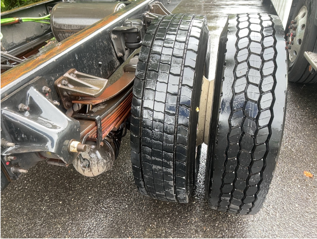
Rear Left Outer Drive Tire Condition / Rear Left Inner Drive Tire Condition / Suspension / 09-18-2023