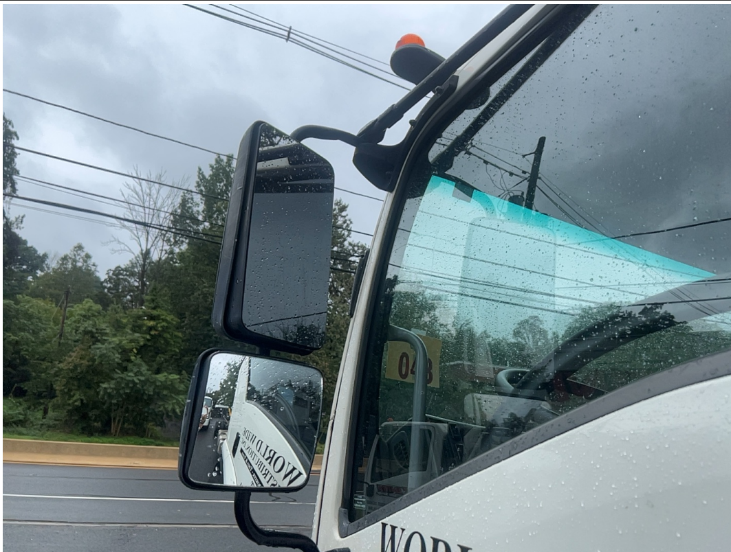
Mirrors / 09-18-2023