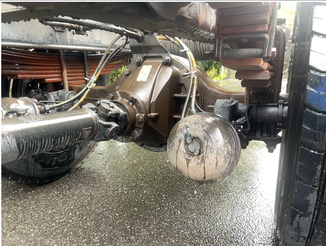
Axles / Suspension / 09-18-2023