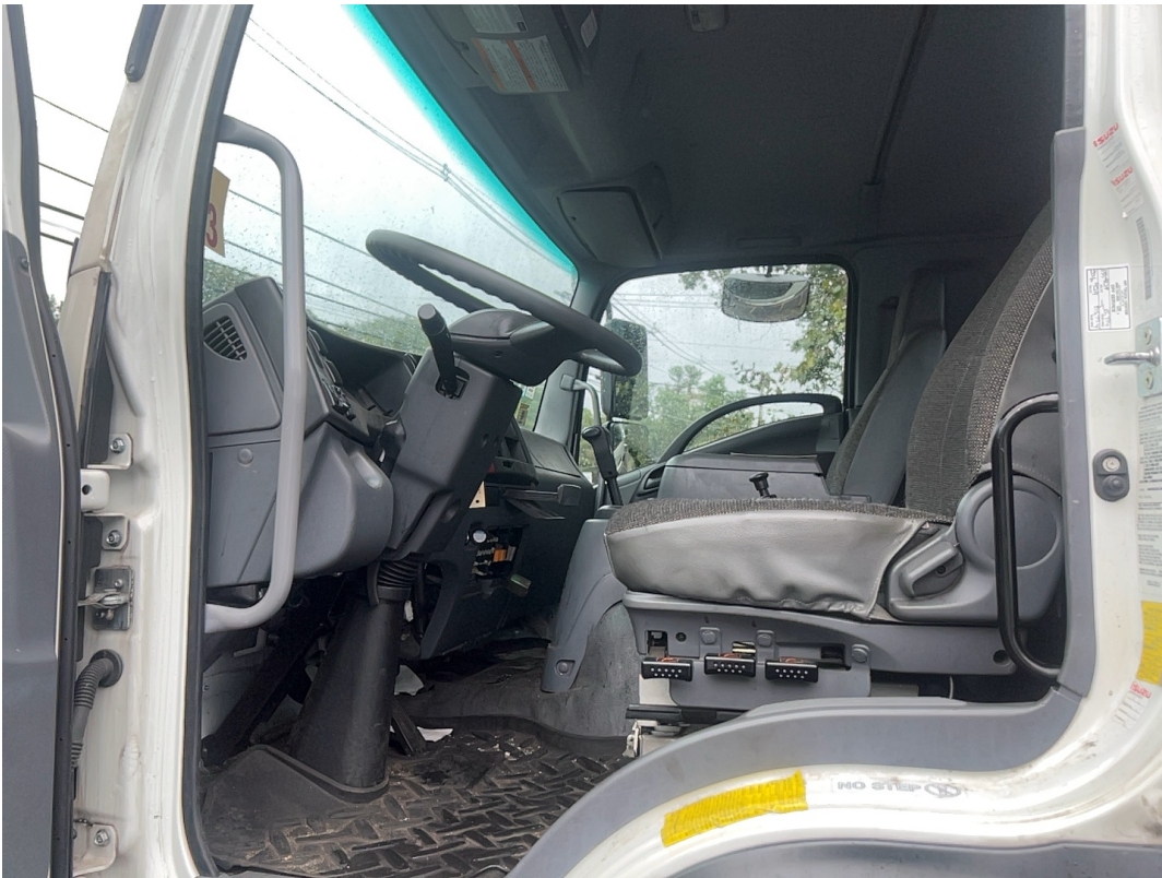
Handrails / 09-18-2023