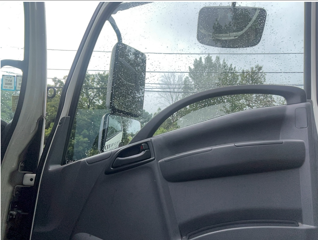
Handrails / 09-18-2023