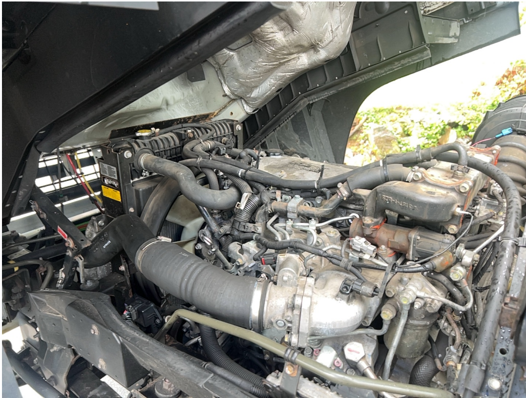
Engine Compartment / 09-18-2023