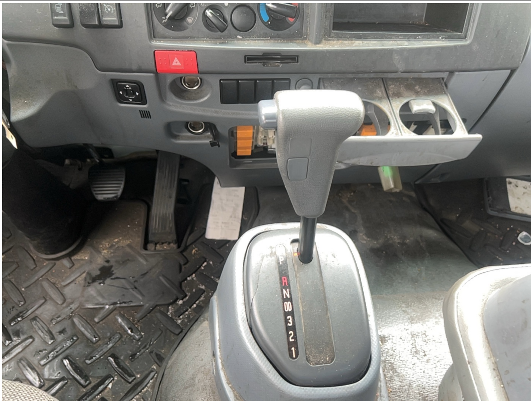
Transmission / 09-18-2023