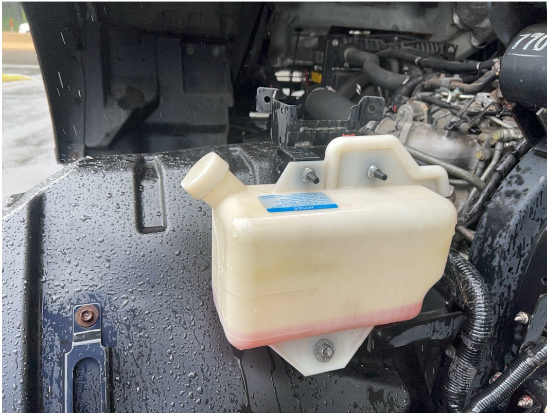
Coolant Level / 09-18-2023