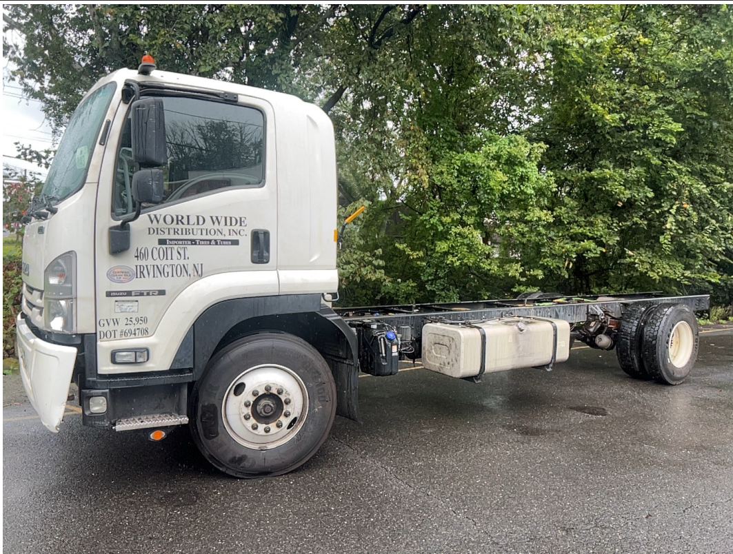
Left / 09-18-2023