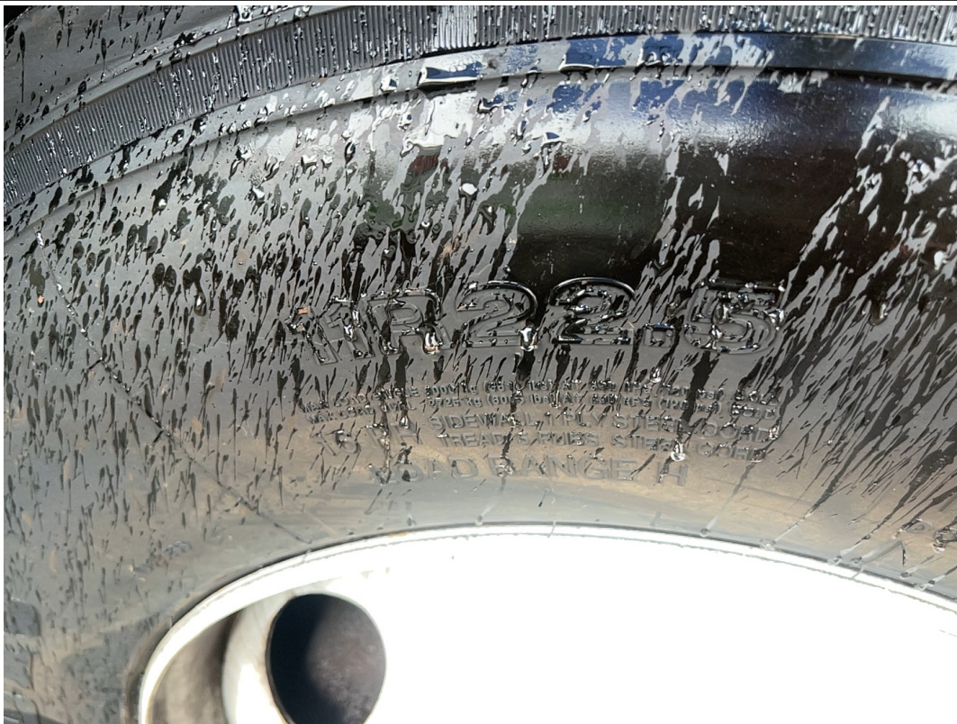
Left Steer Tire Size / 09-18-2023