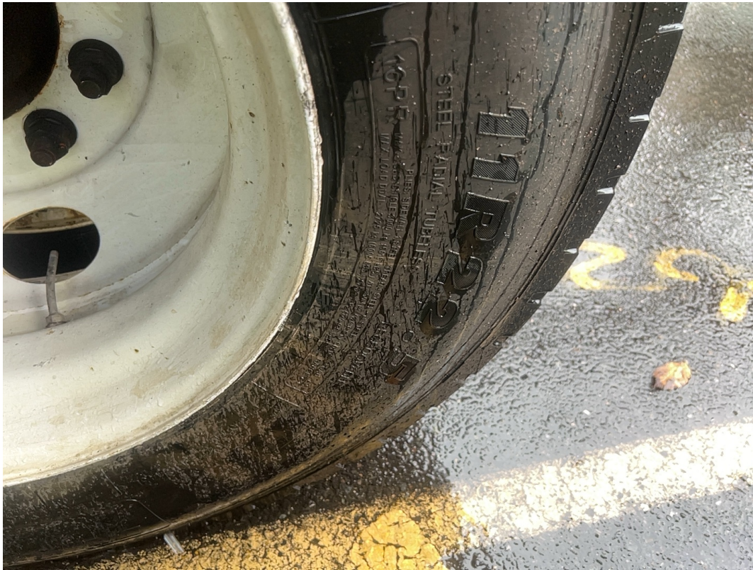
Rear Right Outer Drive Tire Size / 09-18-2023