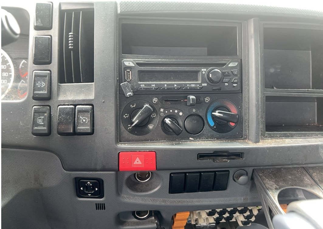
Switches and Controls / Radio / A/C / Power Mirrors / Heated Mirrors / 09-18-2023