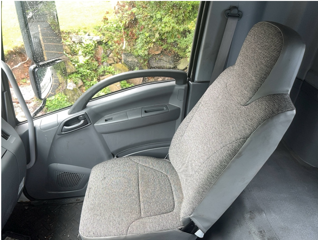
Passenger's Seat / 09-18-2023