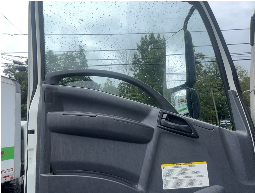
Handrails / 09-18-2023