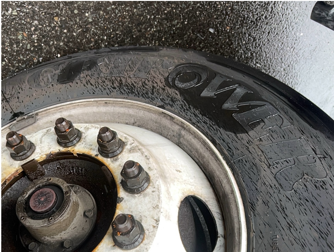
Left Steer Tire Brand / 09-18-2023