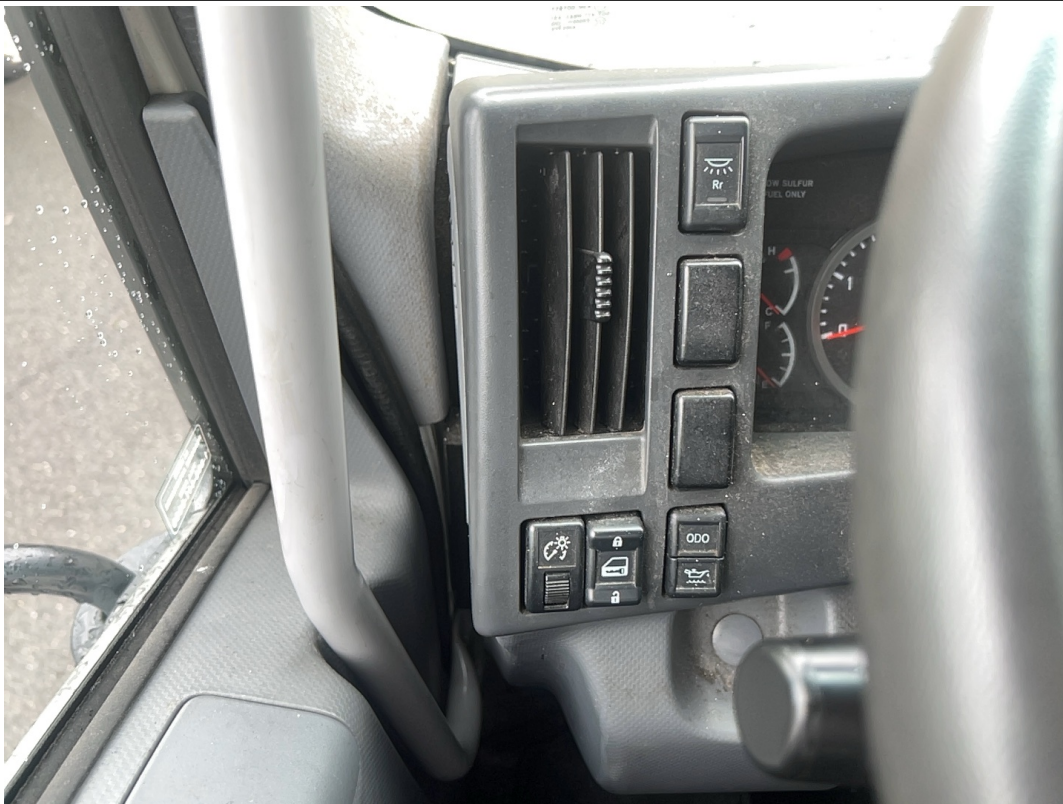
Switches and Controls / 09-18-2023