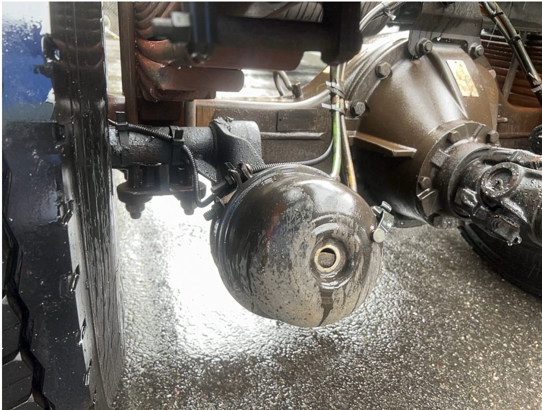
Axles / Suspension / 09-18-2023