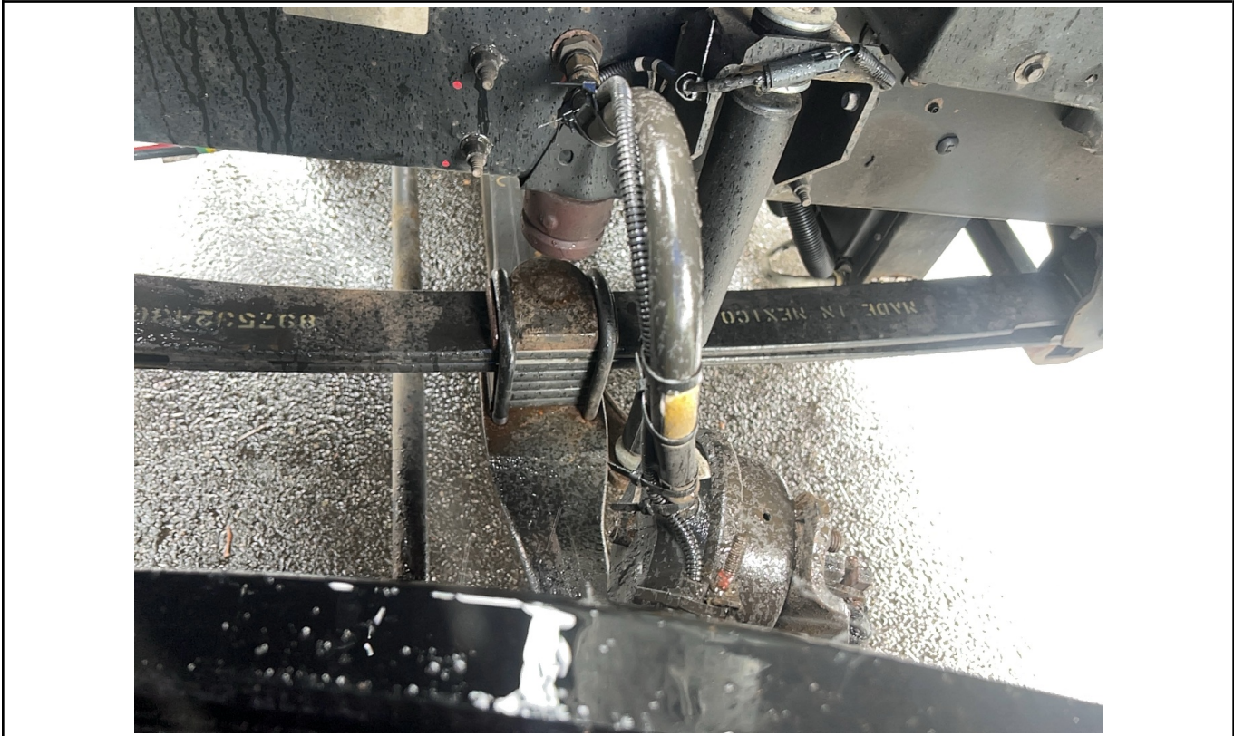
Axles / Suspension / 09-18-2023