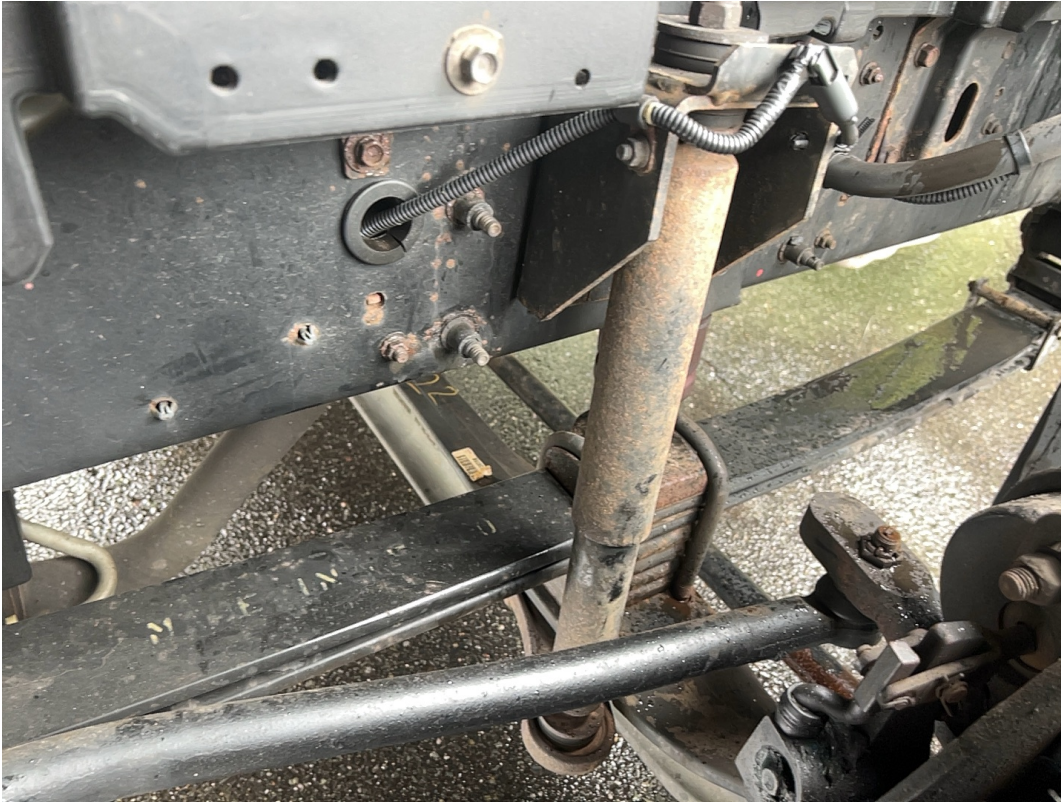
Axles / Suspension / 09-18-2023