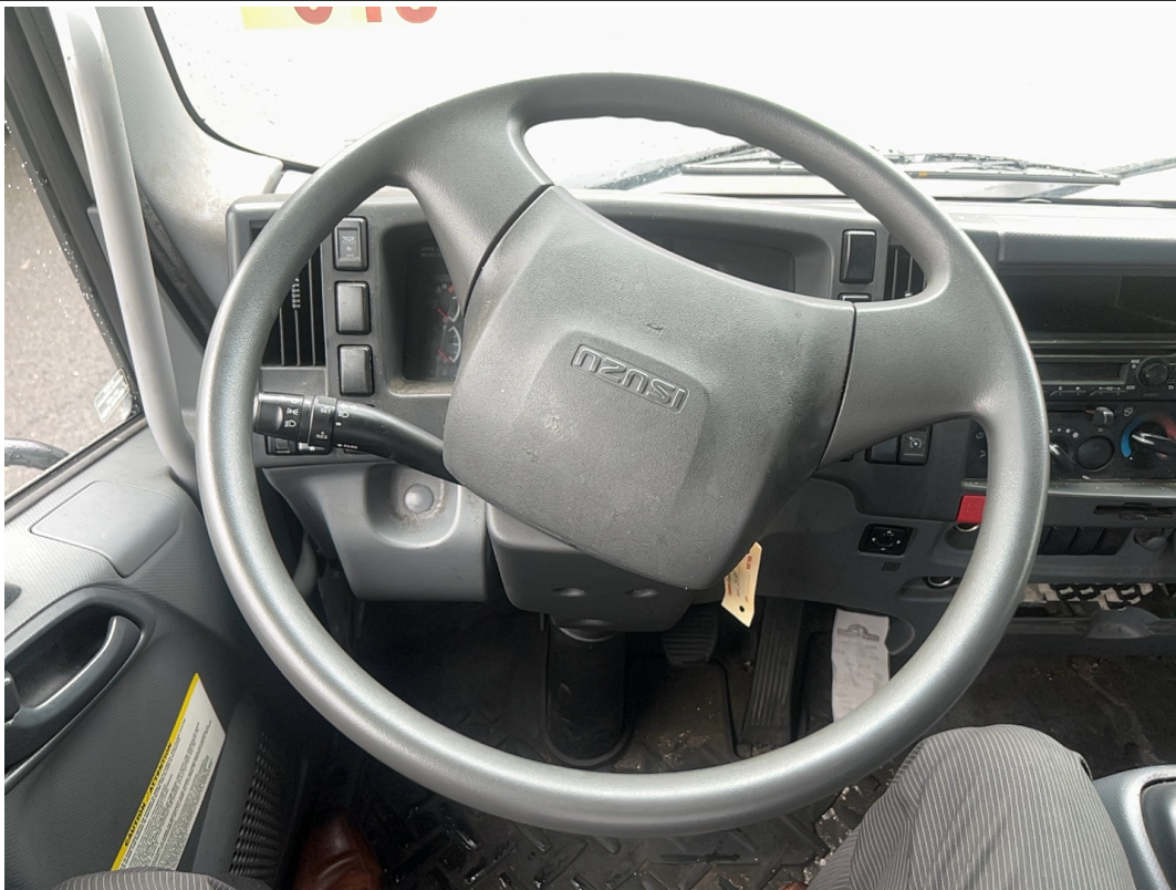
Steering Wheel / 09-18-2023