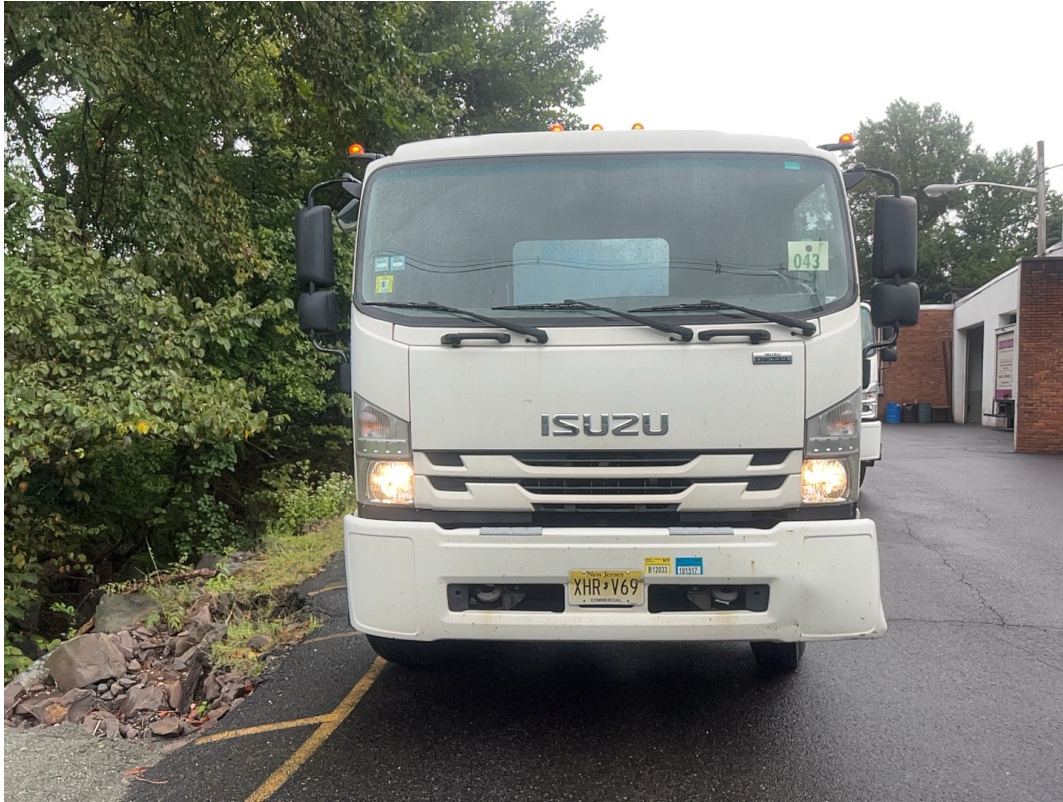
Front / Front Lights / 09-18-2023