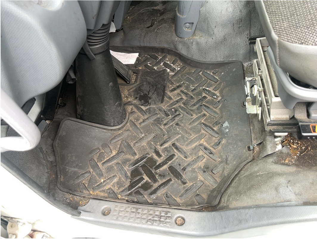
Floorboard / 09-18-2023