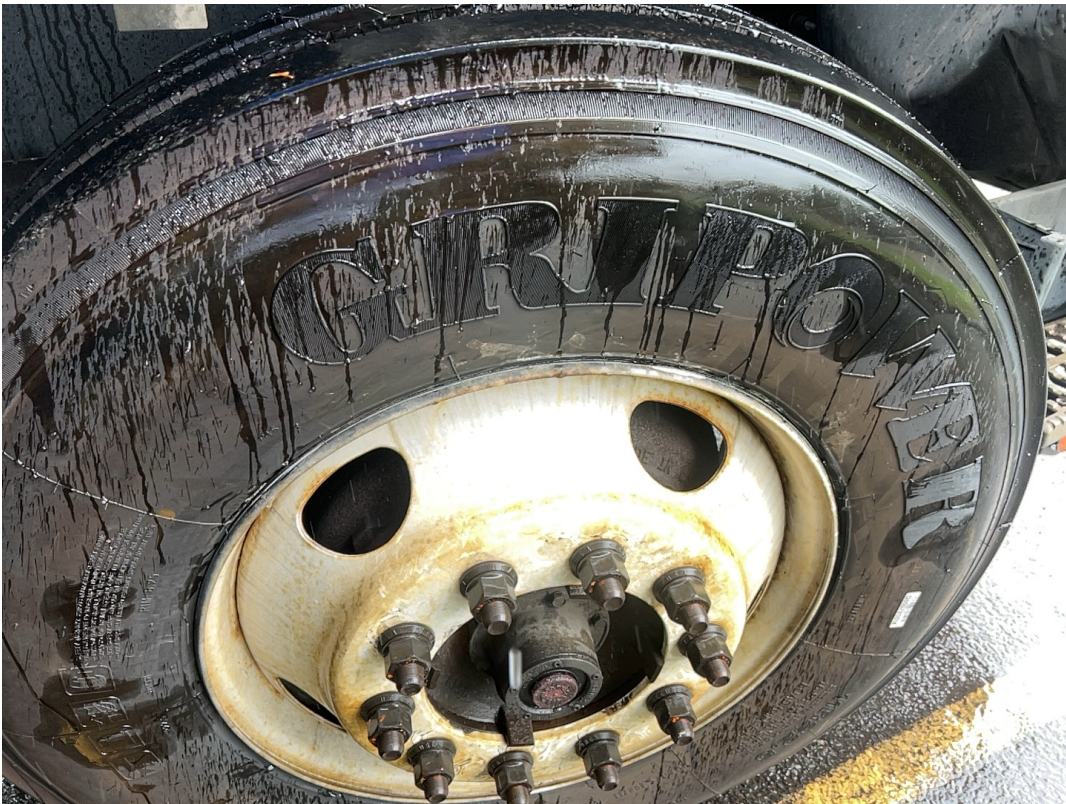
Right Steer Tire Brand / 09-18-2023