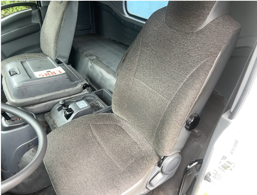
Driver's Seat / 09-18-2023