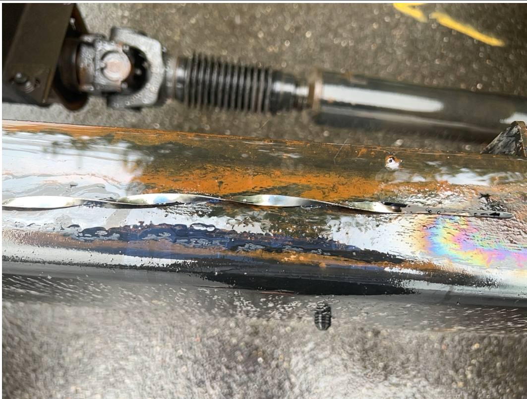
Oil Dipstick / 09-18-2023