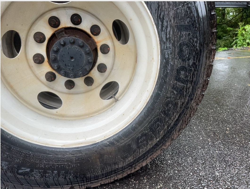
Rear Left Outer Drive Tire Brand / 09-18-2023