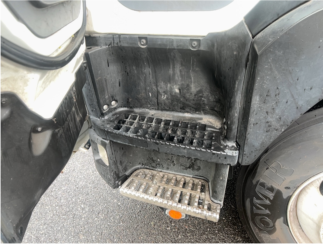
Steps / 09-18-2023