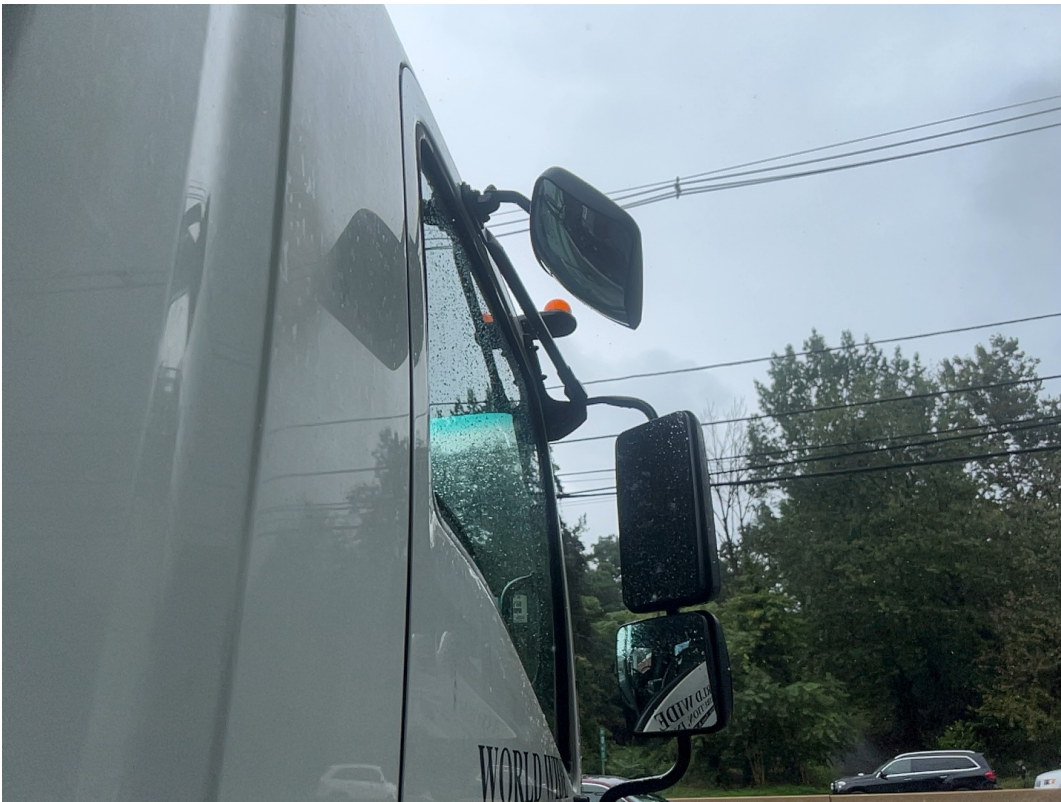
Mirrors / 09-18-2023