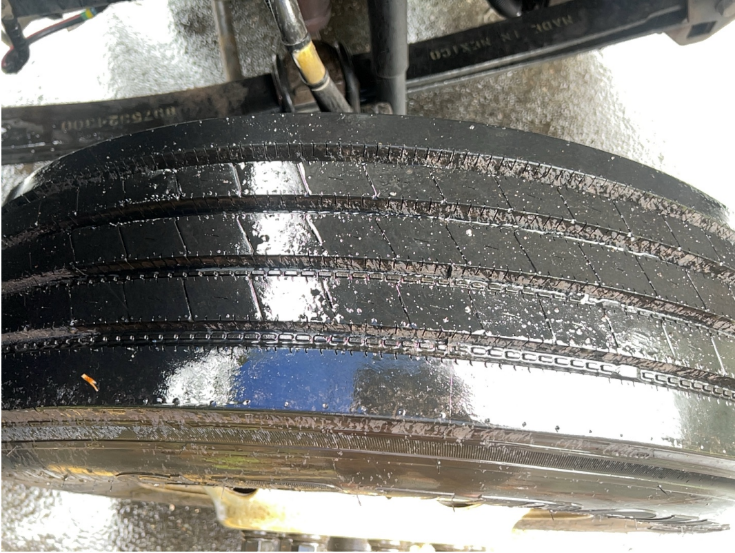
Right Steer Tire Condition / 09-18-2023