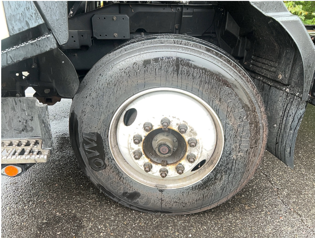
Left Steer Tire Condition / 09-18-2023