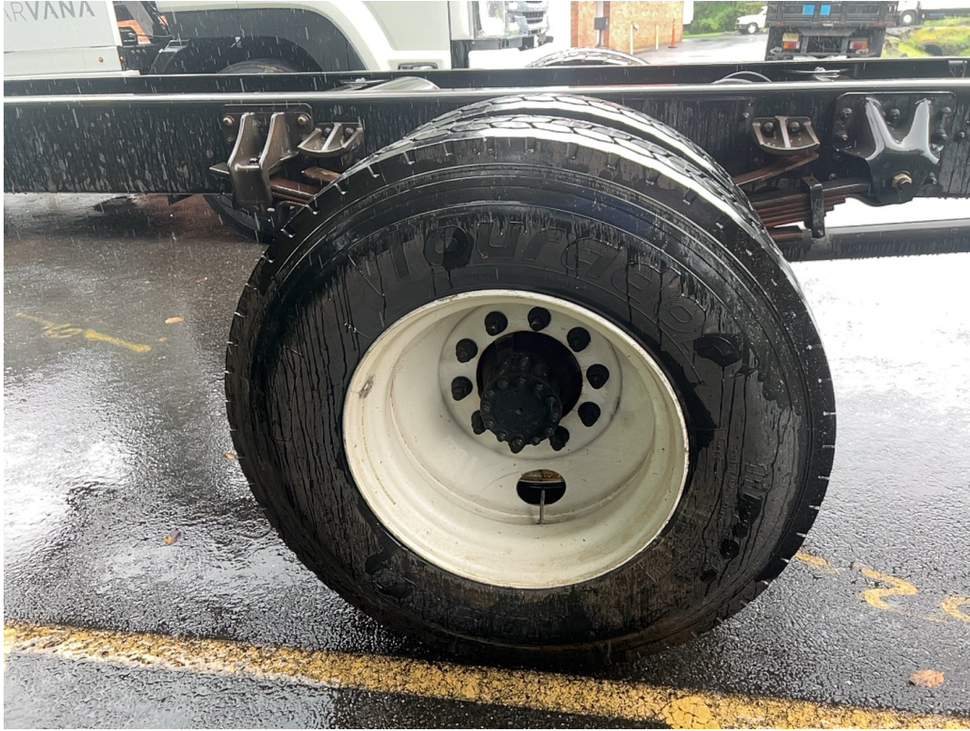
Rear Right Outer Drive Tire Condition / 09-18-2023