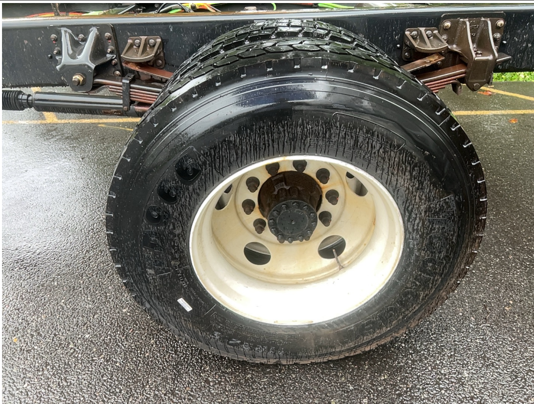
Rear Left Outer Drive Tire Condition / 09-18-2023