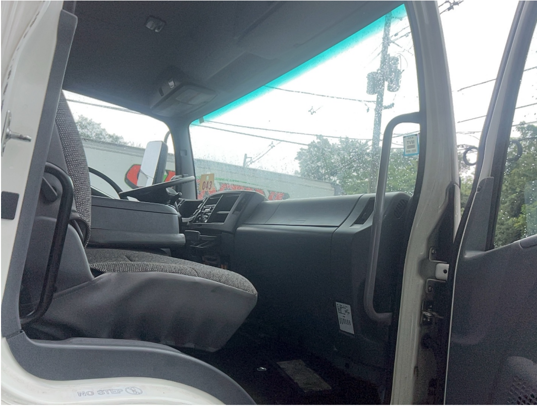
Handrails / 09-18-2023