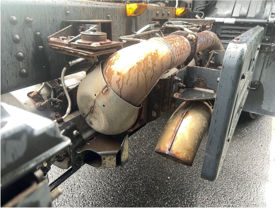
Exhaust Pipe / 09-18-2023