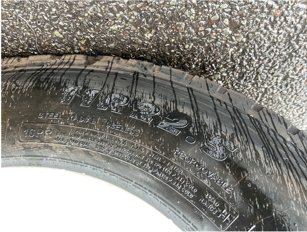
Rear Left Outer Drive Tire Size / 09-18-2023