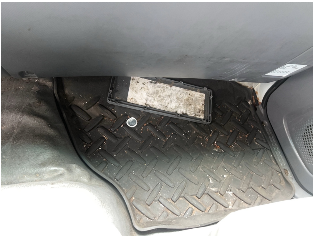
Floorboard / 09-18-2023