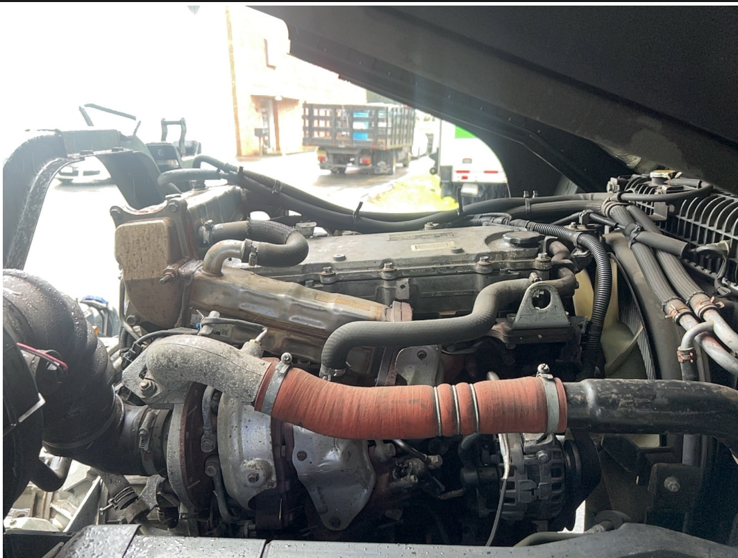
Engine Compartment / 09-18-2023