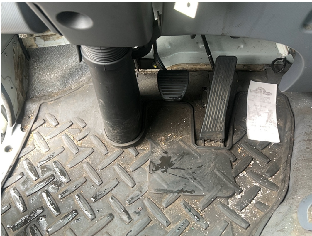
Floorboard / Pedals / 09-18-2023