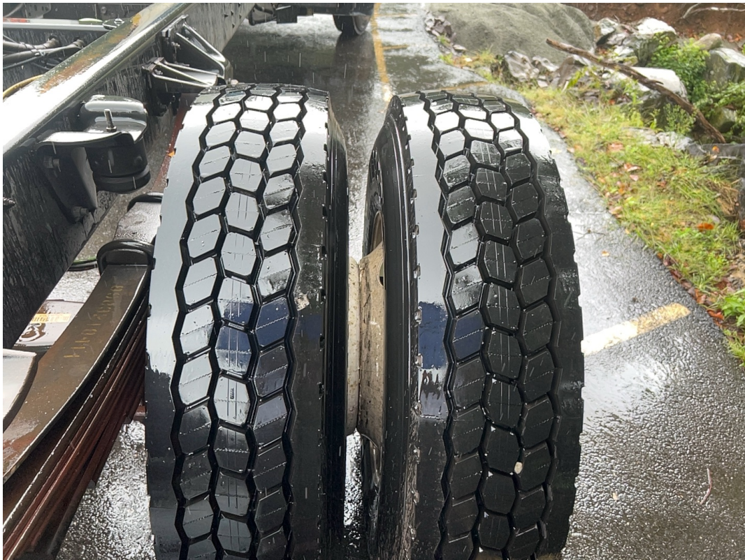
Rear Right Outer Drive Tire Condition / Rear Right Inner Drive Tire Condition / Suspension / 09-18-2023