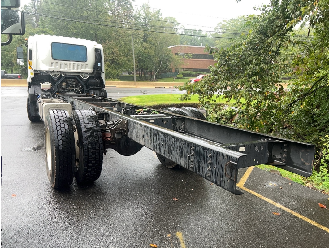
Rear Left / 09-18-2023