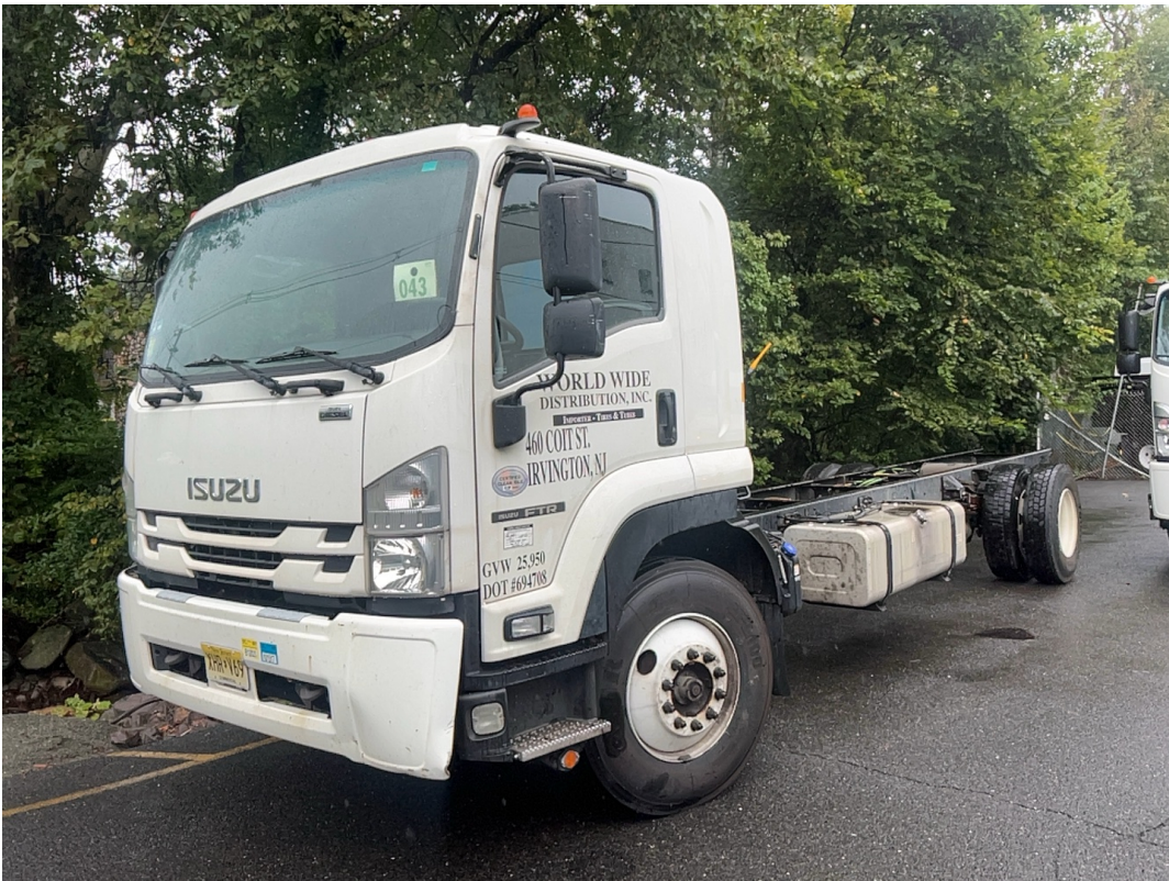
Front Left / 09-18-2023