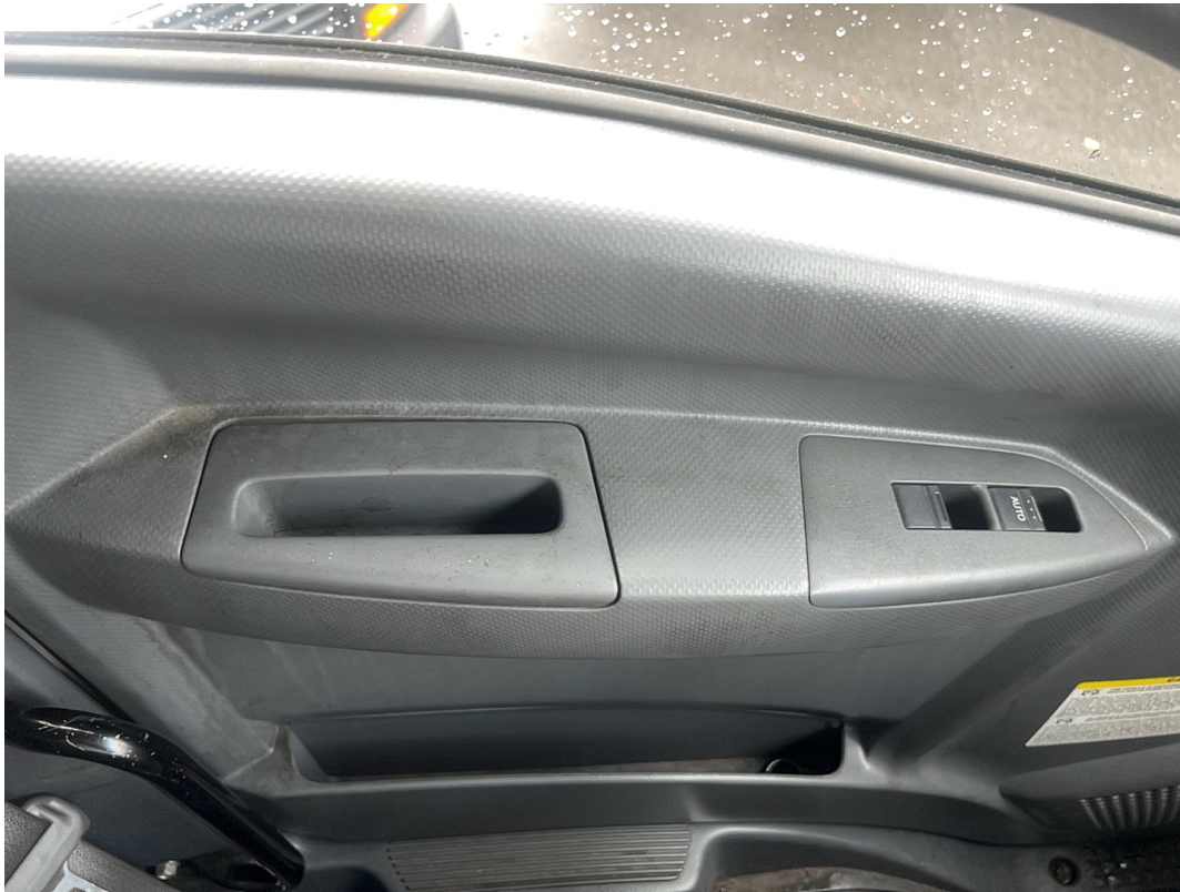
Switches and Controls / 09-18-2023