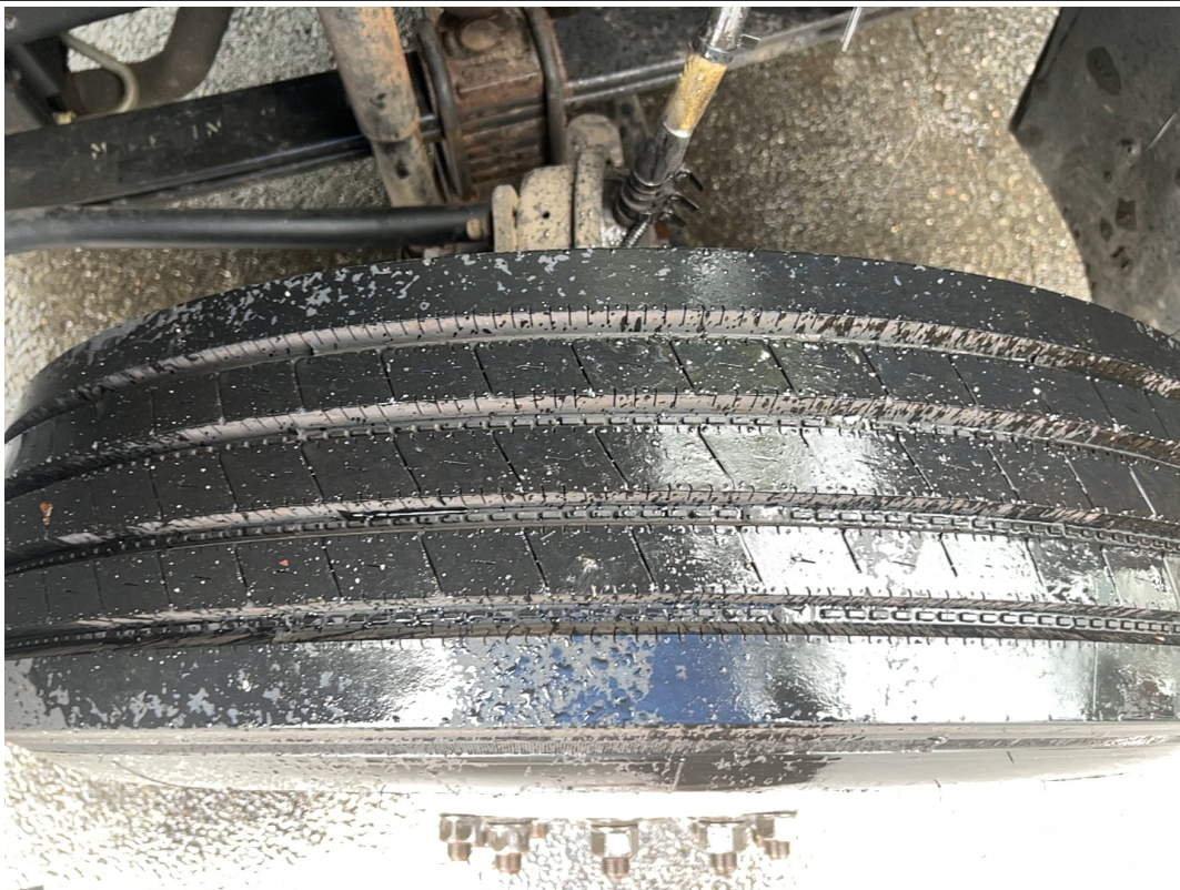
Left Steer Tire Condition / 09-18-2023