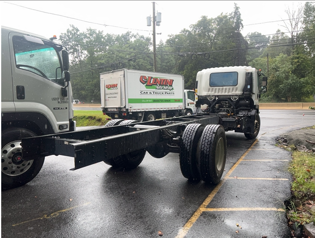
Rear Right / 09-18-2023