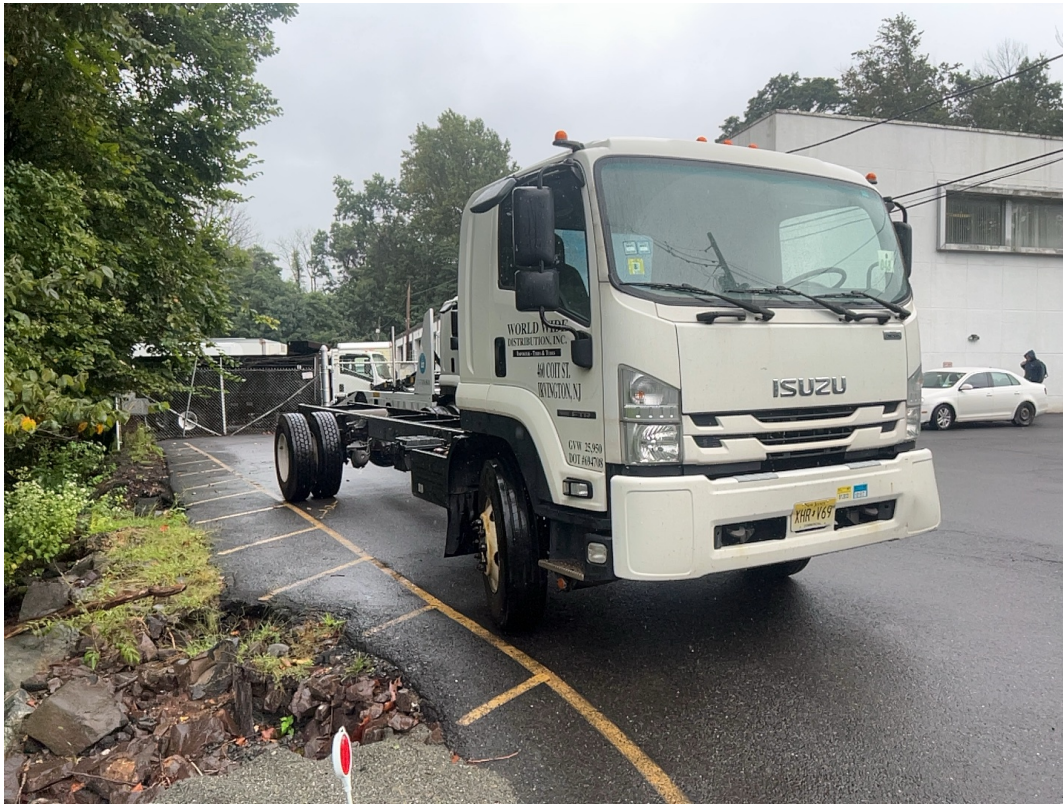
Front Right / 09-18-2023