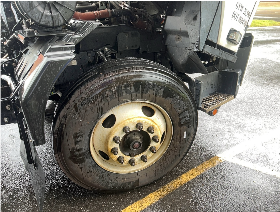
Right Steer Tire Condition / 09-18-2023