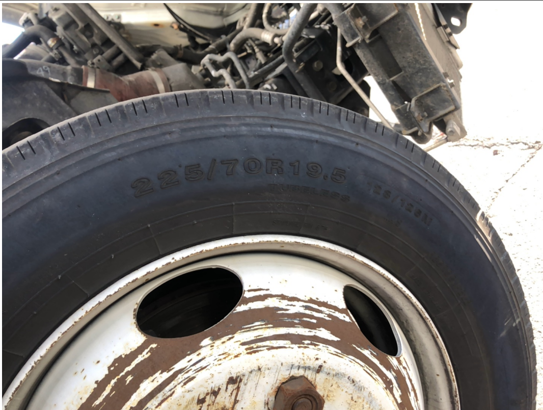
Right Steer Tire Size / 01-02-2024