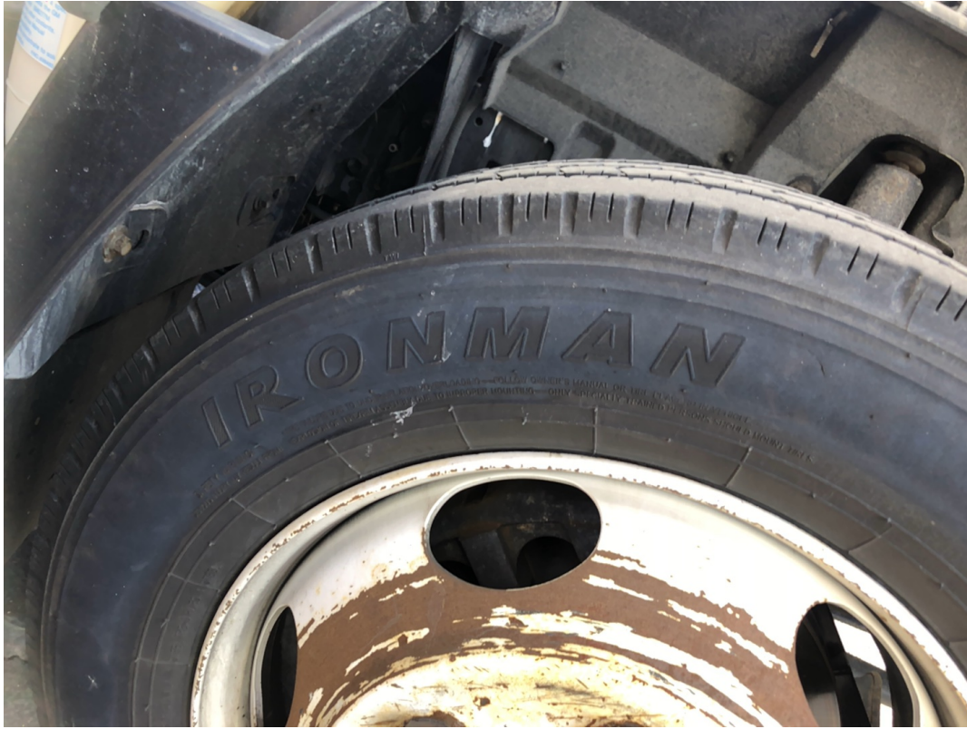
Right Steer Tire Brand / 01-02-2024