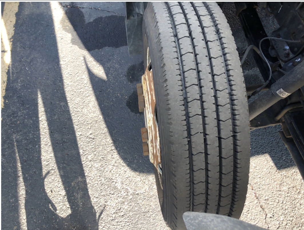
Right Steer Tire Condition / 01-02-2024