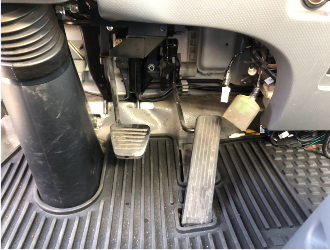
Pedals / 01-02-2024