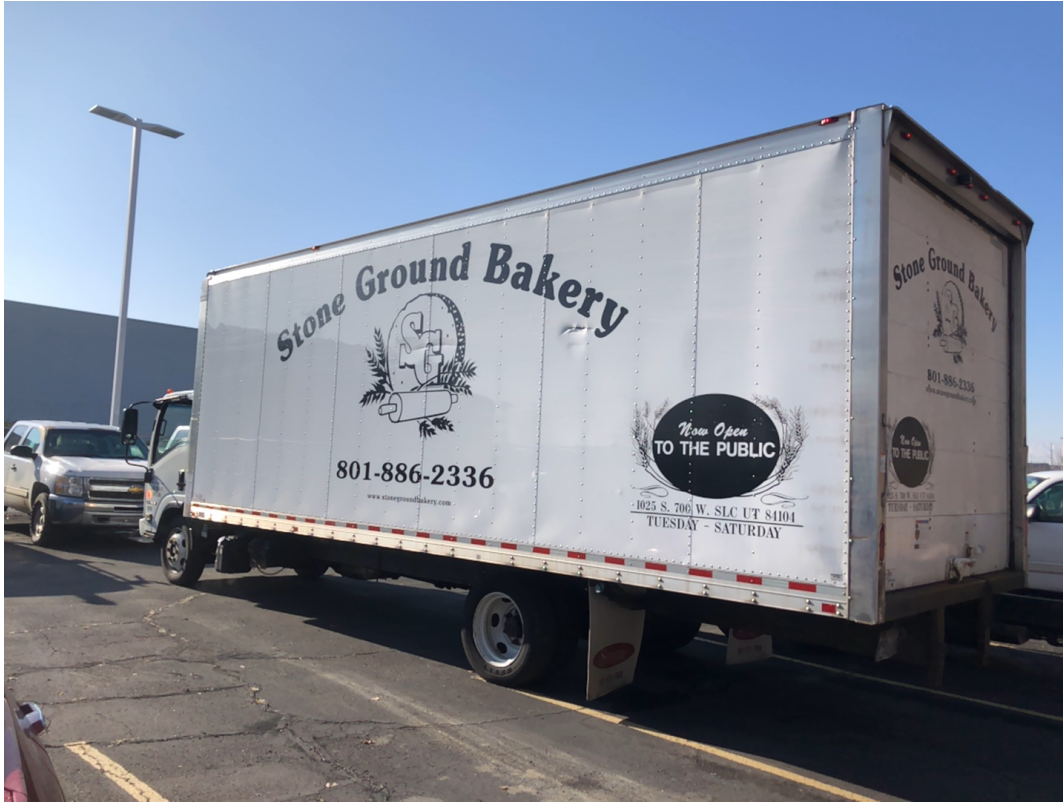
Rear Left / 01-02-2024