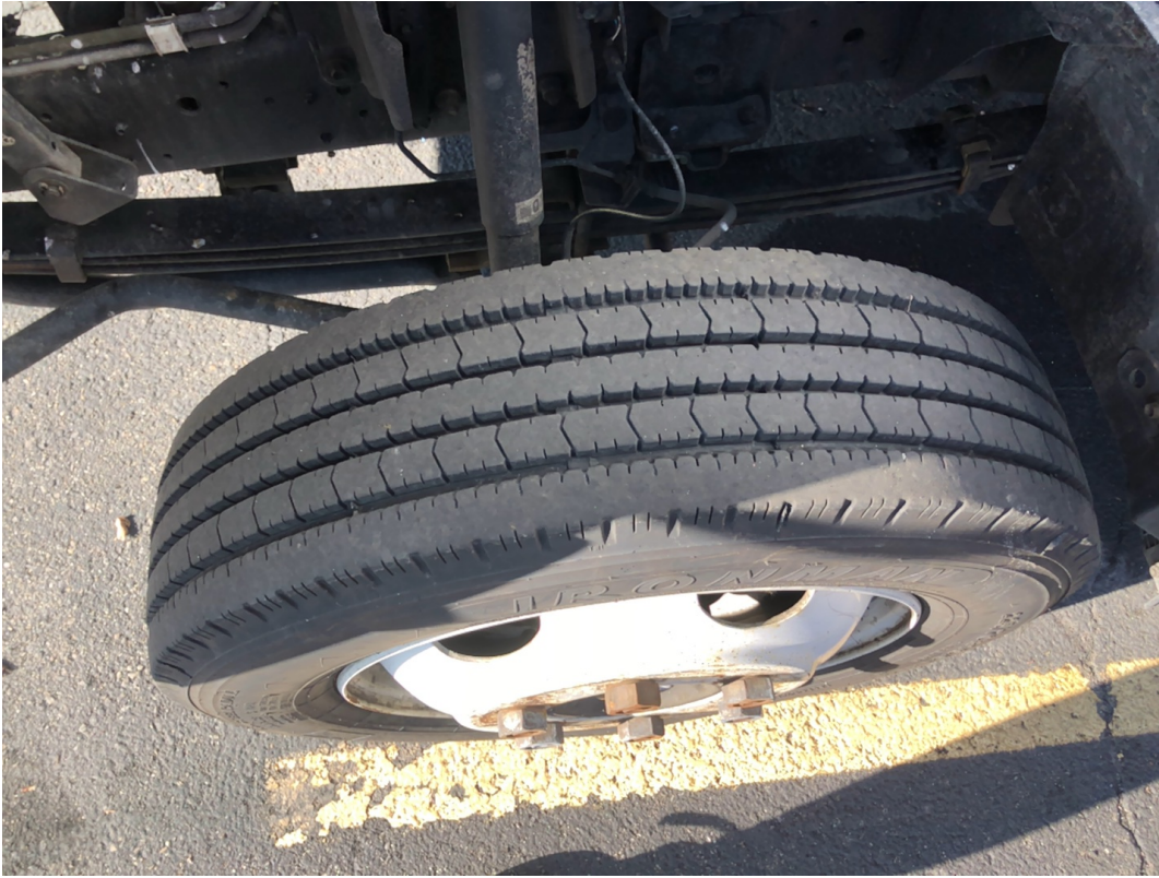
Left Steer Tire Condition / 01-02-2024