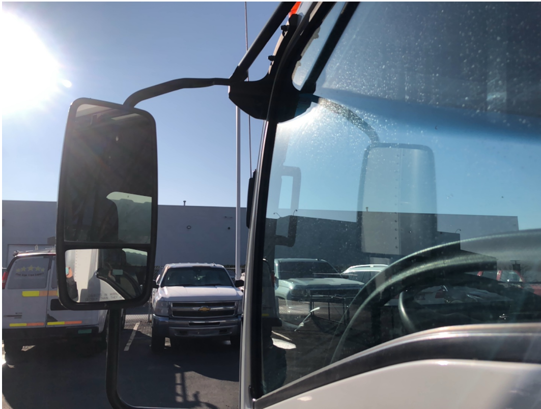
Mirrors / 01-02-2024