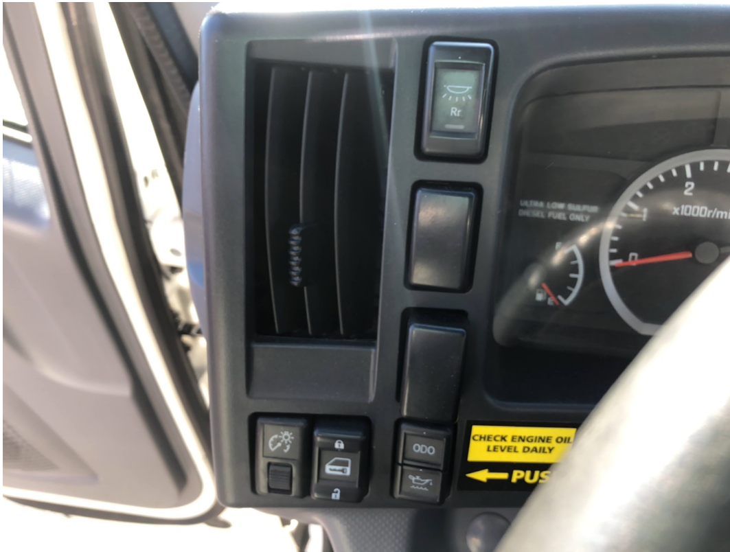
Switches and Controls / 01-02-2024