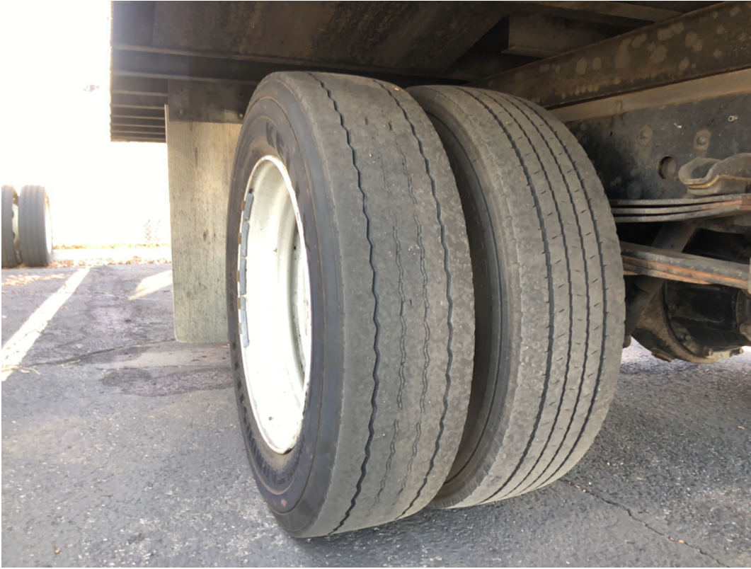
Rear Right Outer Drive Tire Condition / Rear Right Inner Drive Tire Condition / 01-02-2024