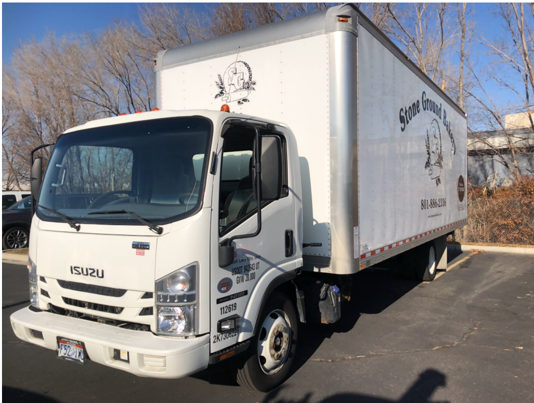
Front Left / 01-02-2024