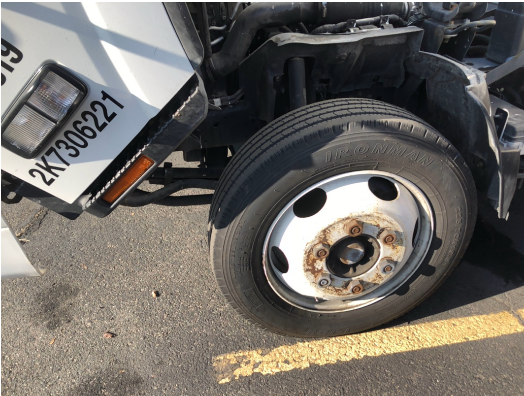
Left Steer Tire Condition / 01-02-2024