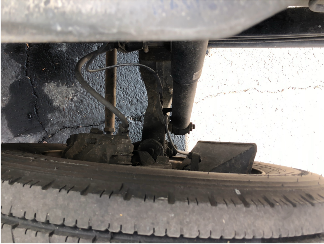
Axles / Suspension / 01-02-2024