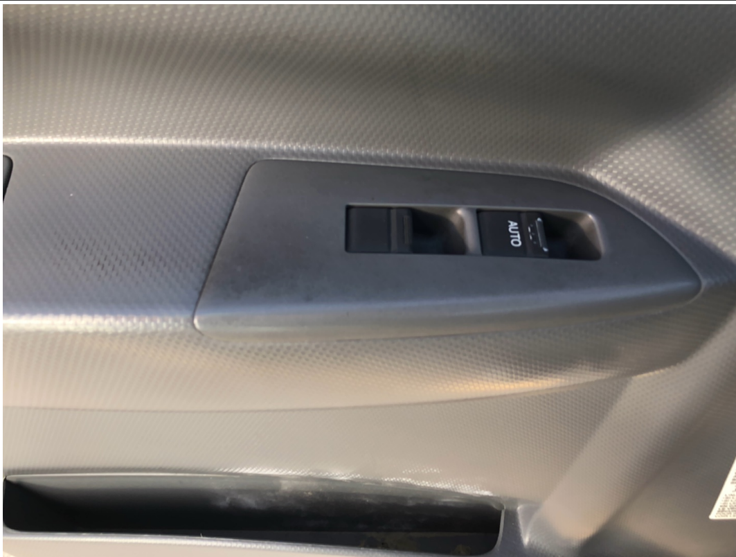
Switches and Controls / 01-02-2024