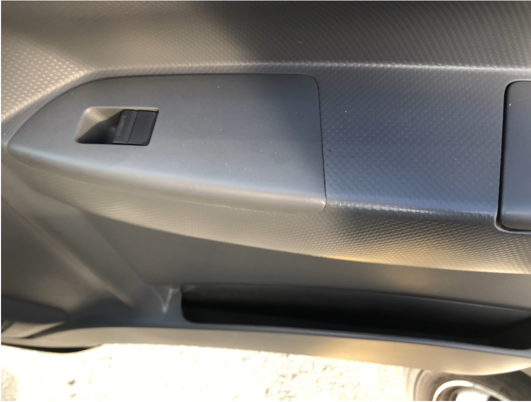
Switches and Controls / 01-02-2024