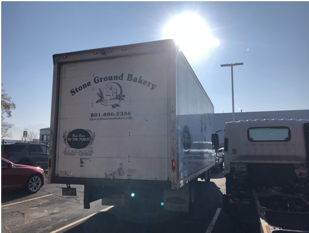
Rear Right / 01-02-2024