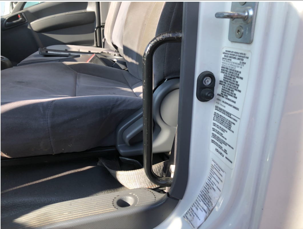
Handrails / 01-02-2024