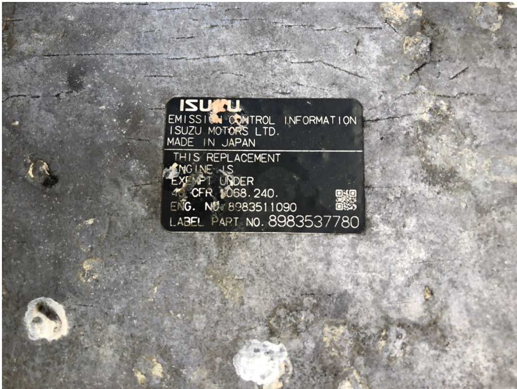
Engine Serial Plate: 8983511090 / 01-02-2024