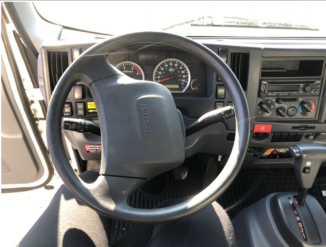
Steering Wheel / 01-02-2024