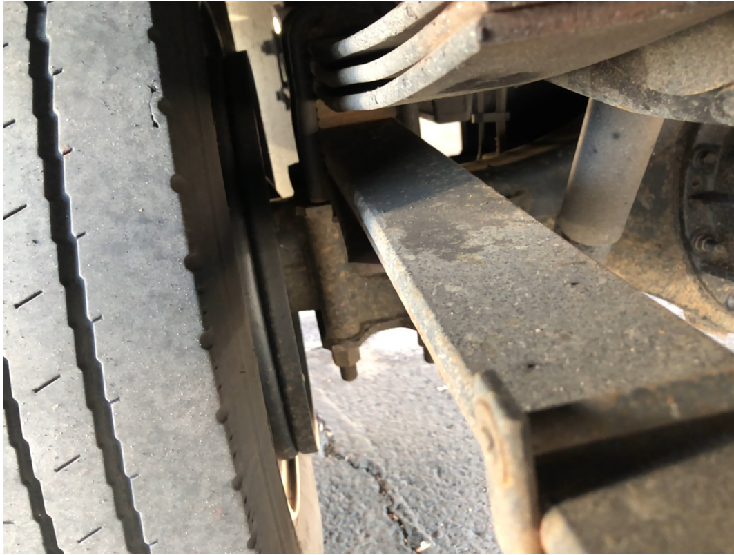
Axles / Suspension / 01-02-2024