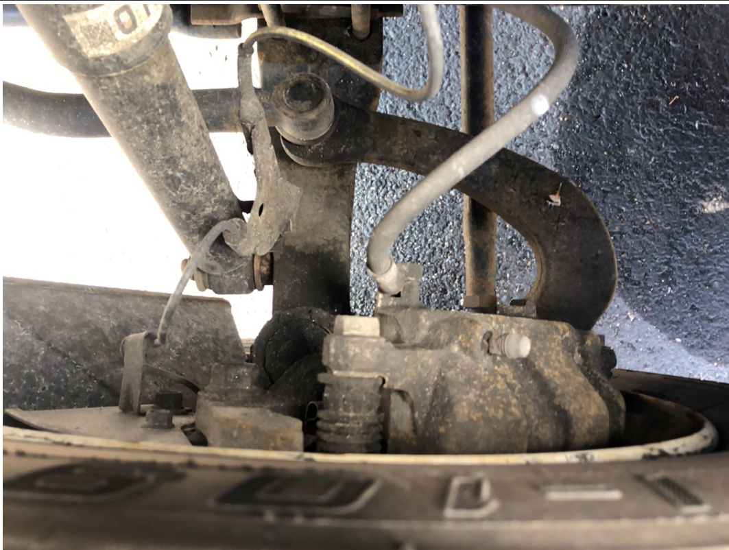
Axles / Suspension / 01-02-2024