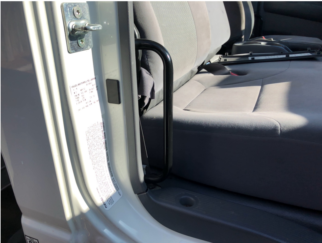
Handrails / 01-02-2024