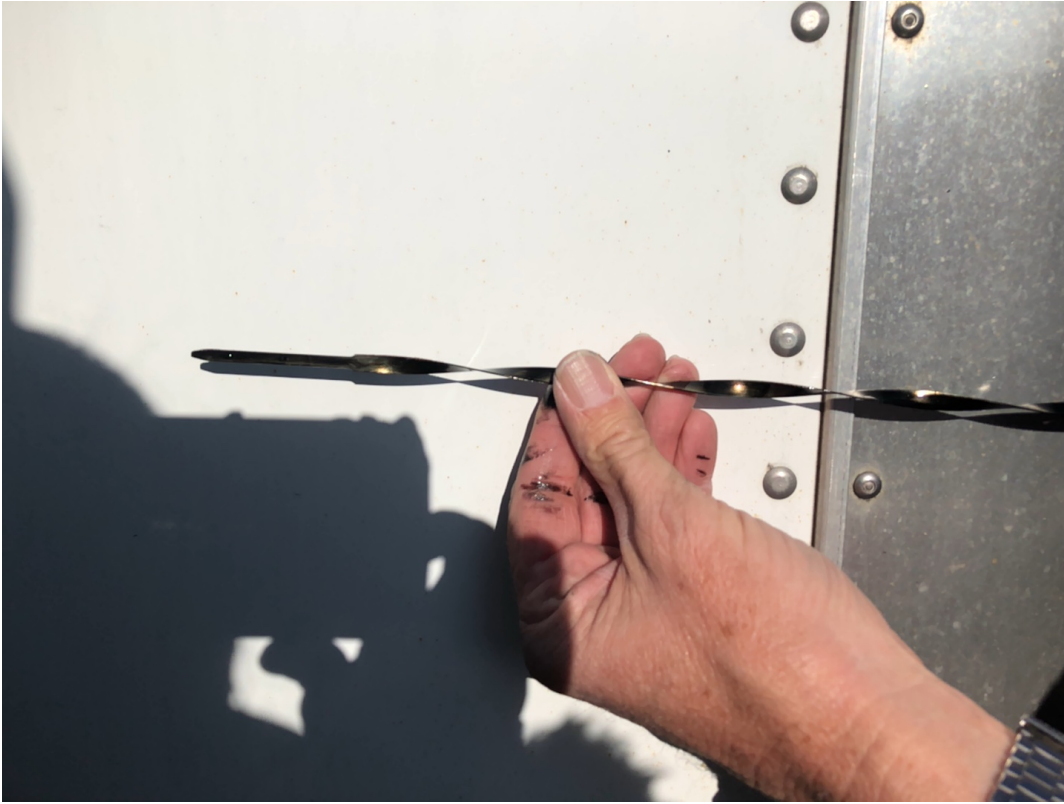
Oil Dipstick / 01-02-2024