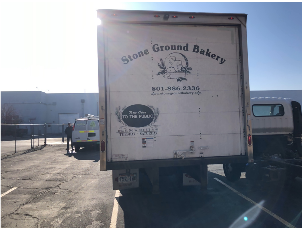
Rear / Rear Lights / 01-02-2024