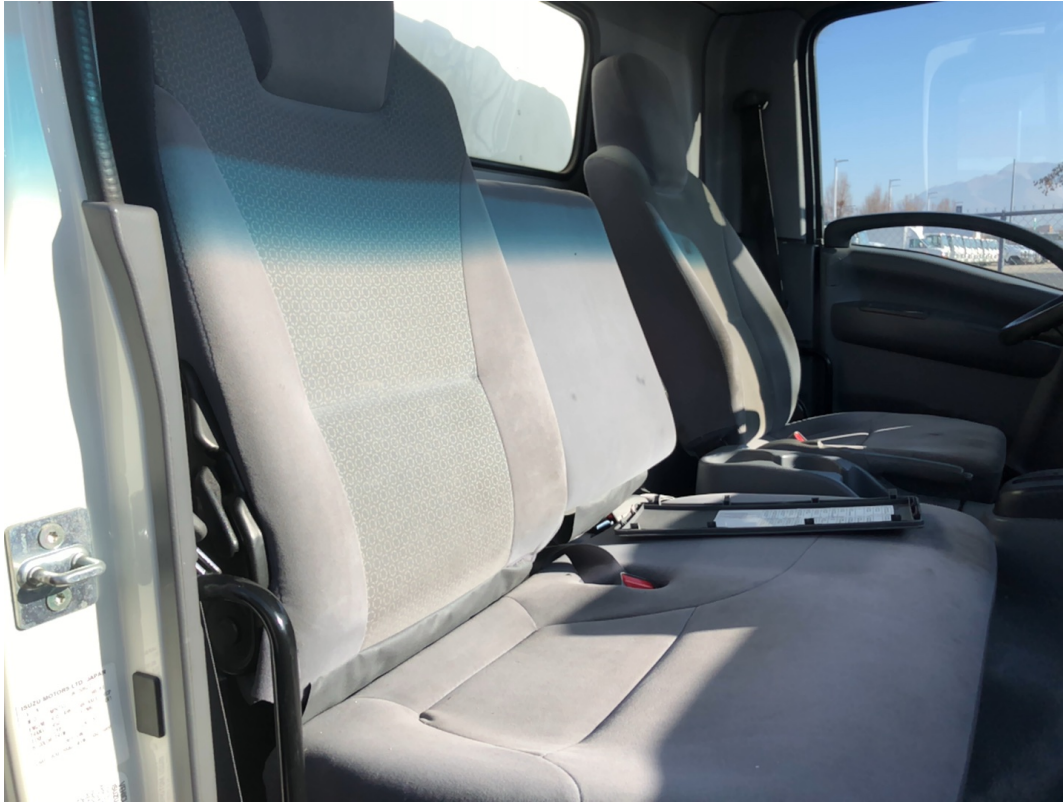
Passenger's Seat / 01-02-2024