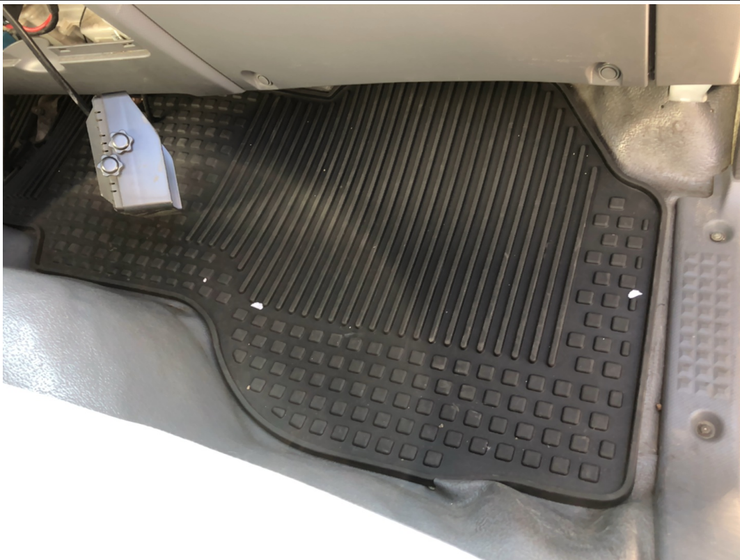
Floorboard / 01-02-2024