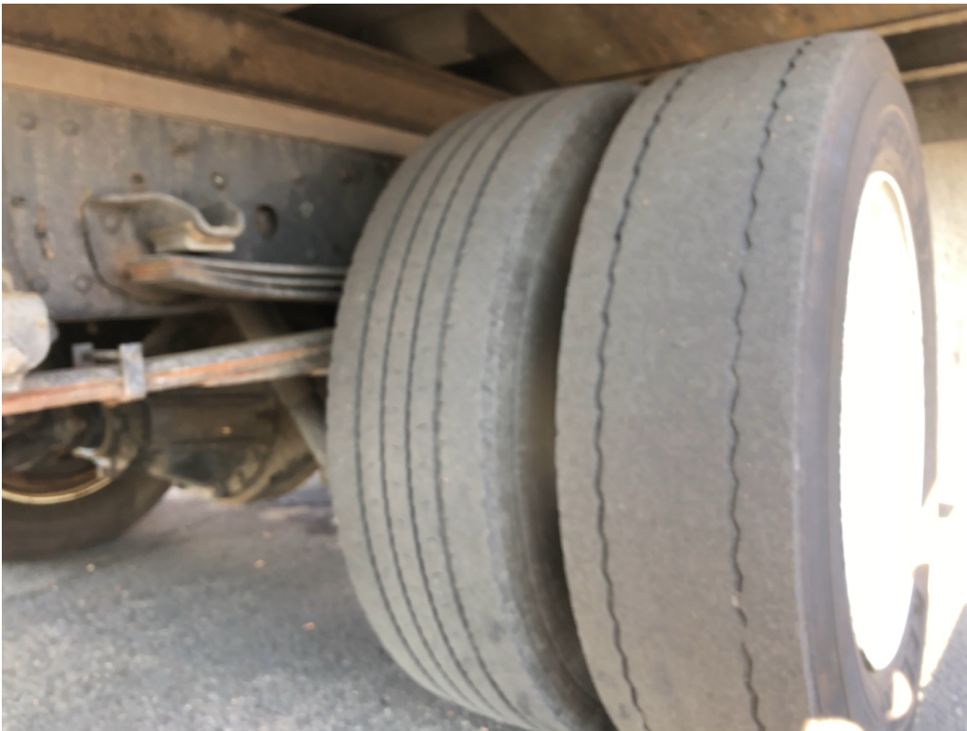
Rear Left Outer Drive Tire Condition / Rear Left Inner Drive Tire Condition / 01-02-2024