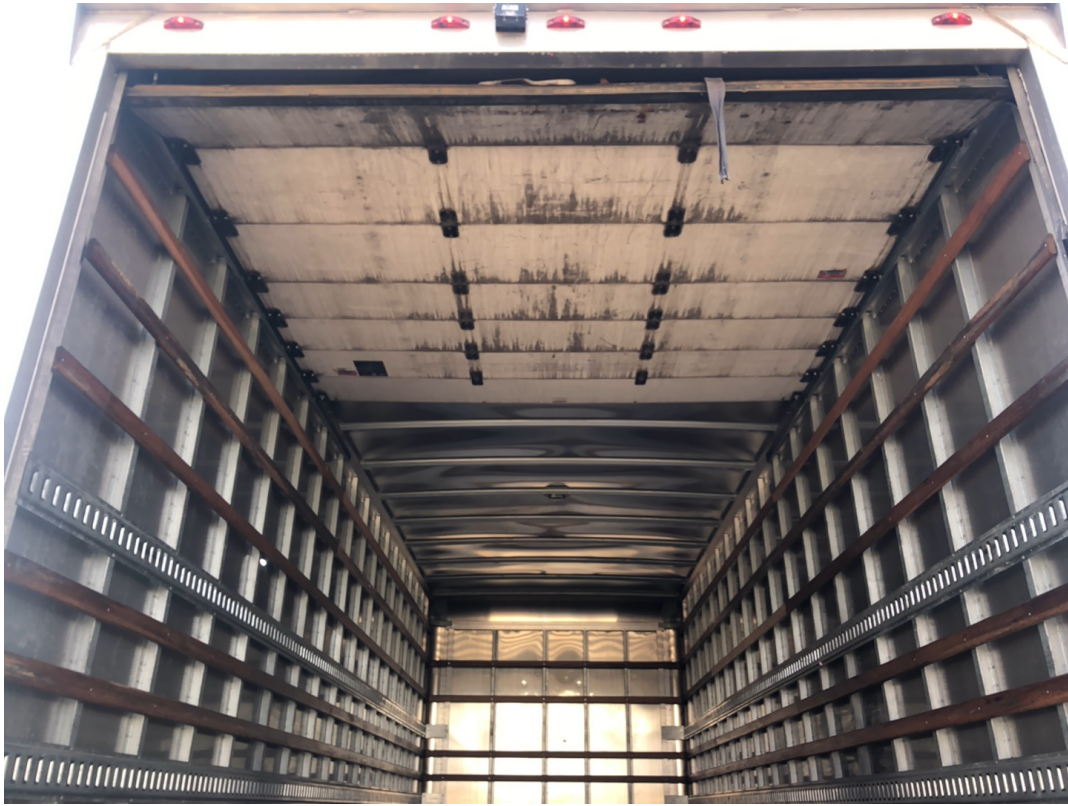
Box Interior / 01-02-2024