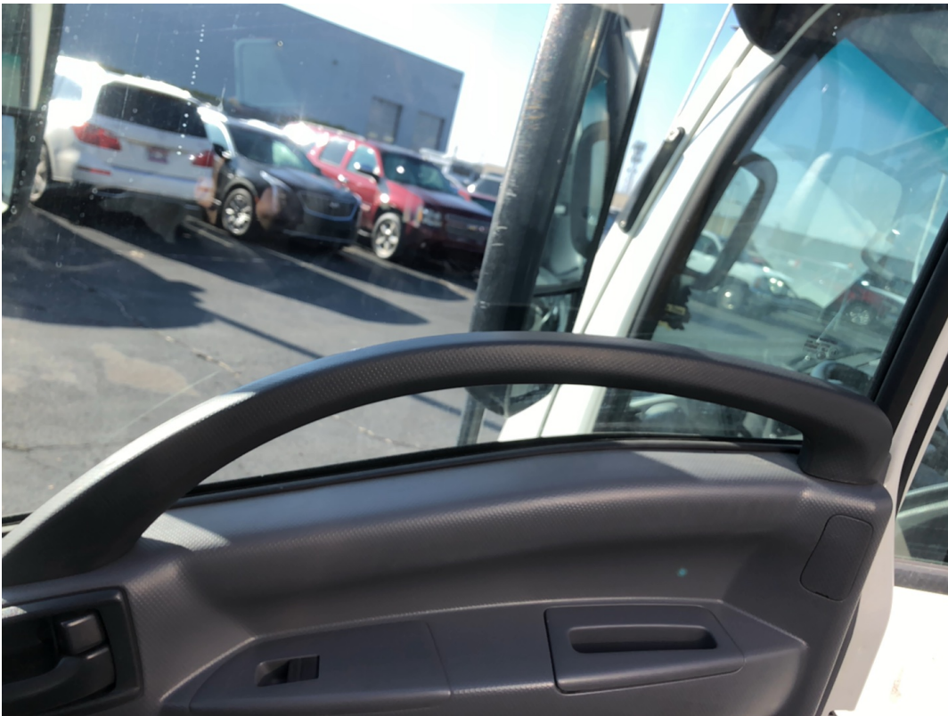
Handrails / 01-02-2024