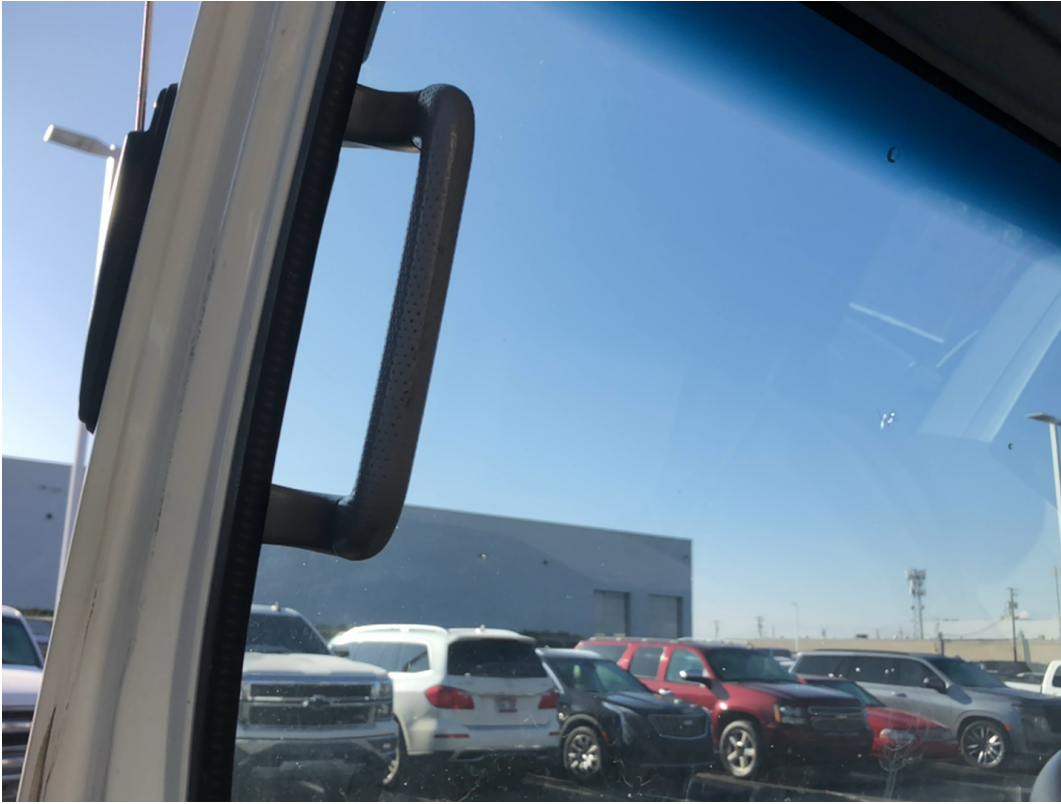
Handrails / 01-03-2024