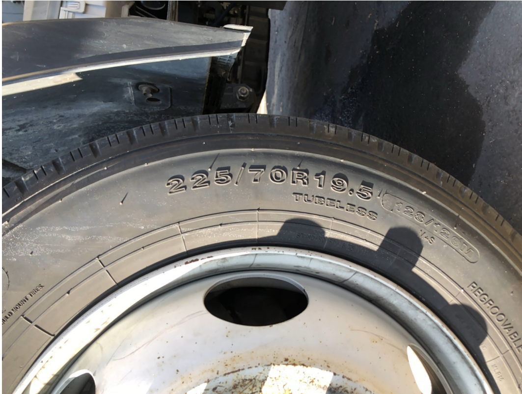
Left Steer Tire Size / 01-02-2024