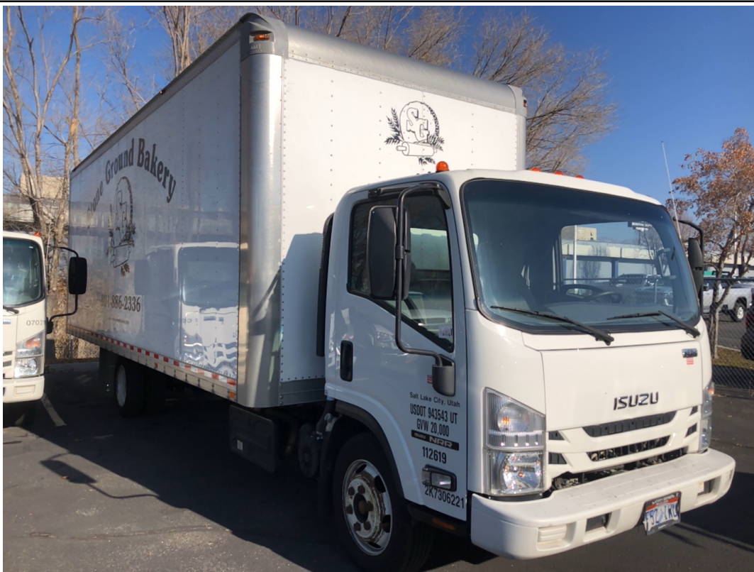
Front Right / 01-02-2024