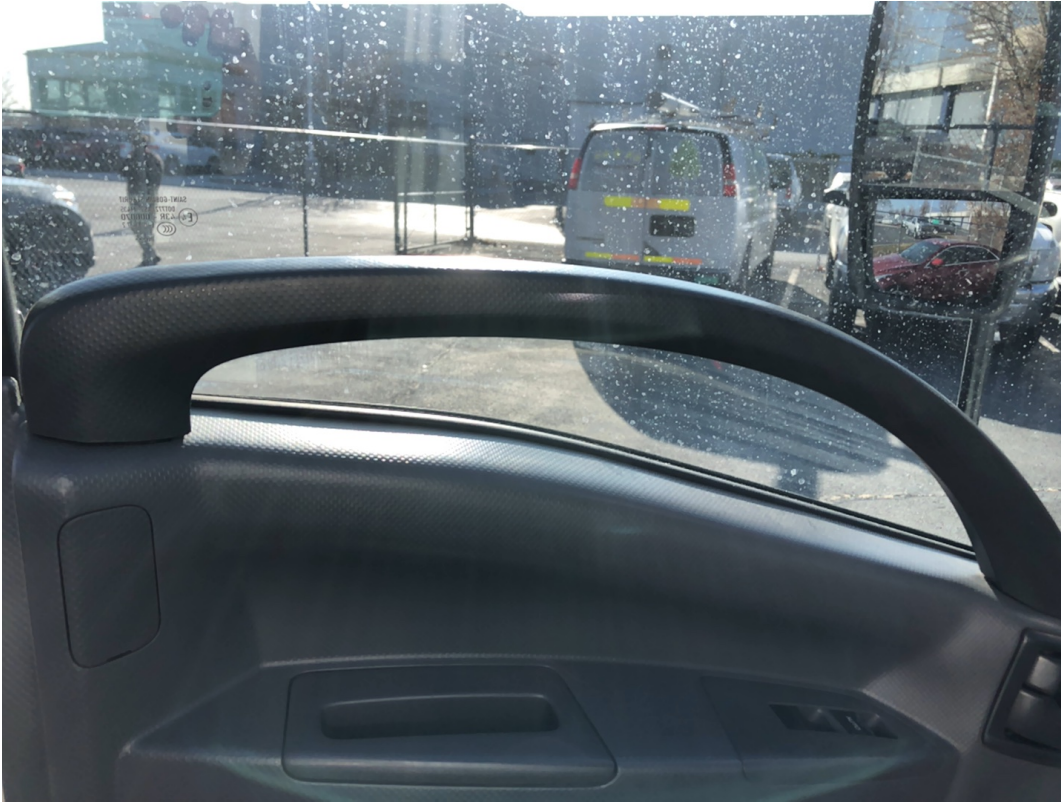
Handrails / 01-02-2024