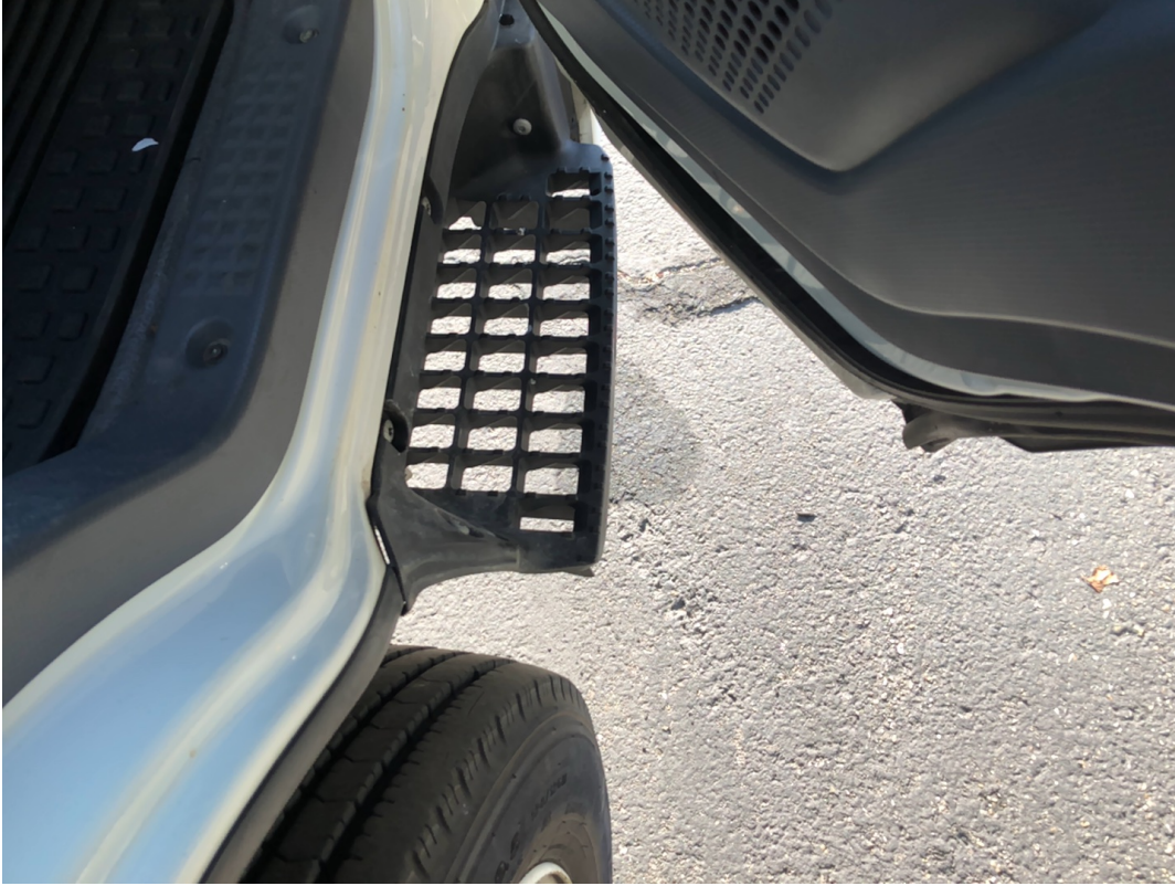
Steps / 01-02-2024