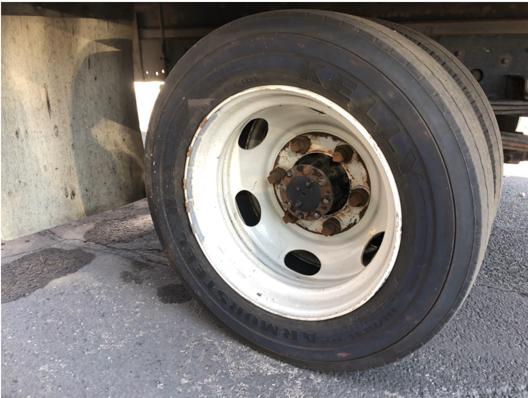
First Right Outer Drive Tire Condition / Rear Right Outer Drive Tire Brand / 01-02-2024