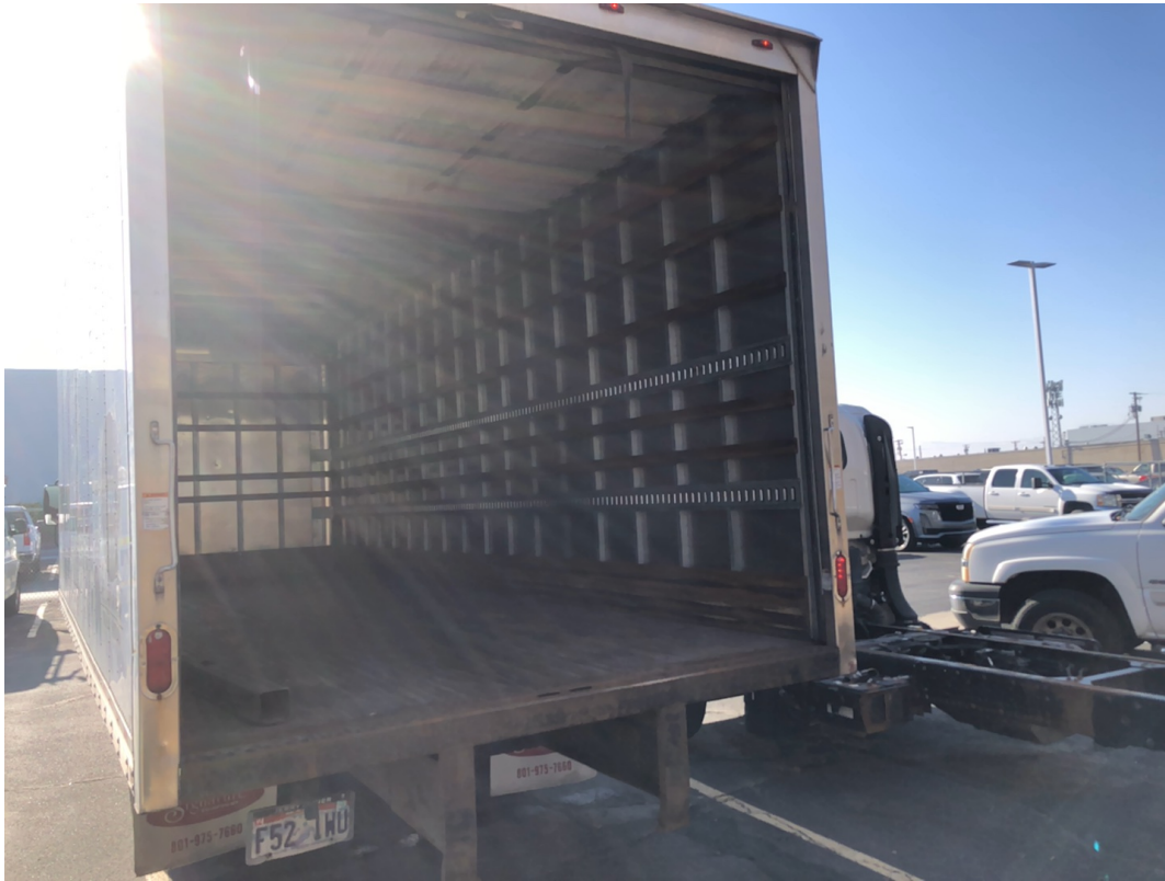
Box Interior / 01-02-2024