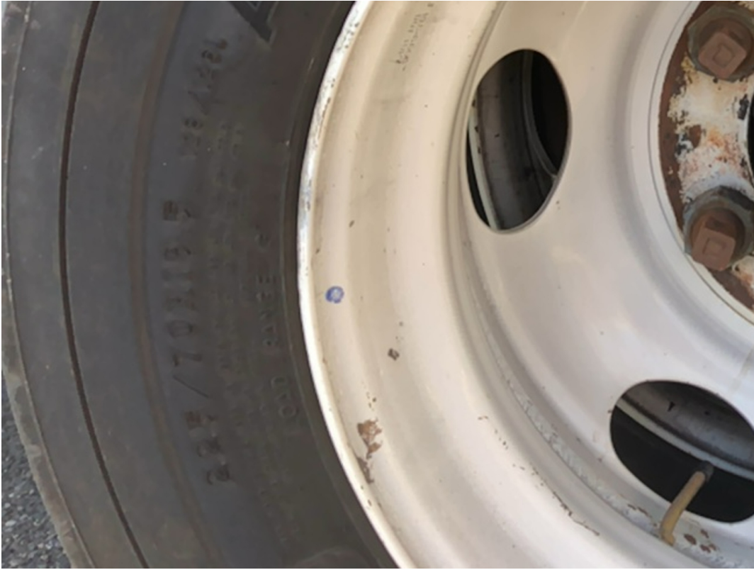
Rear Left Outer Drive Tire Size / 01-03-2024