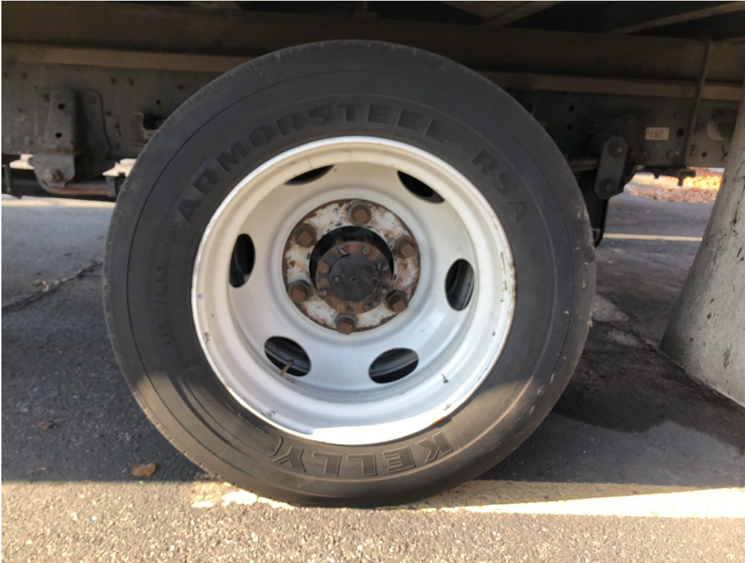
Rear Left Outer Drive Tire Condition / Rear Left Outer Drive Tire Brand / 01-02-2024