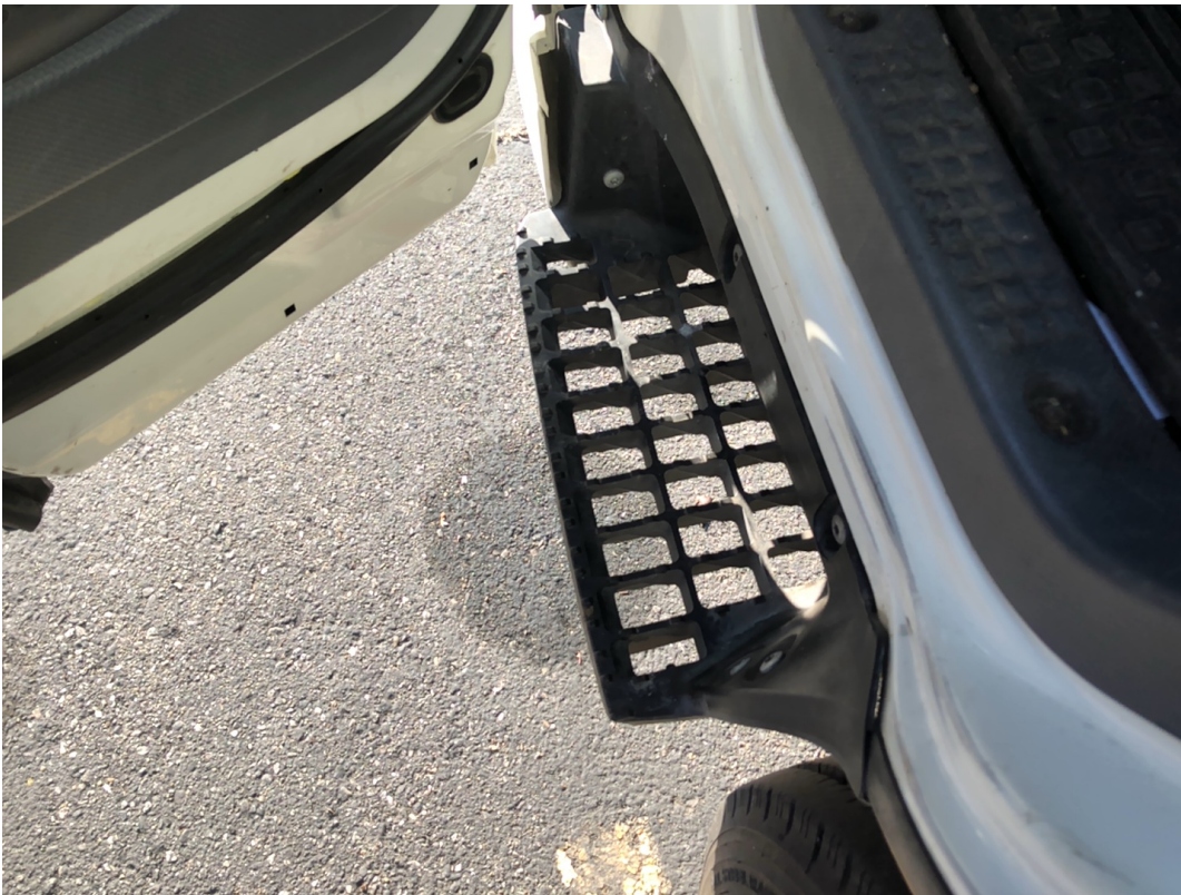
Steps / 01-02-2024