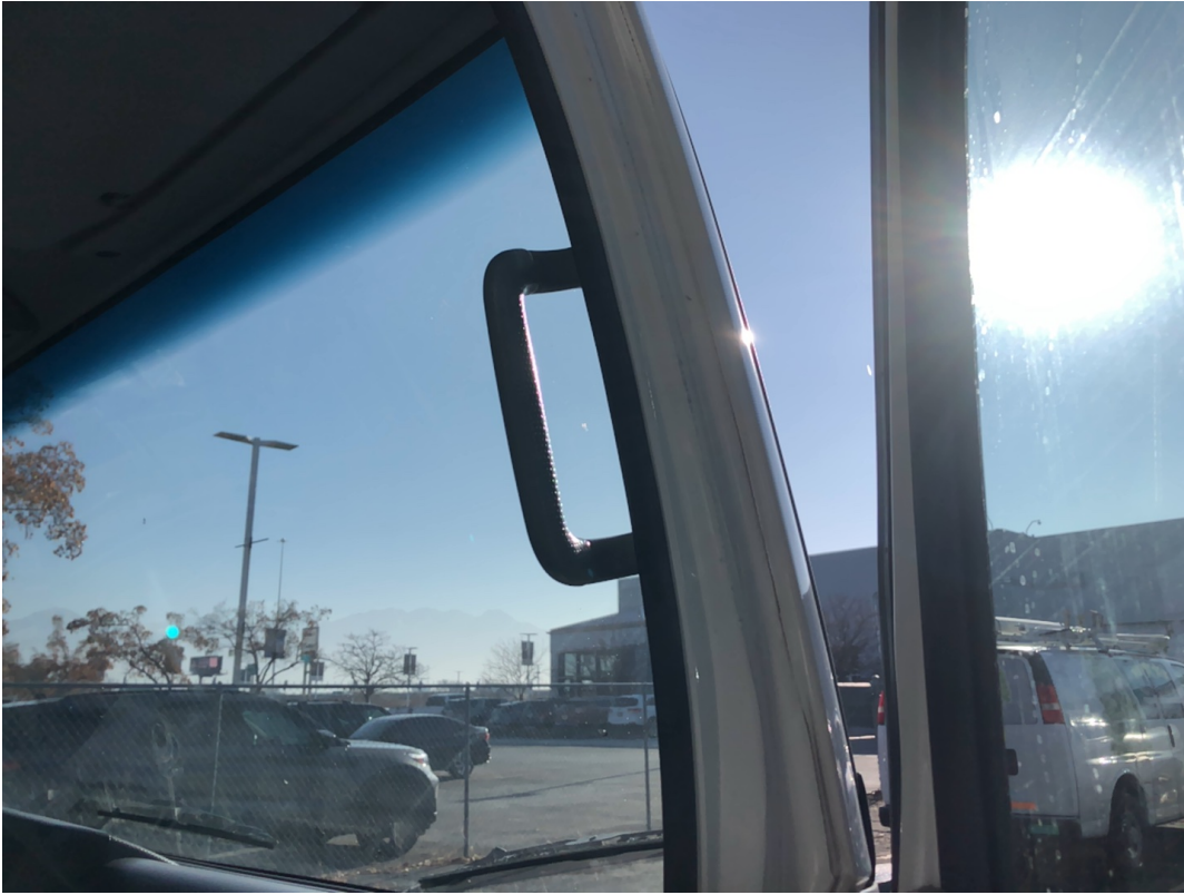
Handrails / 01-02-2024