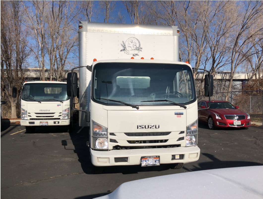
Front / Front Lights / 01-02-2024