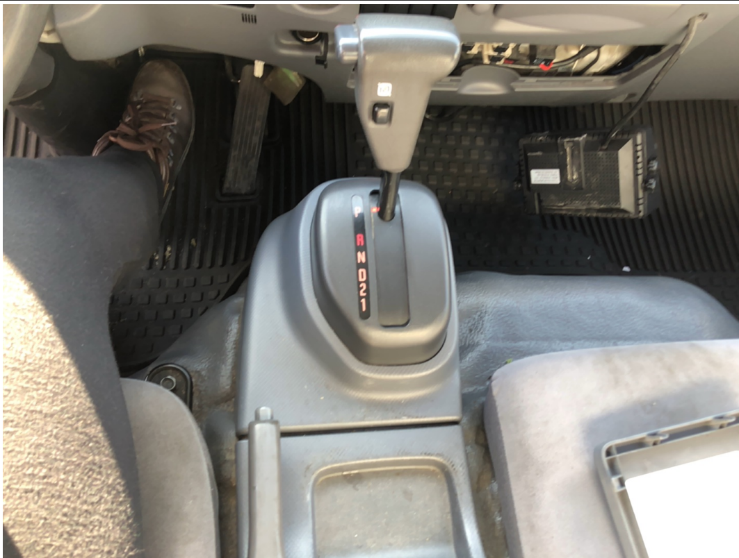
Transmission / 01-02-2024