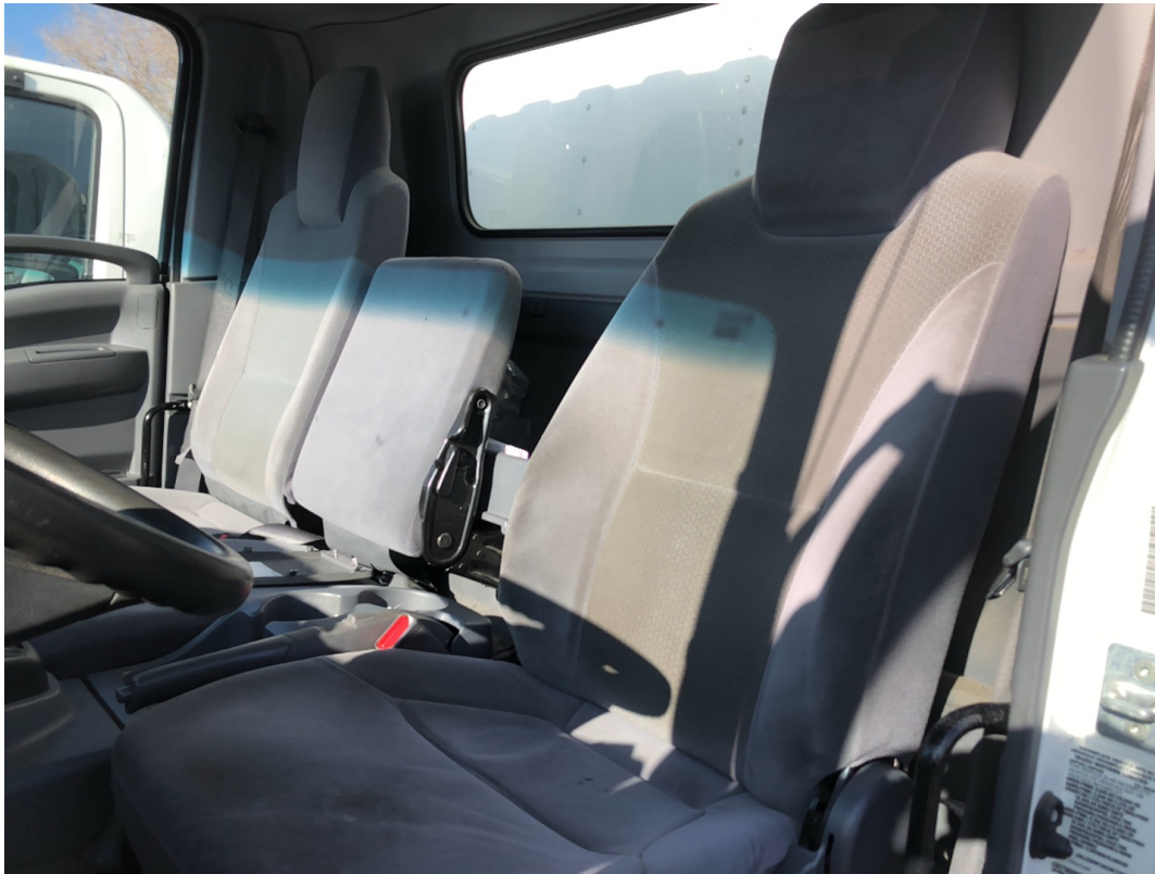
Driver's Seat / 01-02-2024