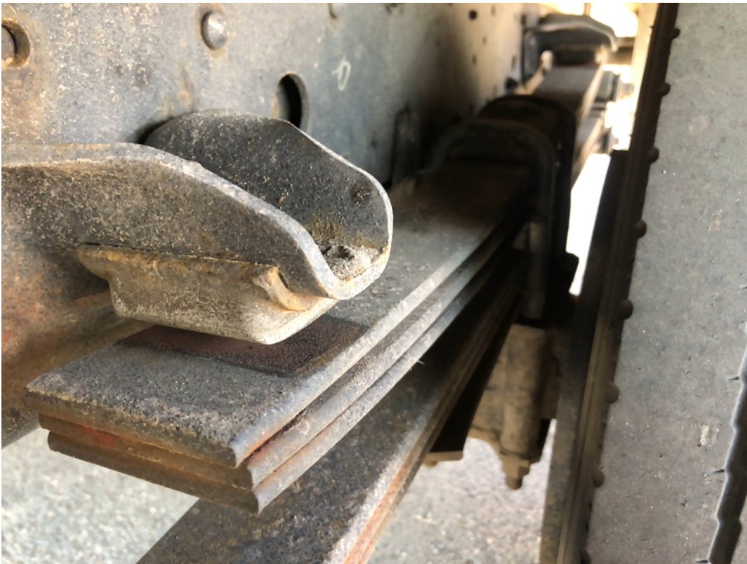
Axles / Suspension / 01-02-2024