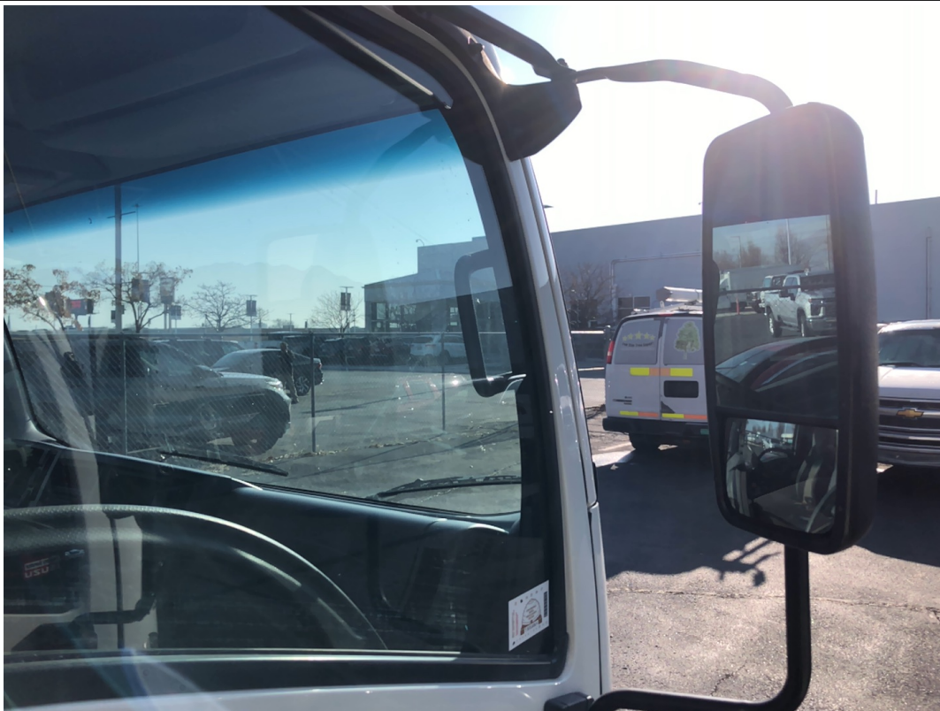
Mirrors / 01-02-2024