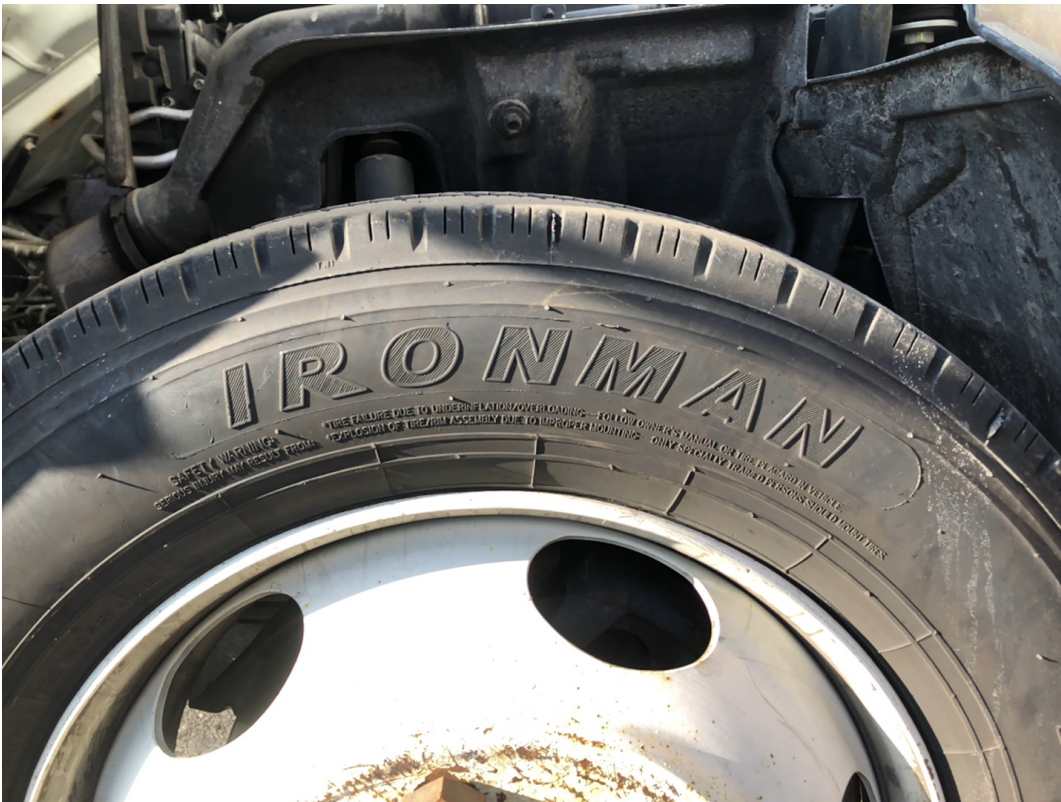
Left Steer Tire Brand / 01-02-2024