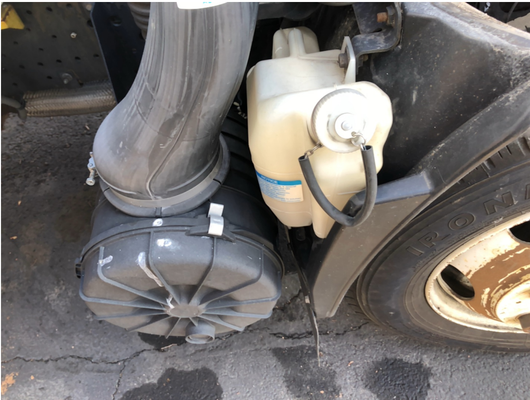
Coolant Level / 01-02-2024