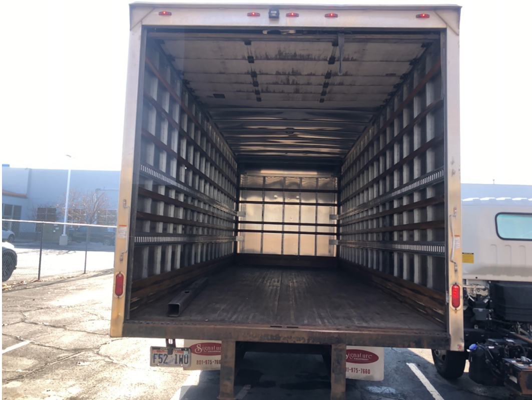
Box Interior / 01-02-2024