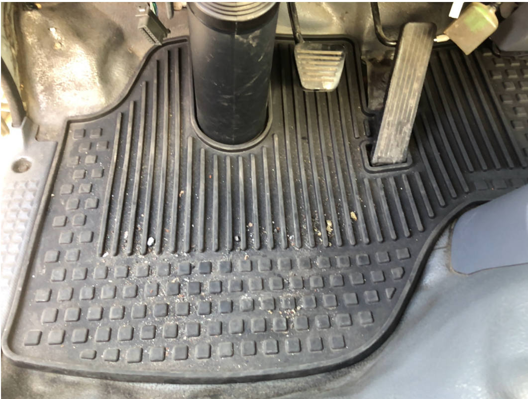
Floorboard / 01-02-2024