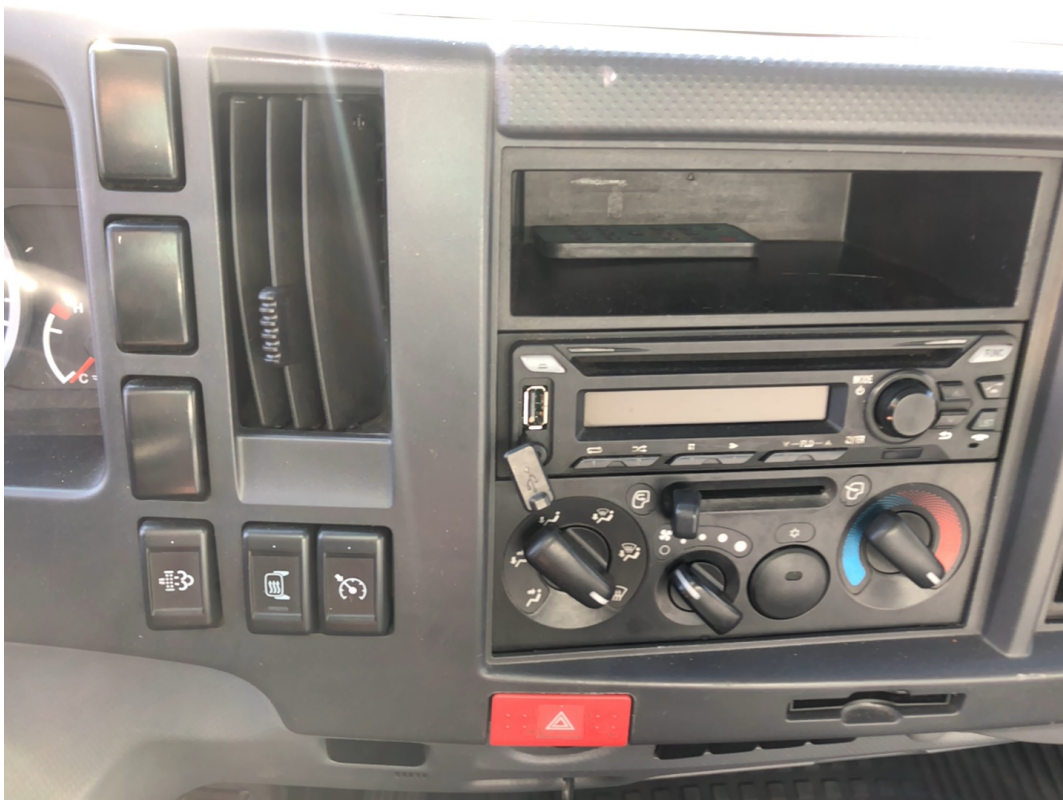
Switches and Controls / 01-02-2024