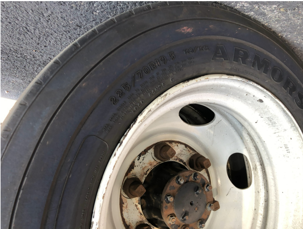
Rear Right Outer Drive Tire Size / 01-03-2024