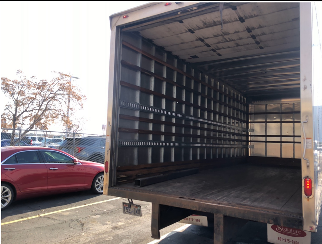
Box Interior / 01-02-2024