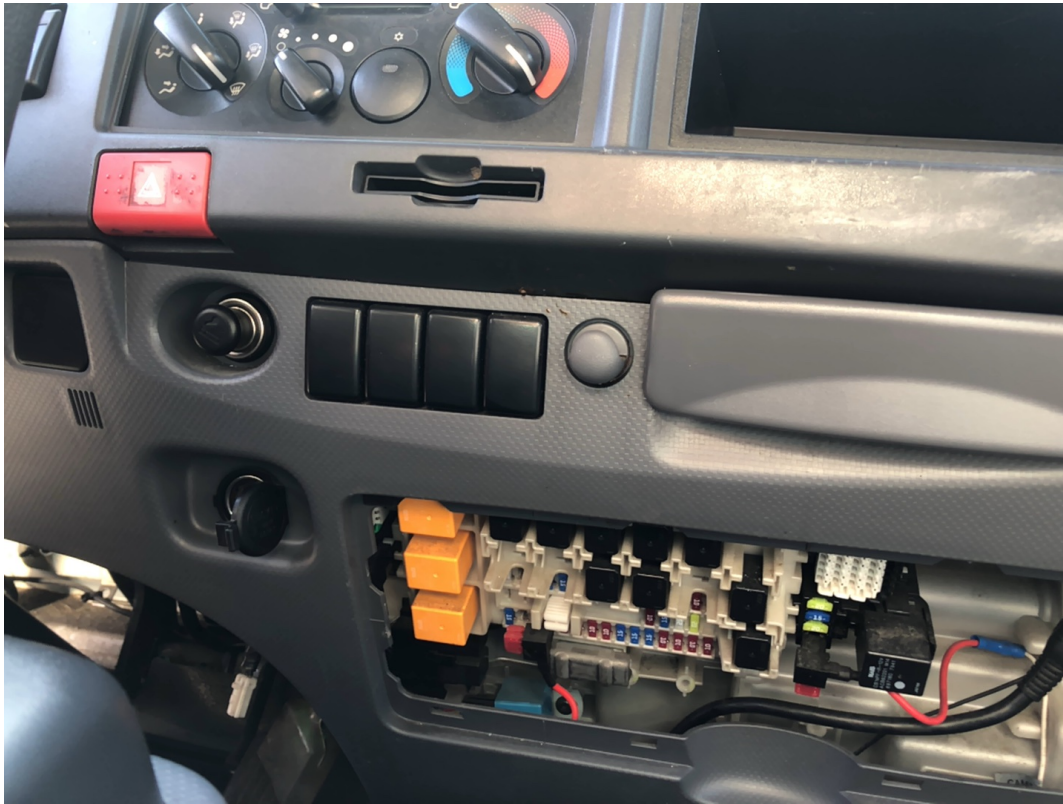
Switches and Controls / 01-02-2024