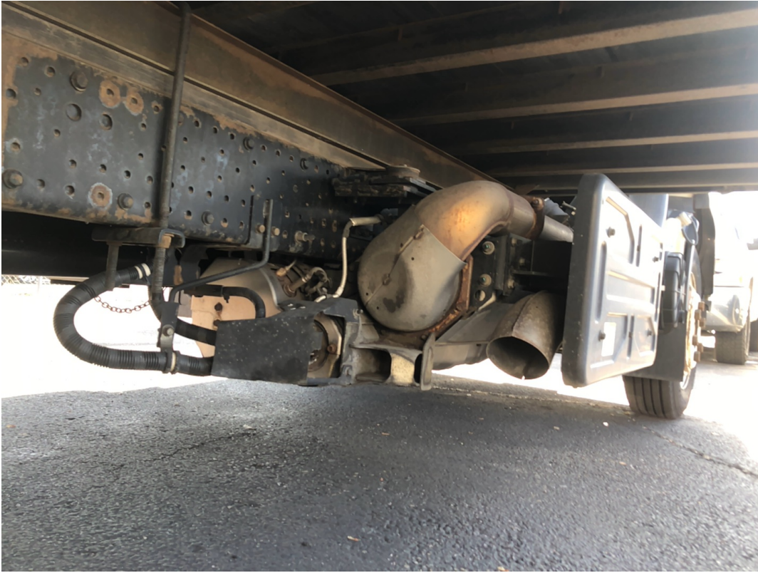
Exhaust Pipe / 01-02-2024