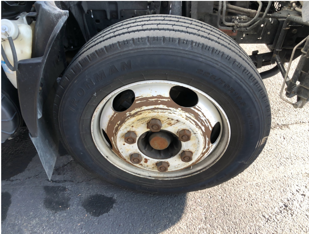
Right Steer Tire Condition / 01-02-2024