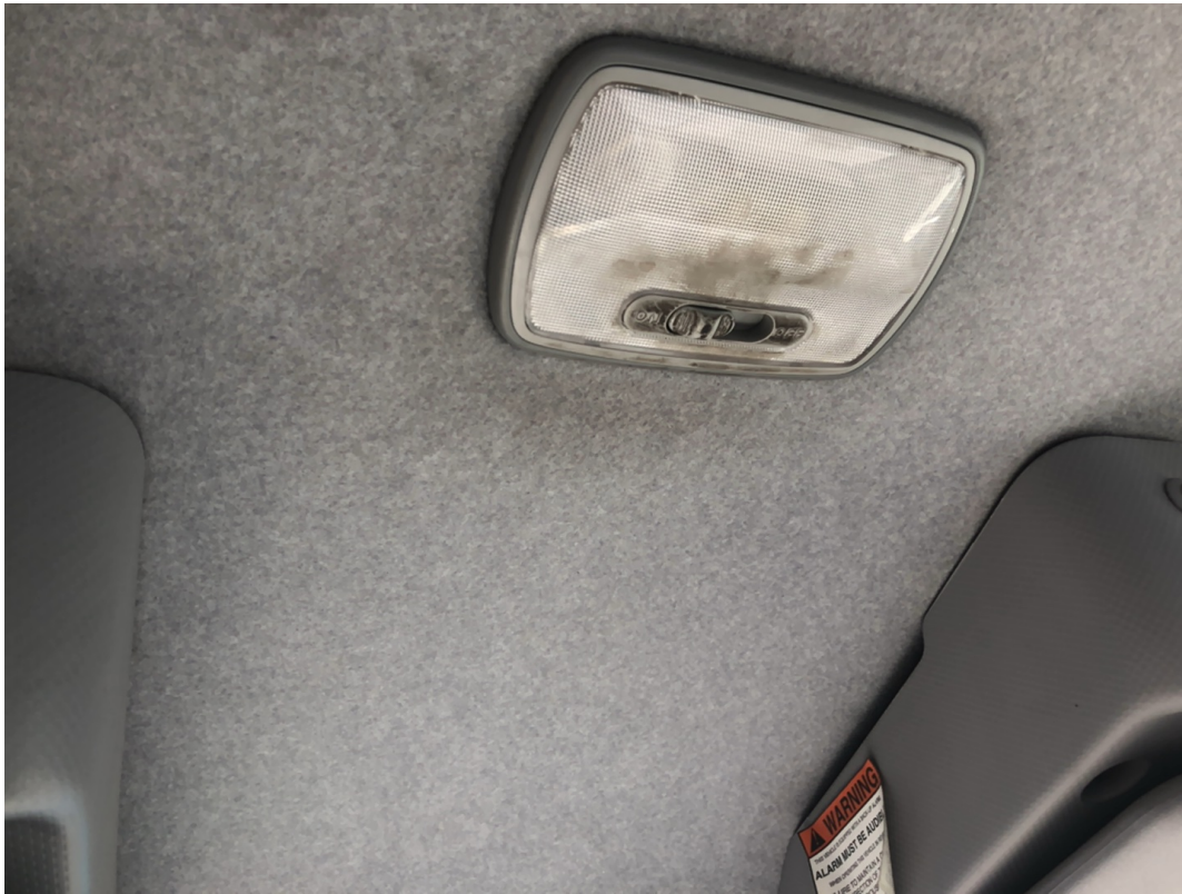
Switches and Controls / 01-02-2024