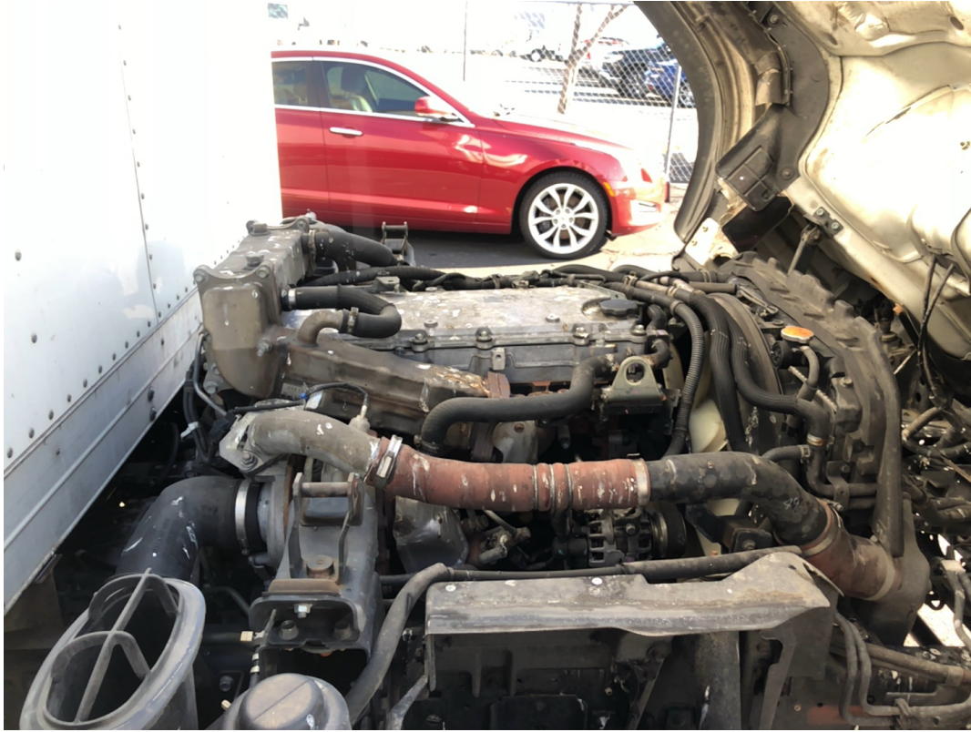
Engine Compartment / 01-02-2024